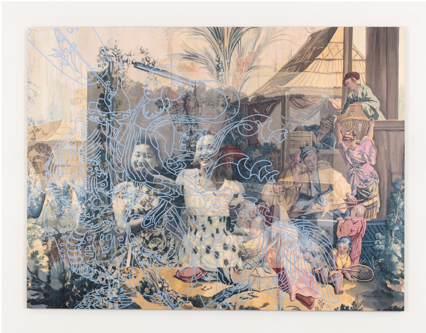
Kyungmi Shin to be appetite of your own appetite , 2024 photo transfer and acrylic on wood panel 60 x 80 x 2 inches (152,4 x 203,2 x 5,1 cm) SW 24130 $ 28,000