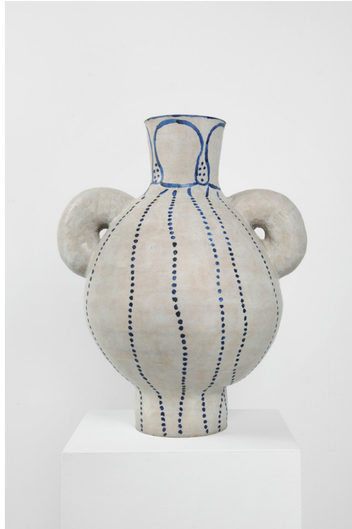
Peter Schlesinger Untitled , 2023 glazed ceramic 26 1/2 x 22 x 16 inches (67,3 x 55,9 x 40,6 cm) SW 24168 $ 35,000