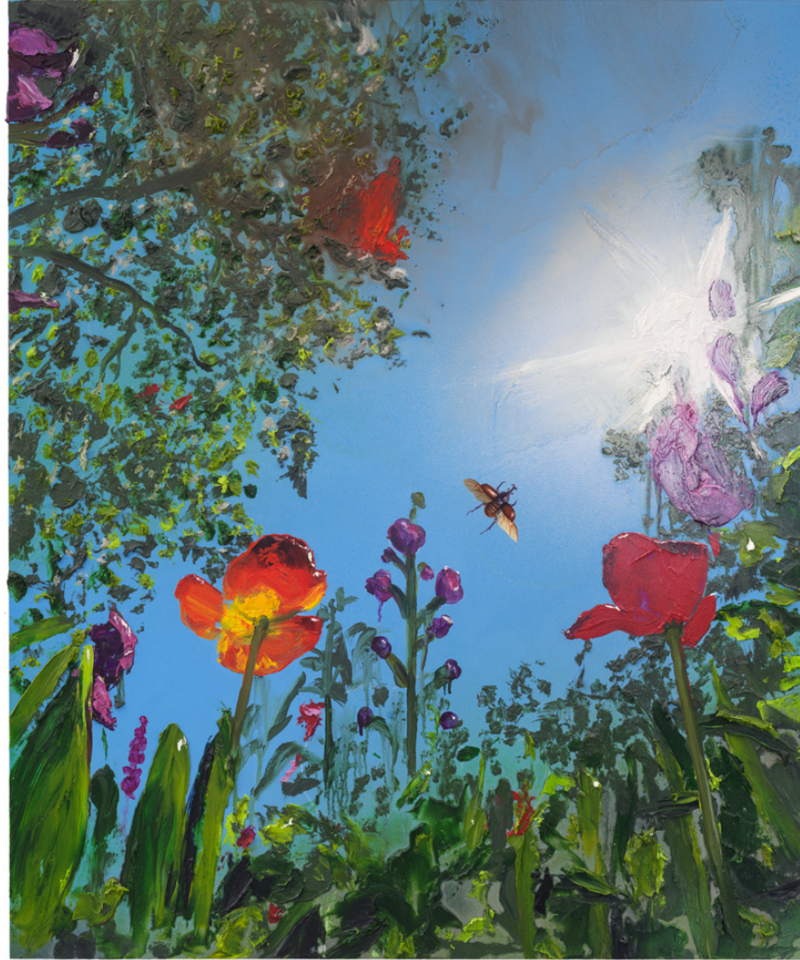
Alexis Rockman Perennials, 2024 oil and cold wax on wood 48 x 40 x 2 inches (121,9 x 101,6 x 5,1 cm) SW 24099 $ 50,000