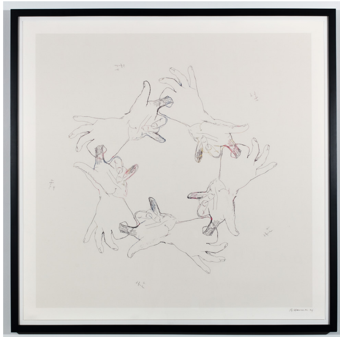
Bruce Nauman Untitled (from Fingers & Holes Series) , 1994 monoprint 35 x 35 1/4 inches (88,9 x 89,5 cm) 37 3/4 x 37 3/4 inches (96 x 96 cm) frame SW 17073 $30,000