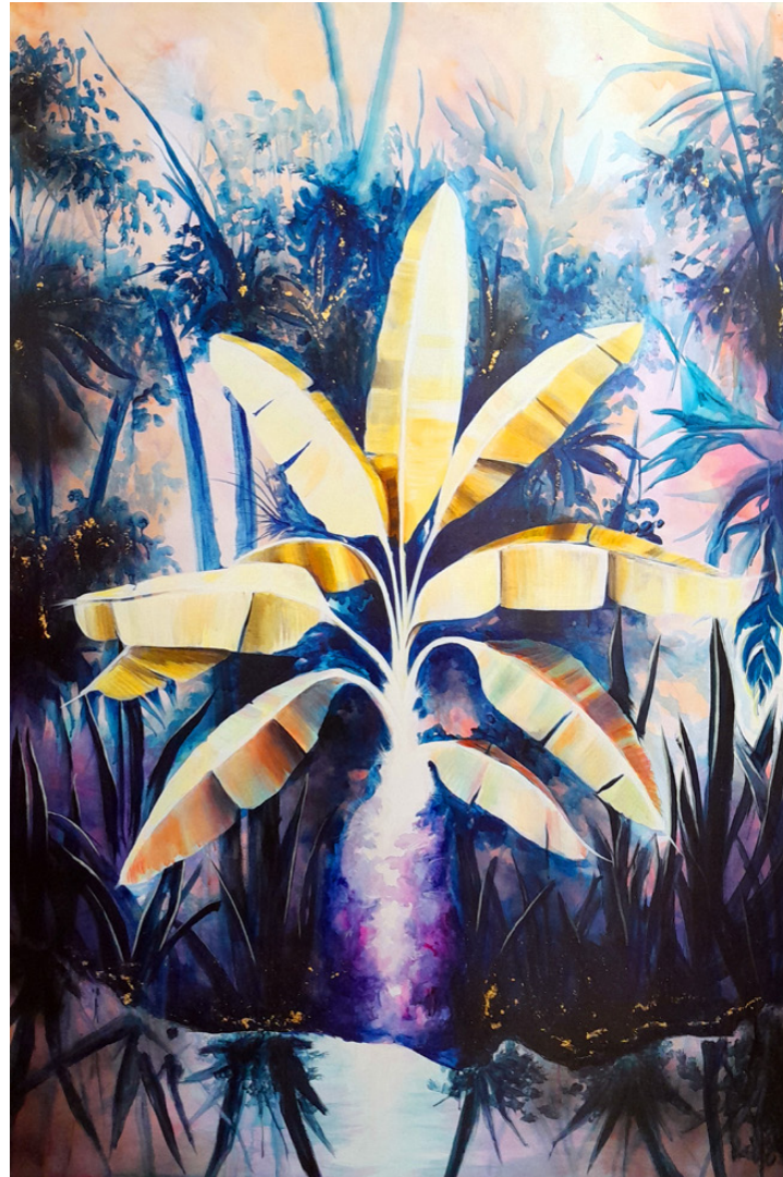
Gamaliel Rodríguez Levitation of the Musa Basjoo , 2024 acrylic, ink and gold leaf on canvas 72 x 50 x 1 3/8 inches (182,9 x 127 x 3,5 cm) SW 24186 $ 25,000