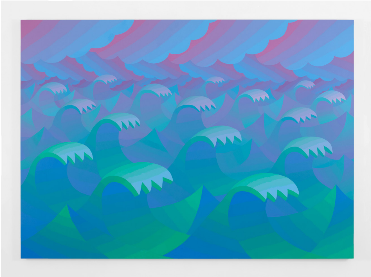
Amy Lincoln Overlapping Waves and Clouds (Green, Blue & Pink) , 2024 acrylic on panel 60 x 84 x 2 inches (152,4 x 213,4 x 5,1 cm) SW 24162 $ 85,000