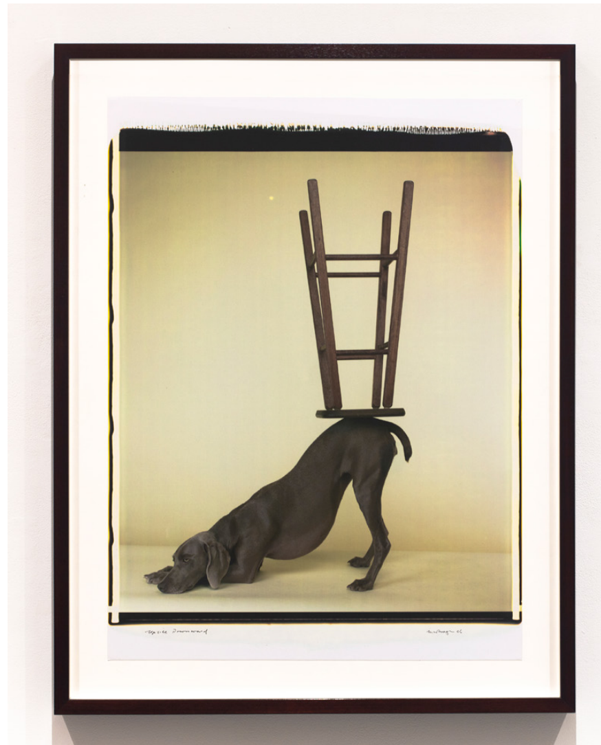
William Wegman Upside Downward , 2006 color Polaroid 30 x 22 inches (76,2 x 55,9 cm) 35 1/2 x 27 1/2 inches (90,2 x 69,9 cm) frame SW 24108 $ 22,000