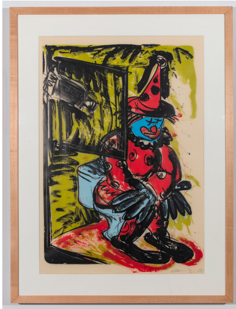
Bruce Nauman Clown Taking a Shit , 1988 lithograph in colors, on Transpagra paper 42 x 30 inches (106,7 x 76,2 cm) 51 1/4 x 39 inches (130 x 99 cm) frame edition of 35 SW 95369.31 $40,000