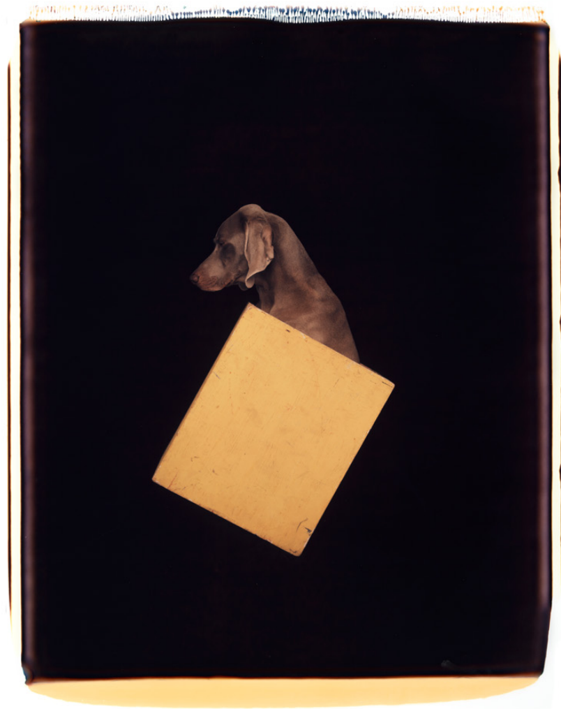
William Wegman Yellow Peril , 1992 color Polaroid 30 x 22 inches (76,2 x 55,9 cm) 35 1/2 x 27 1/2 inches (90,2 x 69,9 cm) frame SW 23032 $ 22,000