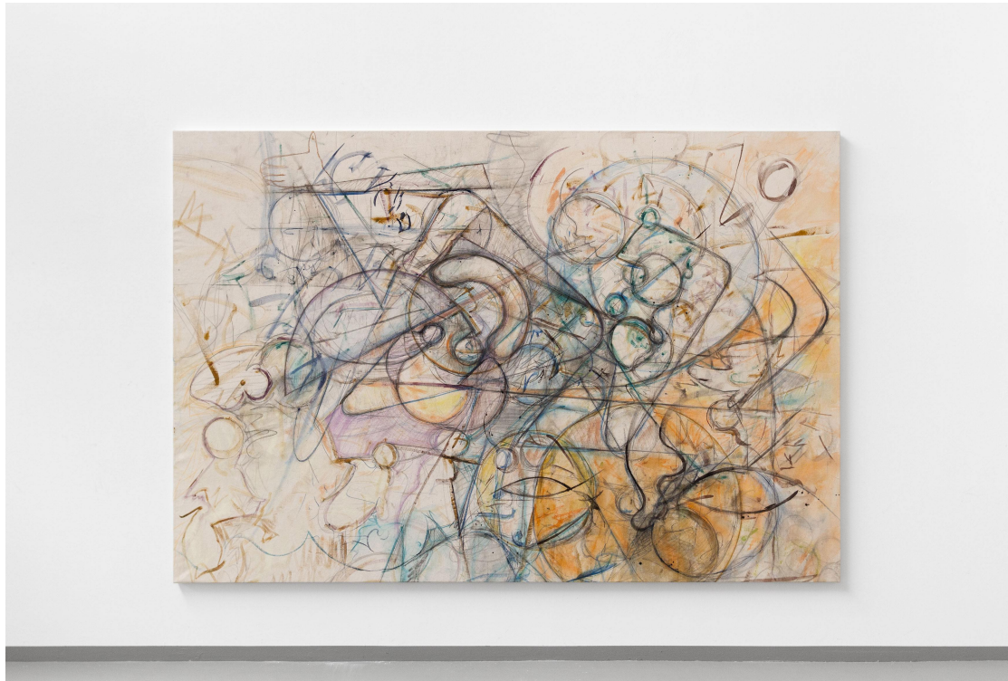
J. Parker Valentine, Untitled , 2024, graphite, ink, water soluble colored pencil and marker on canvas, 196 x 290 cm