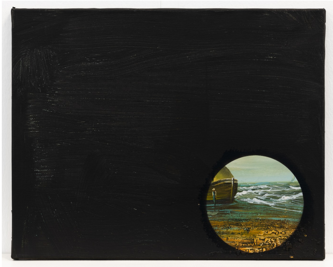
Jef Geys, Black Painting , 2011, black paint on oil on canvas, 30 x 45 cm