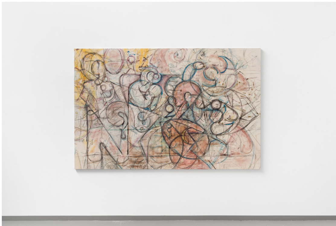
J. Parker Valentine, Untitled , 2024, graphite, ink, water soluble coloured pencil and marker on canvas, 163 x 251 cm