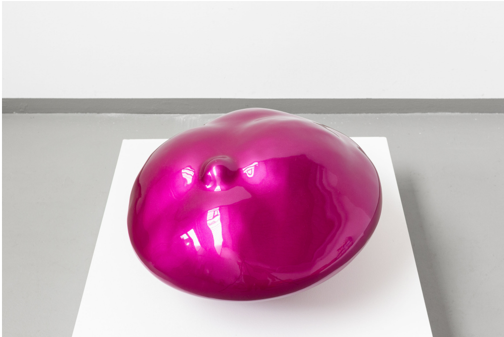
Jef Geys, Patisson , 1980, carping on fiberglass, fiberboard 30 x 80 cm