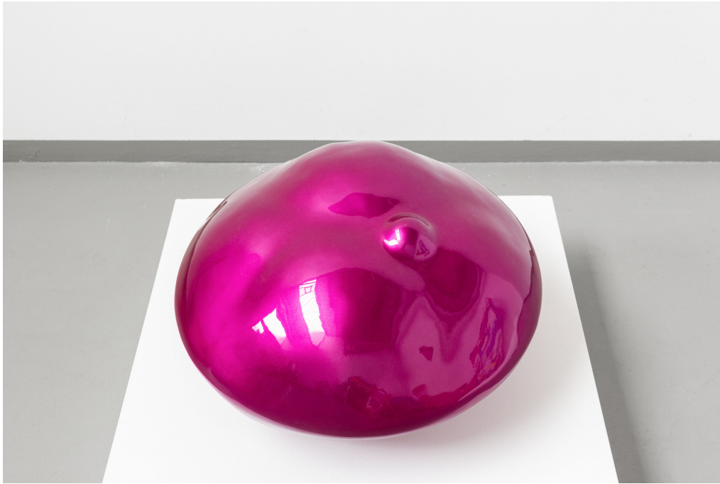
Jef Geys, Patisson , 1980, carping on fiberglass, fiberboard 30 x 80 cm