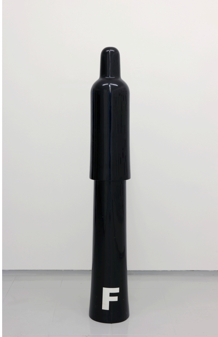
Jef Geys, Schildwachten (Darth Vader) , 1990 - 1994, polymer and lacquer, 185 x 40 cm