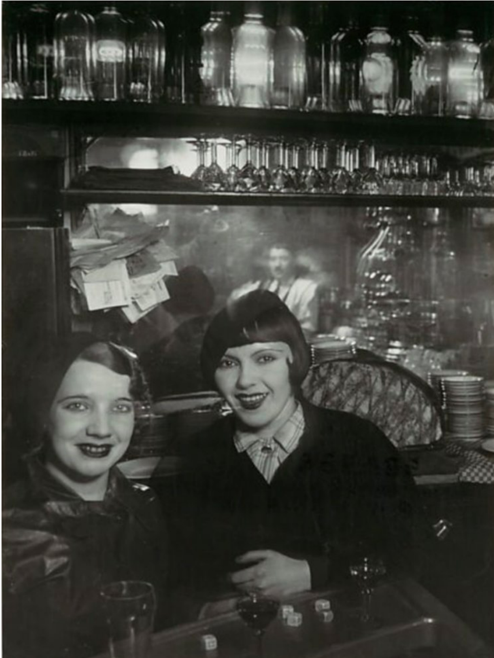
Early oversized ferrotyped gelatin silver print 19 x 15 3/4 inches (48.3 x 40 cm) Printed 1940s Brassaï Estate stamp on verso