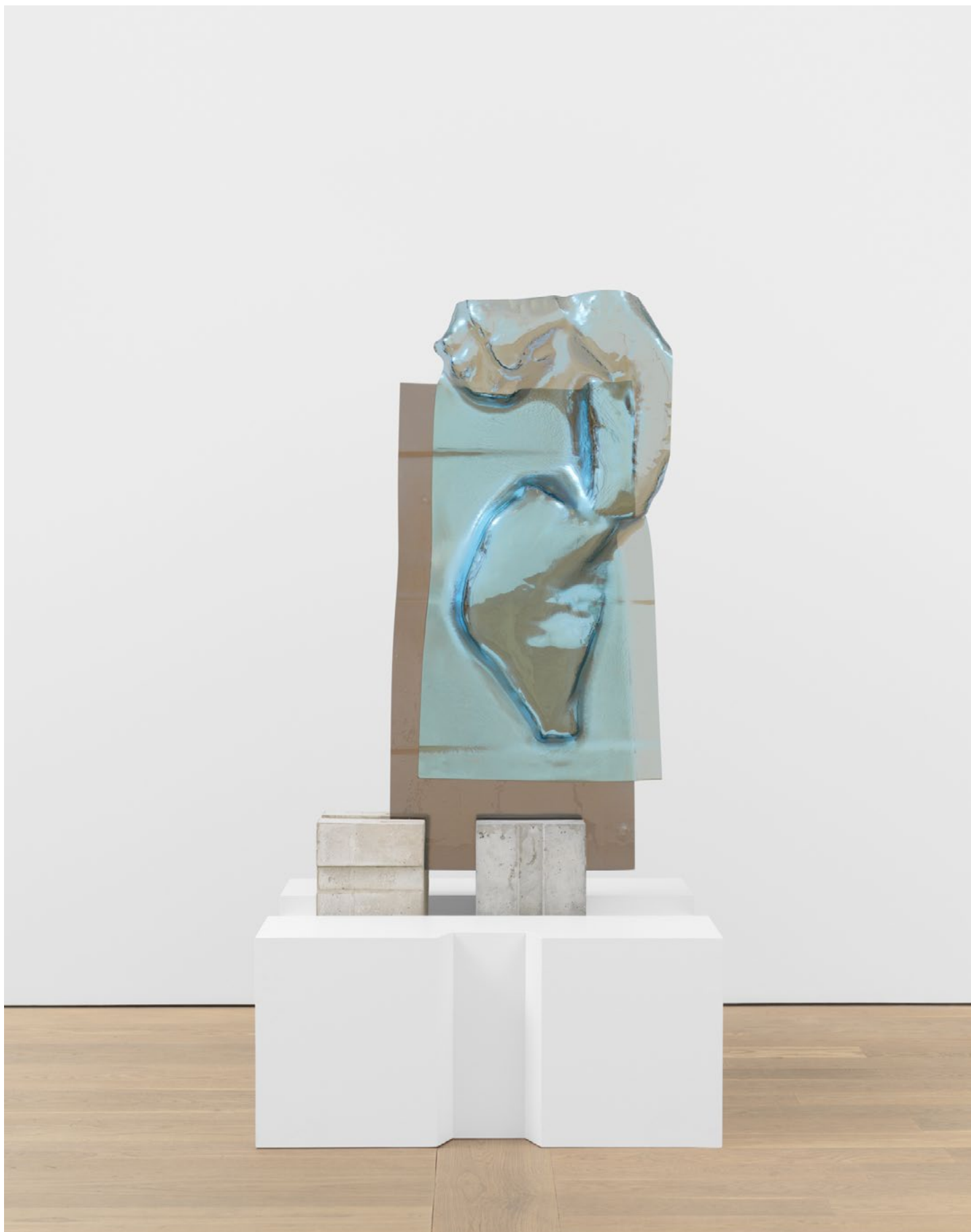
Charisse Pearlina Weston | the hallucinatory field, opaque and stumbling, stretches and stretches and stretches | 2024

Fused mirropane panels etched with text, cast concrete and mortar bricks | 58 1/2 x 33 x 10 inches (overall) | #CPW24.017 | $28,000 | RESERVED