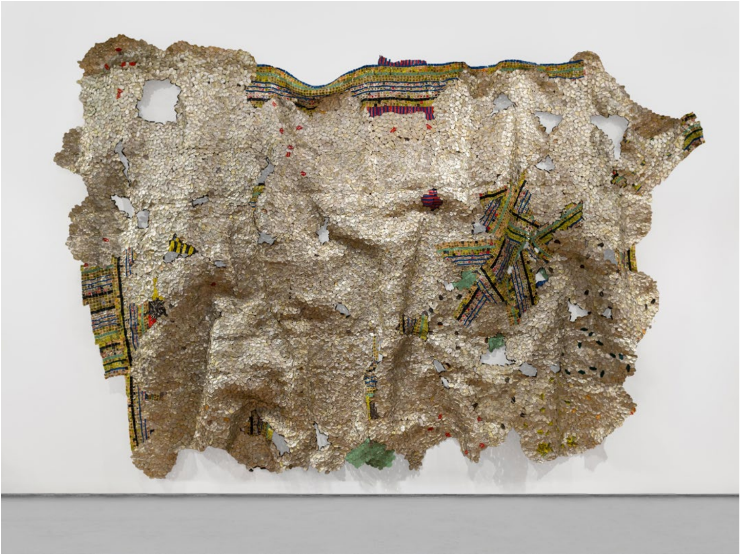
El Anatsui | Timespace | 2014 | Aluminum and copper wire 127.95 x 194.88 inches (Approximately 10.5 x 16.25 feet) | #EA14.035 | $1,800,000 | RESERVED