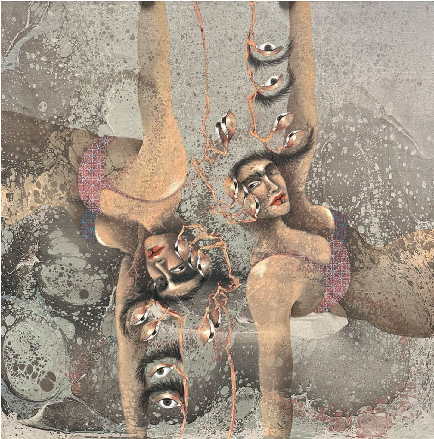
Hayv Kahraman | Mirrored Eyebrow Plants | 2024 | Oil and acrylic on linen | 50 x 50 inches | #HK24.022 | $60,000