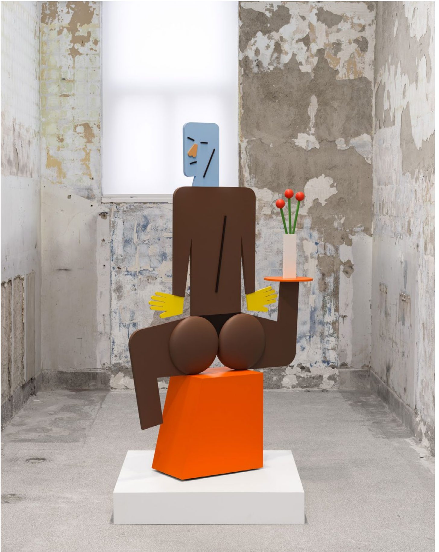
Nina Chanel Abney | The Qing | 2024 | Painted aluminum | 69 3/4 x 44 x 11 3/4 inches | Edition of 3, with 1AP | #NCA24.004 | $200,000