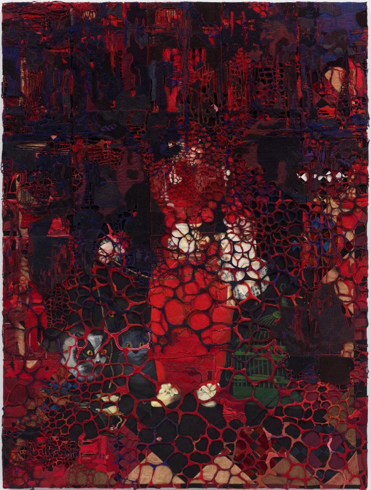
Jesse Krimes | Untitled | 2024 | Old clothing and textiles from currently and formerly incarcerated people, acrylic paint, embroidery, nails, and assorted textiles | 48 1/4 x 36 1/4 x 1 3/4 inches | #JKS24.008 | $28,000 | SOLD