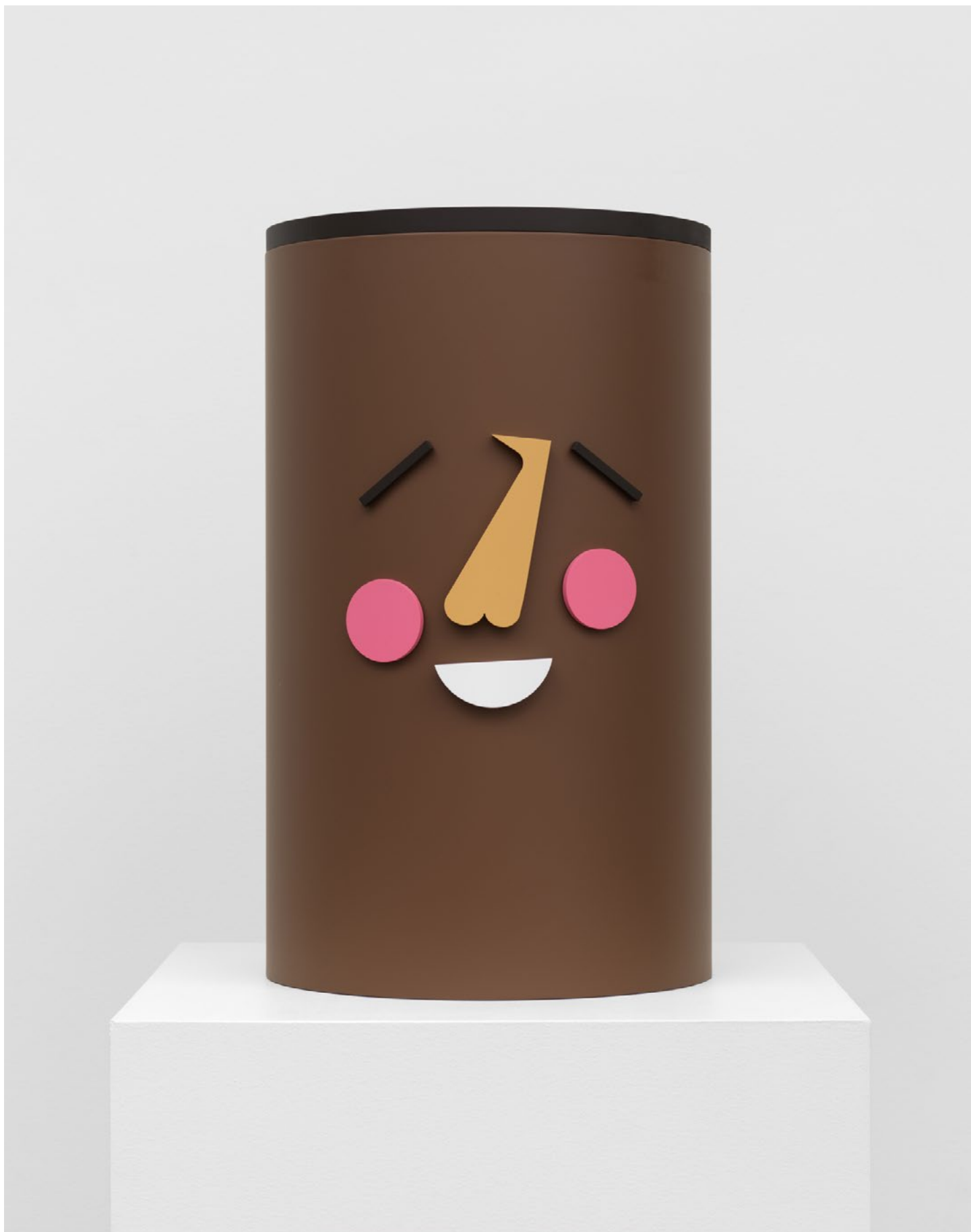
Nina Chanel Abney | Soup Kitchen 6 | 2024 | Painted stainless steel and aluminum 19 3/4 x 11 3/4 x 12 inches | Edition of 2, with 1AP | #NCA24.012 | $20,000