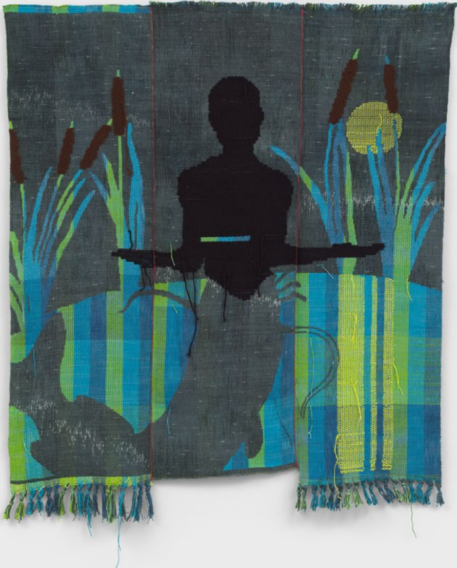
Diedrick Brackens | dream disk | 2024 | Cotton and acrylic yarn | 55 x 49 1/2 inches | #DIB24.007 | $65,000 | RESERVED