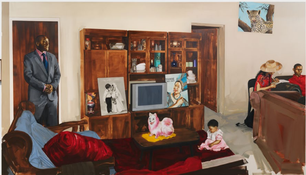
Meleko Mokgosi | Spaces of Subjection: Imaging Imaginations V | 2023 | Oil on canvas Panel 1: 12 1/4 x 15 1/4 x 2 inches | Panel 2: 96 x 168 x 2 inches | #MEM23.001 | $125,000