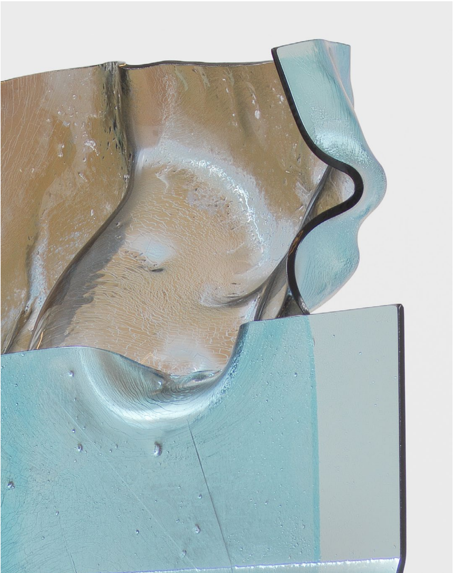
Detail view | Charisse Pearlina Weston | the hallucinatory field, opaque and stumbling, stretches and stretches and stretches | 2024 Fused mirropane panels etched with text, cast concrete and mortar bricks | 58 1/2 x 33 x 10 inches (overall) | #CPW24.017