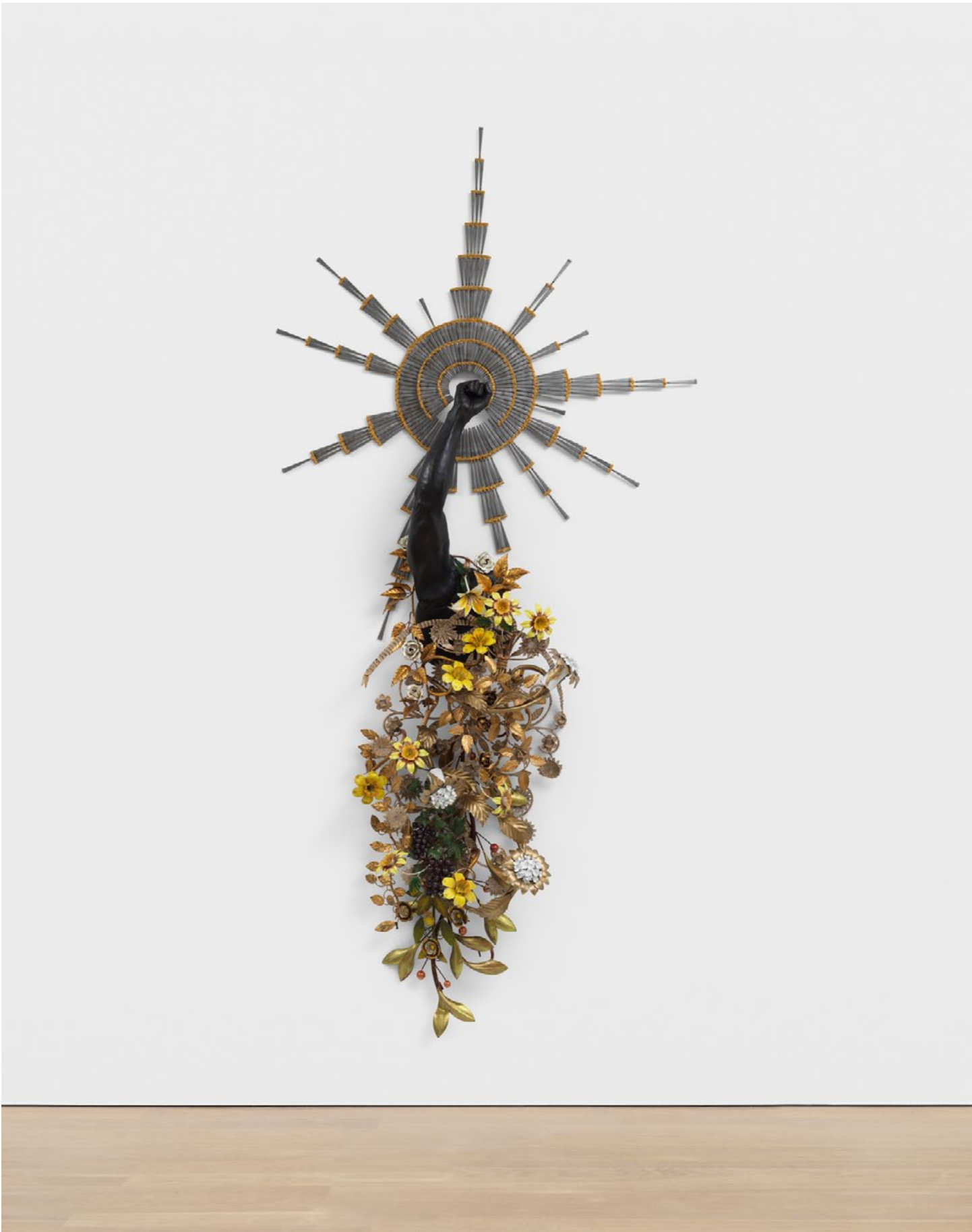
Nick Cave | Arm Peace | 2024 | Cast bronze, vintage sunburst and tole flowers | 105 x 53 x 16 inches | #NC24.029 | $210,000