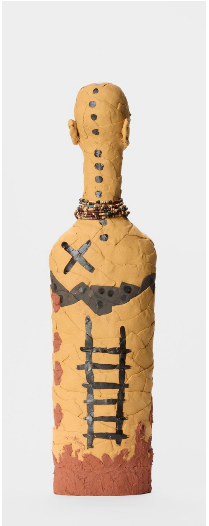
Rose B. Simpson | Listen A | 2024 | Ceramic, glaze, steel, grout, beads (pyrite, petrified wood, lava, clay) 33 x 8 1/2 x 6 inches | #RBS24.008 | $85,000