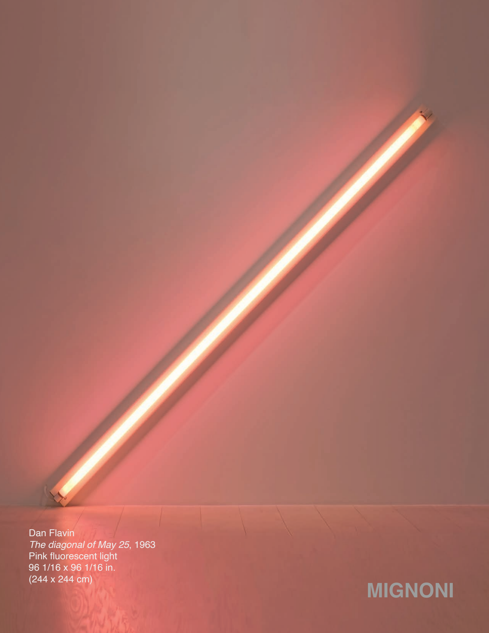
Dan Flavin The diagonal of May 25, 1963 Pink fluorescent light 96 1/16 x 96 1/16 in. (244 x 244 cm)