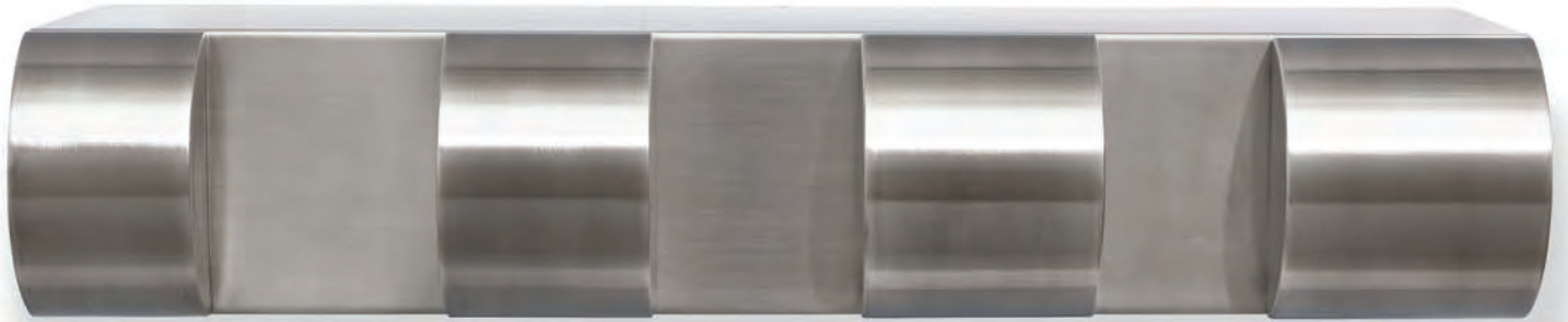
Donald Judd Untitled (Bernstein 80-64) , 1980 Stainless steel 5 x 25 1/2 x 8 1/2 in. (12.7 x 64.8 x 21.6 cm)