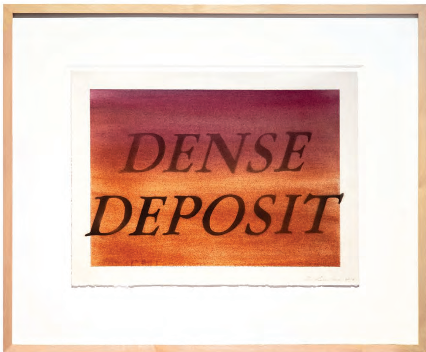
Ed Ruscha Dense Deposit , 2014 Dry pigment and acrylic on paper 11 1/8 x 15 in. (28.3 x 38.1 cm)