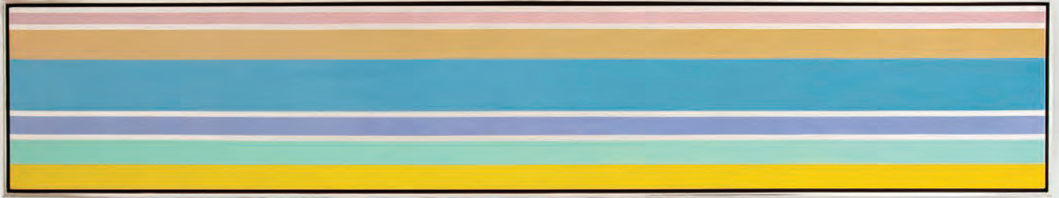
Kenneth Noland Level Out , 1967 Acrylic on canvas 15 1/2 x 93 in. (39.4 x 236.2 cm)