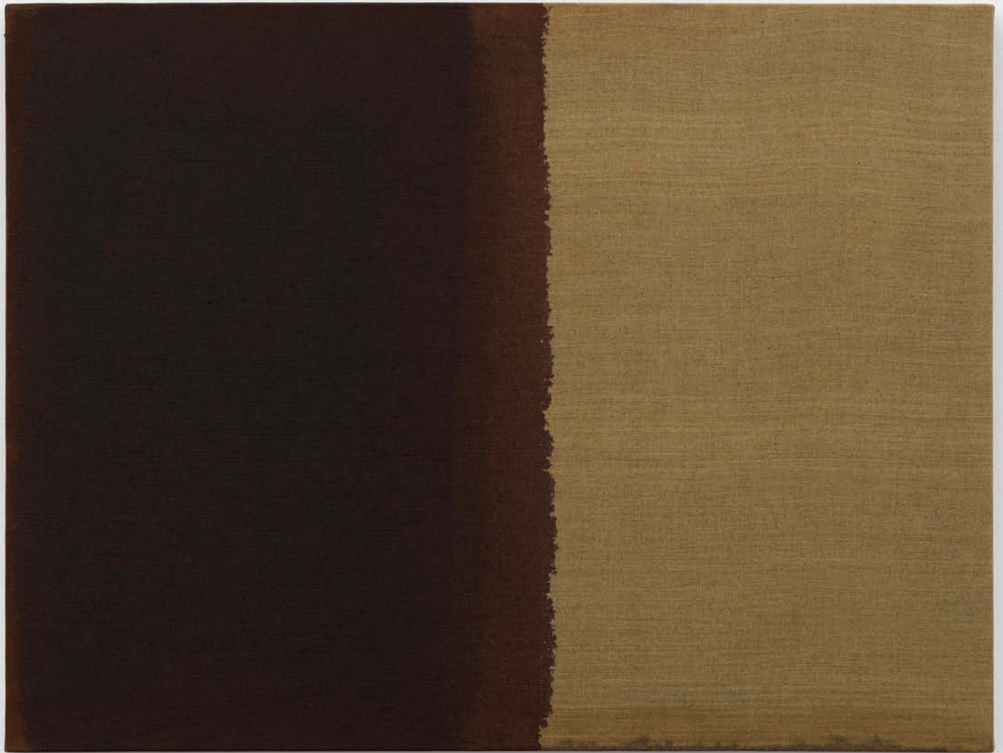
Yun Hyong-Keun Burnt Umber & Ultramarine , 1989 Oil on linen 17 7/8 x 23 7/8 in. (45.4 x 60.6 cm)