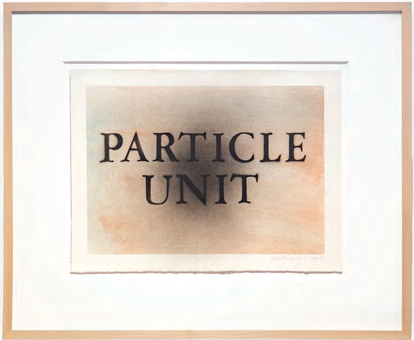
Ed Ruscha Particle Unit , 2017 Dry pigment and acrylic on paper 11 1/4 x 15 in. (28.6 x 38.1 cm)