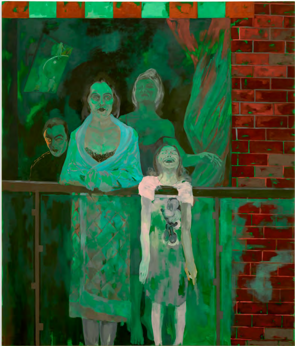
Georgia Gardner Gray Que viene el Coco (Here Comes the Bogeyman) , 2024 oil on canvas 200 x 170 cm / 78 \frac{3}{4} x 66 \frac{7}{8} in HQ27-GG20538P