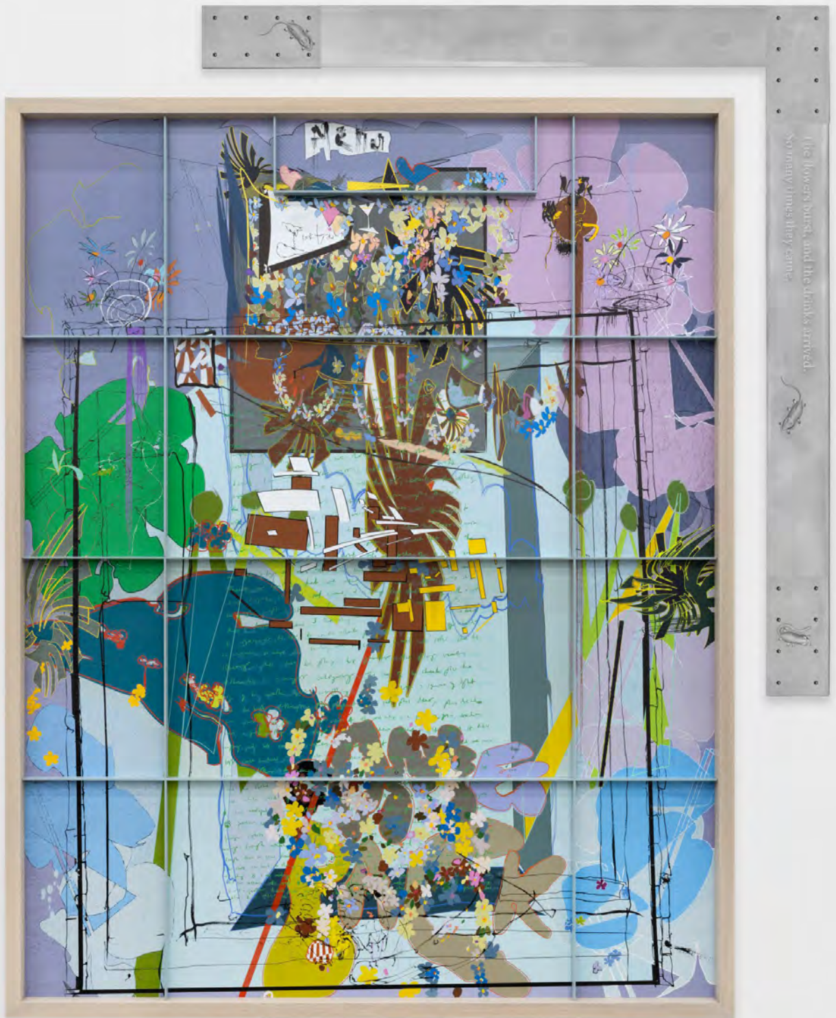
Helen Marten House of Gusts (menu fatigue) , 2023 nylon paint on fabric, stained ash, powder coated aluminium screenprint: 290 x 230 x 8.5 cm / 114 1/8 x 90 1/2 x 3 3/8 in HQ25-HM18489P