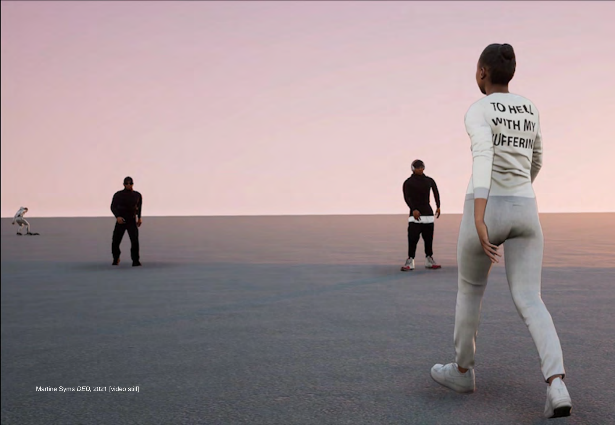
Martine Syms DED , 2021 [video still]