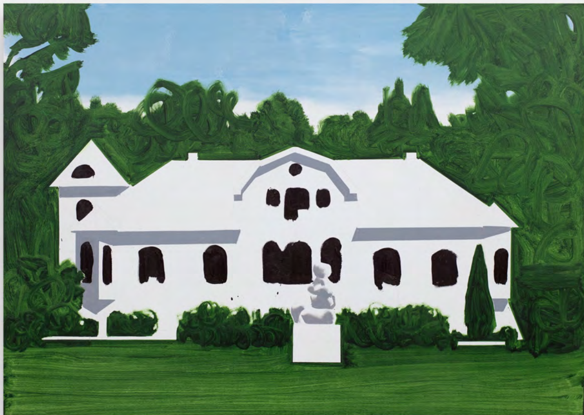
Wilhelm Sasnal Untitled (The Assistant – R. Walser) , 2024 oil on canvas 100 x 140 cm / 39 3 / 8 x 55 1 / 8 in HQ27-WS20678P