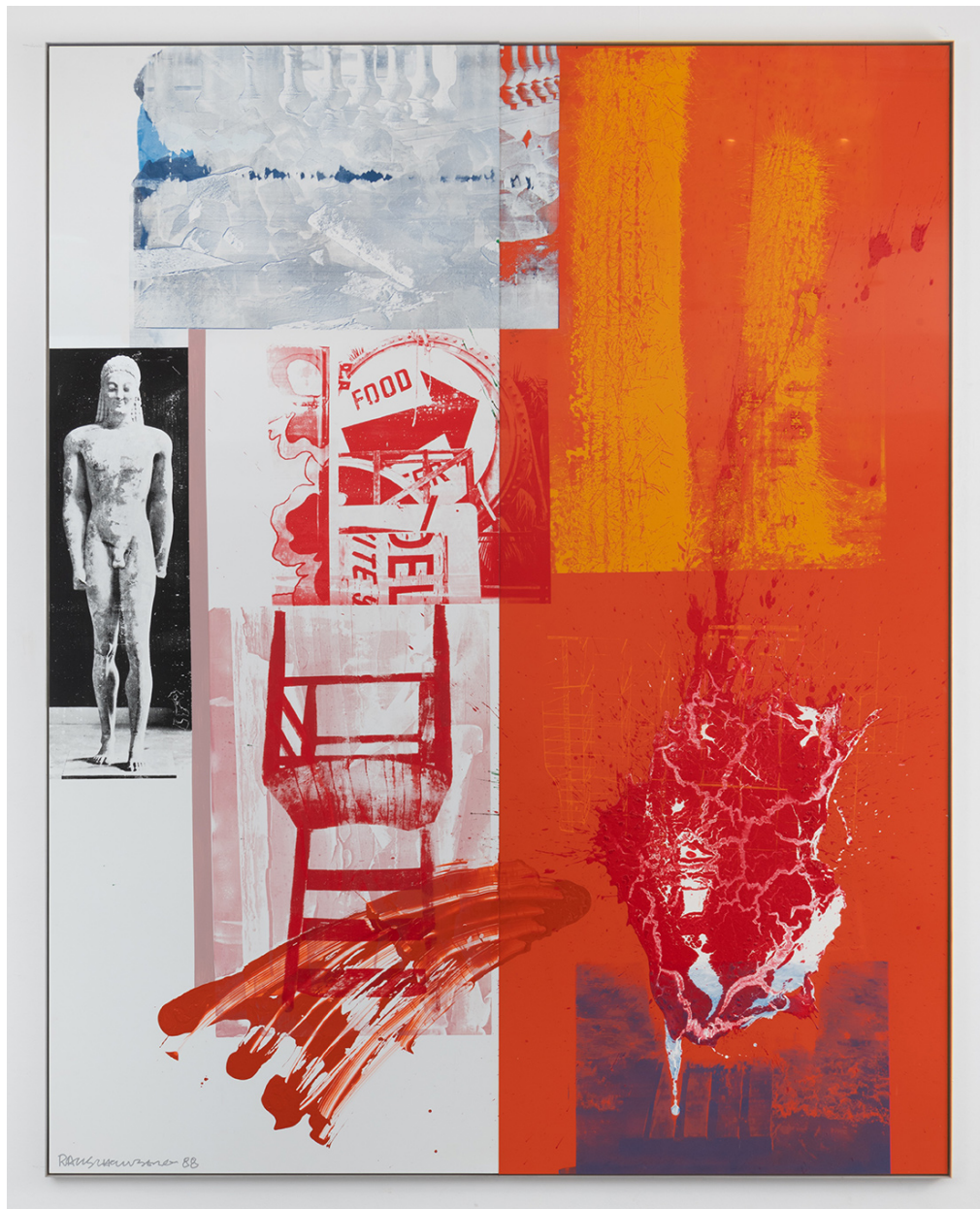
Robert Rauschenberg Garden Stretch (Urban Bourbon) , 1988 Enamel on aluminum (diptych) 306,7 x 245,7 cm (120,75 x 96,75 in) Signed, lower left Rauschenberg 88 left panel 88.173 \ Panel 1 of 2 right panel 88.173 \ Panel 2 of 2 (RR 1290)