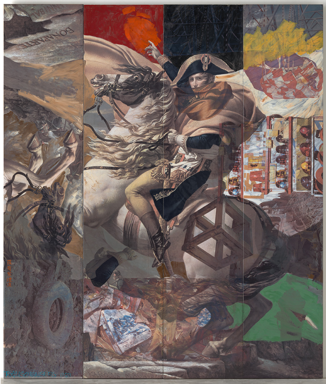
Robert Rauschenberg Able Was I Ere I Saw Elba , 1983 Ceramic 270,3 x 231,1 cm (106,4 x 91 in) Signed and dated bottom left R85.70/ 83.34 (RR 1308)

London, 37 Dover Street, W1S 4NJ, UK, T +44 203 813 8400 Paris Marais, 7 Rue Debelleye, 75003, France, T +33 1 42 72 99 00 Paris Pantin, 69 Av. du Général Leclerc, 93500, France, T +33 1 55 89 01 10 Salzburg, Mirabellplatz 2, 5020, Austria, T +43 662 881393 0 Seoul, 2F, 122-1 Dokseodang-ro, Yongsan-gu, 04420, Korea, T +82 2 6949 1760