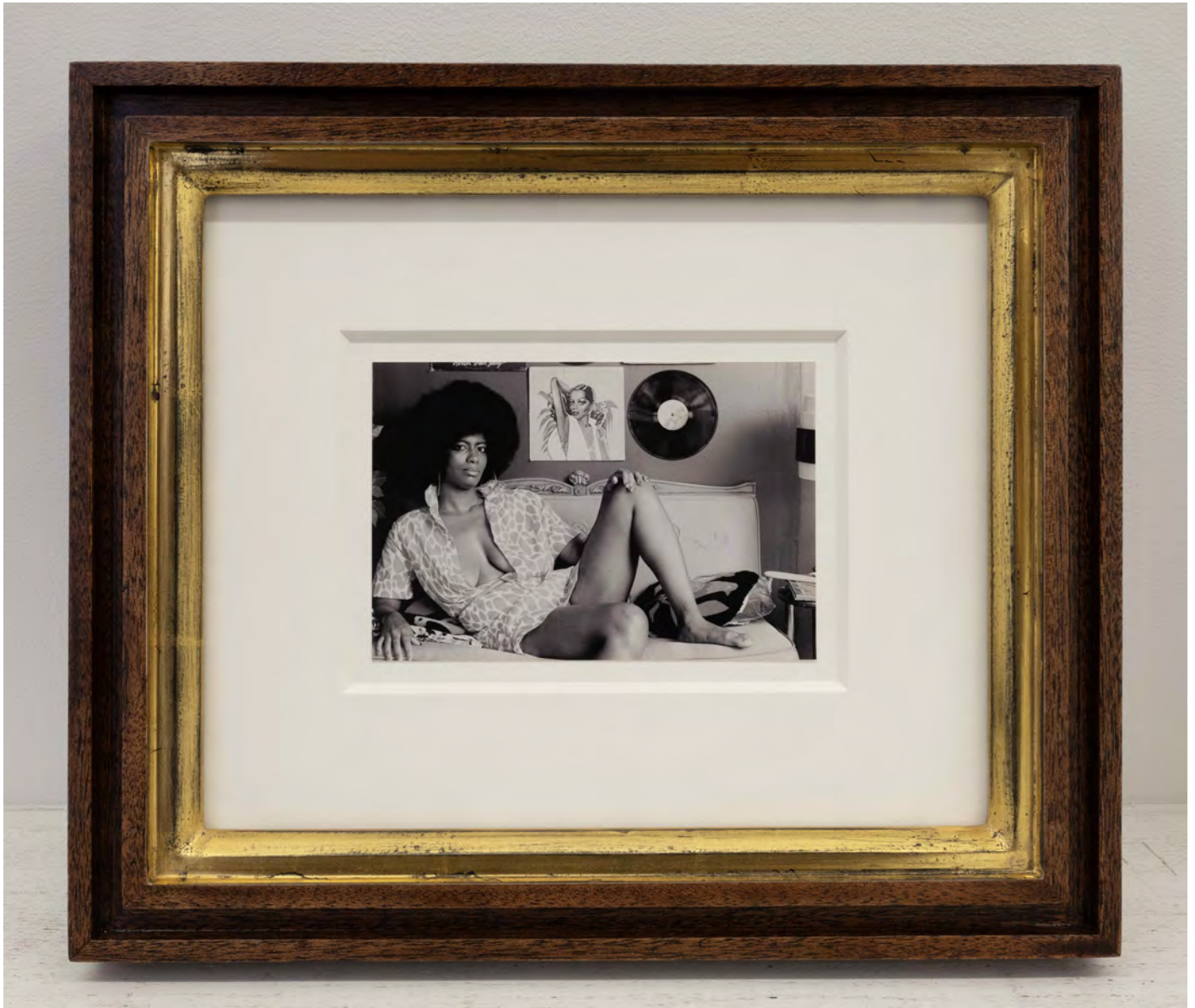
Mickalene Thomas Remember Me , 2023 Archival pigment print Image: 4 x 6 inches Frame: 11 x 13 inches Edition of 10