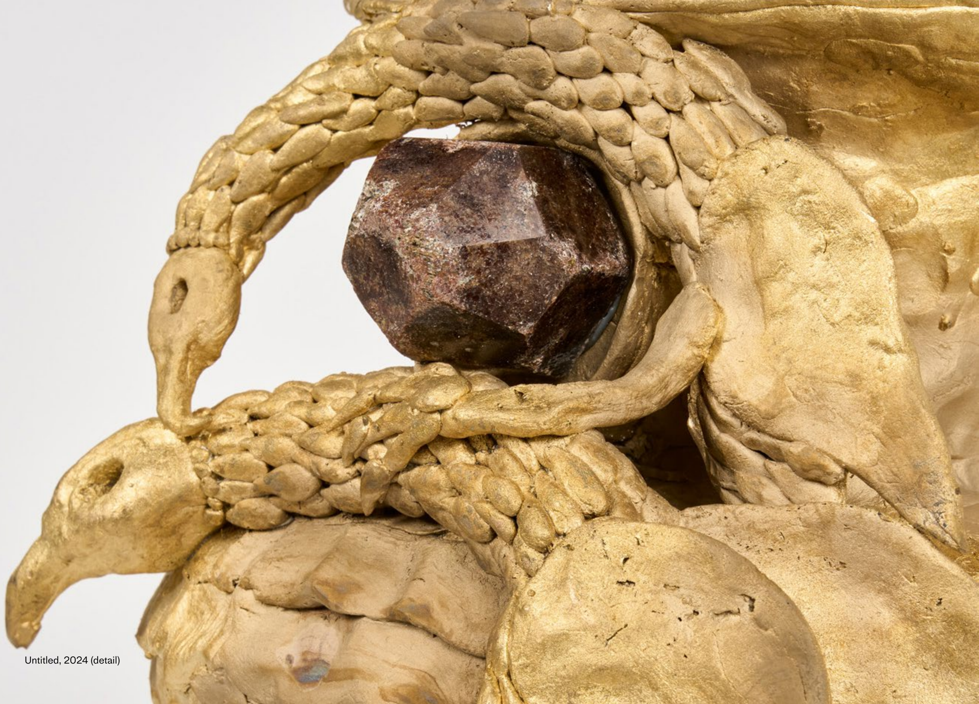
Untitled, 2024 (detail)