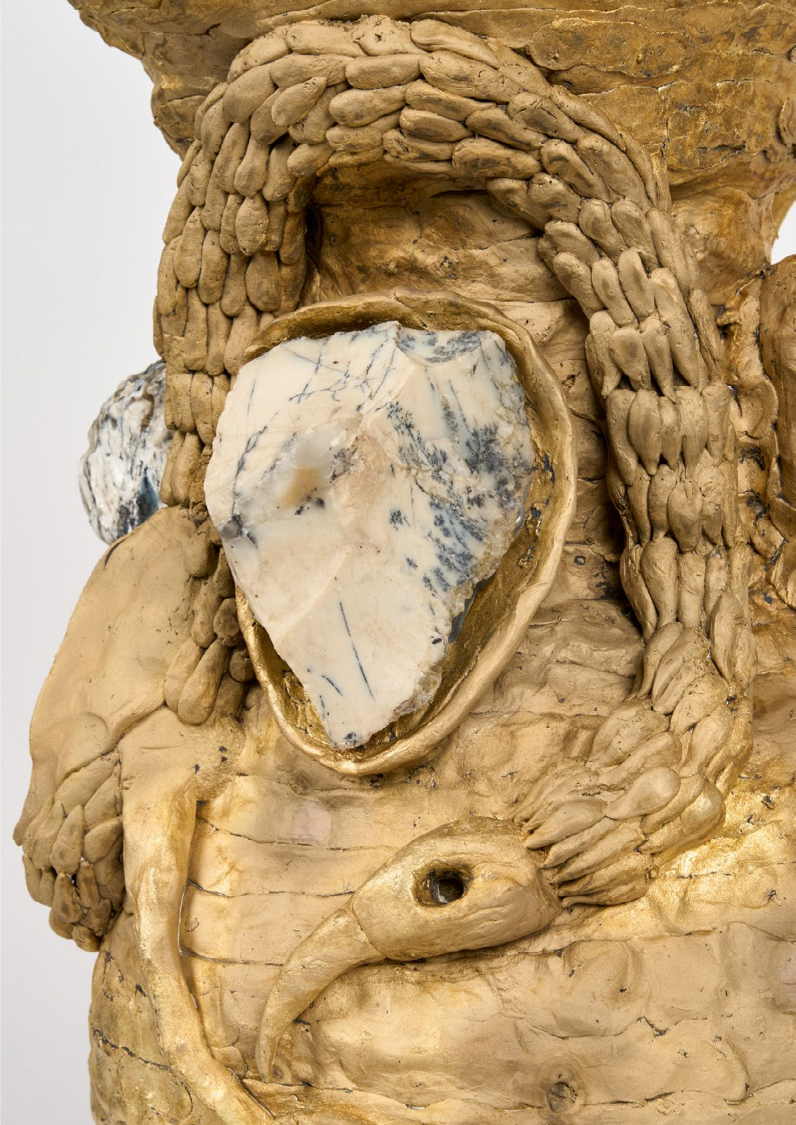
Untitled, 2024 (detail)

Through intricate depictions, the artist conjures eerie amalgamations of creatures and landscapes, imbuing the works with a sense of collective memory without reliable referent. At times, he inserts his sculptures into displays at archaeological museums, in between genuine historic artifacts produced by bygone civilisations in their eras of splendour or collapse.