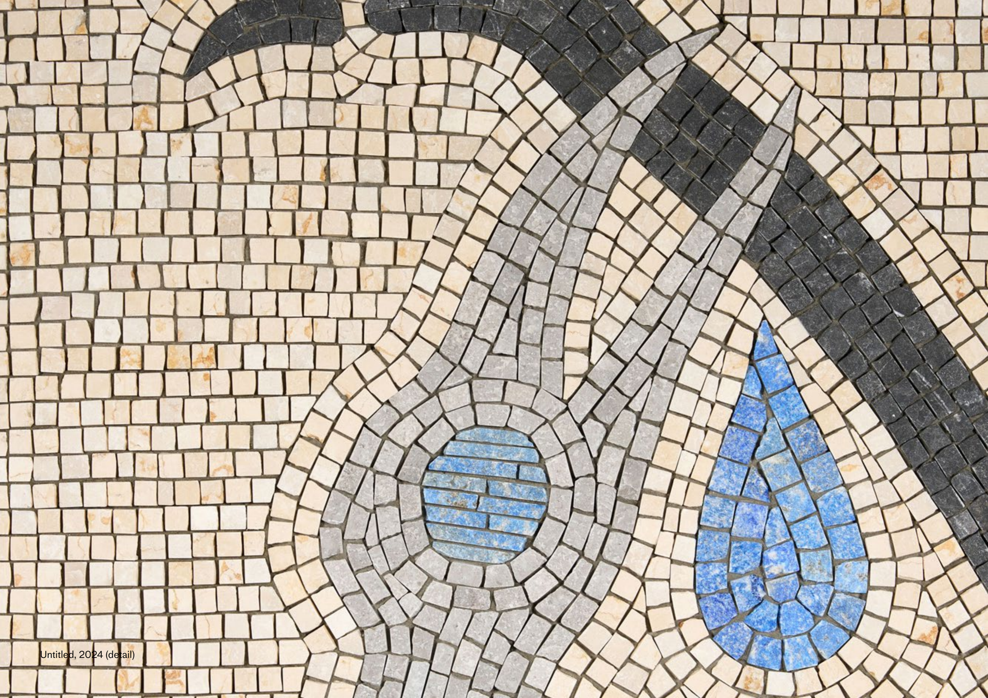
Untitled, 2024 (detail)