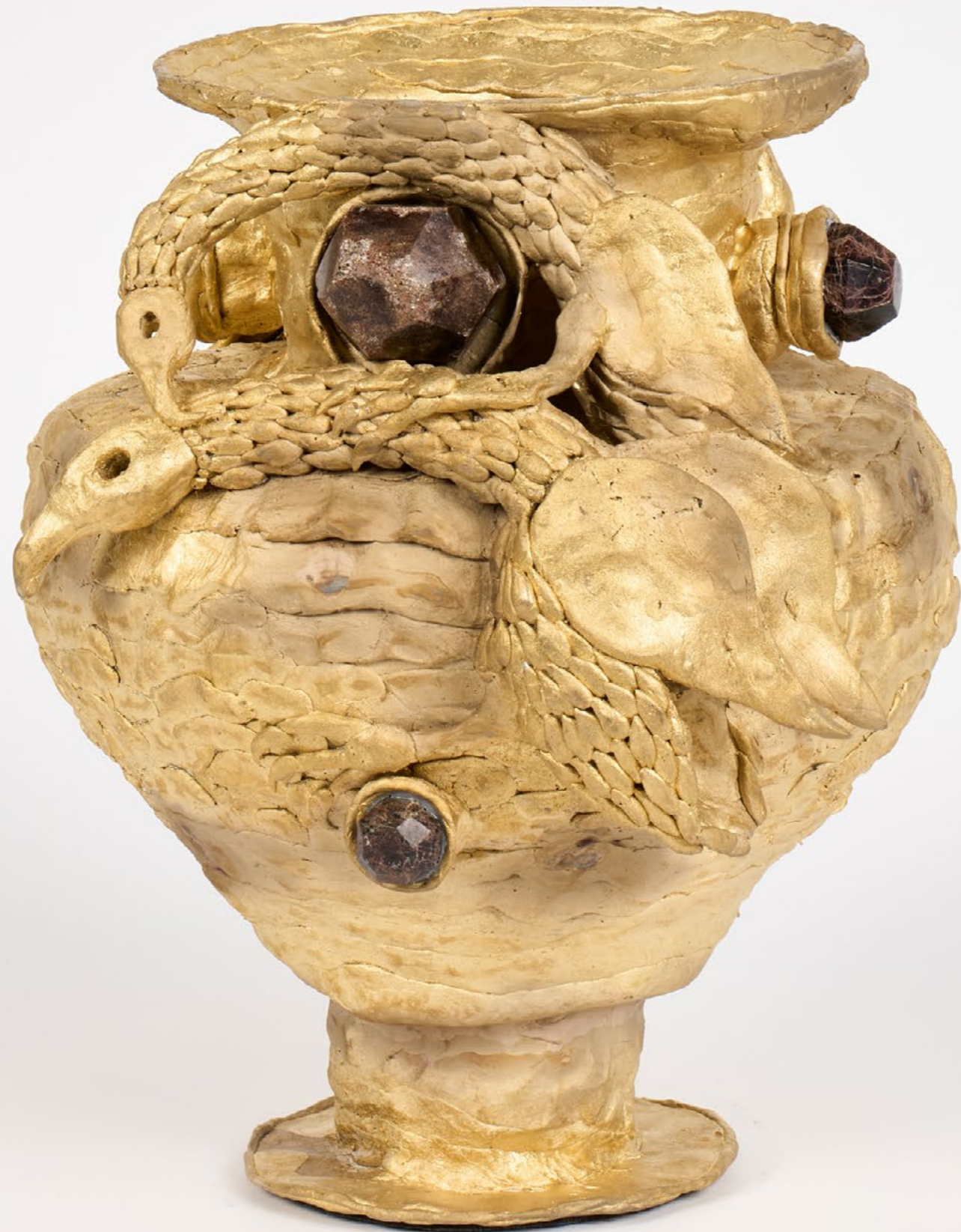
Untitled, 2024 (alternative view)