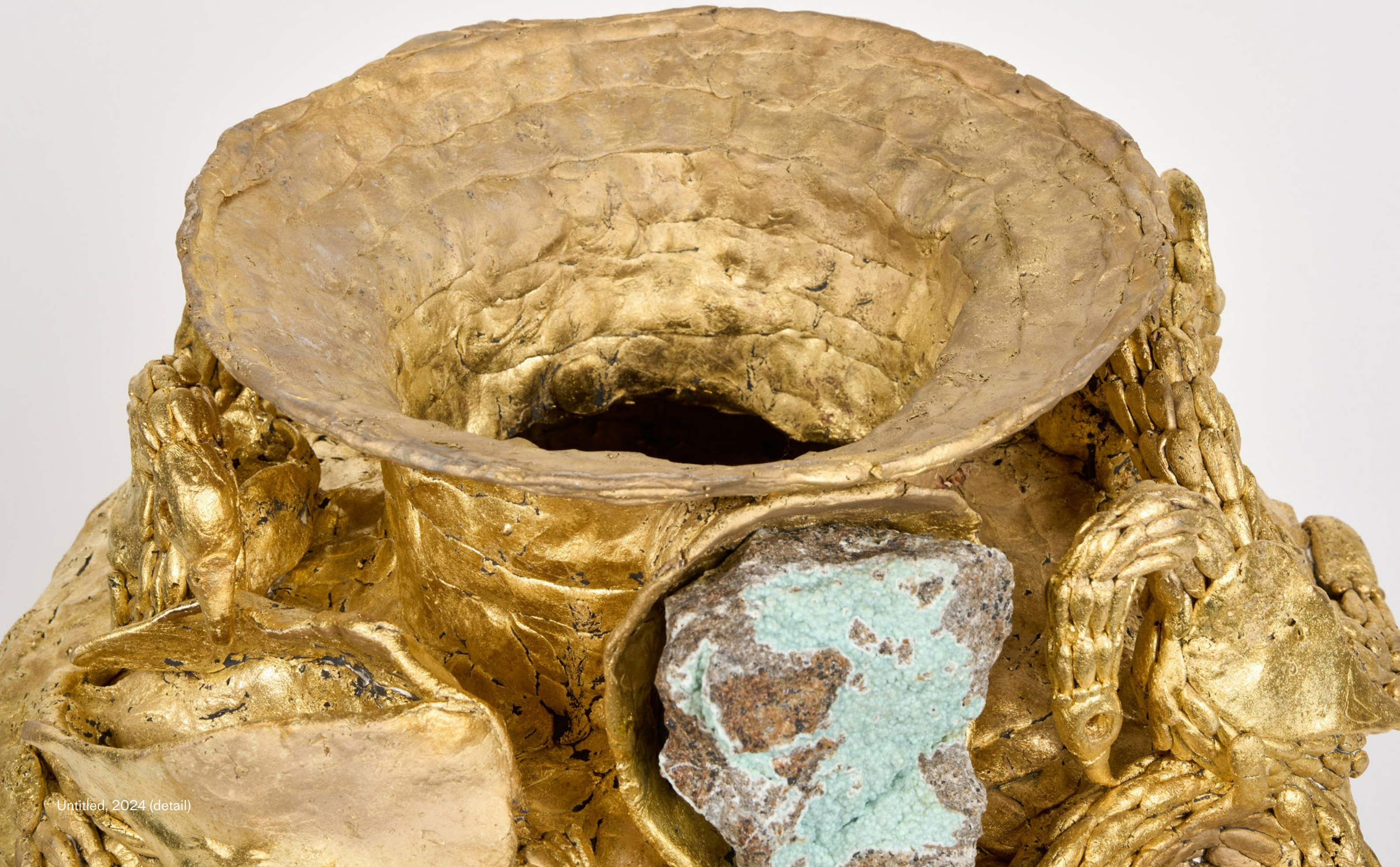
Untitled, 2024 (detail)