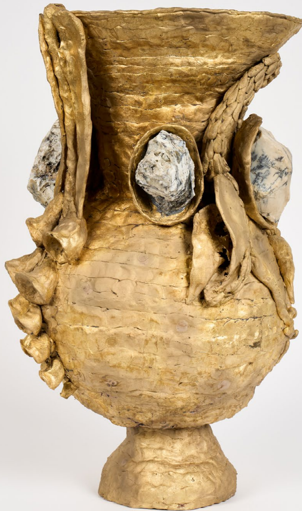
Evgeny Antufiev Untitled, 2024 bronze, patina, agate, opal 60 x 34 x 33 cm 23 5/8 x 13 3/8 x 13 inches (ANTUE-2024001)