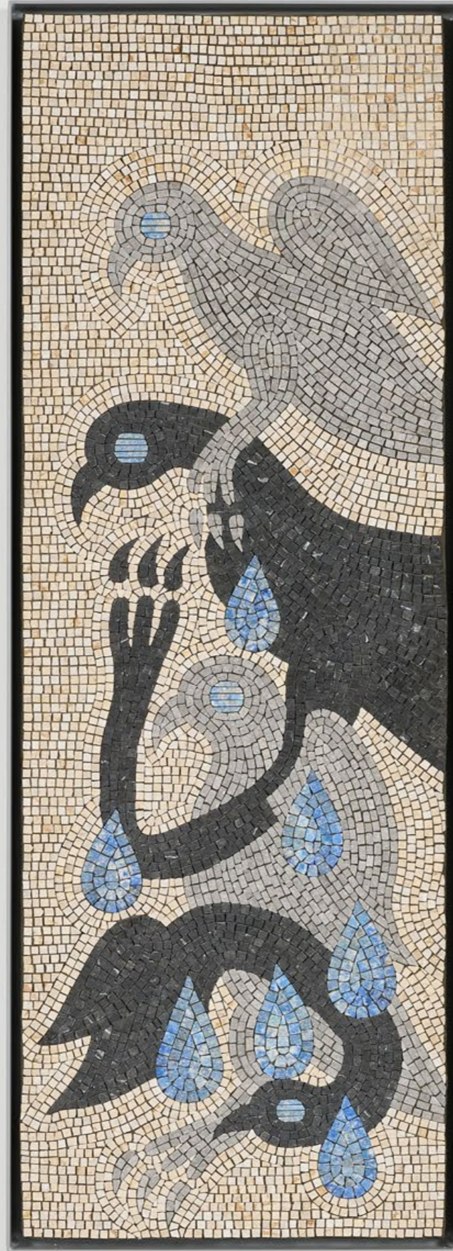
Untitled, 2024 marble, travertine, lapis lazuli, cement, iron 125 x 46 x 4 cm (framed) 49 ¼ x 18 ⅛ x 1 ⅝ inches (ANTUE-2024015)