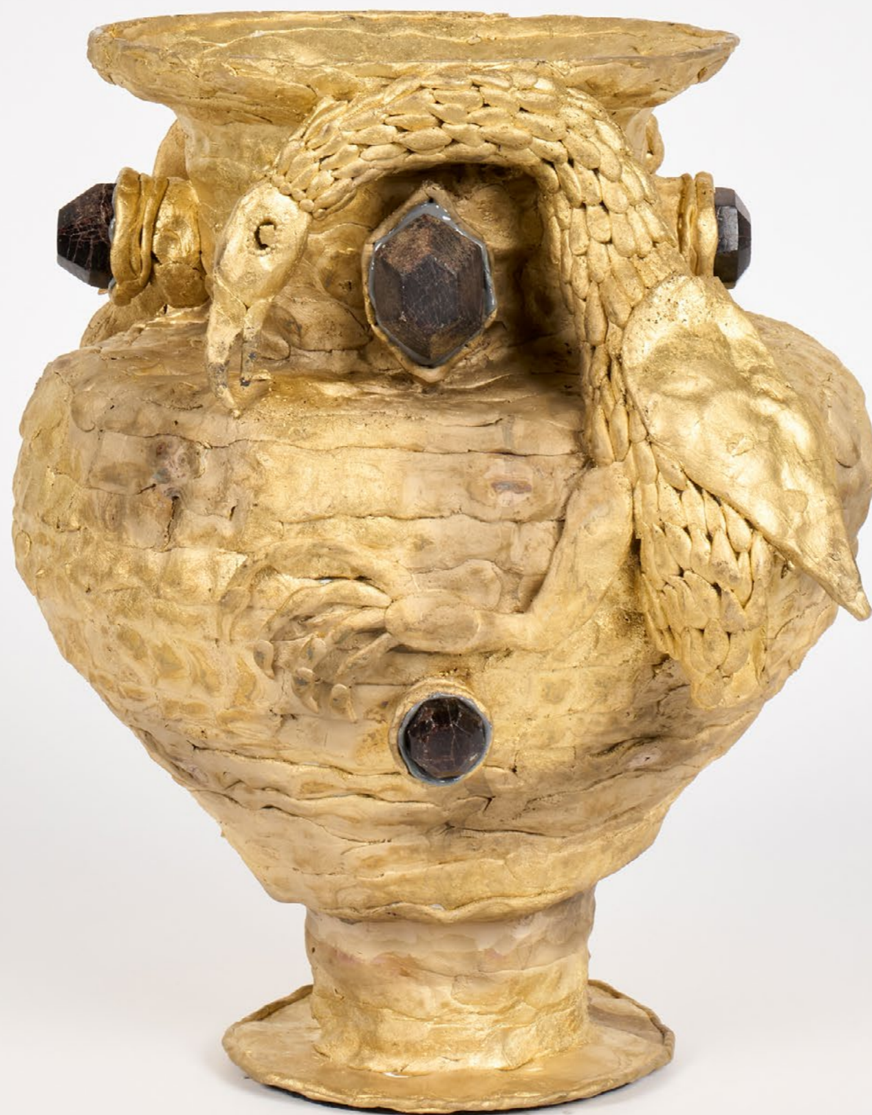
Evgeny Antufiev Untitled, 2024 bronze, patina, granite, cold enamel 32 x 24 x 36 cm 12 5/8 x 9 1/2 x 14 1/8 inches (ANTUE-2024002)