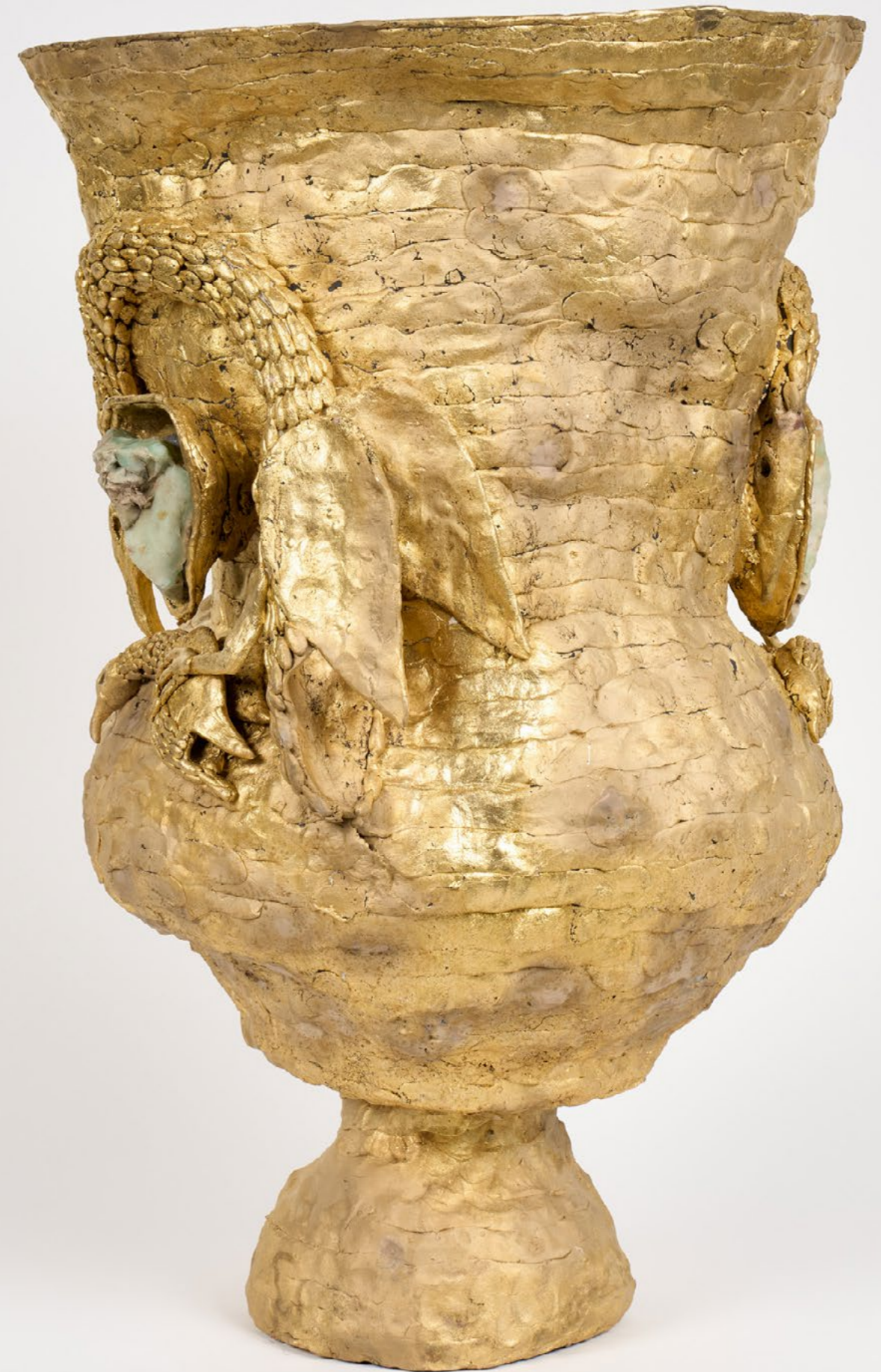
Untitled, 2024 (alternative view)

Gems, metals, minerals and archives are all stage-setting materials of Antufiev's work. He purchases them at auctions, gems and minerals from dealers, animal teeth from Siberian hunters, textiles from his grandmother. Part scavenger of detritus, part craftsman, the artist's laborious treatment and sourcing of materials leaves a tactile trace on the objects, caked with his fingerprints.