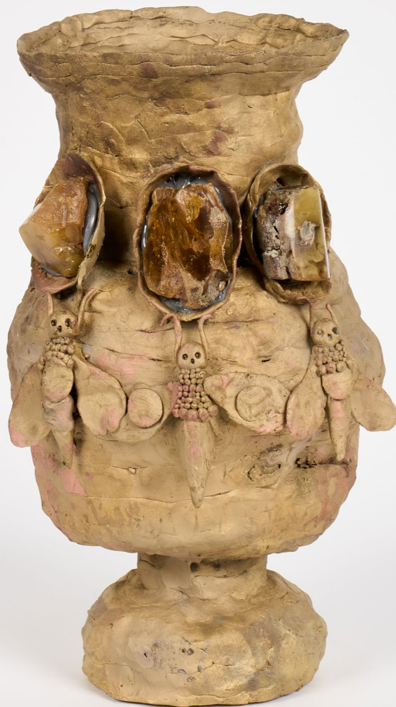
Evgeny Antufiev Untitled, 2024 bronze, patina, amber, epoxy 34 x 25 x 23 cm 13 3/8 x 9 7/8 x 9 inches (ANTUE-2024007)