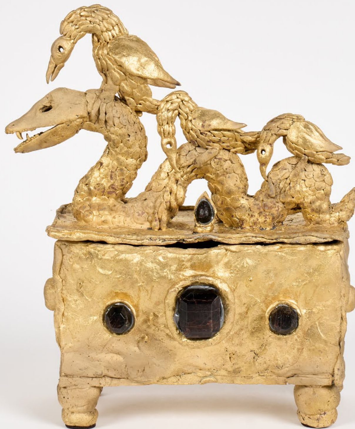
Evgeny Antufiev Untitled, 2024 yellow bronze, patina, granite, cold enamel 36 x 32 x 18 cm 14 1/8 x 12 5/8 x 7 1/8 inches (ANTUE-2024009)