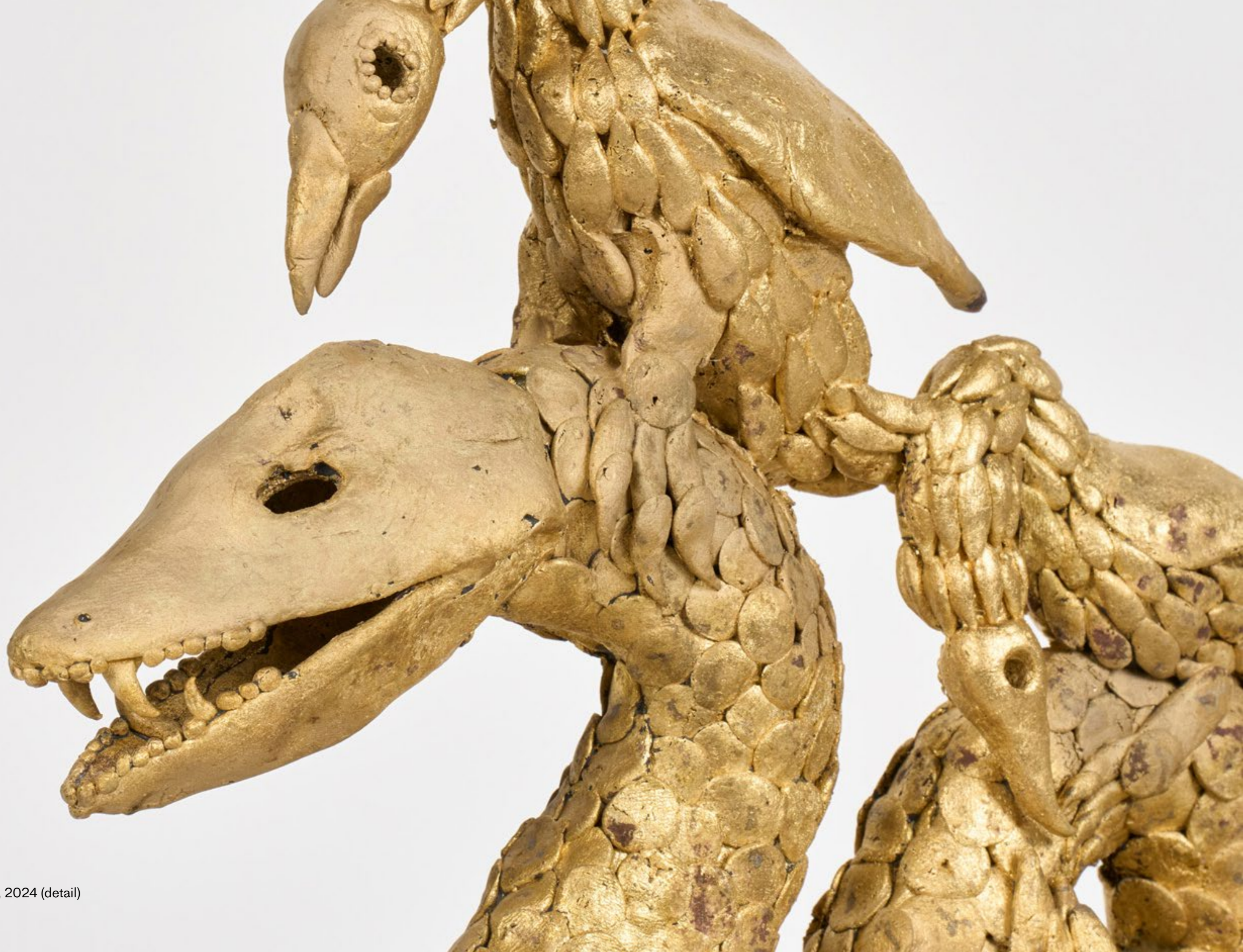
Untitled, 2024 (detail)