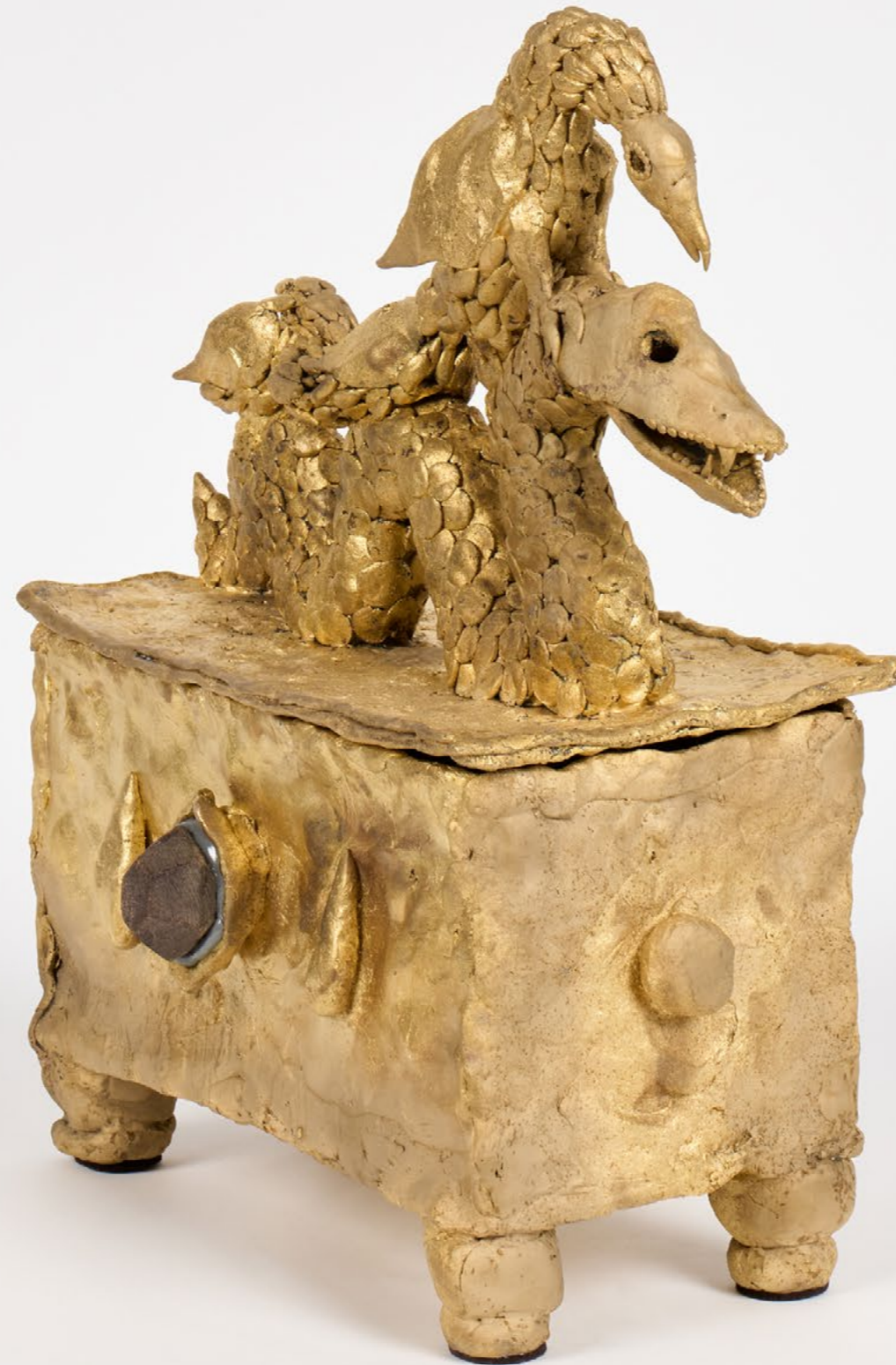
Untitled, 2024 (alternative view)