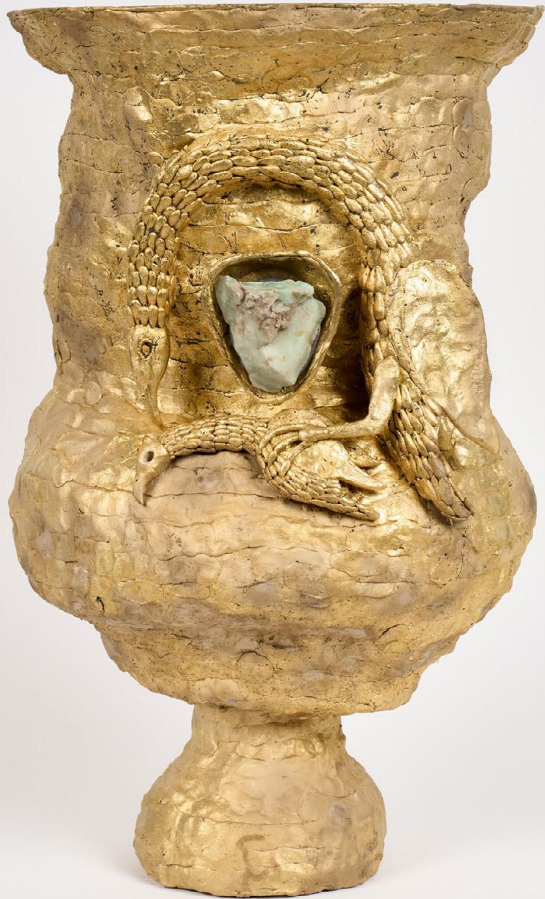
Untitled, 2024 bronze, patina, chrysoprase 63 x 41 x 39 cm 24 ¾ x 16 ⅛ x 15 ⅜ inches (ANTUE-2024005)