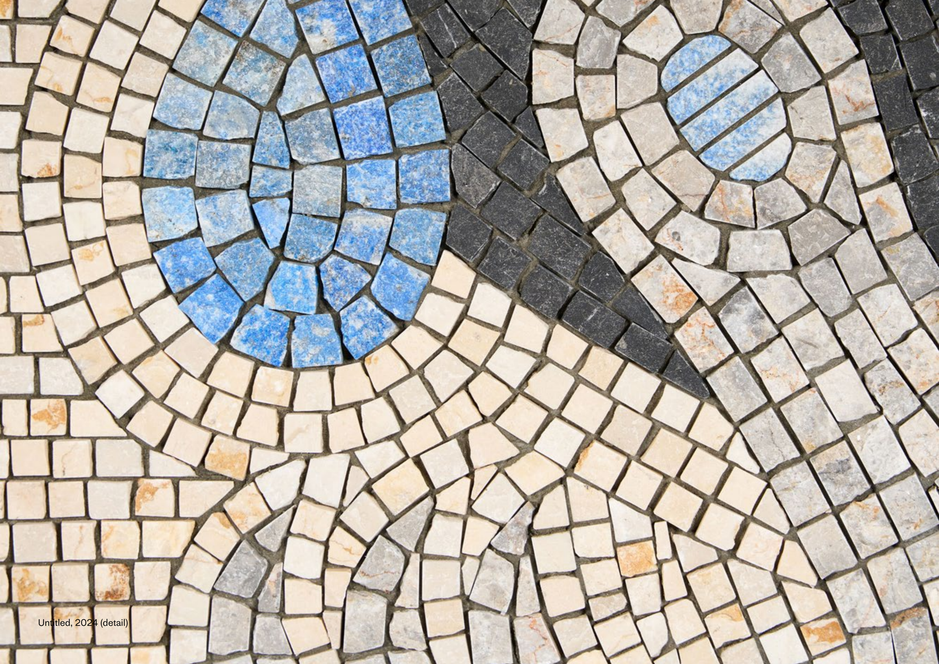
Untitled, 2024 (detail)