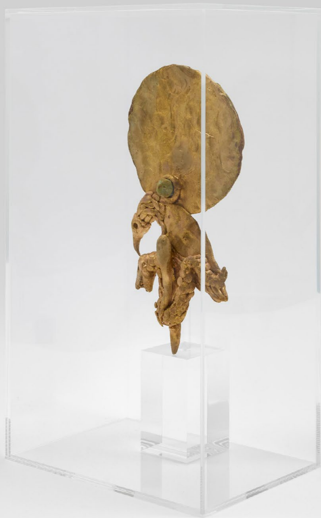
Untitled, 2024 (alternative view)