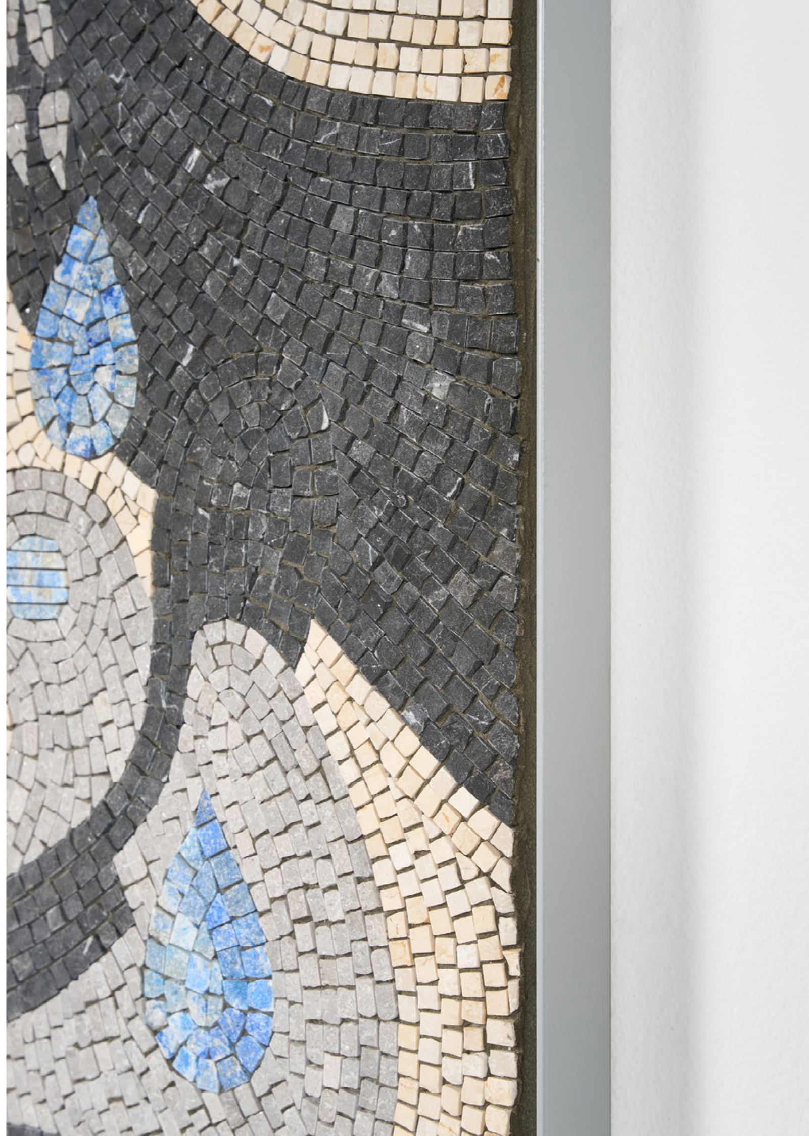
Untitled, 2024 (detail)