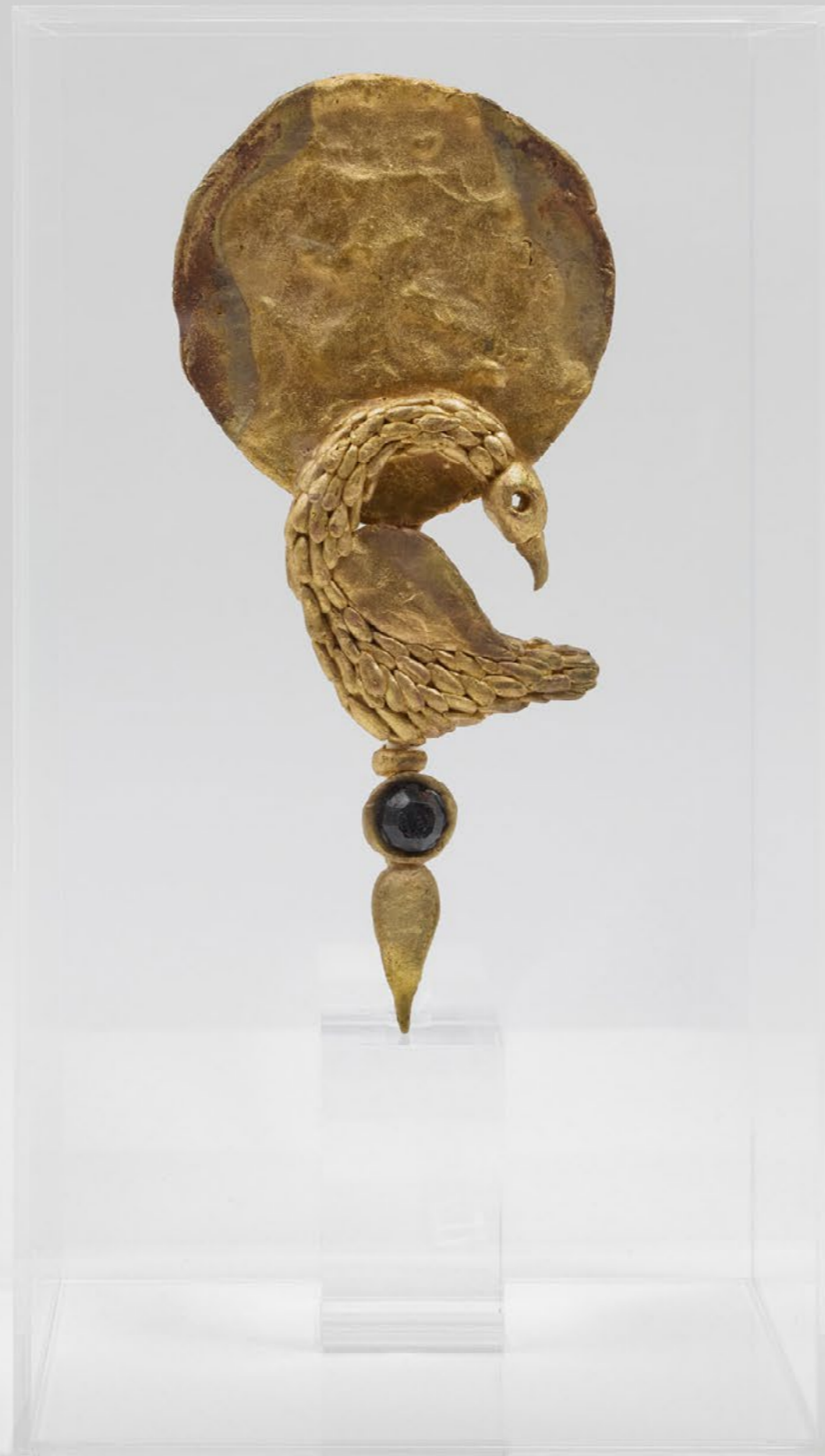
Untitled, 2024 bronze, patina, granite, enamel, acrylic display case 31.5 x 16 x 3 cm 12 3 / 8 x 6 1 / 4 x 1 1 / 8 inches (ANTUE-2024025)