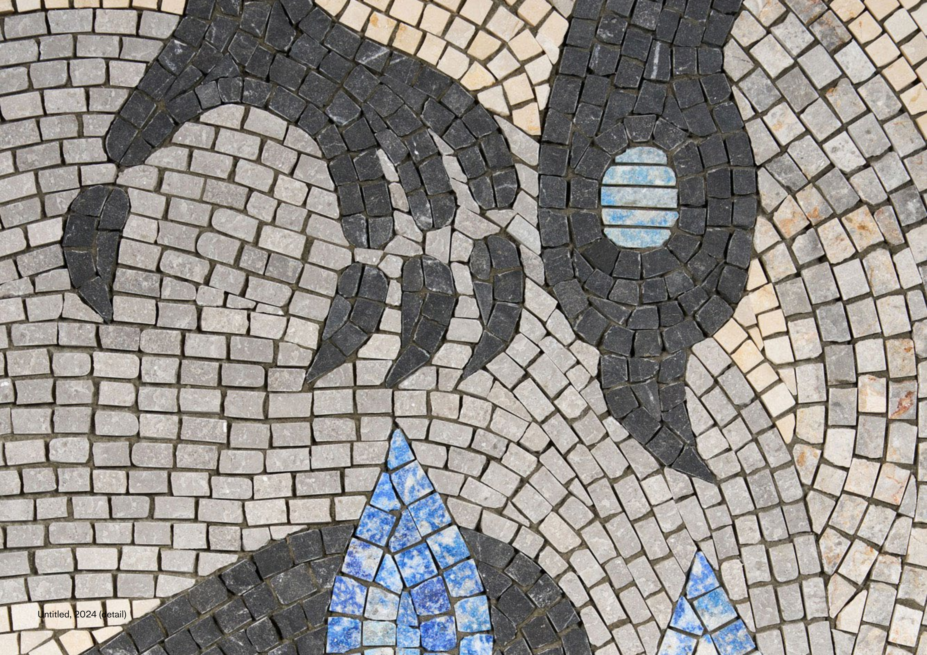
Untitled, 2024 (detail)