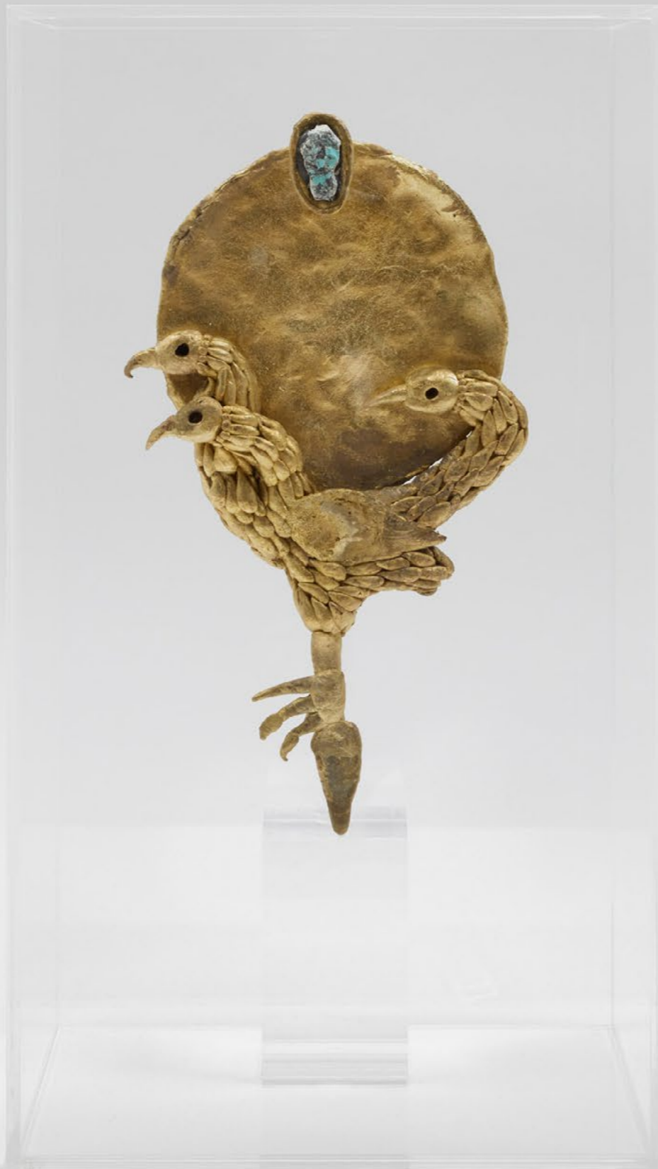
Untitled, 2024 bronze, patina, turquoise, cold enamel, acrylic display case 29.5 x 17 x 3.5 cm 11 5 / 8 x 6 3 / 4 x 1 3 / 8 inches (ANTUE-2024023)