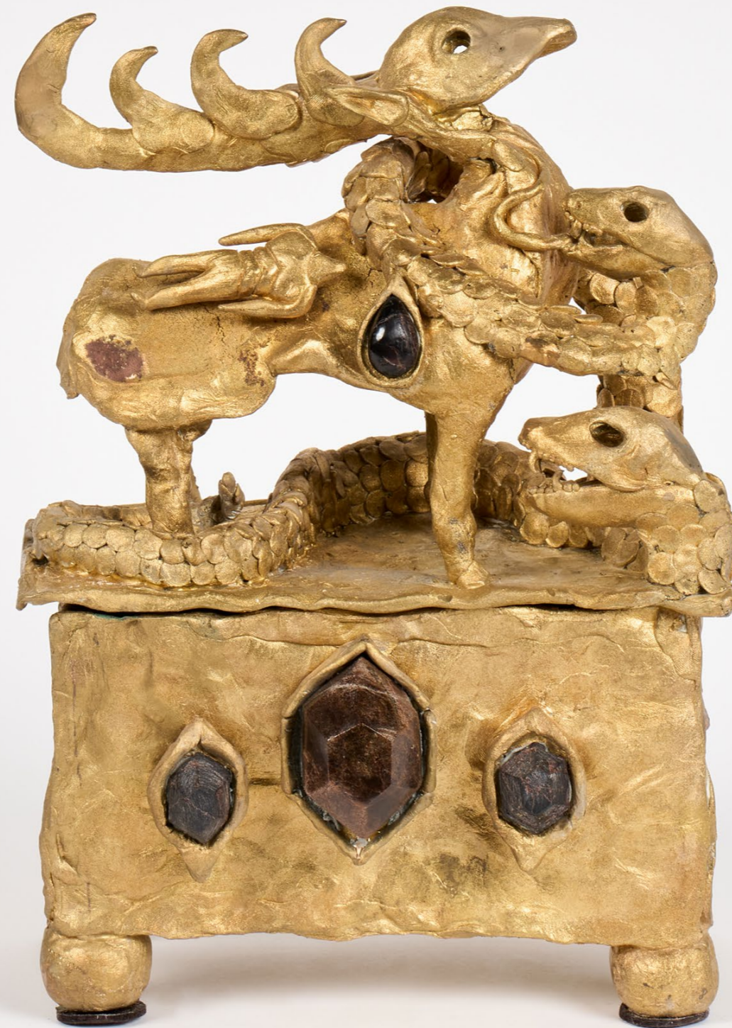
Evgeny Antufiev Untitled, 2024 yellow bronze, patina, granite, cold enamel 34 x 25 x 25 cm 13 3/8 x 9 7/8 x 9 7/8 inches (ANTUE-2024011)