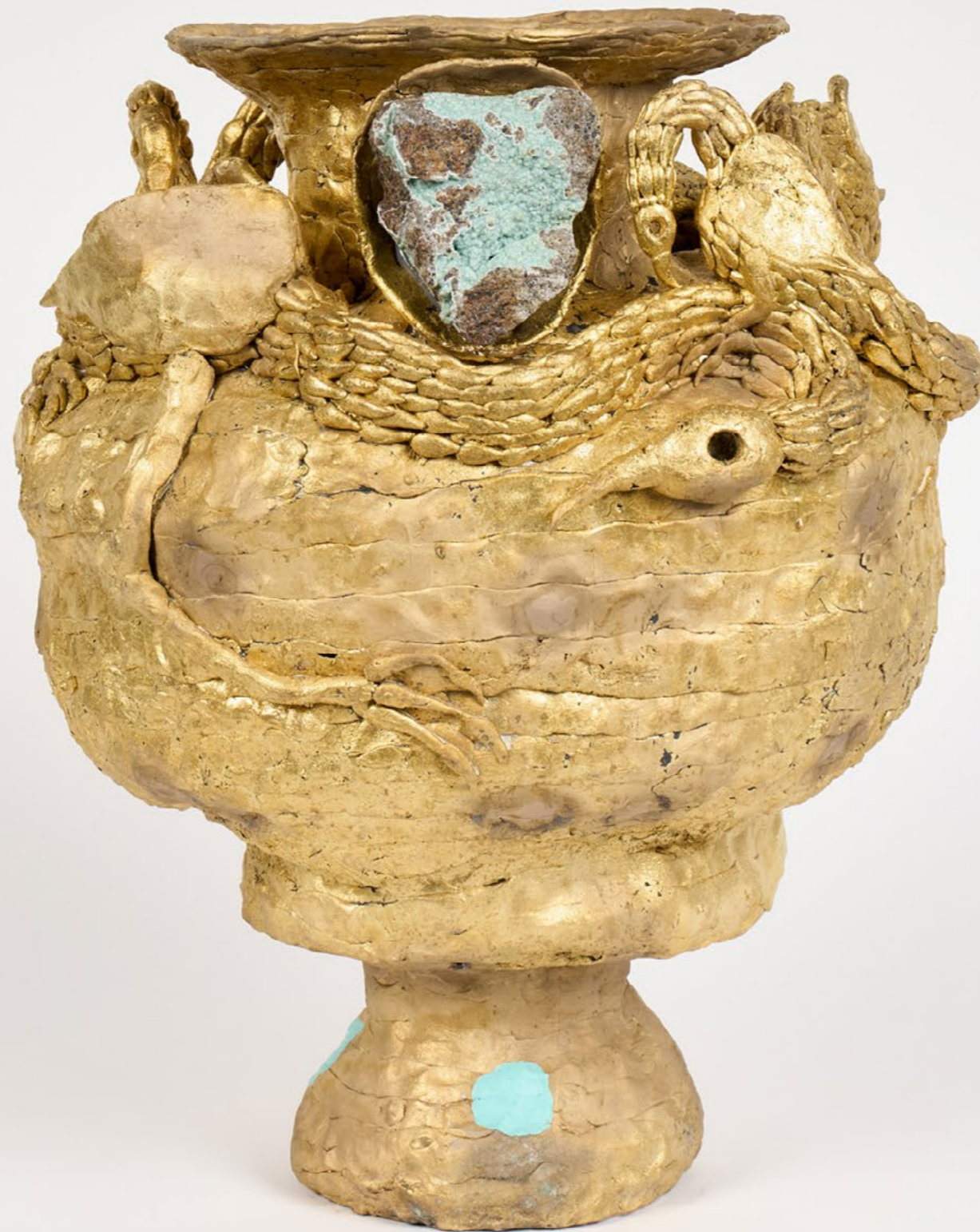
Untitled, 2024 bronze, patina, staffelite, cold enamel 50 x 41 x 39 cm 19 3/4 x 16 1/8 x 15 3/8 inches (ANTUE-2024004)