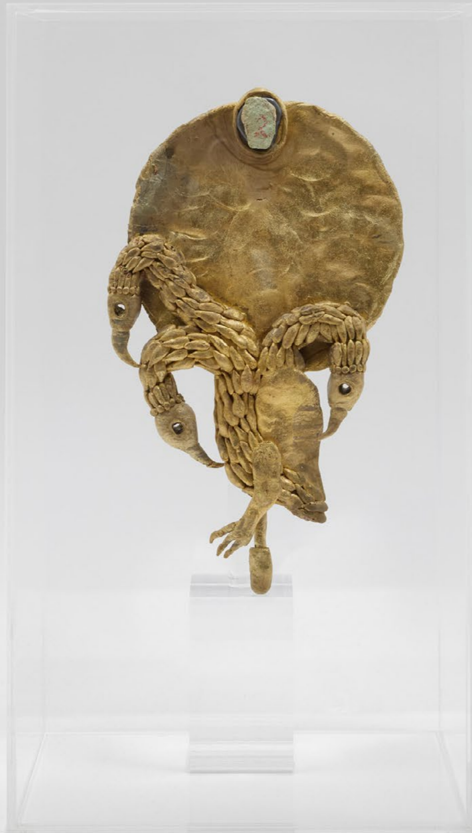
Evgeny Antufiev Untitled, 2024 bronze, patina, turquoise, enamel, acrylic display case 29 x 18 x 3 cm 11 3 / 8 x 7 1 / 8 x 1 1 / 8 inches (ANTUE-2024027)