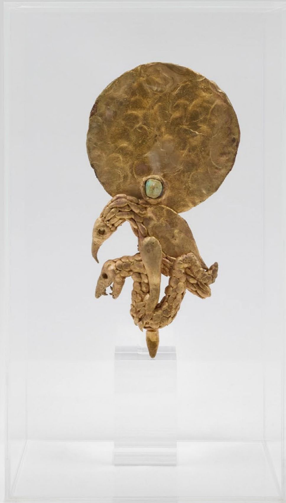
Untitled, 2024 bronze, patina, turquoise, cold enamel, acrylic display case 28.5 x 15 x 4 cm 11 1/4 x 5 7/8 x 1 5/8 inches (ANTUE-2024019)