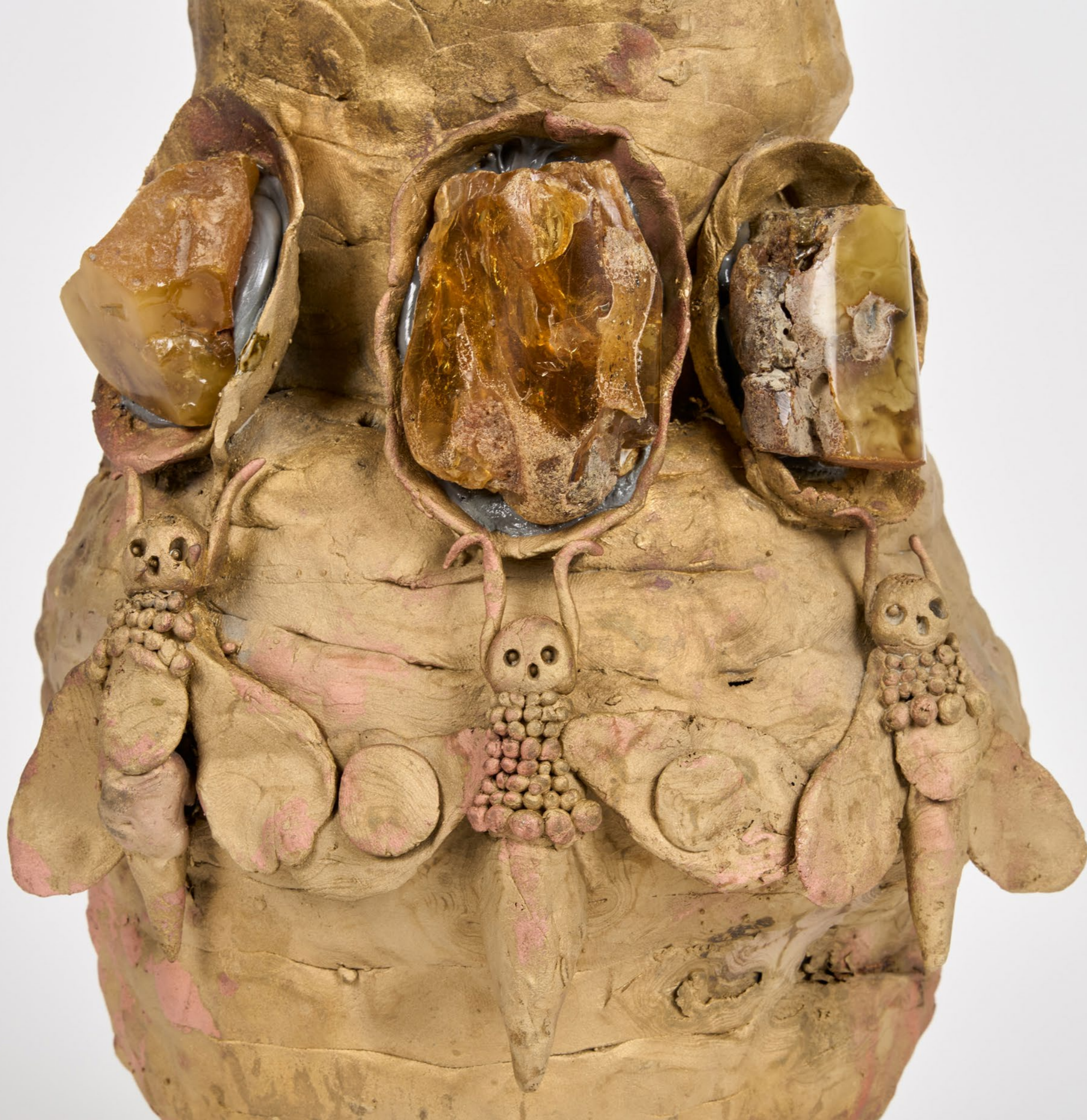
Untitled, 2024 (detail)