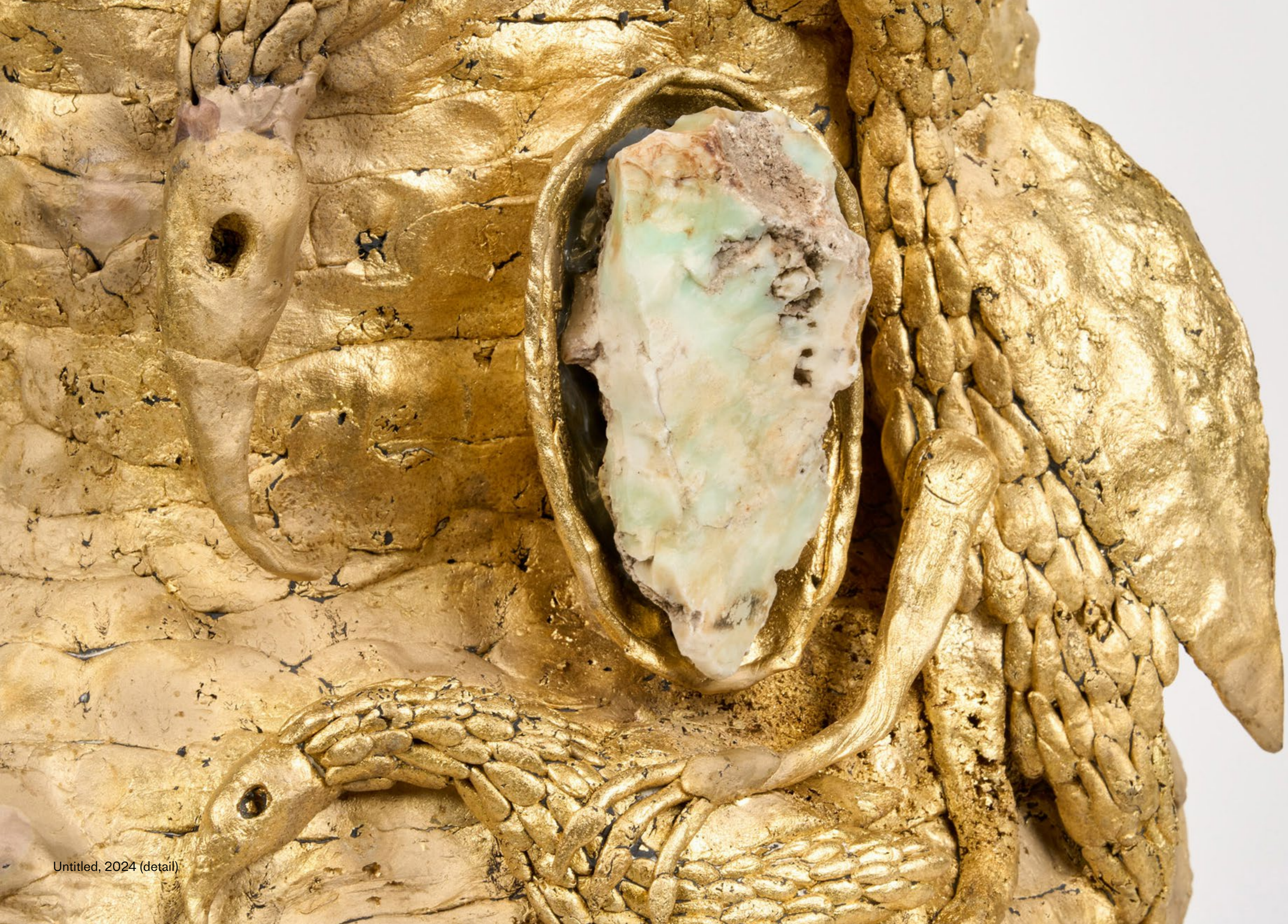
Untitled, 2024 (detail)