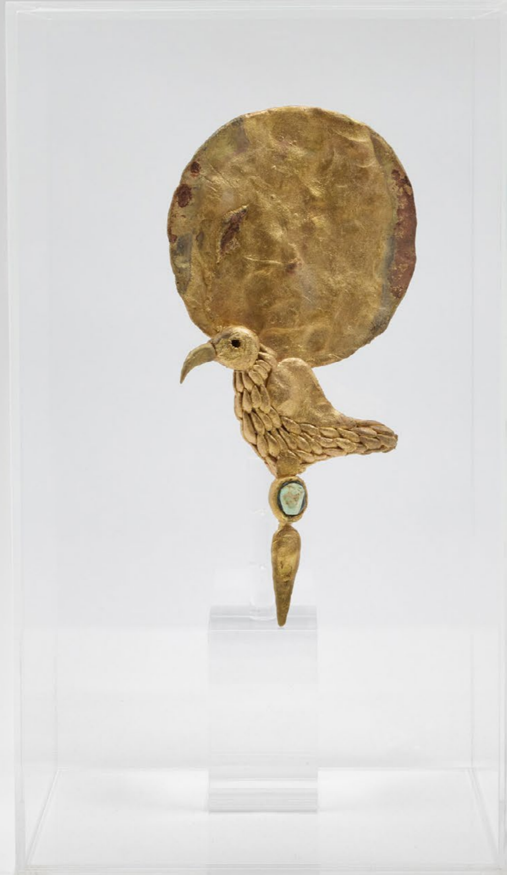
Untitled, 2024 bronze, patina, turquoise, cold enamel, acrylic display case 29 x 15 x 3 cm 11 3 / 8 x 5 7 / 8 x 1 1 / 8 inches (ANTUE-2024021)