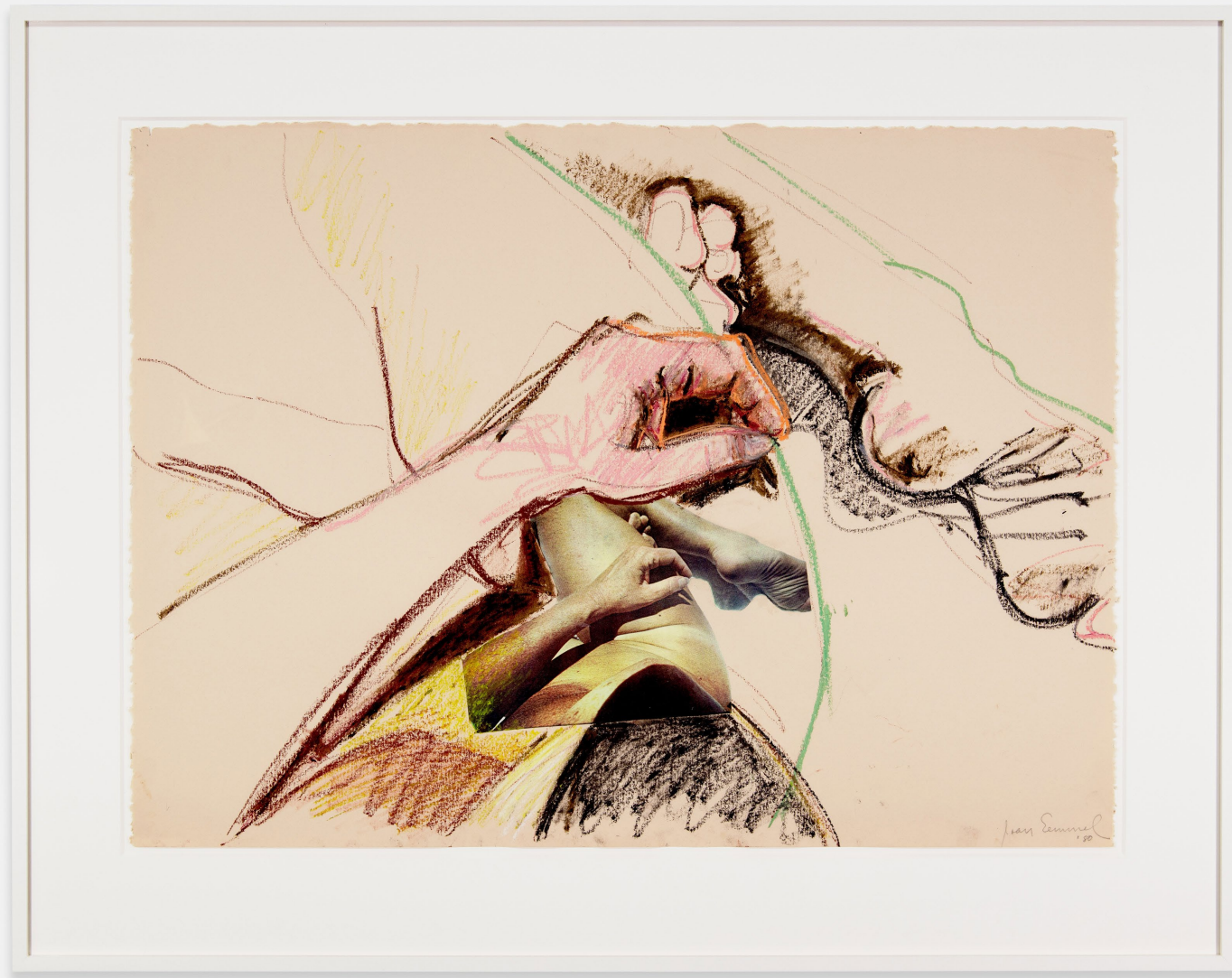
Joan Semmel Untitled , 1980

oil crayon and collage on paper 56.2 × 76.8 cm, 22 1/8 × 30 1/4 in.