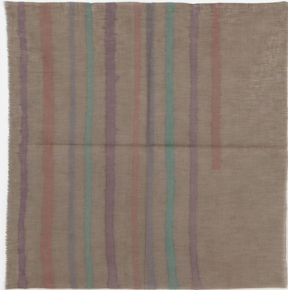
Giorgio Griffa Verticale policromo, 1979 acrylic on canvas 149 × 145 cm, 58 5 / 8 × 57 1 / 8 in.