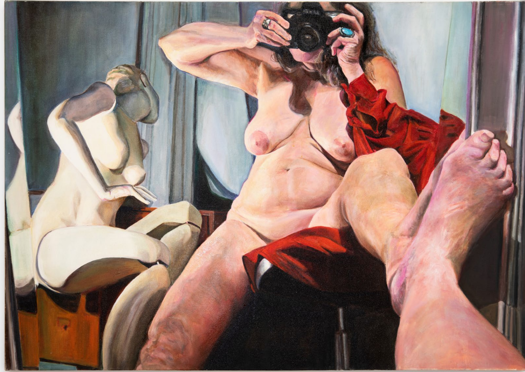
Joan Semmel Baroque , 2002

oil on canvas 107 × 152.5 cm, 42 1/8 × 60 in.