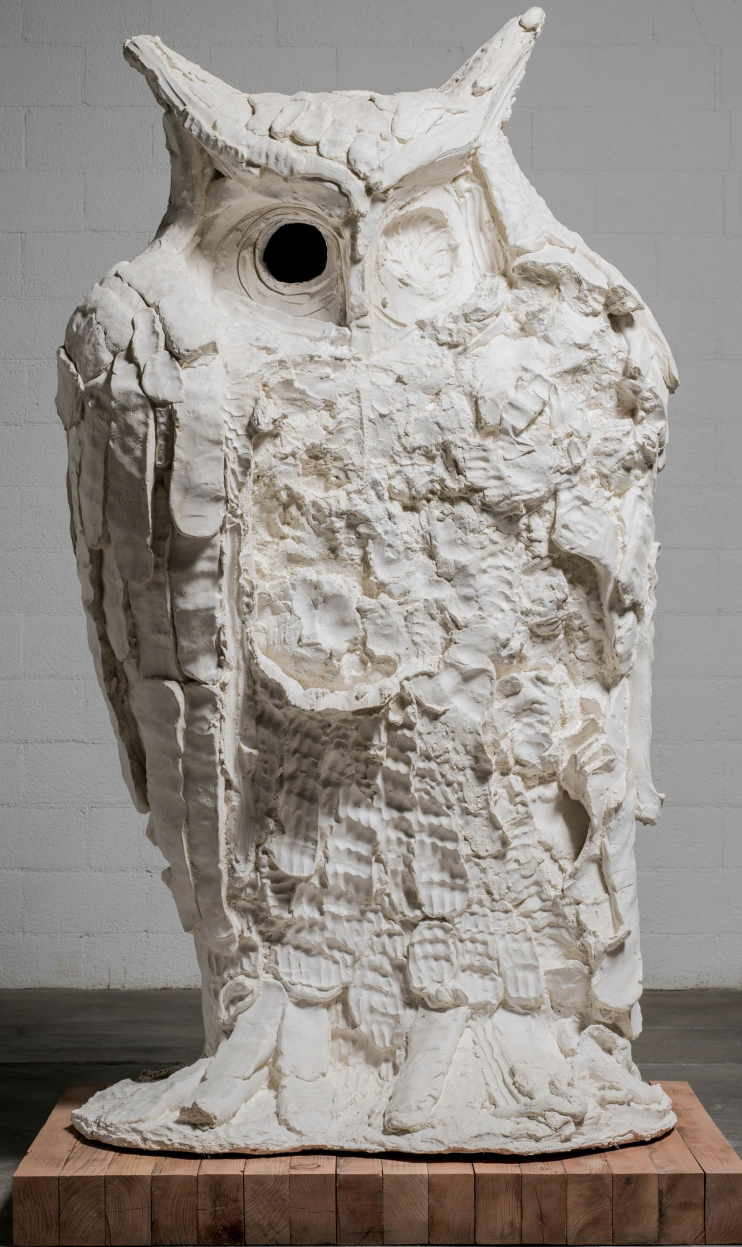
Thomas Houseago Standing Owl 1 , 2012

Tuf-Cal, hemp, iron rebar 239.4 × 127 × 91.4 cm, 94 1/4 × 50 × 36 in.