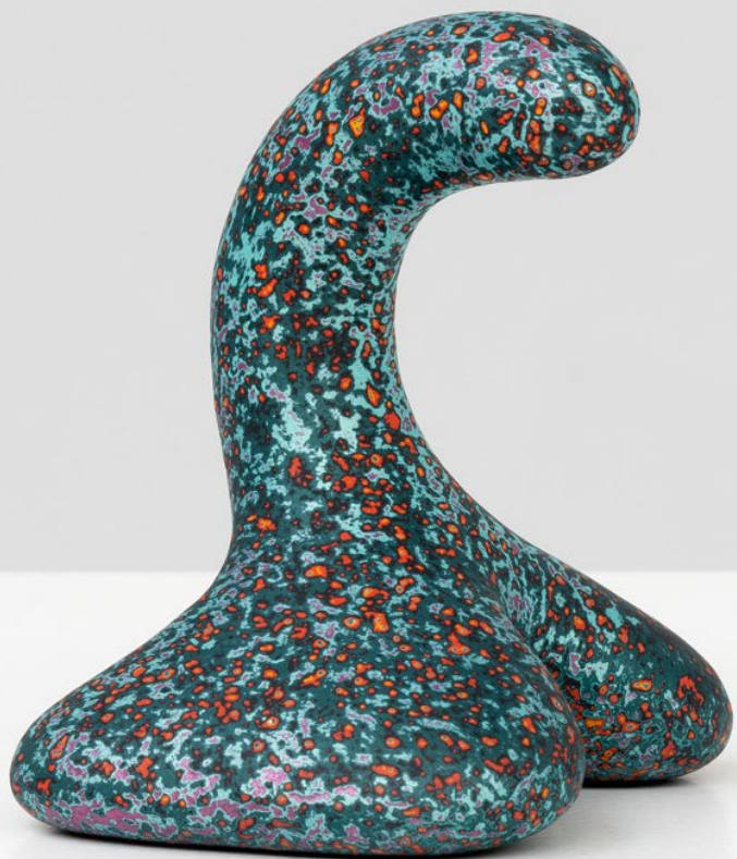
Ken Price Curley , 2005

fired and hand-painted clay in lighted wooden display box series of 35 unique works, this is 34/35 11.4 × 10.2 × 7.6 cm, 4.5 × 4 × 3 in. box dimensions: 19 × 18 × 8 cm, 7.5 × 7.1 × 3.1 in.