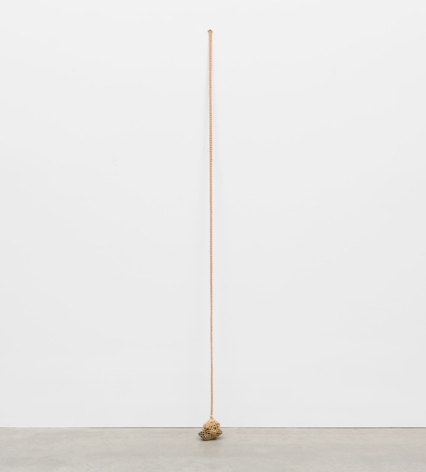
Veronica Ryan OBE RA Shrivelled Mangoes , 2024 Woven cotton, bronze 148 x 10.5 x 5.5 cm (58 ¼ x 4 ⅛ x 2 ⅛ in) (AJG-VR-00319)