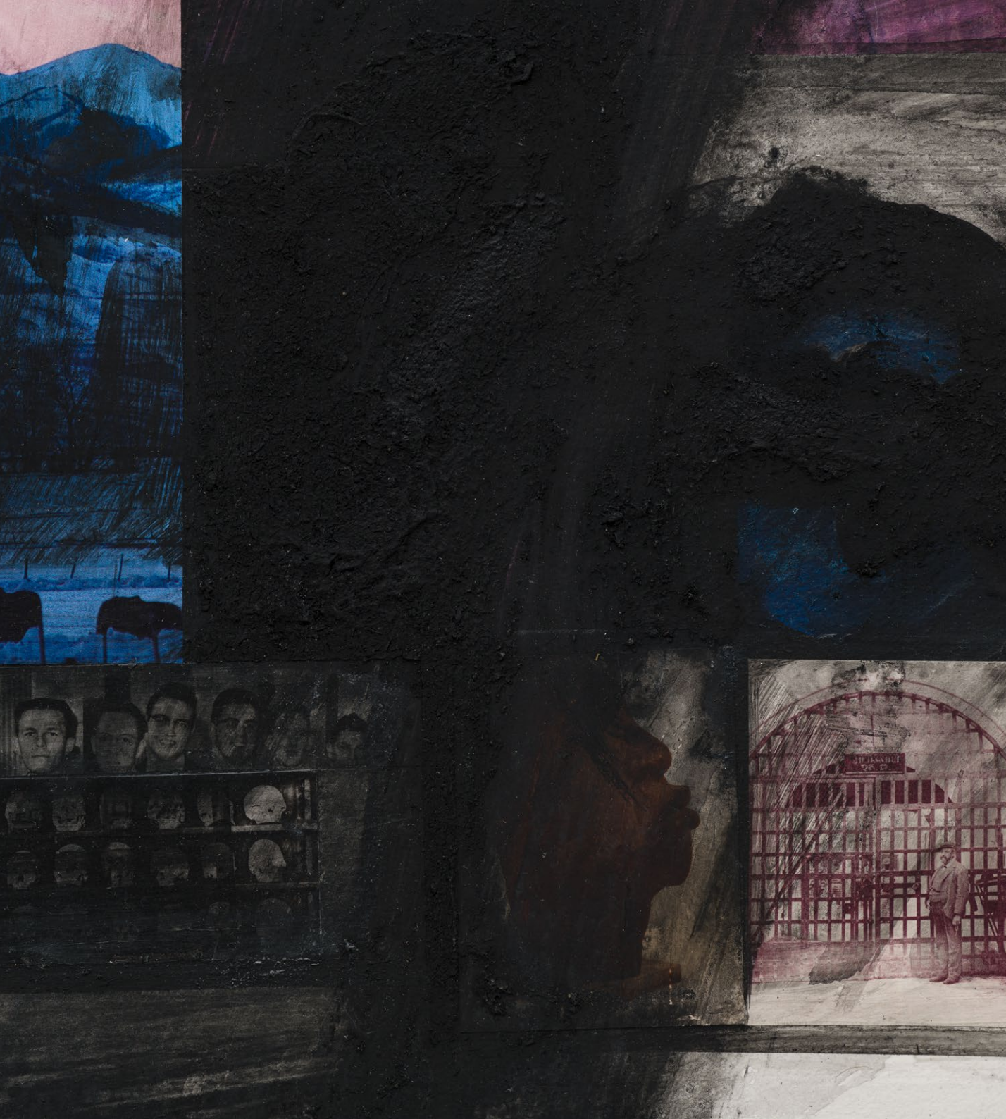
The Arizona Suite: Encounters in the Desert, 1993 Acrylic, sawdust, photograph collage, magazine cutting on paper Framed: 62 x 82 cm (24 3 / 8 x 32 1 / 4 in) (AJG-DL-00047)