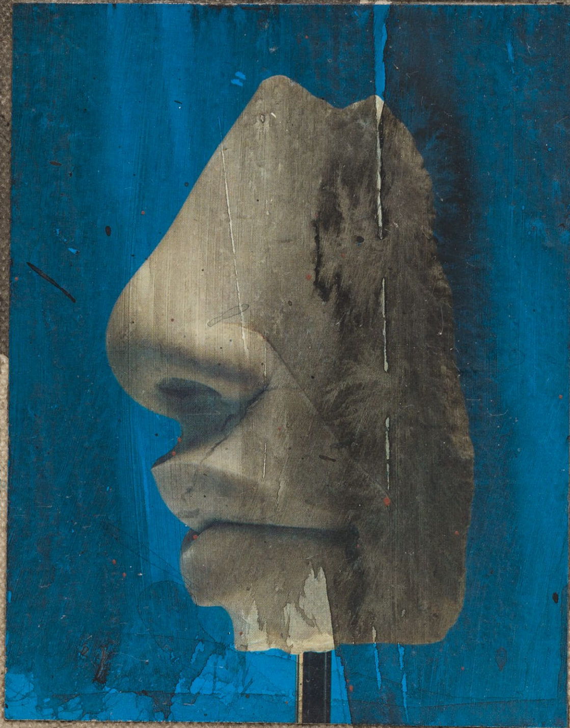
The Landscape of Apollo Vector , 1992 Acrylic, sawdust, plexiglass, metal, wood, photograph collage, magazine cutting on board Framed: 150 x 256 cm (59 x 100 ¾ in) (AJG-DL-00035)