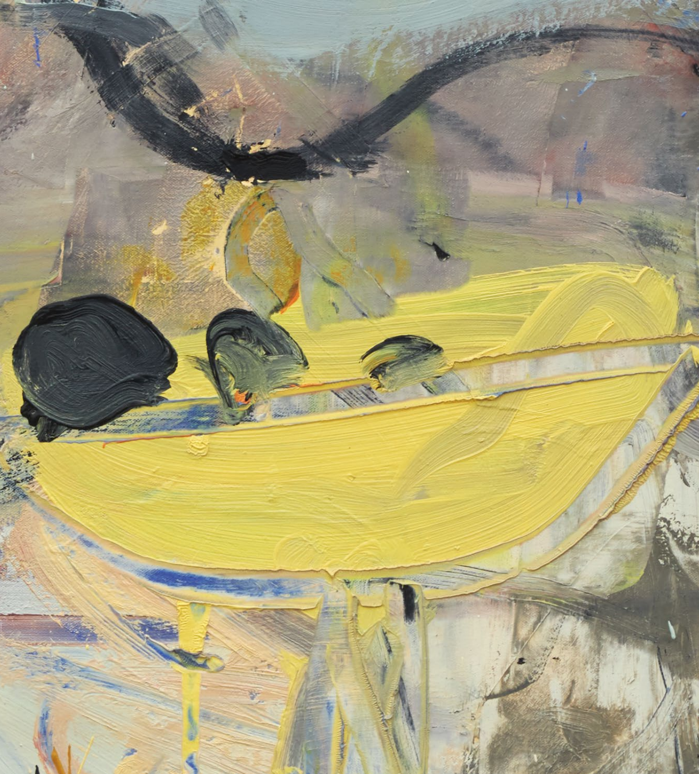
Roy Oxlade Untitled , 1991 Oil on canvas Unframed: 101 x 122 cm (39 3 / 4 x 48 1 / 8 in) Framed: 104.5 x 125 cm (41 1 / 8 x 49 1 / 4 in) (AJG-ROx-00093)