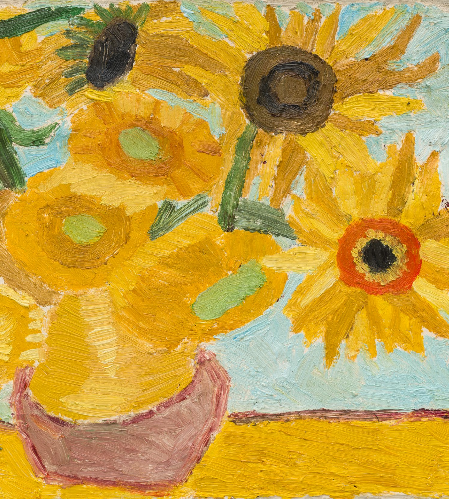
Sophie Barber Vincent's Sunflowers , 2024 Oil, oil stick on canvas 36 x 49 x 7 cm (14 1/8 x 19 1/4 x 2 3/4 in) (AJG-SBa-00259)