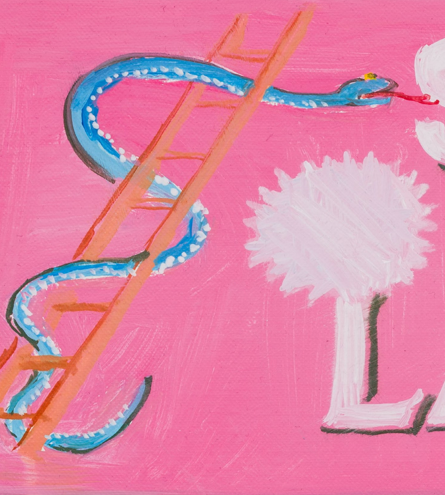
Alessandro Raho Snakes and Ladders , 2024 Oil on canvas 25 x 40 cm (9 7 / 8 x 15 3 / 4 in) (AJG-AR-00385)