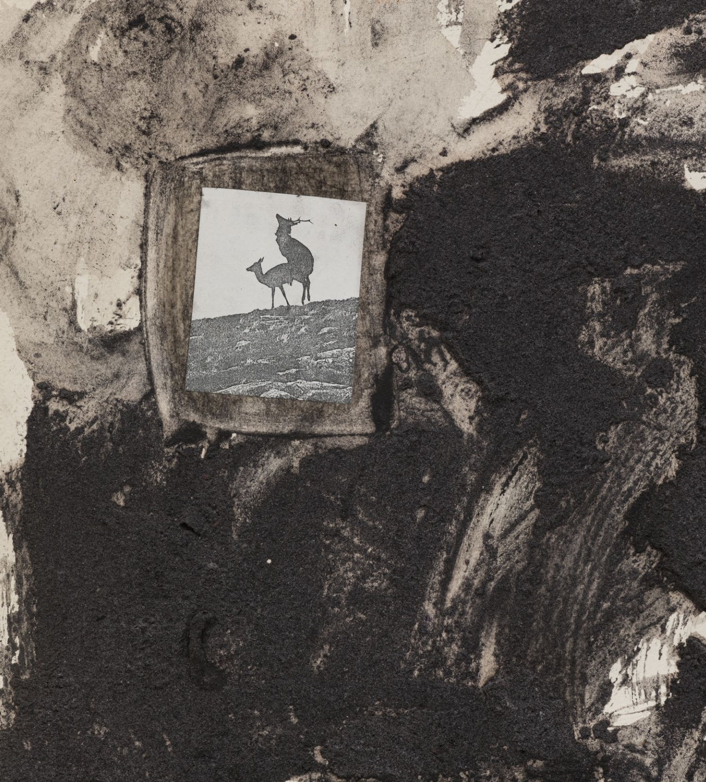
Lady Day , 1989 Acrylic, photograph collage, magazine cutting on paper Framed: 69 x 107 cm (27 1/8 x 42 1/8 in) (AJG-DL-00044)