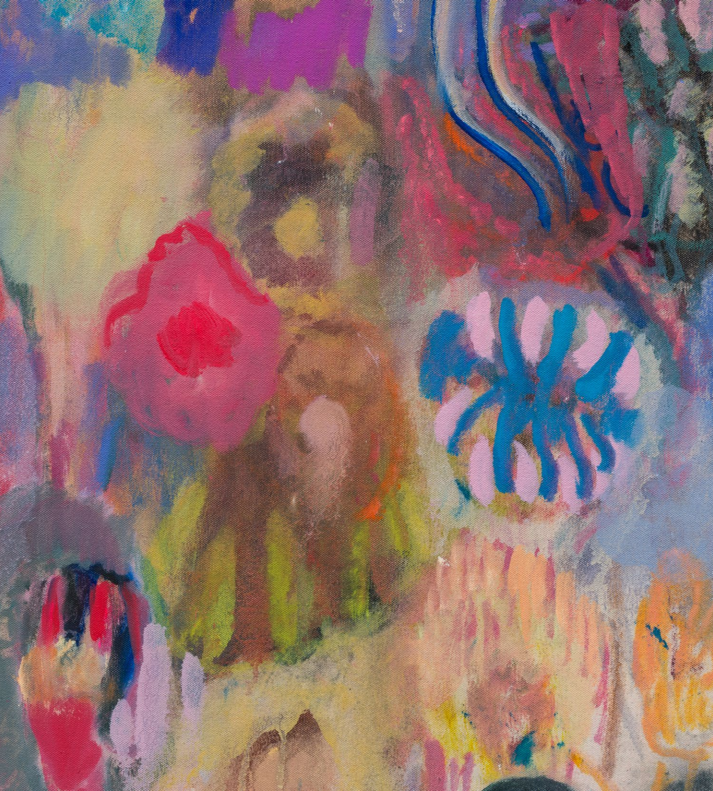
Lorna Robertson And what is the summer saying? , 2024 Oil on canvas Unframed: 90 x 80 cm (35 3 / 8 x 31 1 / 2 in) Framed: 94 x 84 cm (37 x 33 1 / 8 in) (AJG-LR-00068)