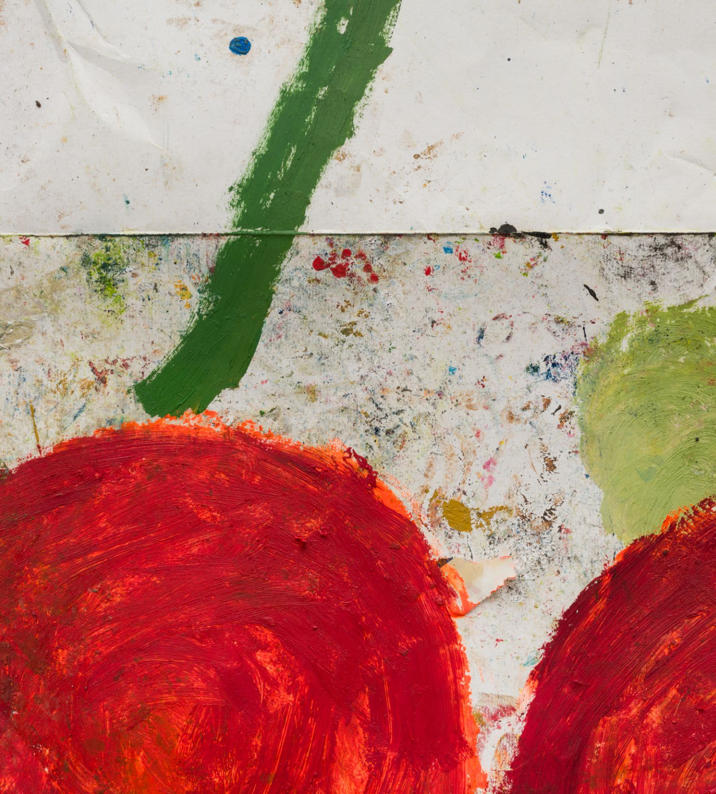
Sophie Barber The British champion , 2024 Oil on paper Unframed: 83 x 59 cm (32 5 / 8 x 23 1 / 4 in) (AJG-SBa-00257)