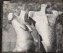
Dynasty, The Birth of Empire (The Birth of Empire #2) , 1989 Acrylic, photograph collage, fur on canvas Framed: 111 x 135.7 x 5.6 cm (43 3/4 x 53 3/8 x 2 1/4 in) (AJG-DL-00027)