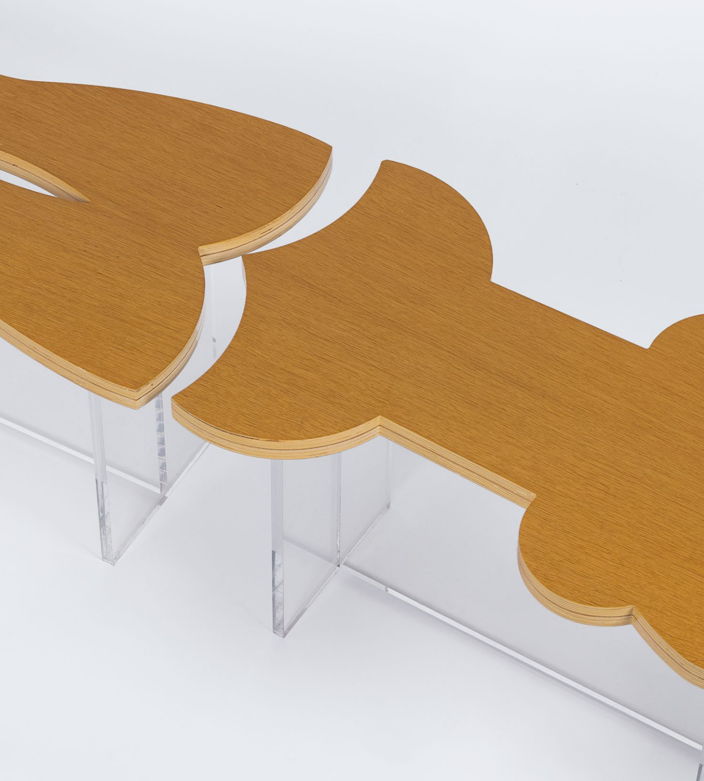
Nicola L. La Femme Coffee Table , 1969/2015 Plywood, plexiglass 34.9 x 295.9 x 73.7 cm (13 ¾ x 116 ½ x 29 ⅛ in) (AJG-NL-00033)