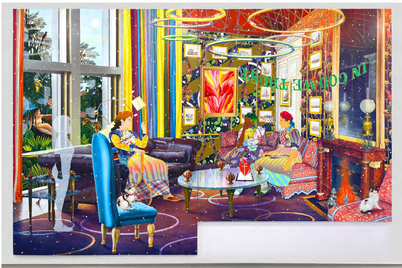
Tomokazu Matsuyama Come Away With Me , 2024 Acrylic and mixed media on canvas 279 x 427 cm 110 x 168 in