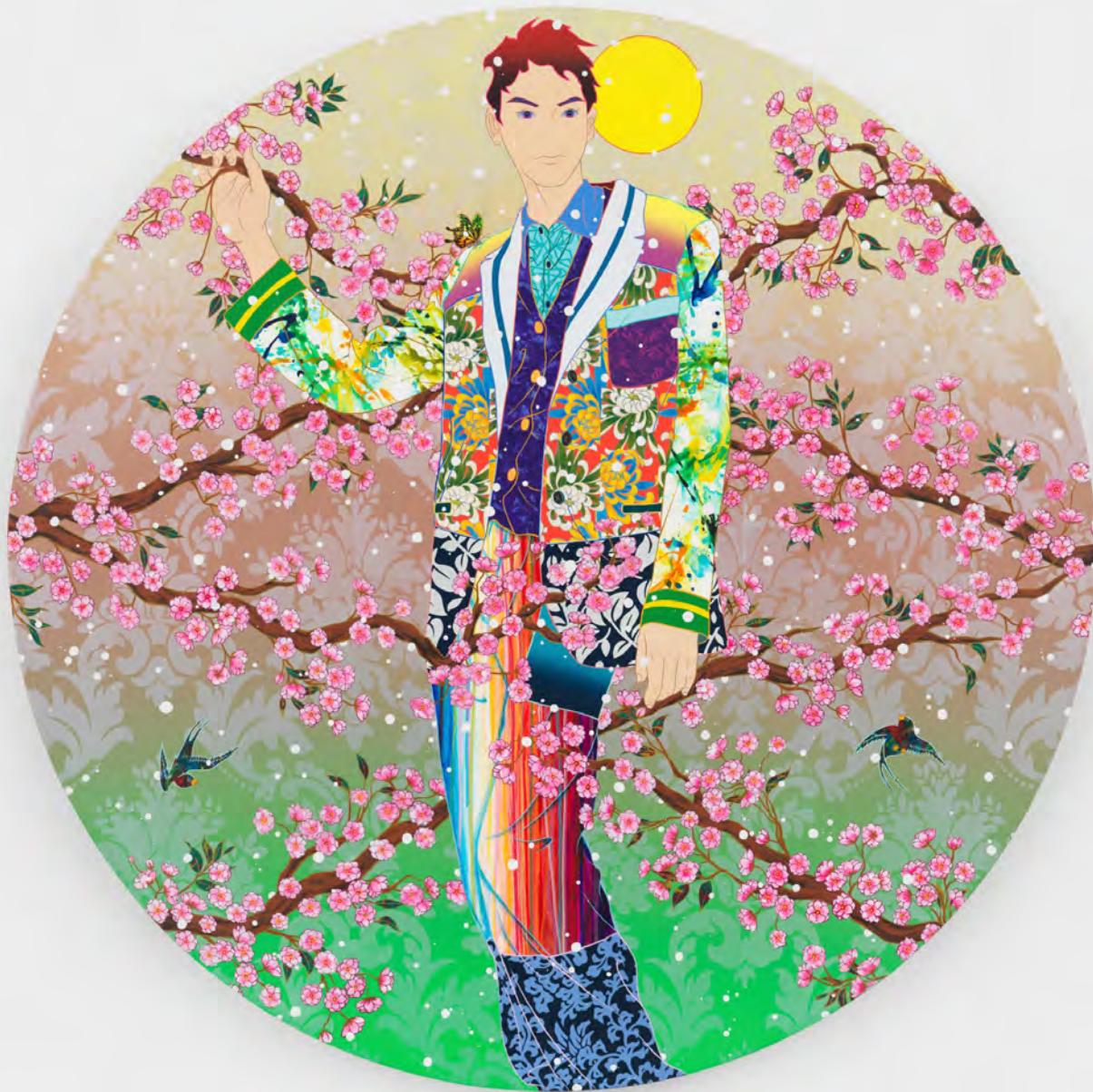
Tomokazu Matsuyama Blending Hemisphere, 2024 Acrylic and mixed media on canvas 137 cm (diameter) 54 in (diameter)