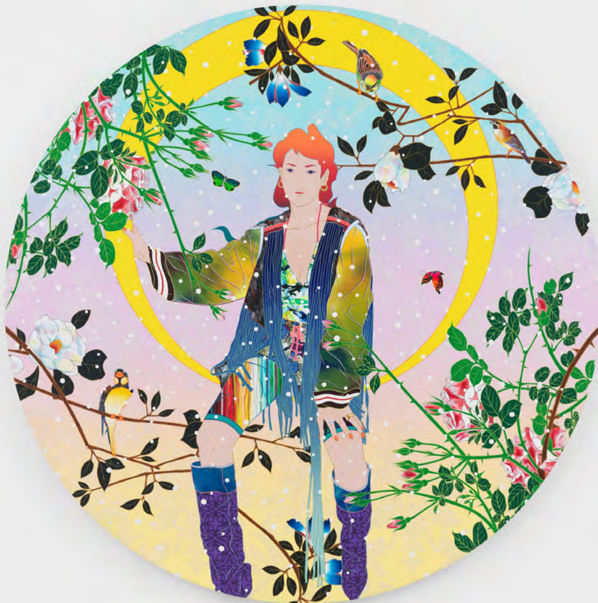
Tomokazu Matsuyama Resonance Release , 2024 Acrylic and mixed media on canvas 137 cm (diameter) 54 in (diameter)