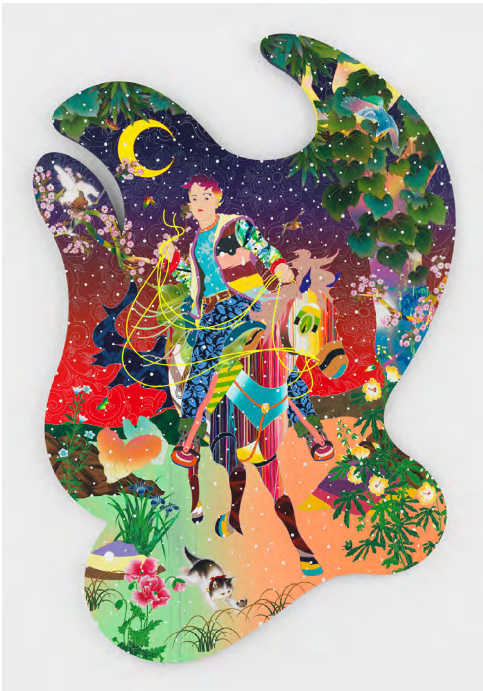
Tomokazu Matsuyama Victory Song Unsee , 2024 Acrylic and mixed media on canvas 277 x 189 cm 109 x 74 in