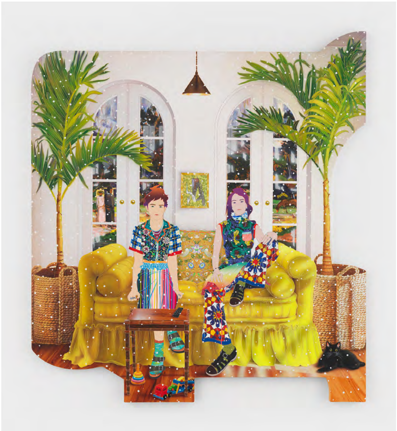
Tomokazu Matsuyama Drift Confidence Rippling , 2024 Acrylic and mixed media on canvas 203 x 183 cm 80 x 72 in