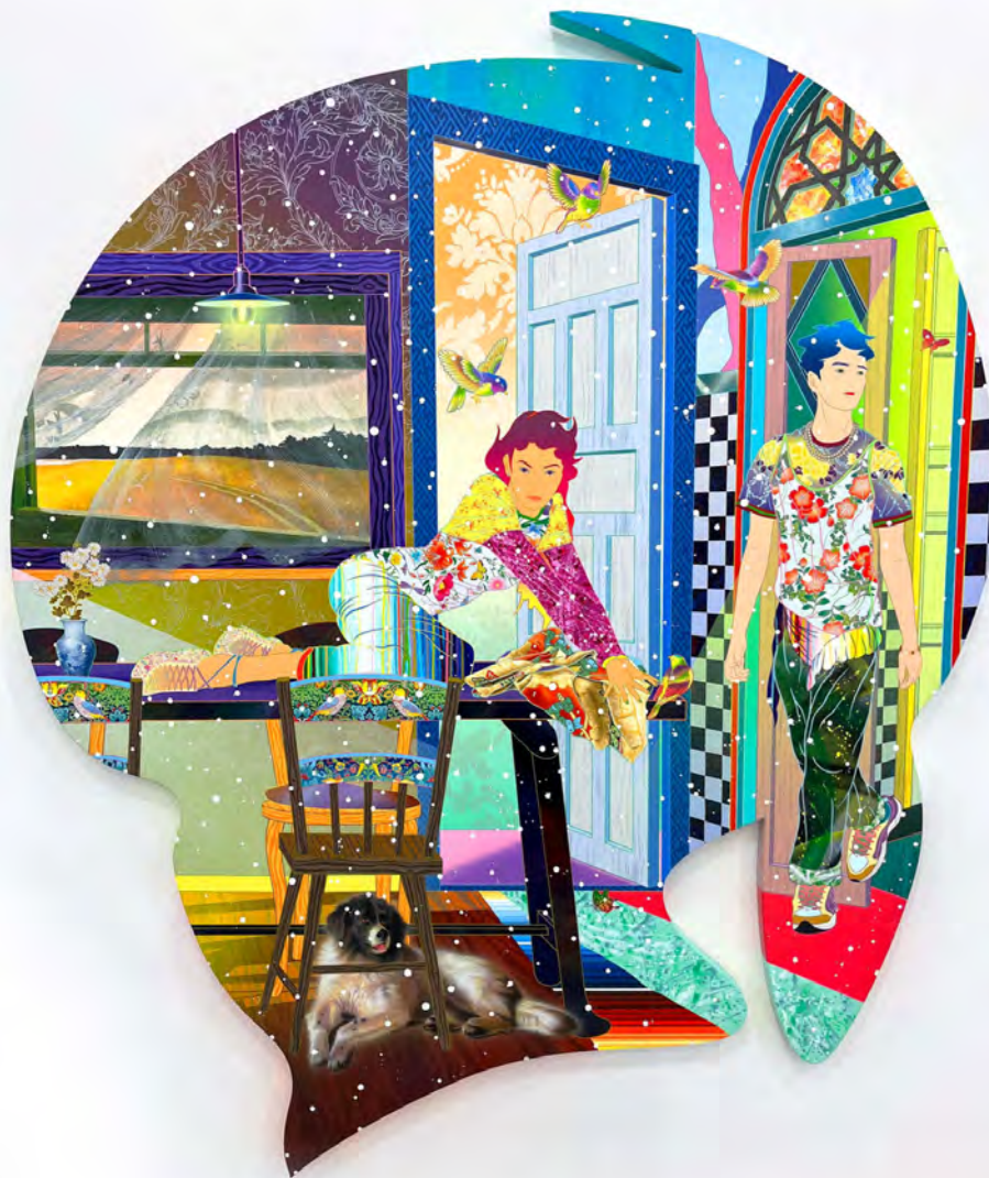
Tomokazu Matsuyama Porcelain Glowing Equilibre , 2024 Acrylic and mixed media on canvas 203 x 170 cm 80 x 67 in