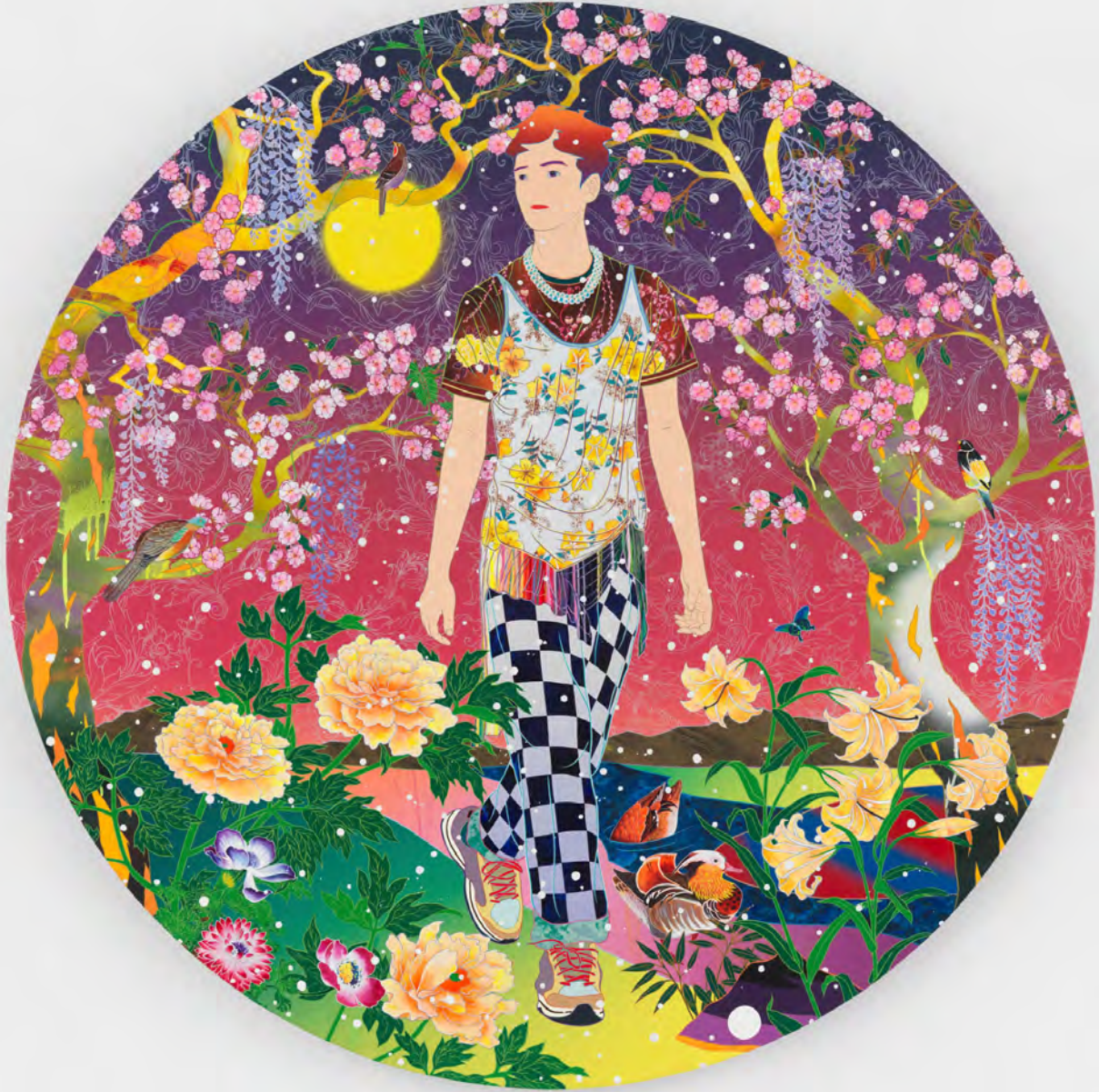
Tomokazu Matsuyama Stillness Farscapes , 2024 Acrylic and mixed media on canvas 152 cm (diameter) 60 in (diameter)