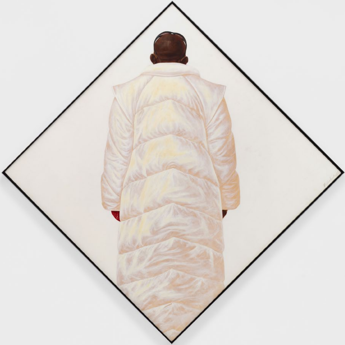
Barkley L. Hendricks | Omar | 1981 | Oil and acrylic on linen 48 3/4 x 48 3/4 x 2 inches (square framed) | 67 X 68 x 2 inches (installed) | #BH81.006 | $5,500,000