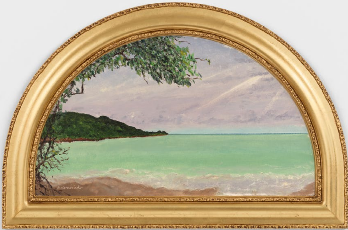
Barkley L. Hendricks | Crocodile Head at Fort Charles | 2000 | Oil on canvas 19 x 28 7/8 x 1 1/8 inches (framed) | #BH00.011 | $125,000