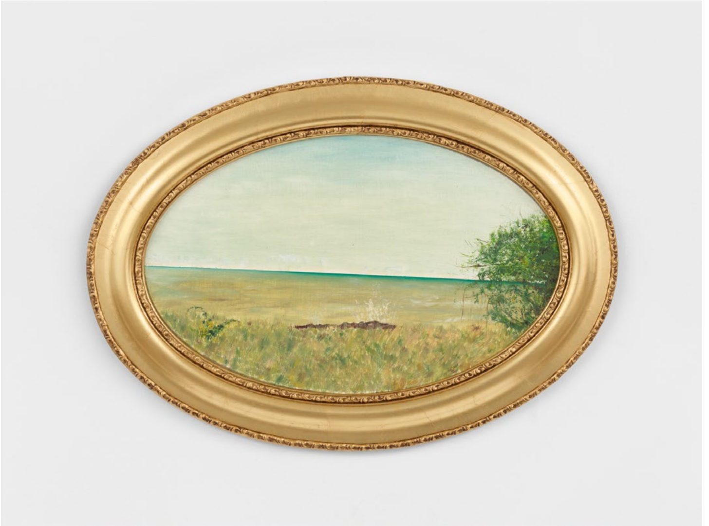
Barkley L. Hendricks | Dead Shark Beach | 2011 | Oil on canvas | 18 x 25 1/4 x 1 1/8 (framed) | #BH11.006 | $125,000