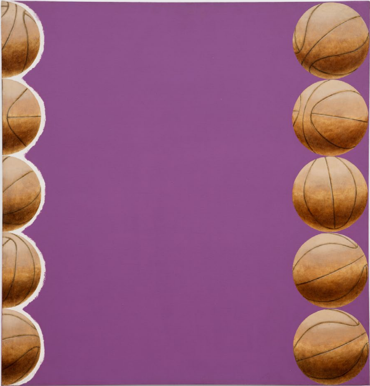
Barkley L. Hendricks | The Virgin | 1969 | Oil and acrylic on canvas | 48 3/8 x 46 1/8 x 1 1/2 inches | #BH69.008 | $1,200,000 | RESERVED