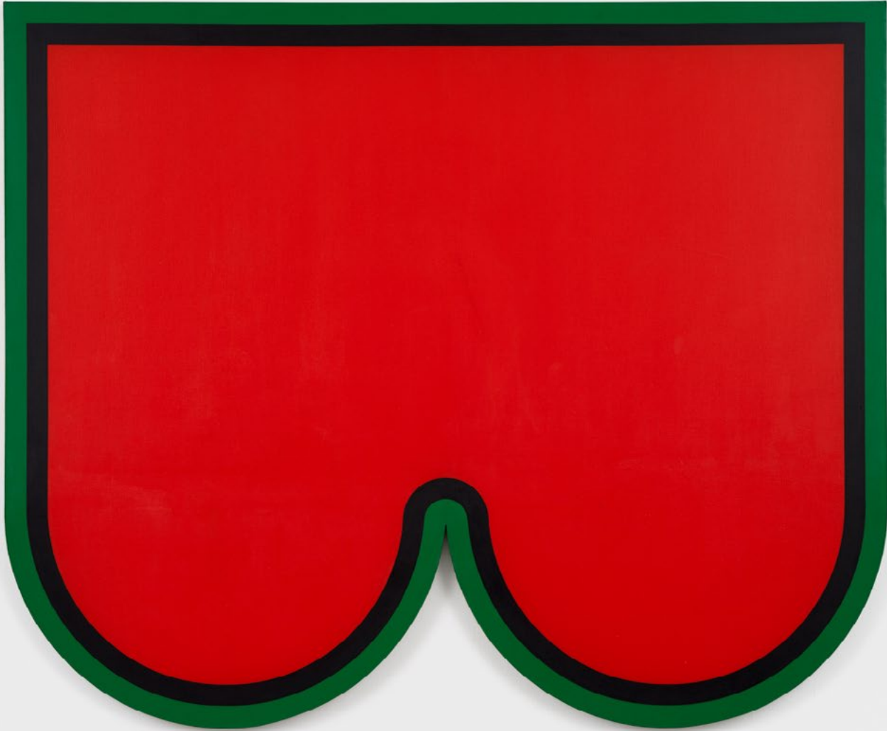
Barkley L. Hendricks | I Want to Take You Higher | 1970 | Acrylic on canvas | 69 x 83 3/8 x 1 5/8 inches | #BH70.004 | $2,000,000