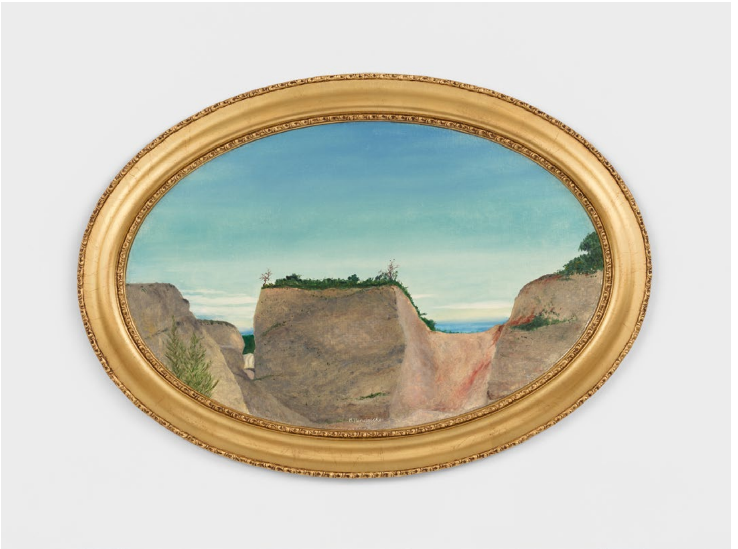
Barkley L. Hendricks | Quarry Shortcut | 2008 | Oil on canvas | 23 1/4 x 33 x 1 1/4 inches (framed) | #BH08.009 | $125,000