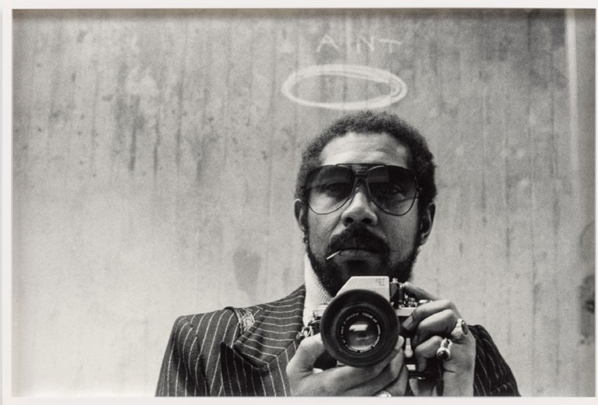
Barkley L. Hendricks | Untitled (Self-Portrait) | 1975 Silver gelatin LE/Selenium print | 16 1/2 x 24 1/2 x 1 1/2 inches (framed) | Edition of 5, with 2 AP | #BH75.073 | $20,000