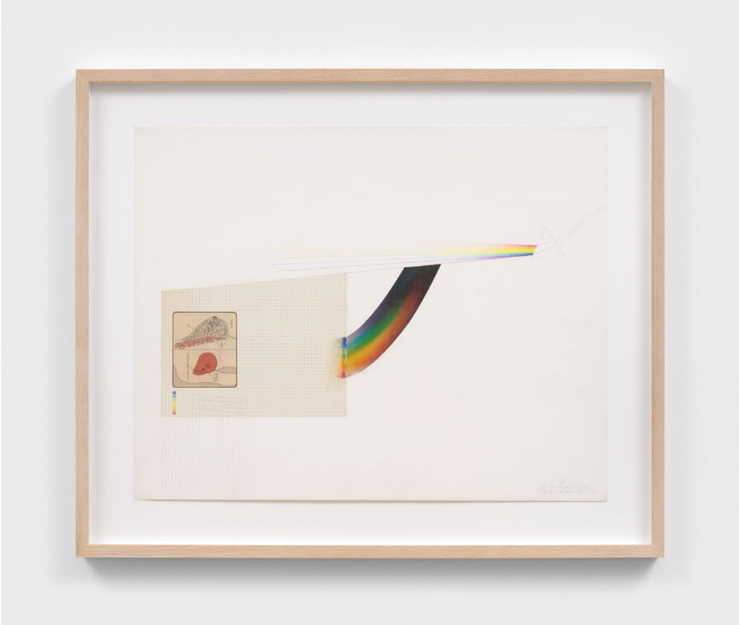
Barkley L. Hendricks | Lymph Nodes and Spares Ribs | 1974 Collage elements, color crayon, graphite, watercolor | 28 5/8 x 34 5/8 x 1 1/2 inches (framed) | #BH74.012 | $55,000