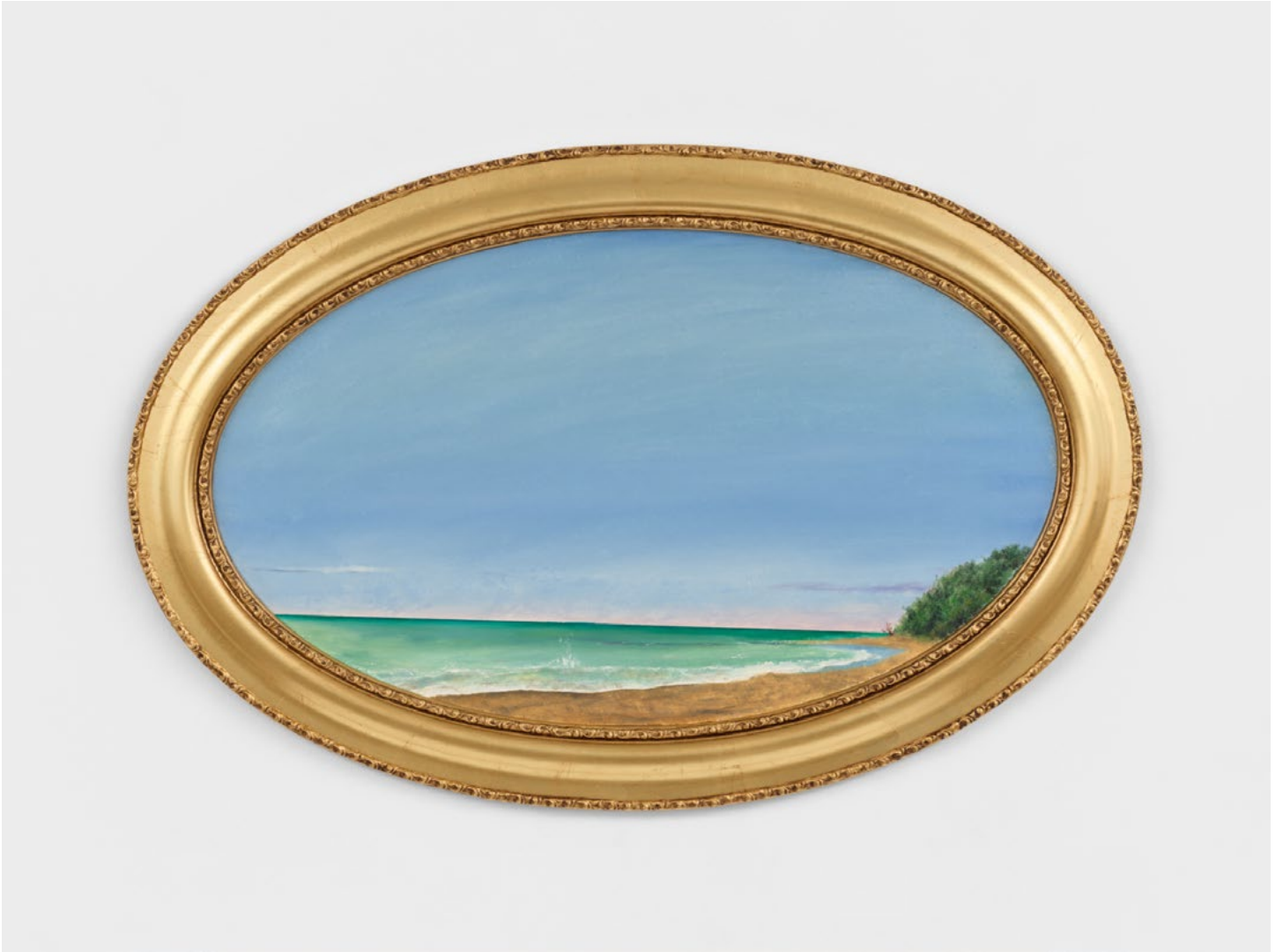
Barkley L. Hendricks | Beautiful Day at Fort Charles | 2008 | Oil on canvas | 21 1/2 x 33 x 1 1/8 inches (framed) #BH08.010 | $125,00 | RESERVED