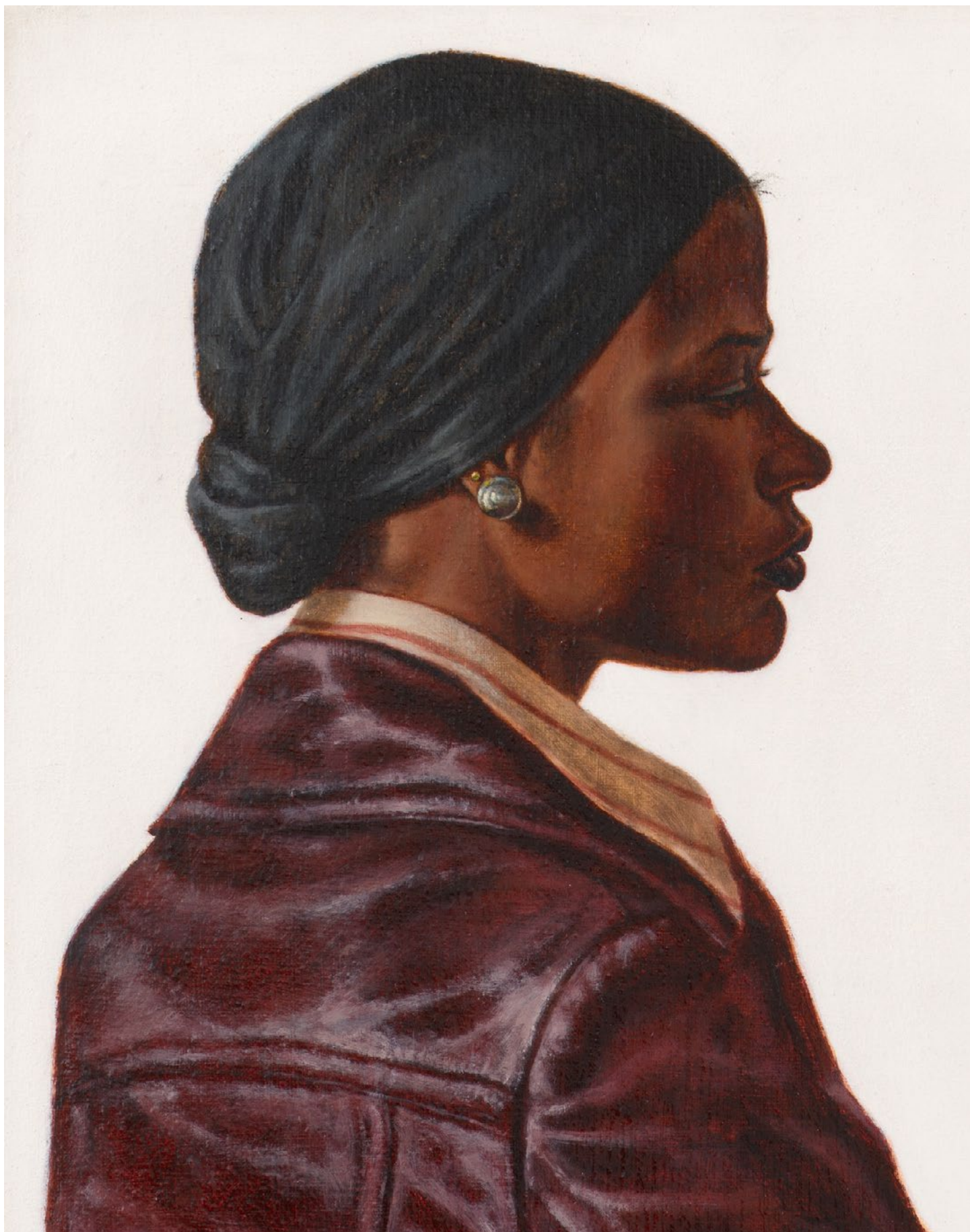
Detail view | Barkley L. Hendricks | Brenda's Sister, Barbara Jean | 1977 Oil, acrylic and Magna paint on linen canvas | 52 3/8 x 52 3/8 x 2 1/8 inches (framed) | #BH77.024 | Please Inquire