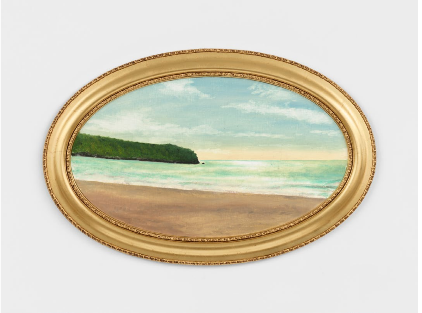
Barkley L. Hendricks | Great Bay New Years Eve Day | 2011 | Oil on canvas 21 3/8 x 33 x 1 1/8 inches (framed) | #BH11.007 | $125,000