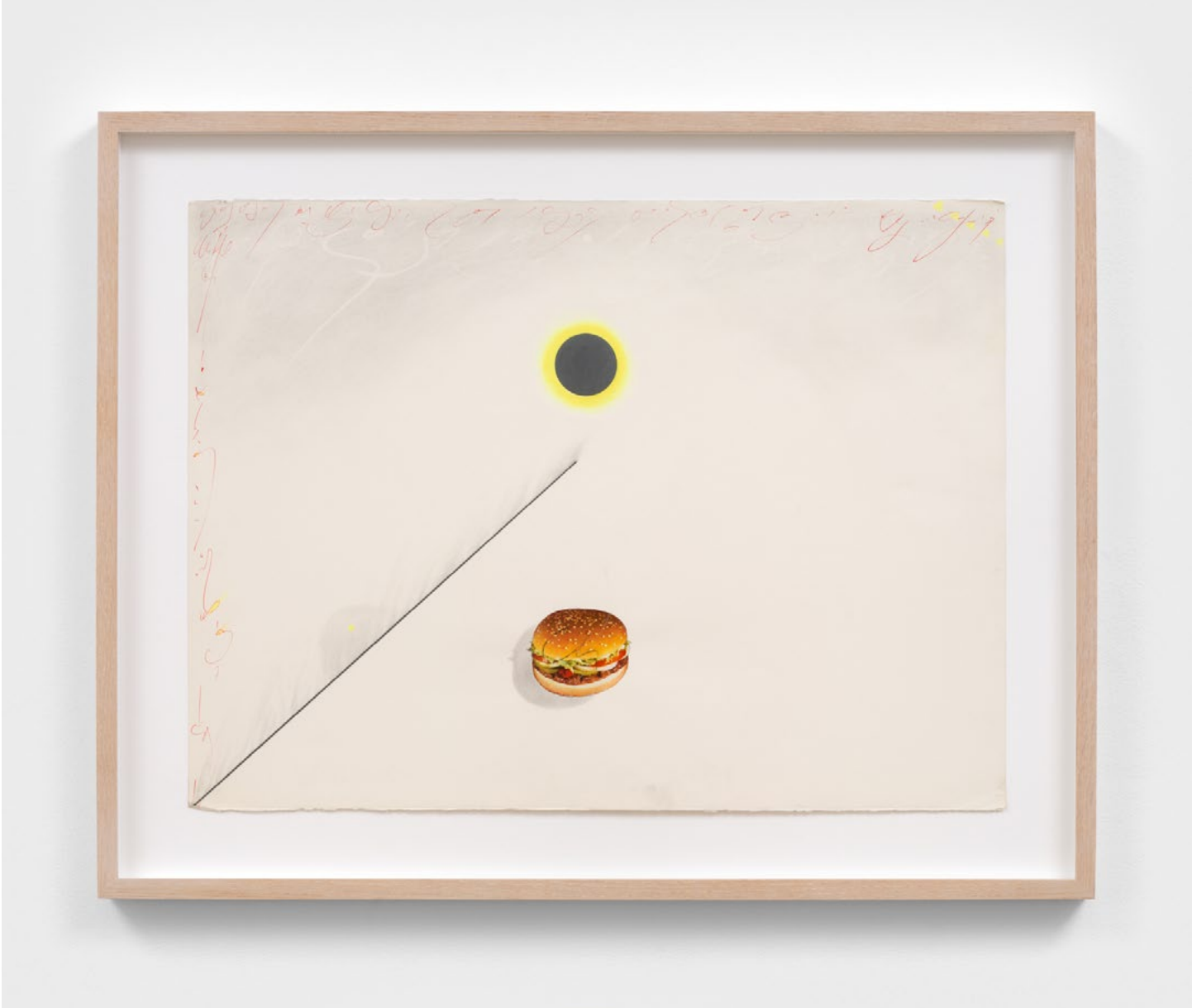
Barkley L. Hendricks | Eclipse (Mingus Series) #1 | 1980 Graphite, collage element, ink, glow stick on paper | 28 5/8 x 36 3/8 x 1 1/2 inches (framed) | #BH80.044 | $55,000