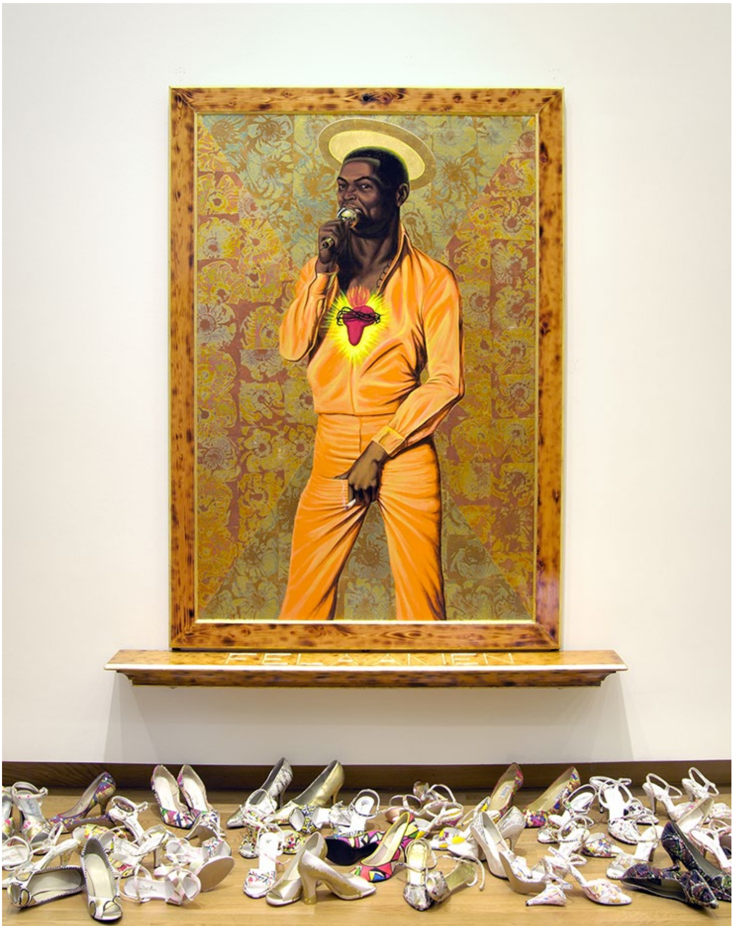
Barkley L. Hendricks | Fela: Amen, Amen, Amen, Amen... | 2002 | Oil and variegated leaf on linen canvas, hand-carved (by artist) and burned wooden frame, altarpiece armature, 27 pairs of high heels | 66 3/4 x 46 3/4 inches with 60 inch altarpiece | #BH09.005 | NFS