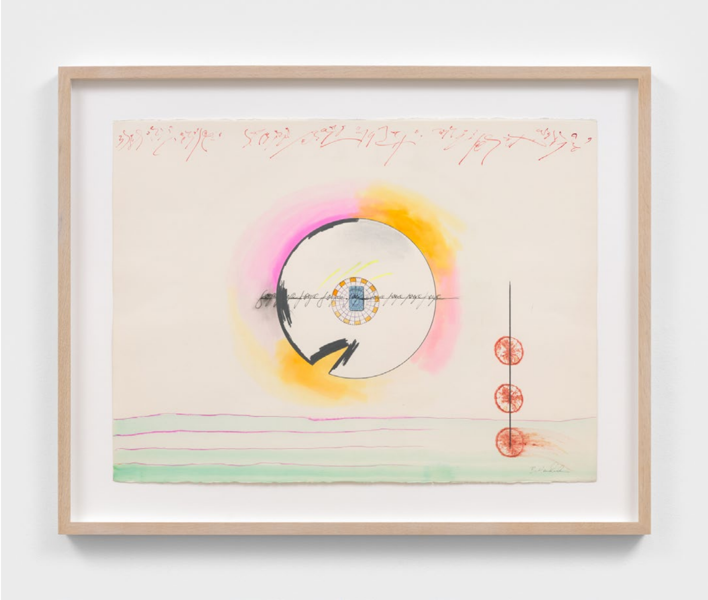
Barkley L. Hendricks | Salvation Army Joyce on 78 Speed | 1979 Ink and color pencil on paper | 28 5/8 x 36 3/8 x 1 1/2 (framed) | #BH79.093 | $55,000