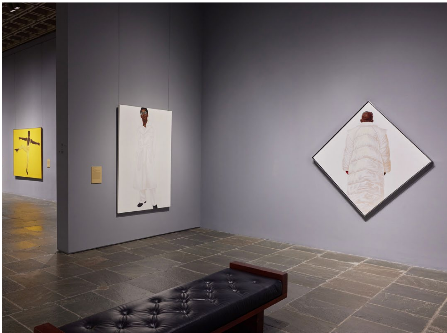
Barkley L. Hendricks | Omar | 1981 | Oil and acrylic on linen 48 3/4 x 48 3/4 x 2 inches (square framed) | 67 X 68 x 2 inches (installed) | #BH81.006

Installation view, Barkley L. Hendricks: Portraits at the Frick , September 21, 2023 – January 7, 2024, The Frick Collection, New York, NY