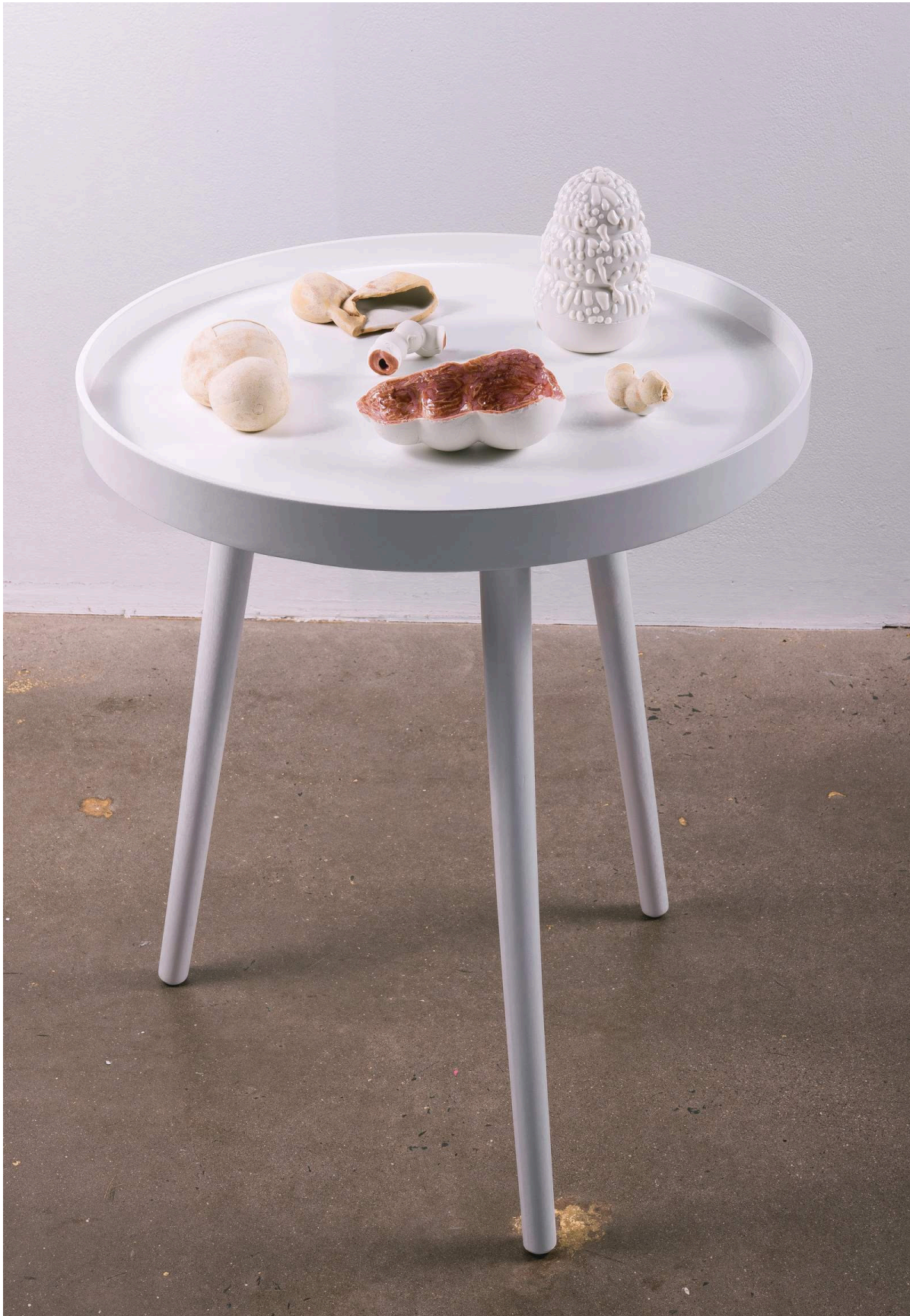
Ilana Harris-Babou Soft Interior 1 , 2024 Glazed ceramic, table 28½ x 19½ x 19½ in. $ 15,000 USD