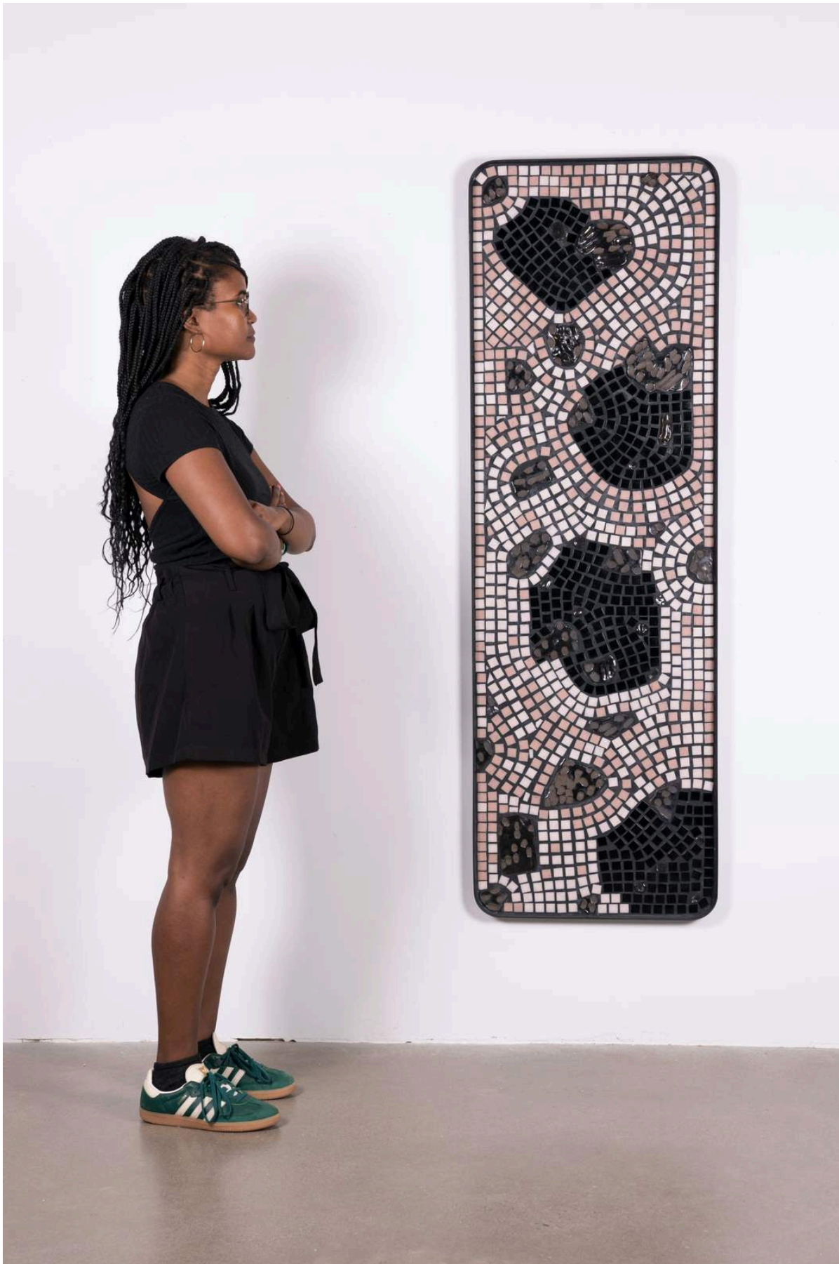
Installation view of Wayfinding Device 1 (2024) with the artist