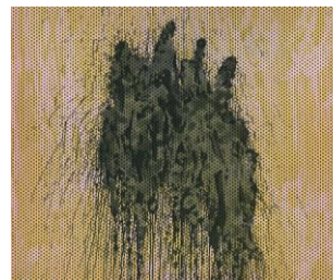
Untitled (pink/green), 2023

Color soap ground and spit bite aquatints with aquatint