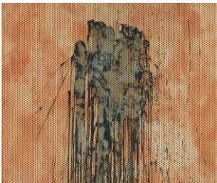
Untitled (sienna), 2023 Color soap ground and spit bite aquatints with aquatint Image size: 20 x 22" Paper size: 26½ x 28" Edition 15