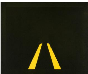
Mary Heilmann No Passing, 2017 Color aquatint Image size: 10 x 12" Paper size: 16 x 17" Edition 30