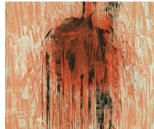
Untitled (orange), 2023

Color soap ground and spit bite aquatints with aquatint and drypoint