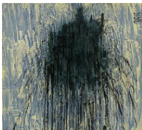
Untitled (blue), 2023

Color soap ground and spit bite aquatints with aquatint