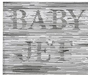
Ed Ruscha Baby Jet, 2023 Hard ground etching printed in black and blue Image size: 4½ x 5½" Paper size: 7¾ x 8½" Edition 40