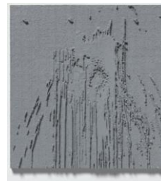
Untitled, 2024 Enamel on PLA Size: 10 x 17.5" Edition 6