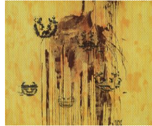
Untitled (yellow), 2023 Color soap ground, spit bite, and sugar lift aquatints with aquatint Image size: 20 x 22" Paper size: 26½ x 28" Edition 15