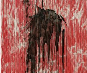
Untitled (red), 2023 Color soap ground aquatint with aquatint Image size: 20 x 22" Paper size: 26½ x 28" Edition 15