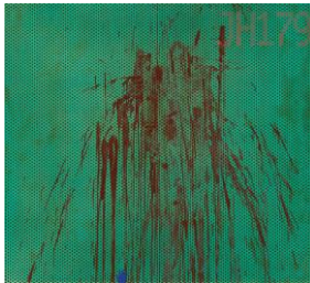
Untitled (green), 2023

Color soap ground and spit bite aquatints with aquatint and hand stenciling