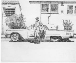
Robert Bechtle '60 T-Bird, 1967 Hard ground etching Image size: 7½ x 9" Paper size: 14¼ x 15" Edition 25