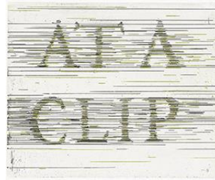
Ed Ruscha At a Clip, 2023 Hard ground etching printed in black and yellow Image size: 4½ x 5½" Paper size: 7¾ x 8½" Edition 40