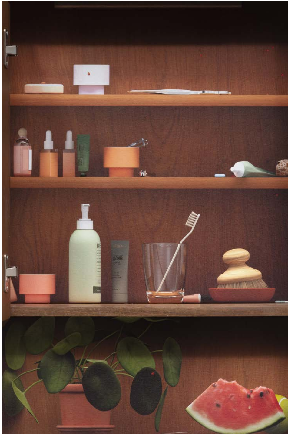
Erin Wright, Medicine Cabinet (detail), 2024