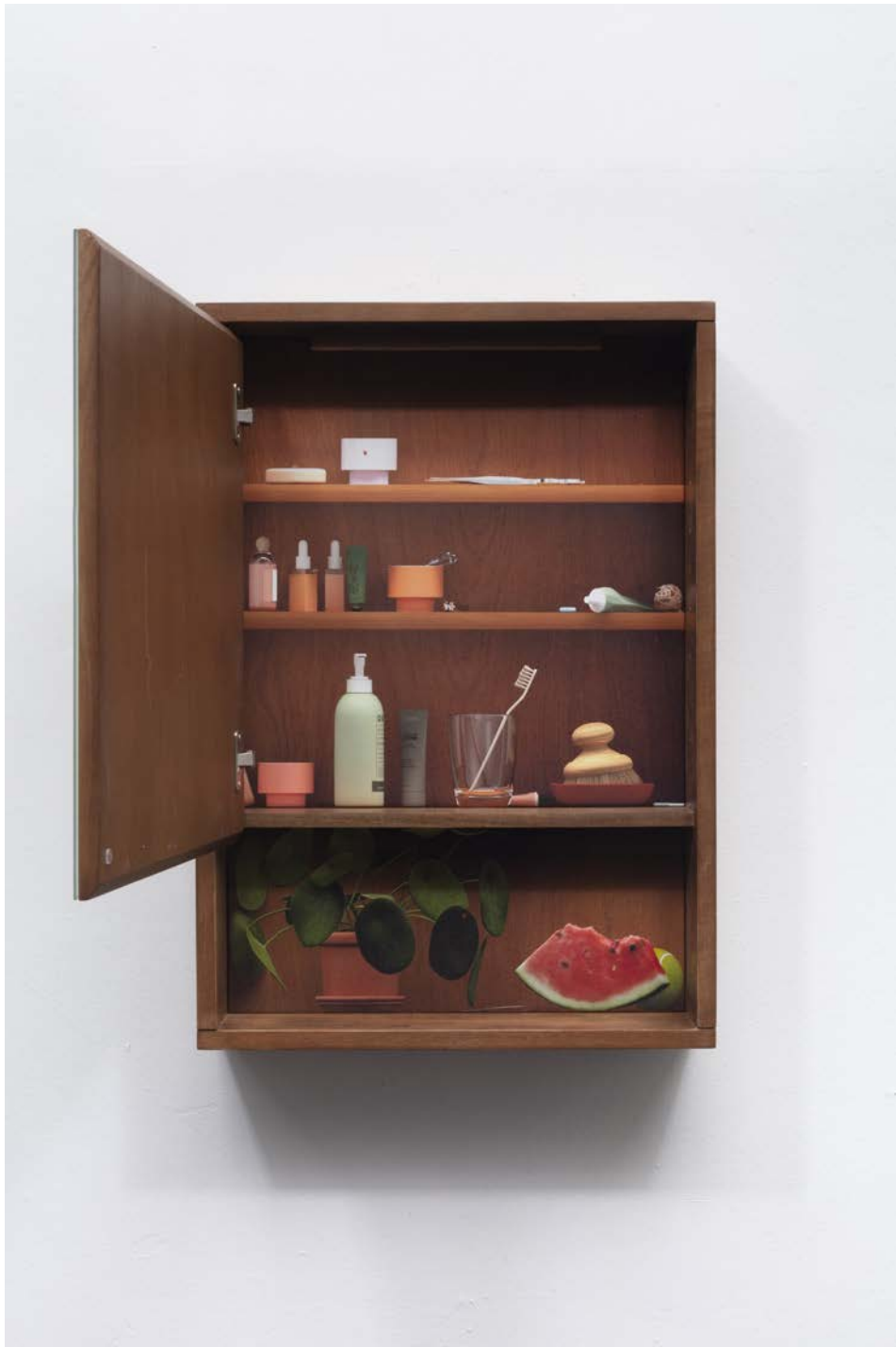
Erin Wright, Medicine Cabinet (detail), 2024