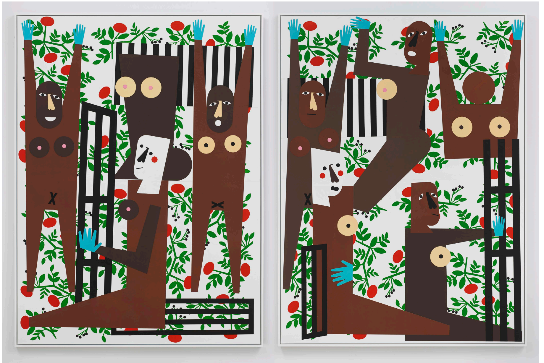
Nina Chanel Abney Untitled, 2022 Diptych collage on panel 82 x 60 inches, each (208.3 x 152.4 cm, each)