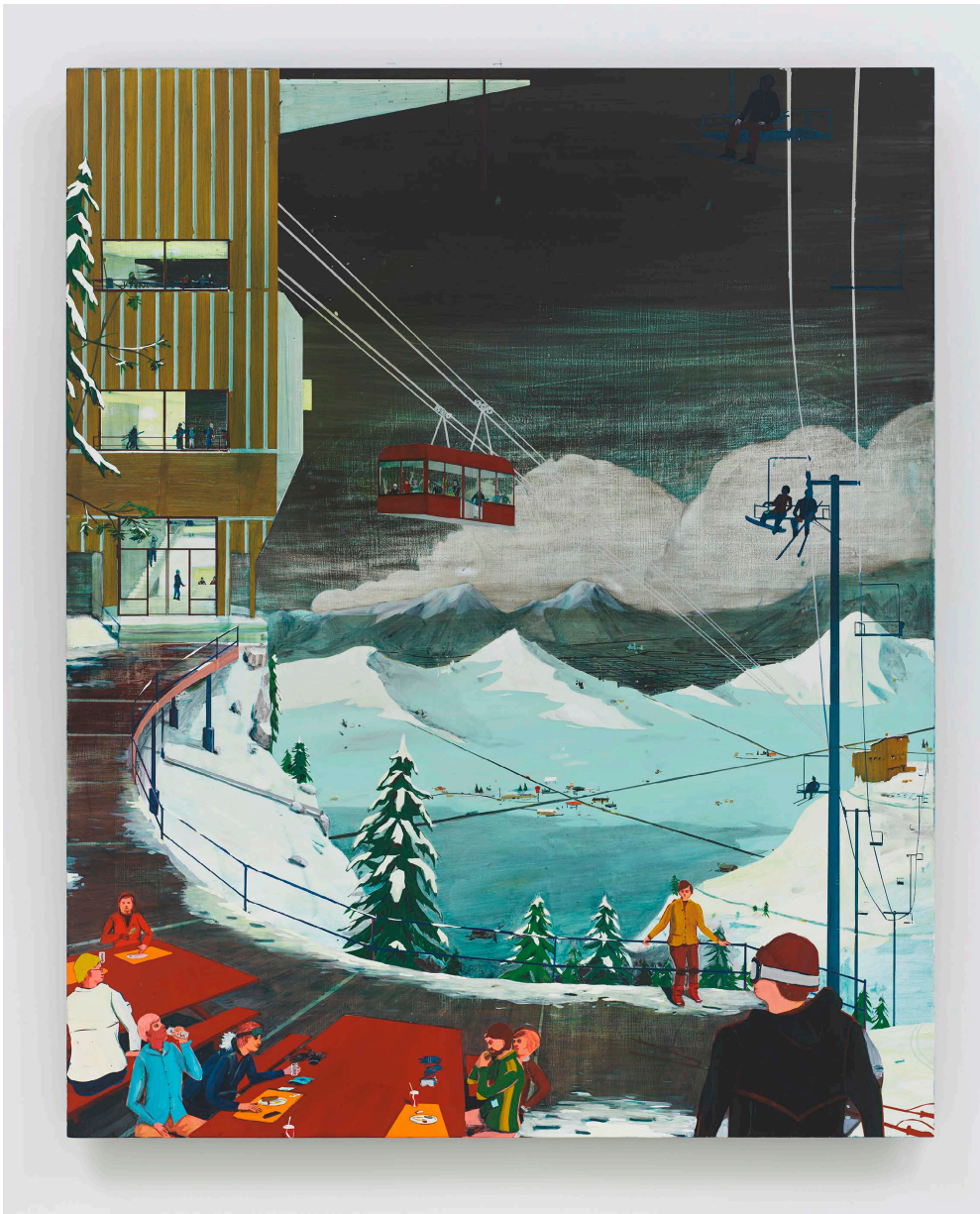
Jules de Balincourt After the Gold Rush , 2004 Oil and enamel on panel 65 x 44 inches (165.1 x 111.8 cm)