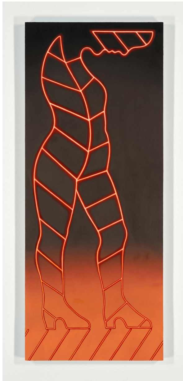
Sascha Braunig Backbone , 2016 Oil on linen over panel 54 x 22 inches (137.2 x 55.9 cm)