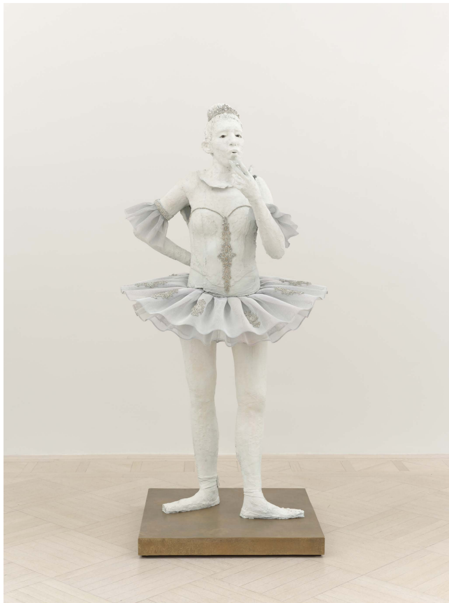
Karon Davis Smoking Ballerina , 2023 Bronze 39 x 39 x 72 inches (99.1 x 99.1 x 182.9 cm) Edition of 3, 2 APs