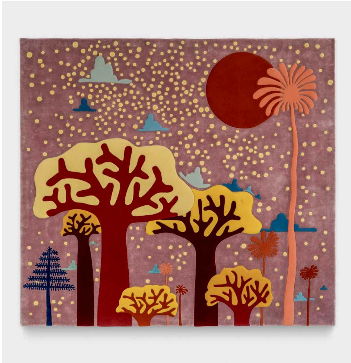
Haas Brothers Tree Hemingway , 2022 Wool rug 88 x 98 x 1.5 inches (223.5 x 248.9 x 3.8 cm) Edition 1 of 6, 2 APs