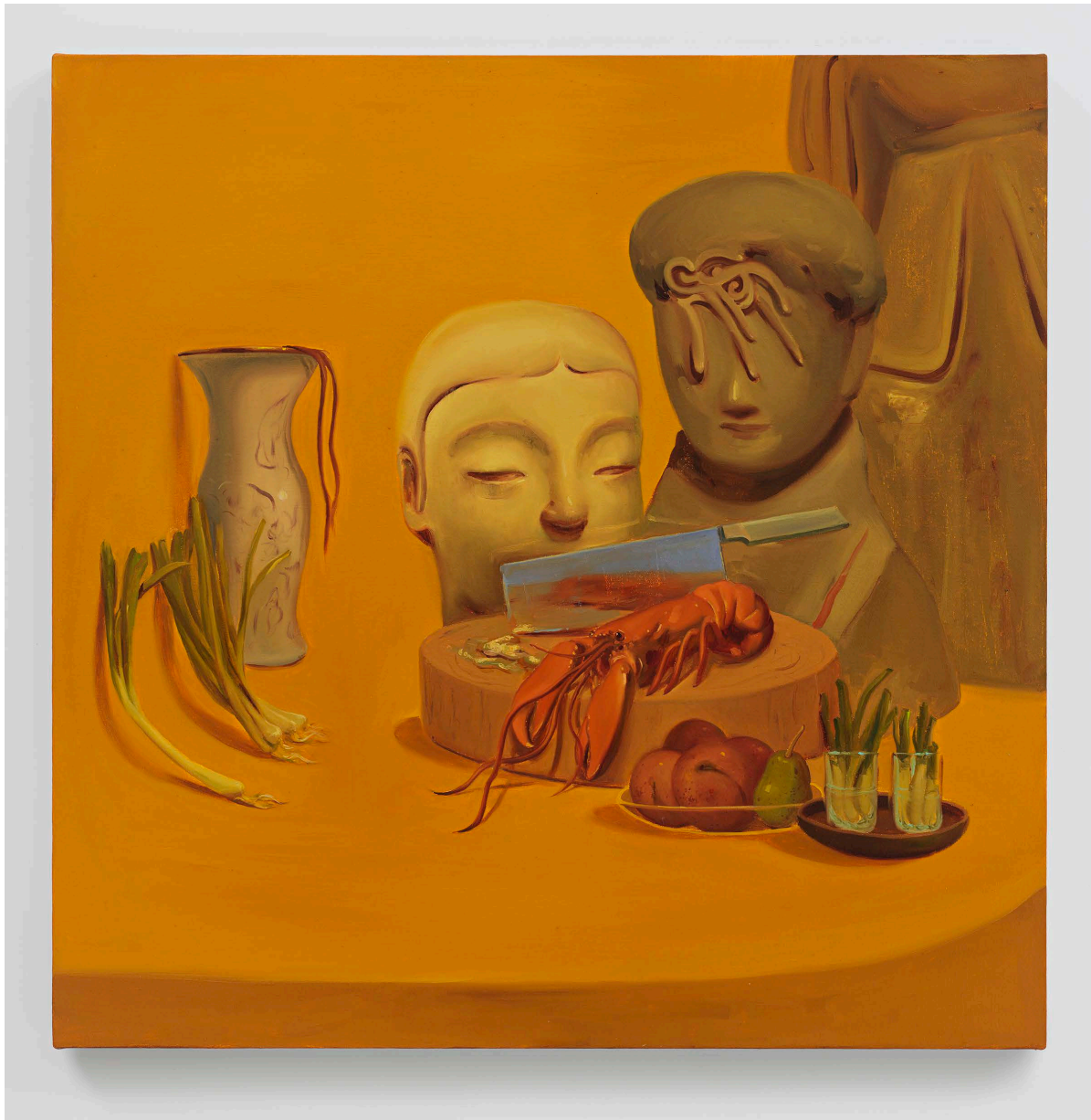
Dominique Fung Still Life with Lobster , 2020 Oil on canvas 39.7 x 39.7 inches (100.8 x 100.8 cm)