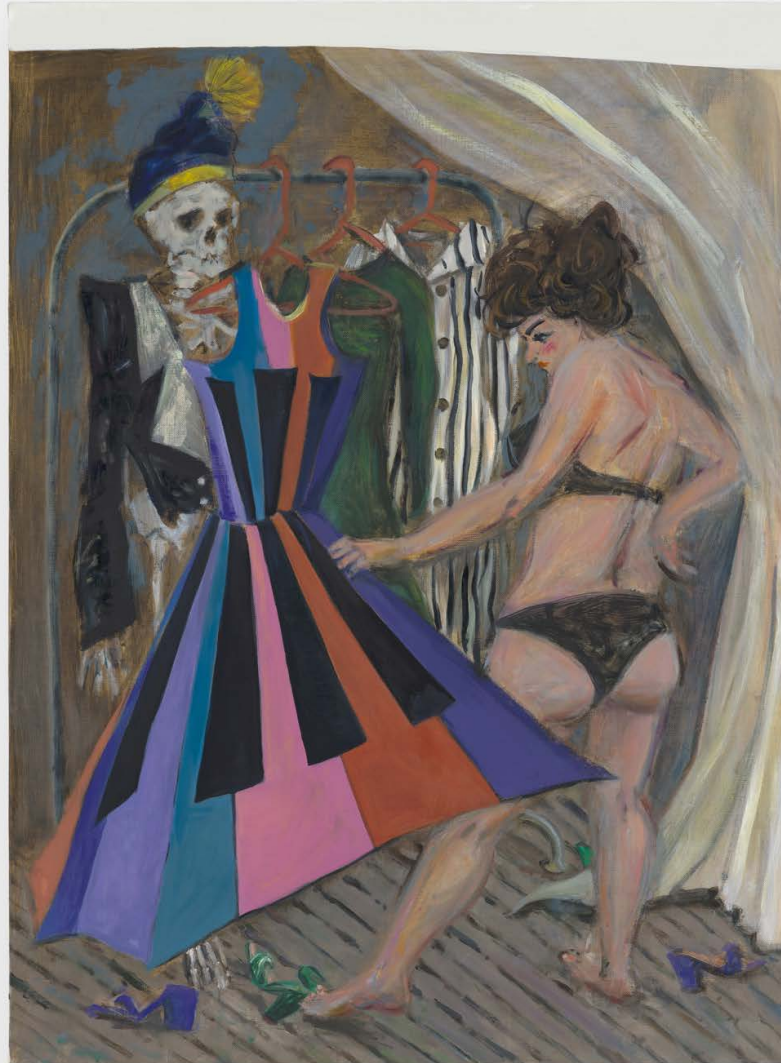
Ella Kruglyanskaya Skeleton Closet III , 2024 Oil on linen mounted on panel 30 x 22 inches (76.2 x 55.9 cm)