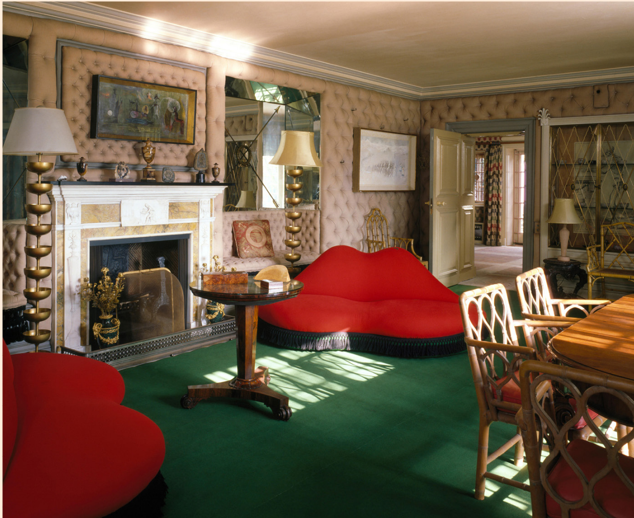
The drawing room at Edward James's Monkton House.