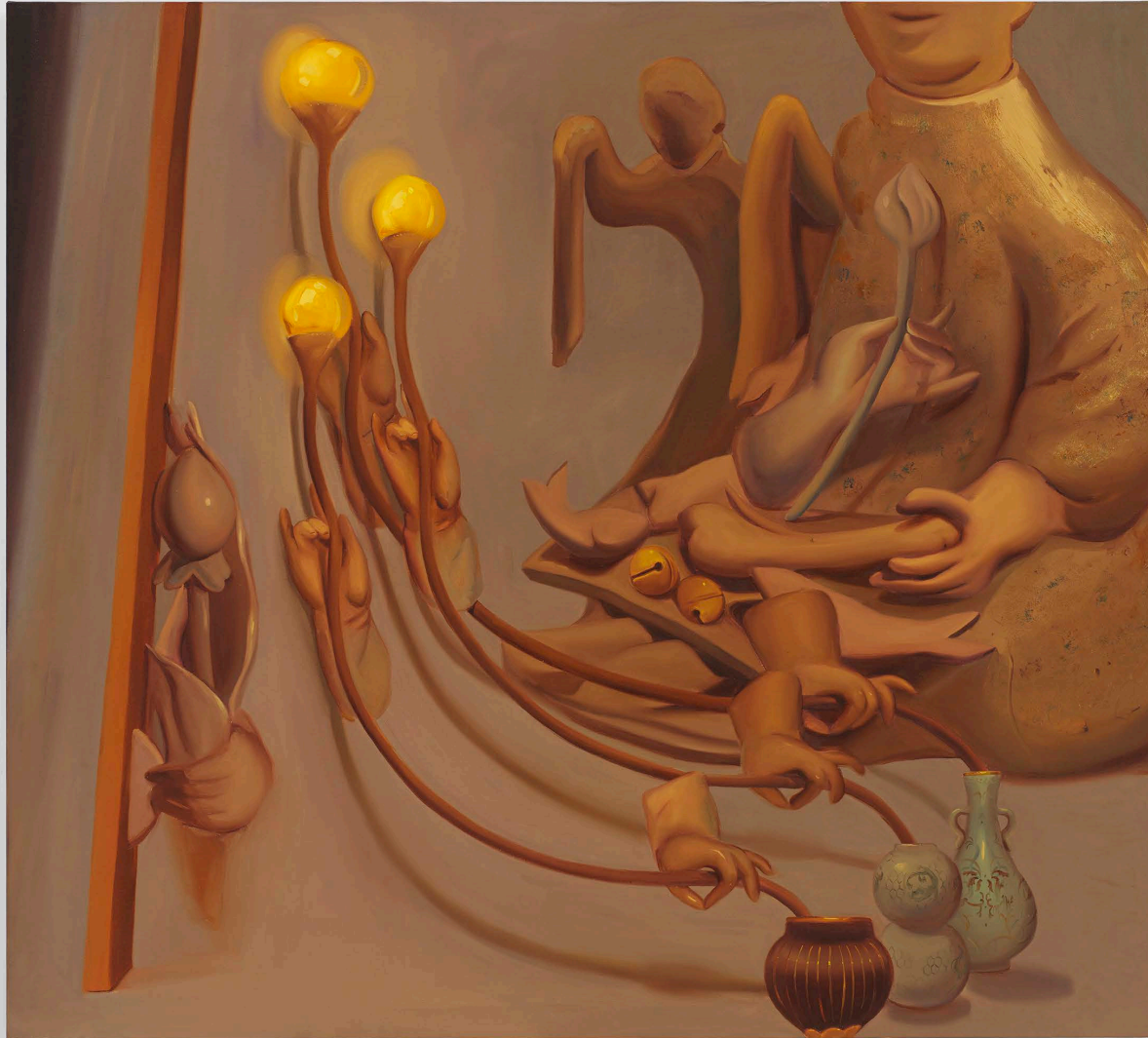
Dominique Fung Handbell , 2020 Oil on canvas 54 x 60 inches (137.2 x 152.4 cm)