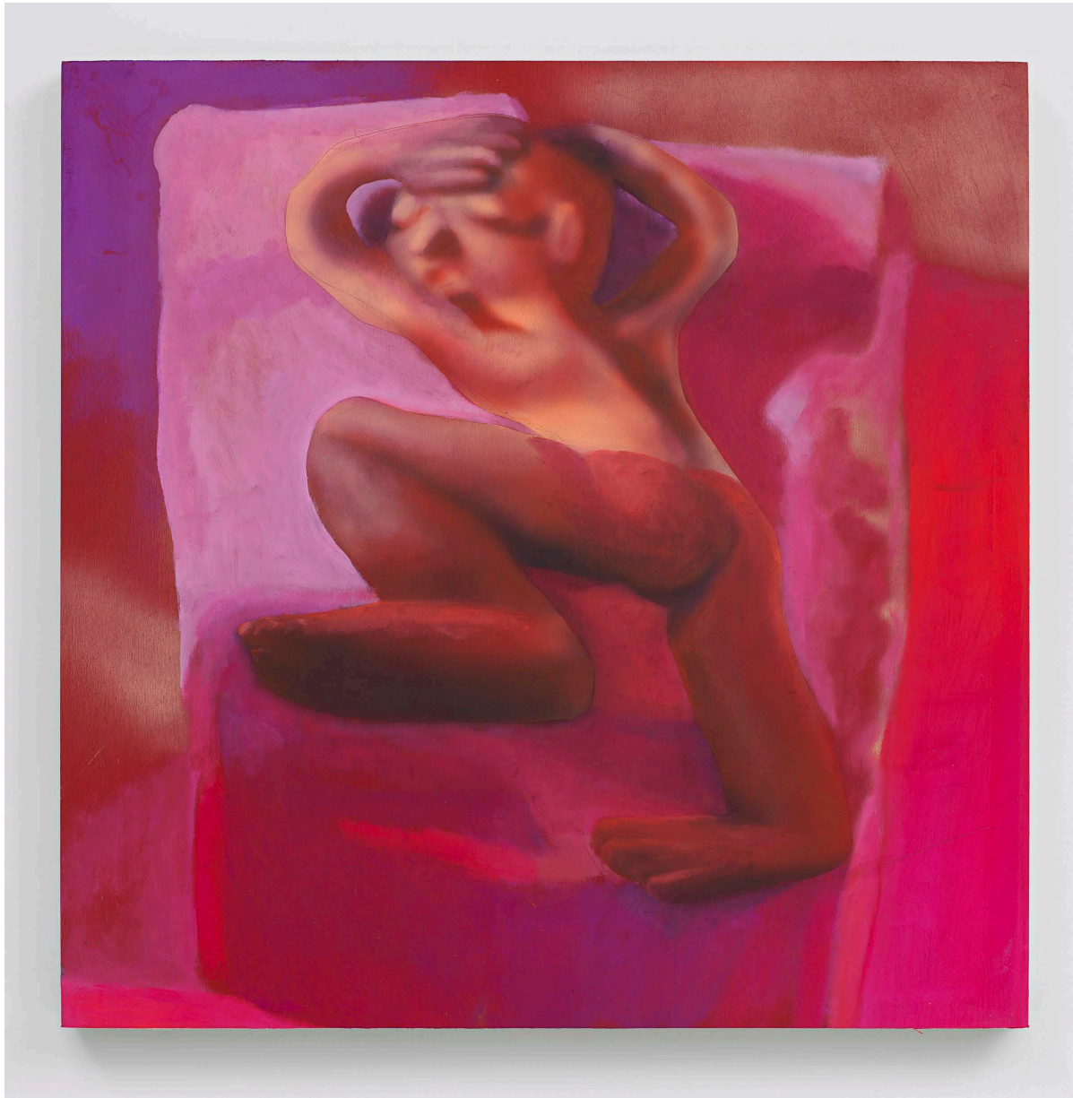
Austin Lee In Bed, 2024 Oil on wood 24 x 24 x 1 inches (61 x 61 x 2.5 cm)