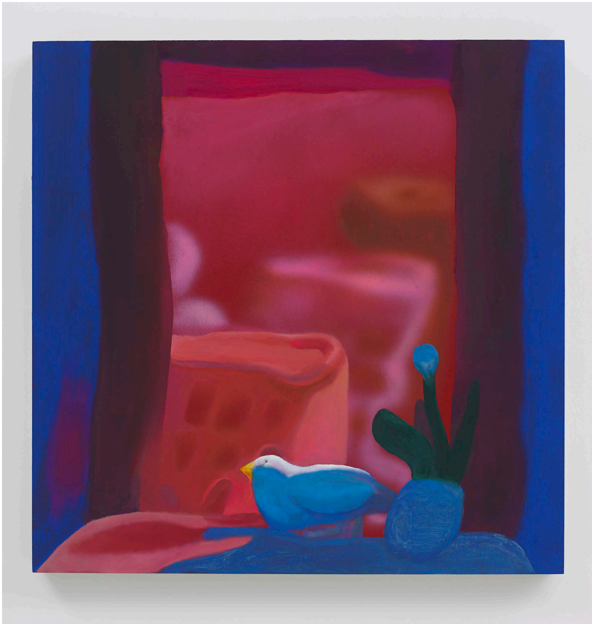
Austin Lee City with Bird , 2024 Oil on wood 24 x 24 x 1.63 inches (61 x 61 x 4.1 cm)