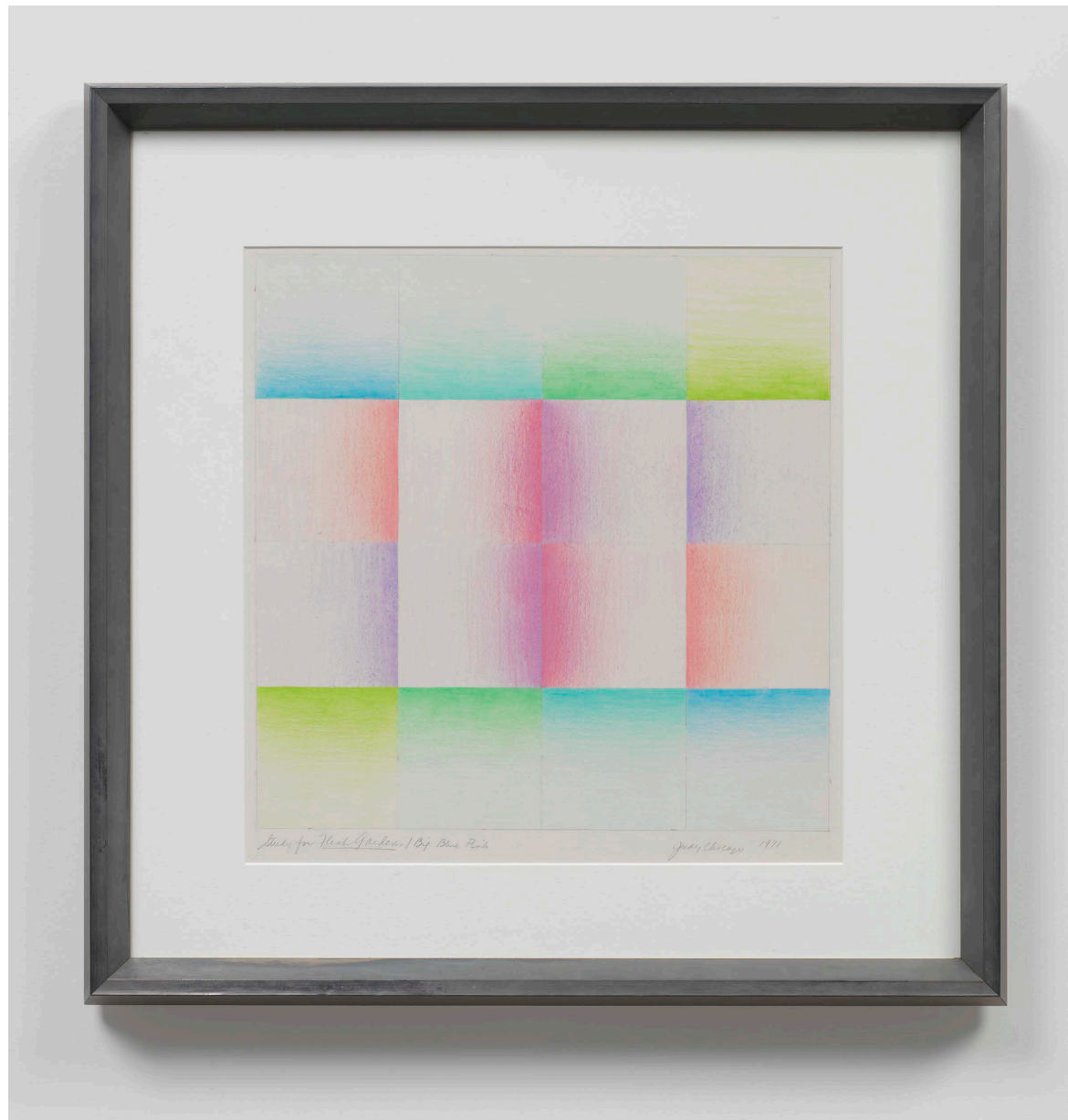
Judy Chicago Study for Flesh Gardens/Big Blue Pink , 1971 PrismaColor on paper 22 x 22 inches (55.9 x 55.9 cm) Framed: 24.25 x 24.25 inches (61.6 x 61.6 cm)