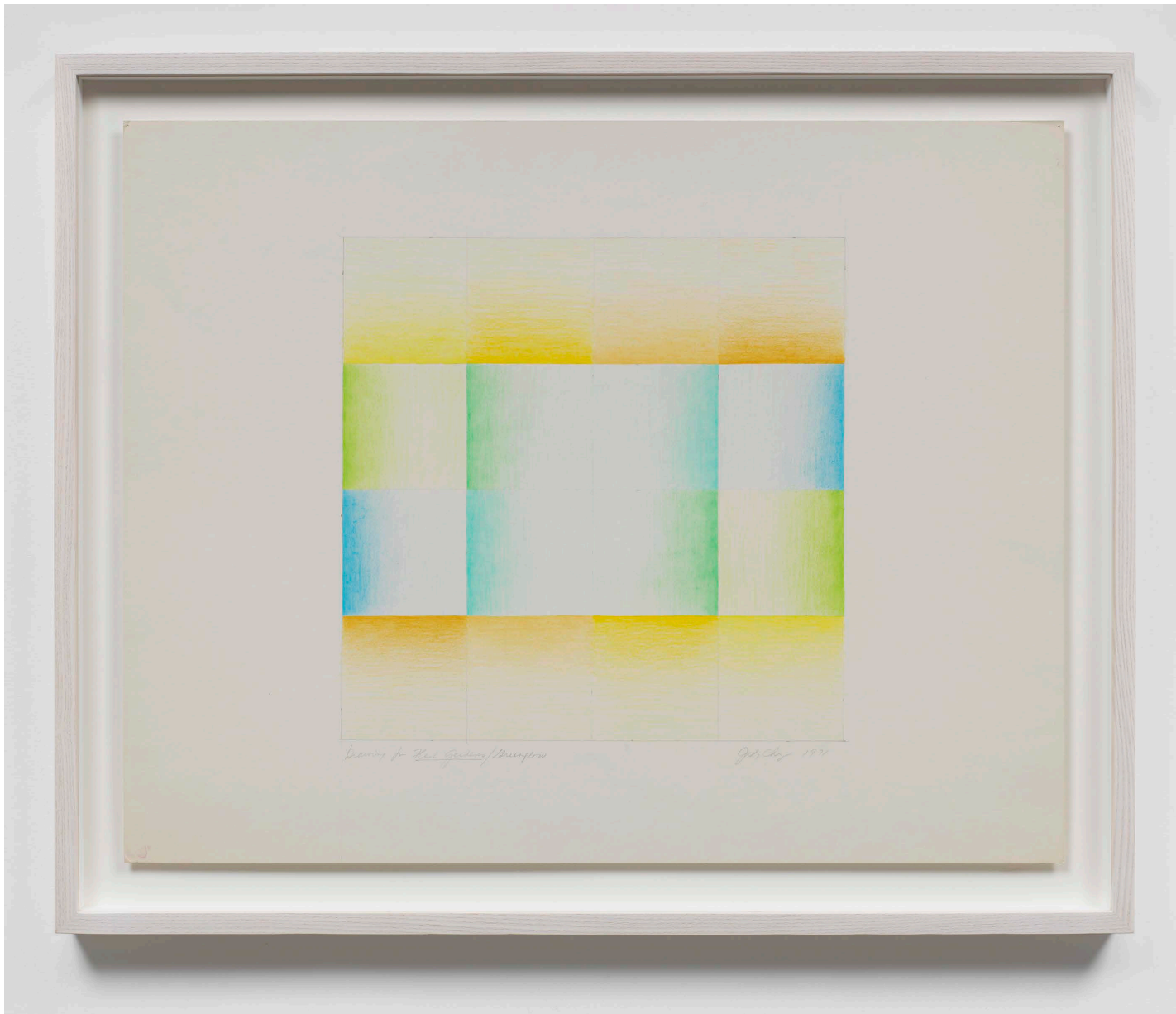
Judy Chicago Drawing for Flesh Gardens/Greenglow, 1971 Prismacolor on paper 24 x 28 inches (61 x 71.1 cm) Framed: 26 x 31.88 inches (66 x 81 cm)