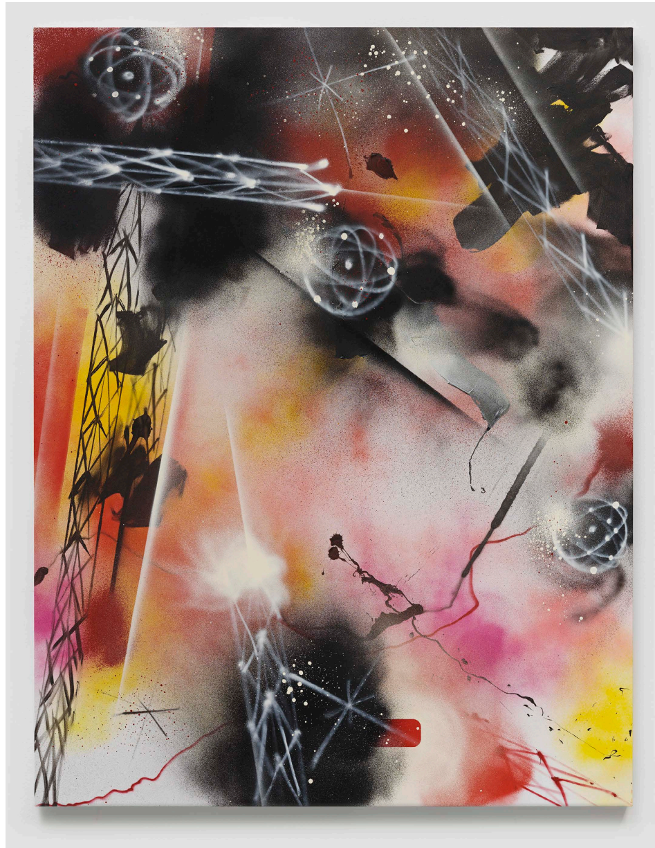
FUTURA THE DIXIE CLUB, 2023 Aerosol and acrylic on canvas 65.5 x 50.5 inches (166.4 x 128.3 cm)