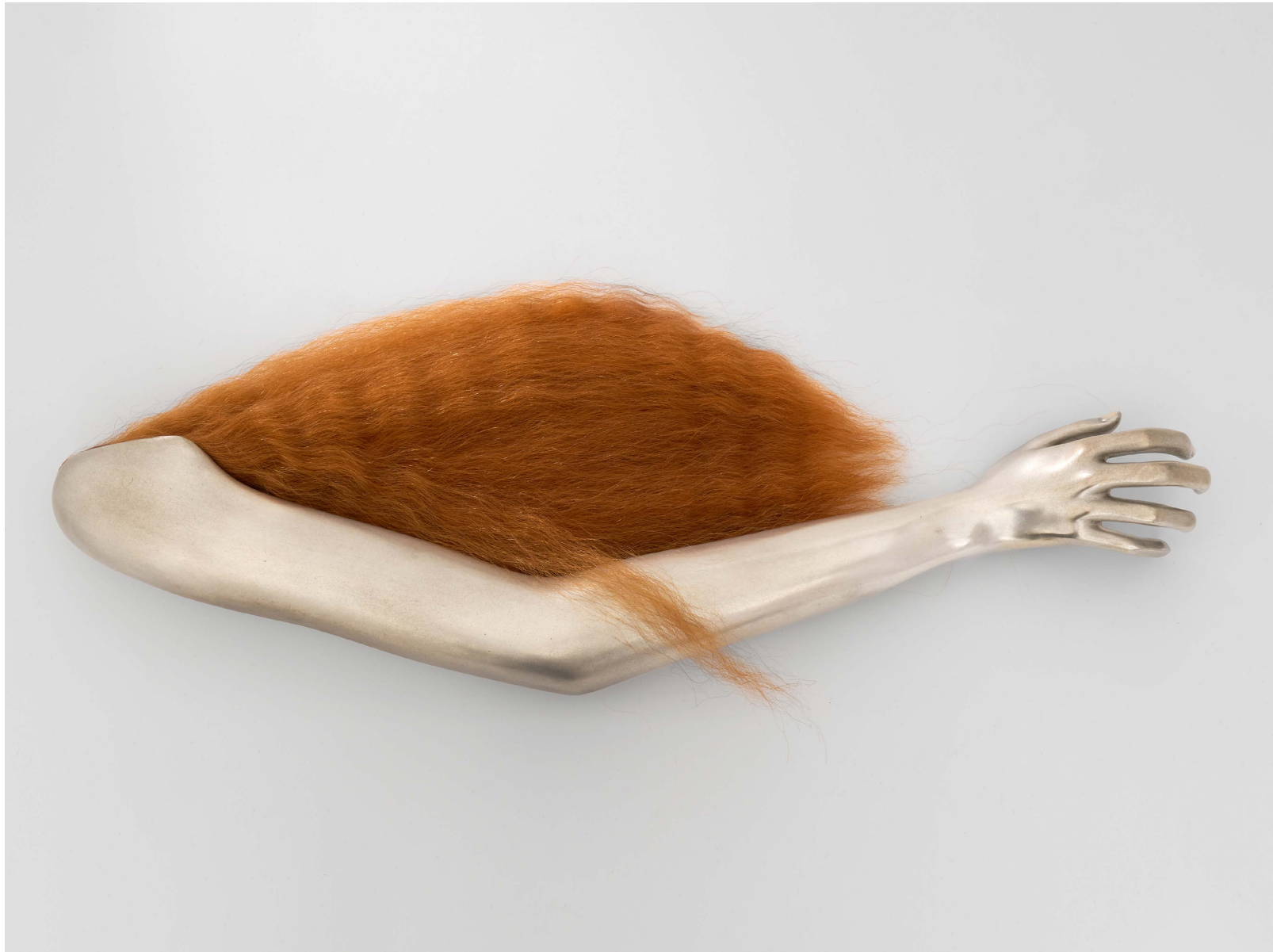
Isabelle Albuquerque Summertime Sadness , 2024 Fire painted bronze, human hair 4 x 10 x 31 inches (10.2 x 25.4 x 78.7 cm) Edition 1 of 3, 1 AP