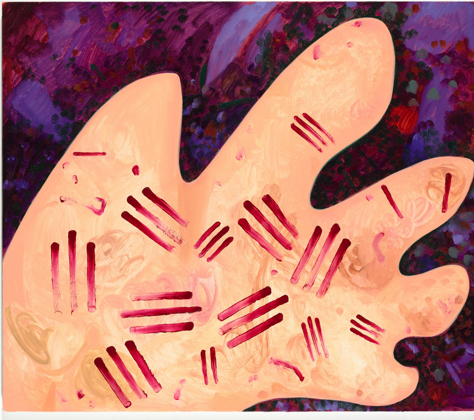
Dana Schutz „Jackie’s Dream“, 2010 oil on canvas 132 x 153 x 4 cm 52 x 60 1/4 x 1 5/8 in