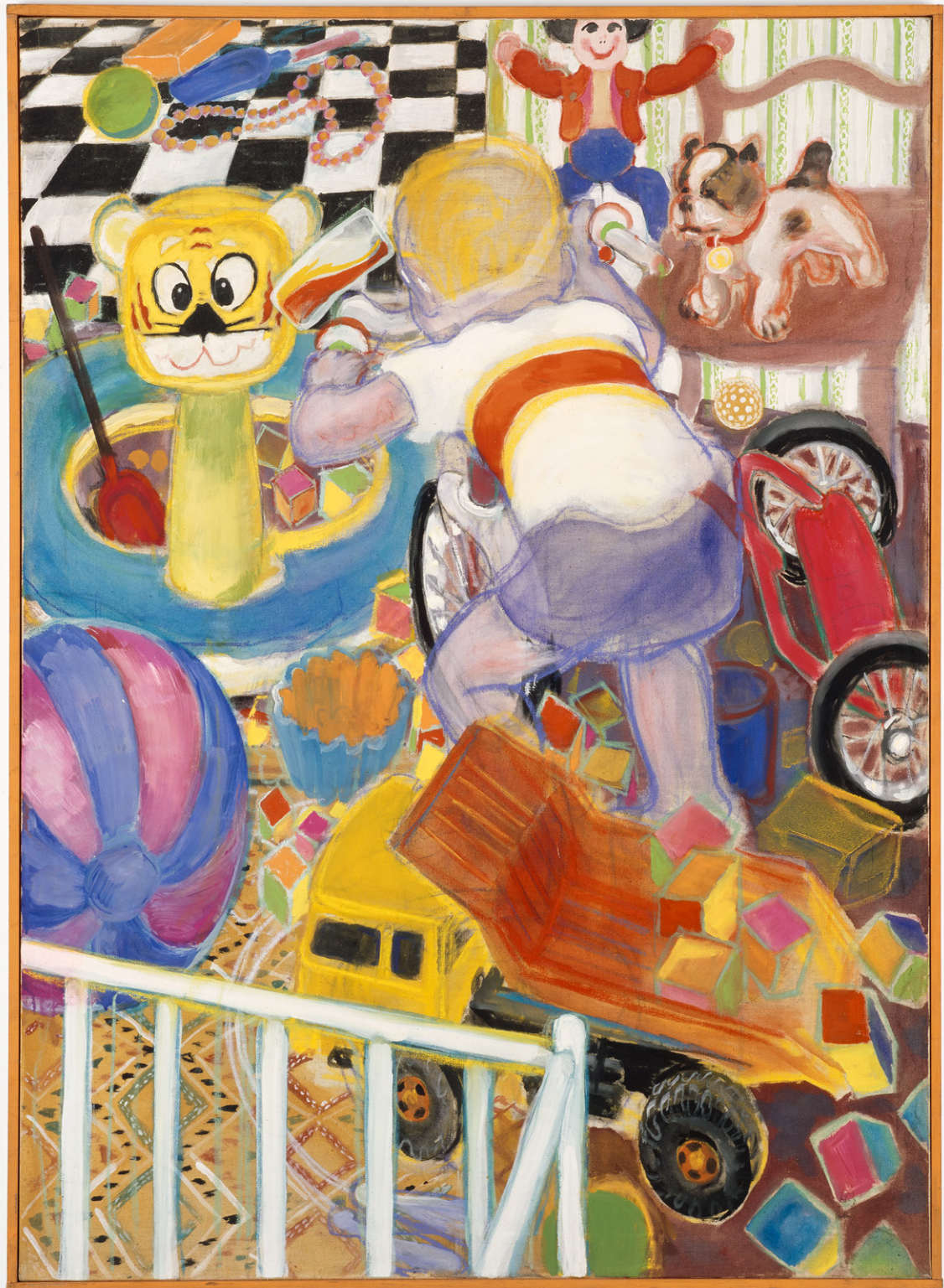
Christa Dichgans „Robert mit Dreirad“ 1965 acrylic on canvas 133 x 98 cm / 52 3/8 x 38 5/8 in