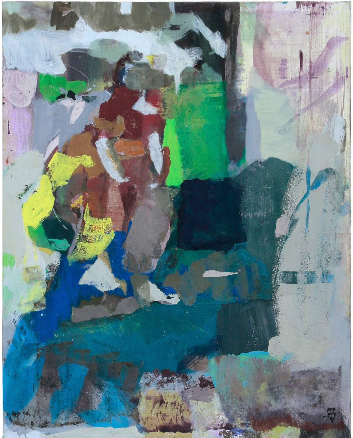
Maki Na Kamura „Claim of Joseph XI”, 2024 oil, egg tempera on canvas 150 x 120 cm / 59 x 47 1/4 in