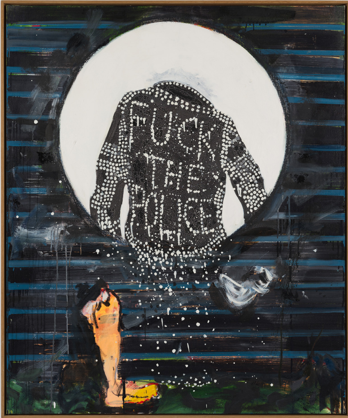
Daniel Richter ohne Titel, 2014 oil on canvas 120 x 100 cm / 47 1/4 x 39 3/8 in