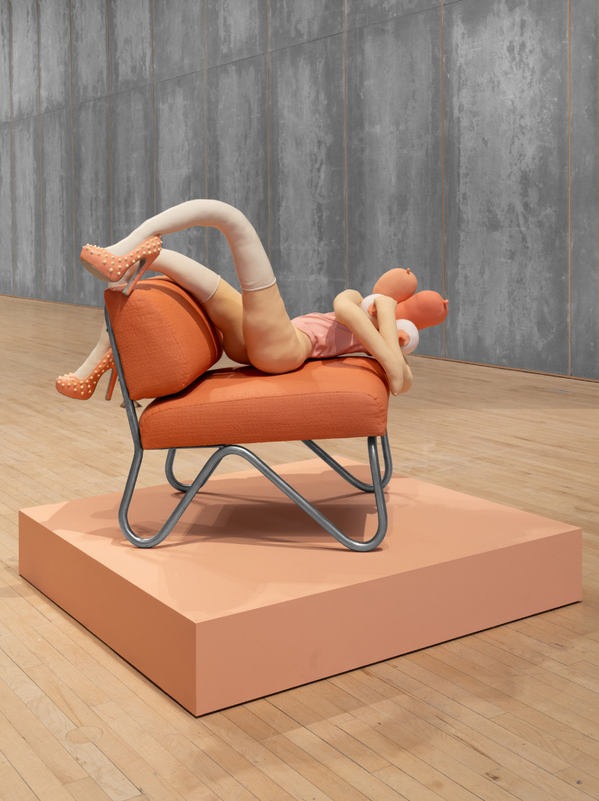
Sarah Lucas „BUNNY RABBIT“, 2022 resin and acrylic paint 93.8 x 77.7 x 114.4 cm 36 7/8 x 30 5/8 x 45 in