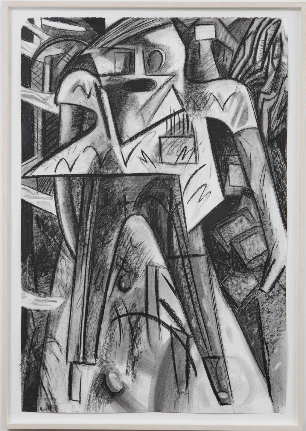
Dana Schutz „God 1“, 2014 charcoal on paper 91.4 x 61 cm / 36 x 24 in