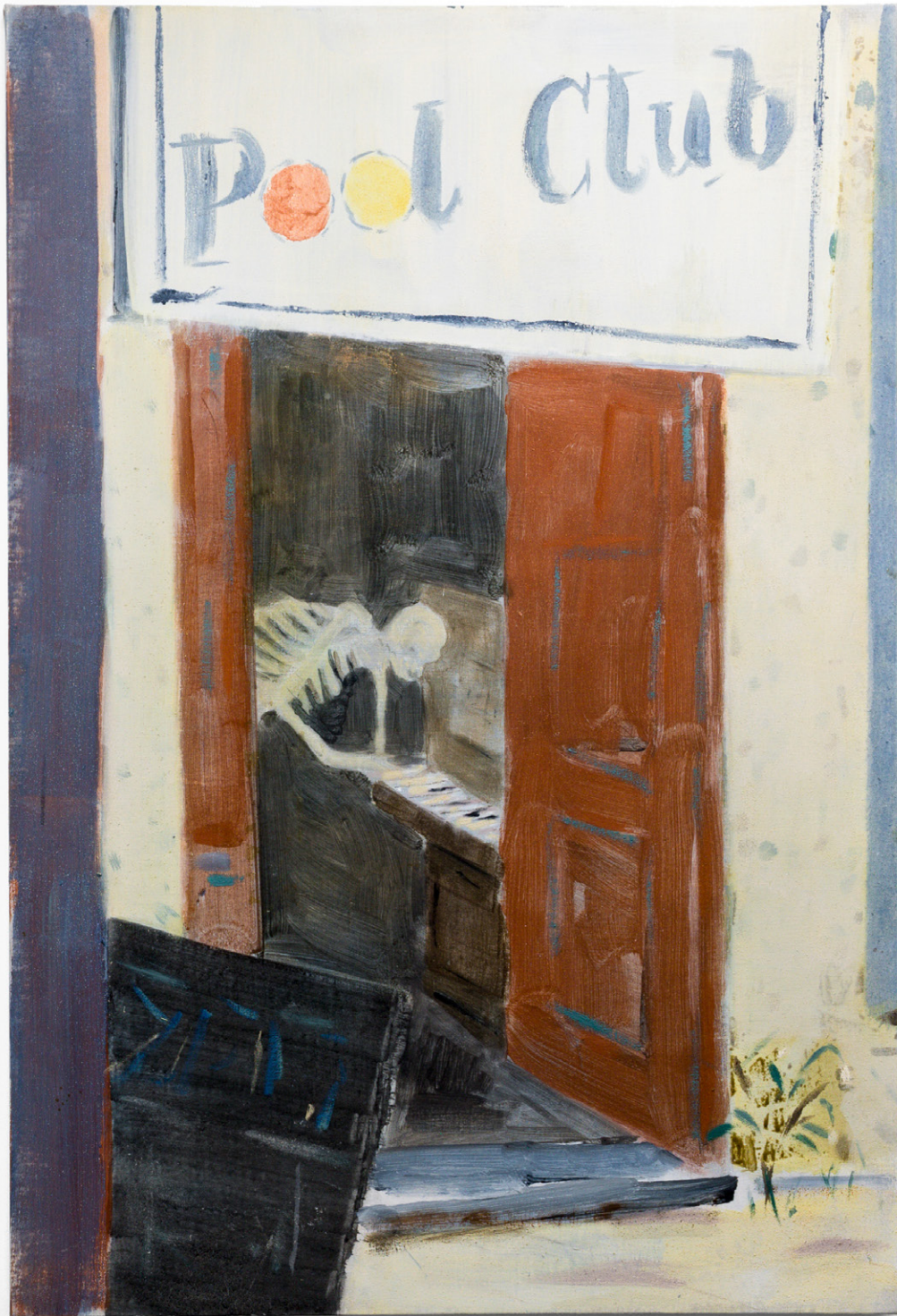
Nick Goss „Canavan's“, 2023 oil on canvas 140 x 95 cm / 55 1/8 x 37 3/8 in