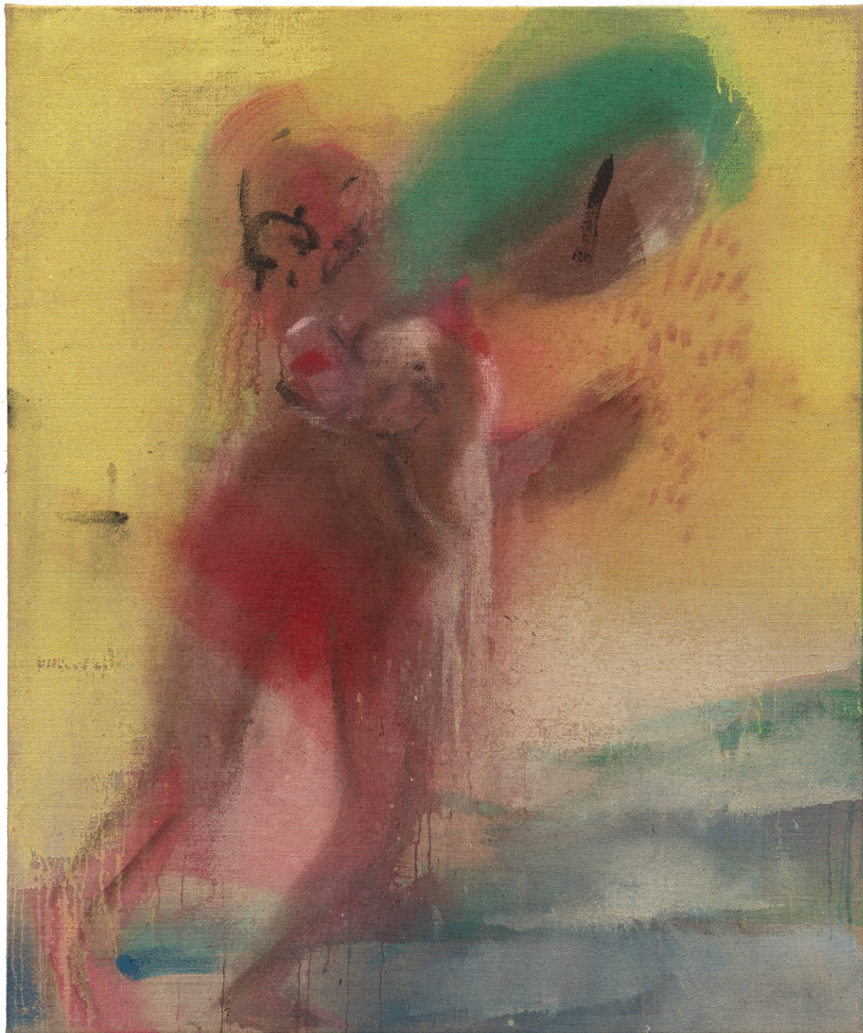
Leiko Ikemura „Baby carrying“, 2023 tempera and oil on canvas 120 x 100 cm / 47 1/4 x 39 3/8 in