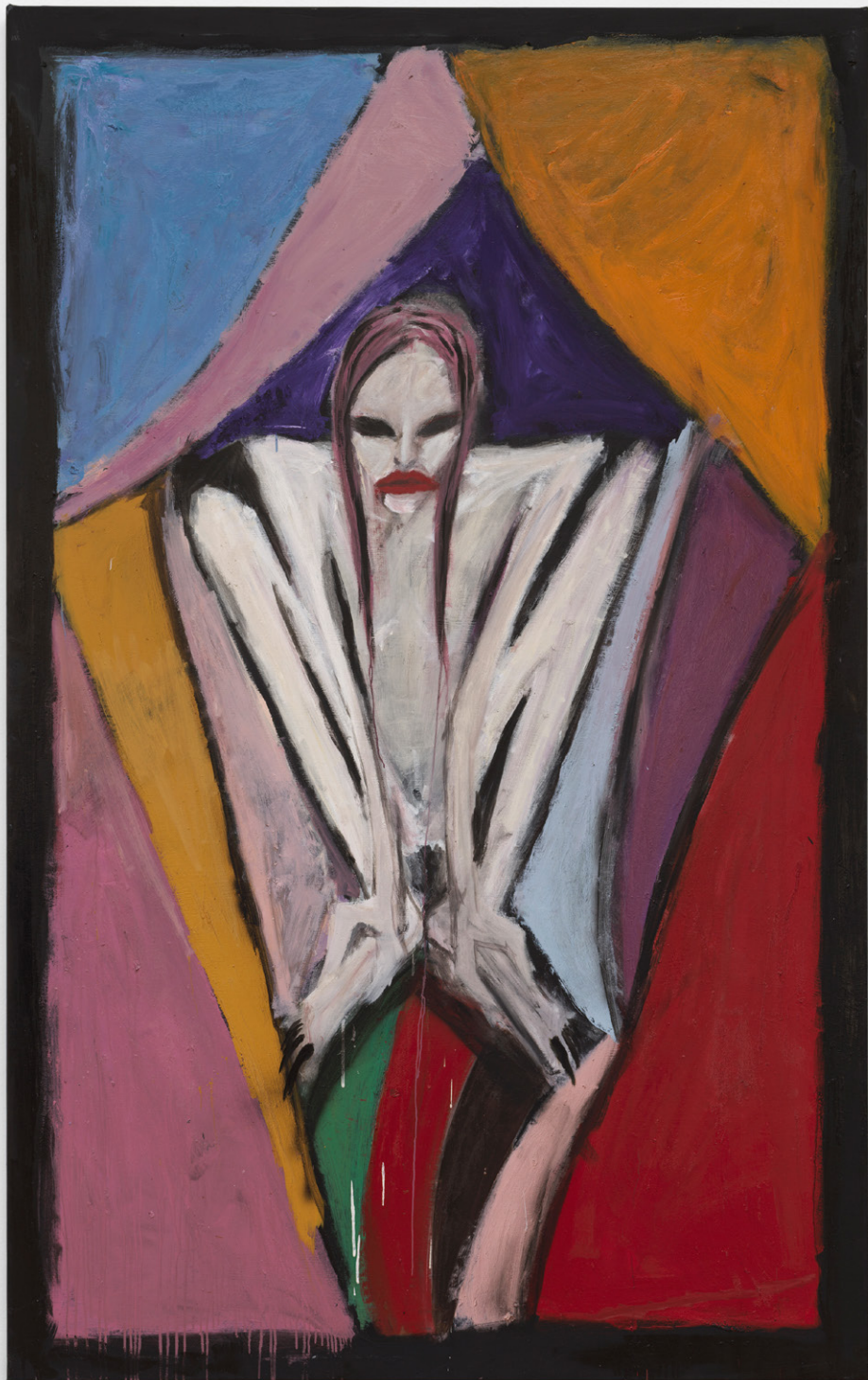
Tobias Spichtig „Der Teufel / The Devil“, 2023 oil on canvas 250 x 155 cm / 98 3/8 x 61 in