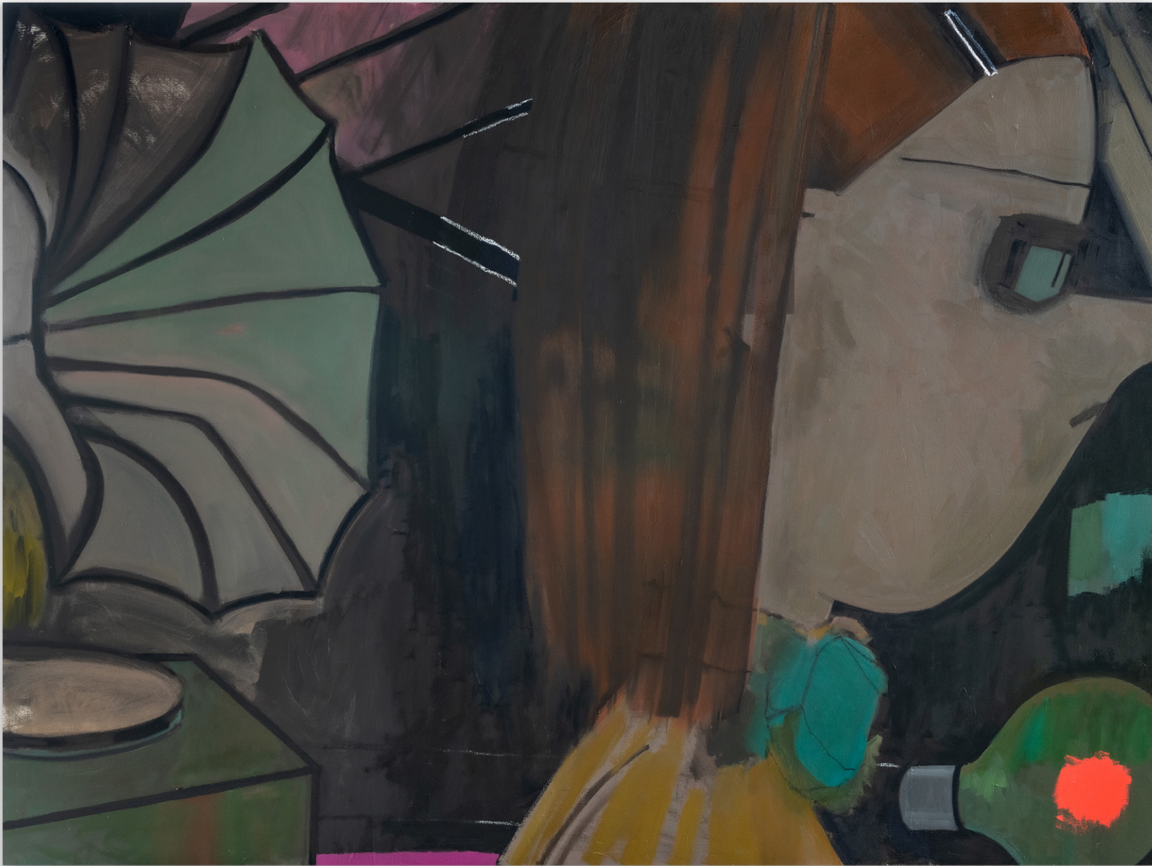
Ellen Berkenblit „Gramosound“, 2023 oil on linen 144.78 x 193.04 cm / 57 x 76 in