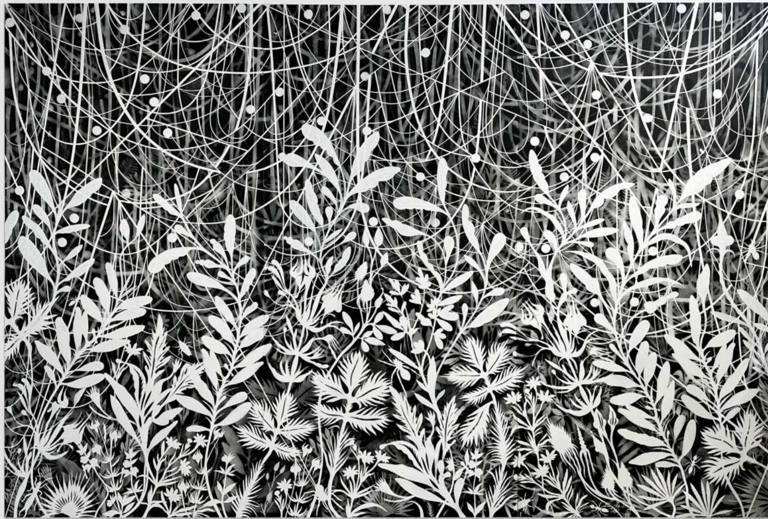
Hector Dionicio Mendoza Memories of the Wilderness/ Recuerdos de la Maleza , 2024 Mixed media (spray paint on 3 wood panels) 96 x 144 in (243.8 x 365.8 cm) $45,000