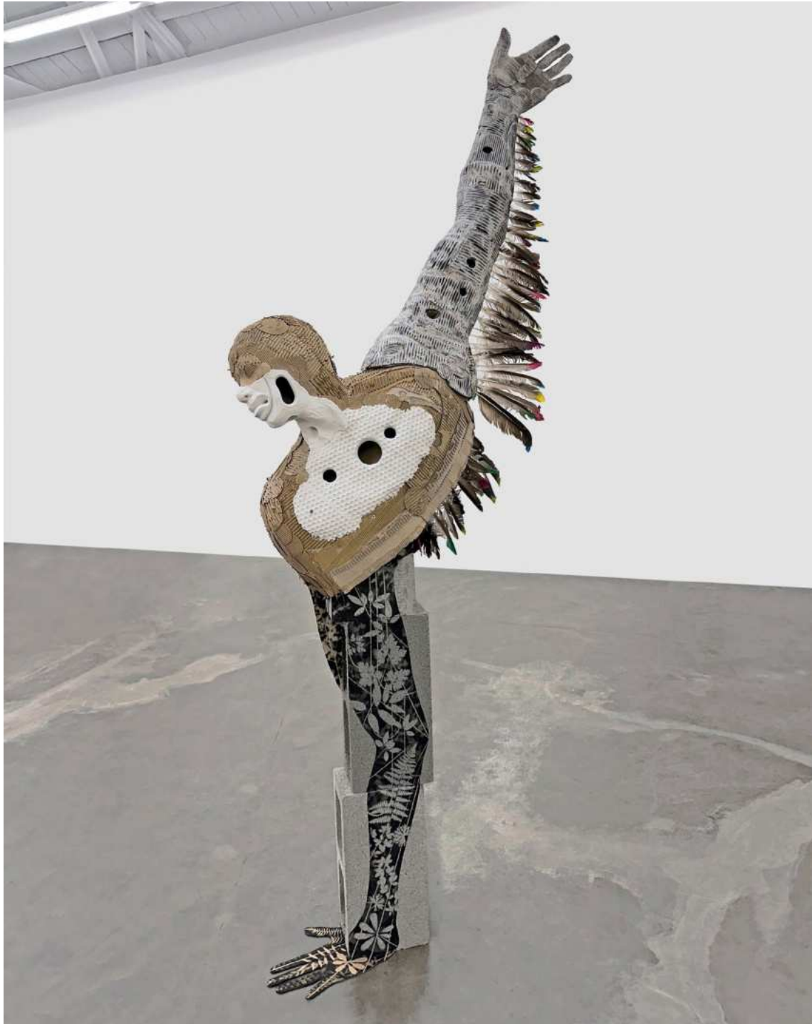
Hector Dionicio Mendoza Morir o Volar/ Die or Fly (Lalo) , 2023 Mixed media (cardboard, epoxy, rubber cement, concrete, cinder blocks, clay, wood, metal, painted feathers) 87 x 30 x 15 in (221 x 76.2 x 38.1 cm) $22,000