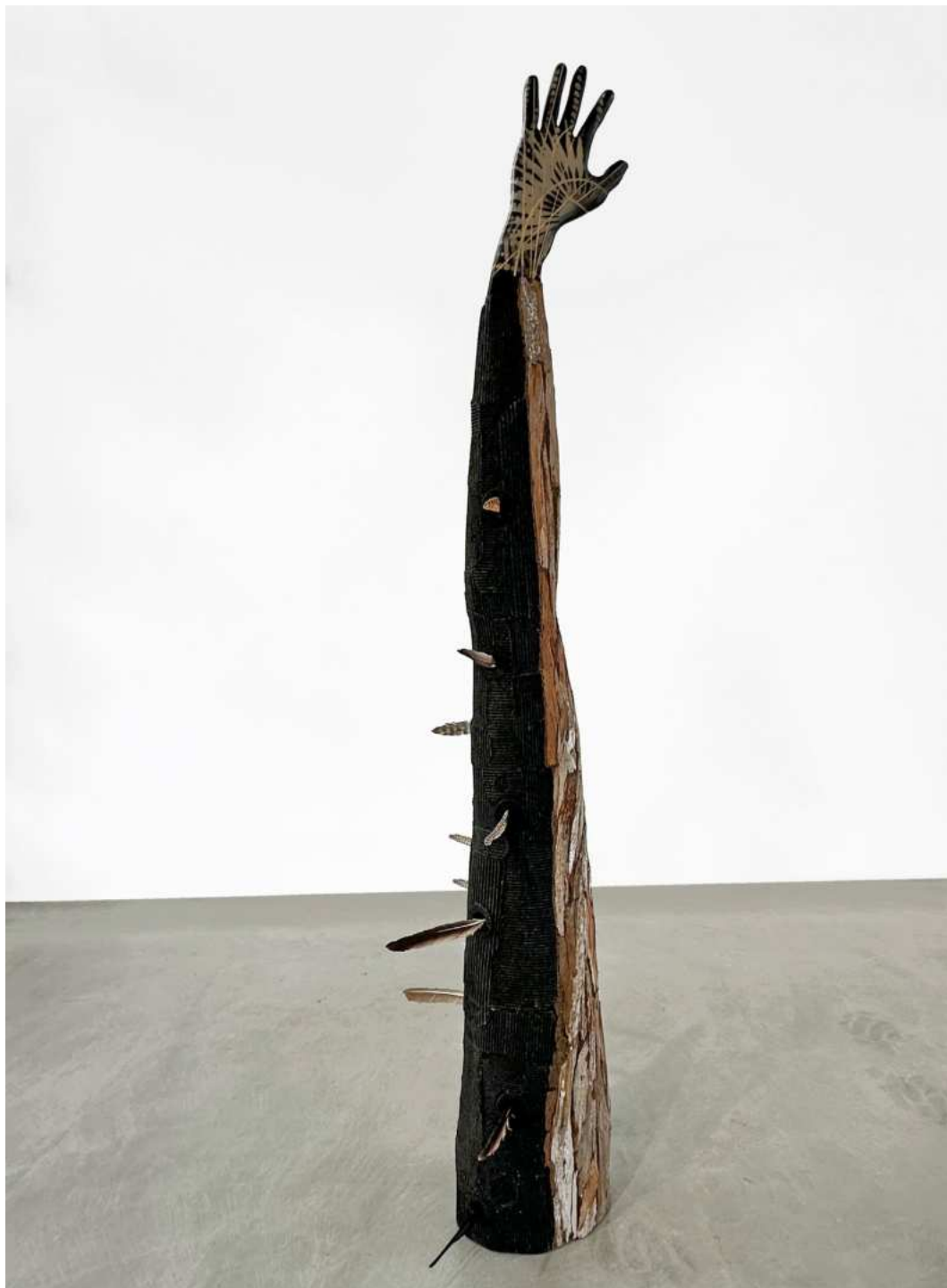
Hector Dionicio Mendoza Sprouting Feathers to Take Flight/ Retoñando Plumas Para Impulsar Vuelo, 2024 Mixed media (eucalyptus bark, wood, black sand, feathers, spray paint, plastic rings ) 96 x 14 x 12 in (243.8 x 35.6 x 30.5 cm) $20,000