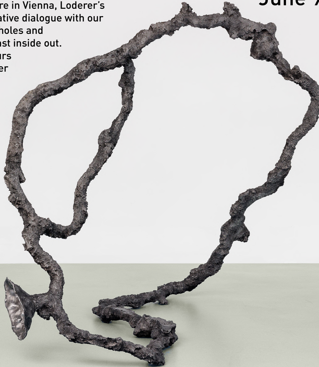
Angelika Loderer „Schüttloch (1)“, 2024 aluminium 112.3 x 165 x 107 cm / 44 1/4 x 65 x 42 1/8 in