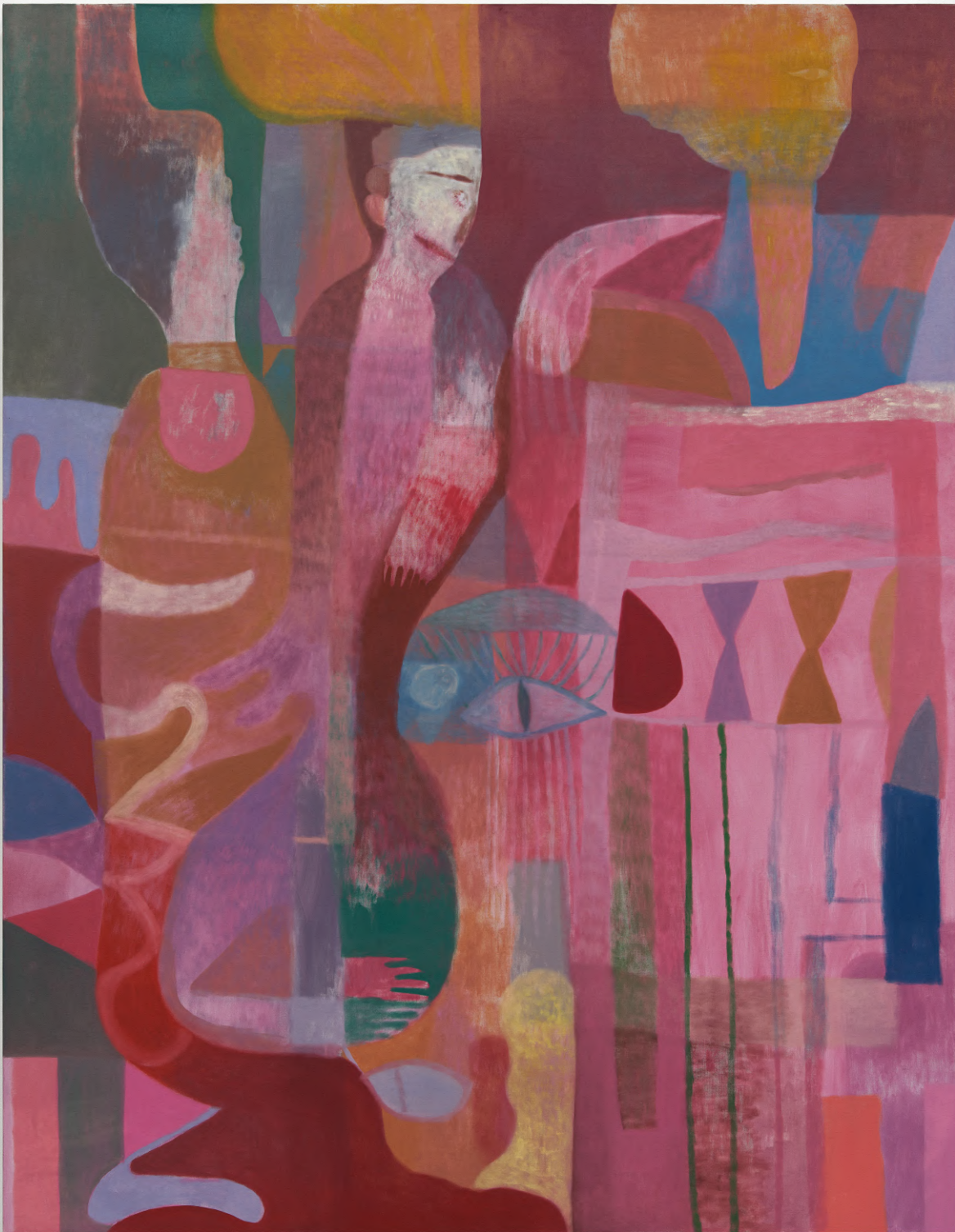
Maja Ruznic „The Arrangement of Genes“, 2024 oil on linen 228.6 x 177.8 cm / 90 x 70 in