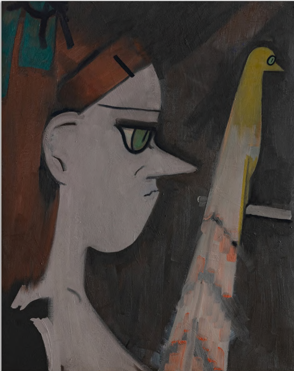
Ellen Berkenblit „A Song at night“, 2023 oil on linen 83.8 x 66.7 cm / 33 x 26 1/4 in