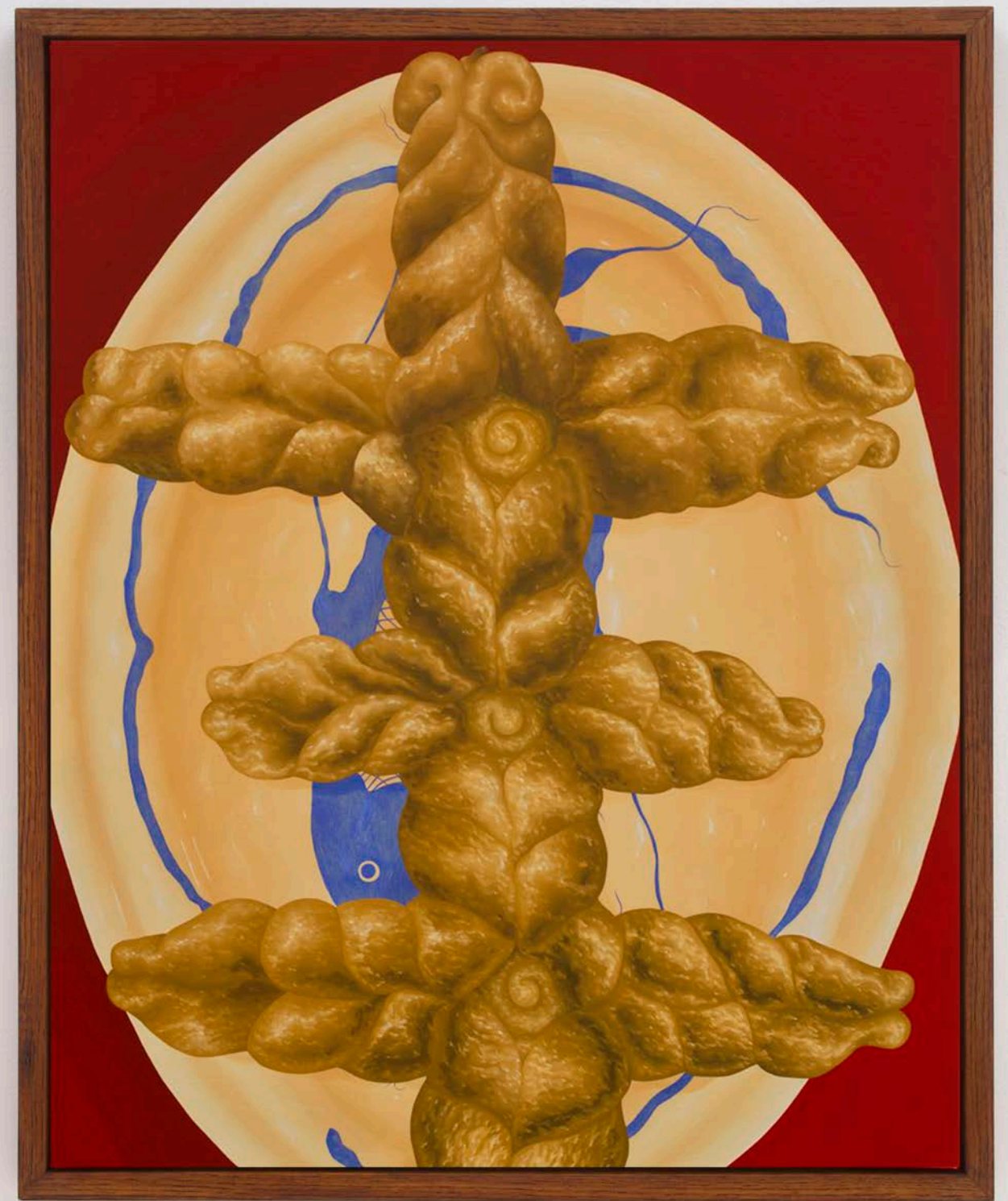
María Fragoso Jara | El deseo es hambre , 2024 oil on canvas, wood frame | 30h x 24w in | $24,000