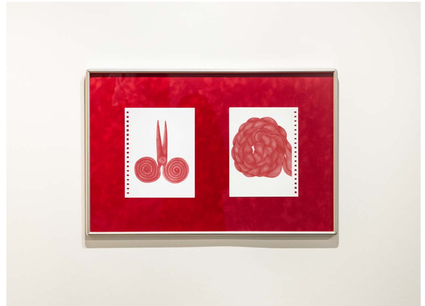
María Frago Jara | Ex voto (ruptura) , 2024 colored pencil on paper, brushed aluminium frame, suede mat with UV plexi 10h x 8w inches image size | 18.75h x 28.25w inches framed | $3,200