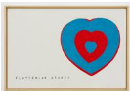
(RP-1094) Richard Pettibone Marcel Duchamp, 'Fluttering Hearts', 1936, #12, white, 2017 Oil on canvas 6 5/8 x 9 1/2 inches (16.8 x 24.1 centimeters)