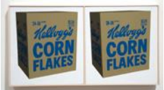
(RP-143) Richard Pettibone Andy Warhol, 'Two Kellogg's Corn Flakes Boxes', 1964 #3, 2007 Oil on canvas 9 1/2 x 17 1/2 inches (24.1 x 44.5 centimeters)