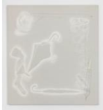
(Ar-0005) Arakawa Untitled , 1964 Acrylic, acrylic spray paint, pencil, pen, and colored pencil on canvas 65 3/4 x 60 inches (167 x 152.4 centimeters)