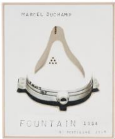
(RP-1004) Richard Pettibone Marcel Duchamp, 'Fountain', 1964, 2014 Oil on canvas 9 1/4 x 7 3/4 inches (23.5 x 19.7 centimeters)