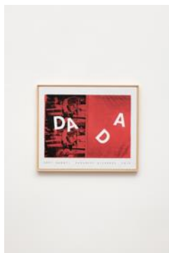
(RP-42) Richard Pettibone Andy Warhol, 'Saturday Disaster', 1964, DADA #2 , 2002 Silkscreen, acrylic, and oil on canvas 11 x 13 inches (27.9 x 33 centimeters)