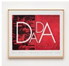
(RP-71) Richard Pettibone Andy Warhol, 'Saturday Disaster', 1964, DADA, #4 , 2002 Silkscreen, acrylic, and oil on canvas 11 x 13 inches (27.9 x 33 centimeters)