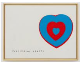
(RP-1095) Richard Pettibone Marcel Duchamp, 'Fluttering Hearts', 1936, #13, white, 2017 Oil on canvas 6 5/8 x 9 1/2 inches (16.8 x 24.1 centimeters)