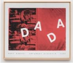
(RP-43) Richard Pettibone Andy Warhol, 'Saturday Disaster', 1964, DADA #3, 2002 Silkscreen, acrylic, and oil on canvas 11 x 13 inches (27.9 x 33 centimeters)