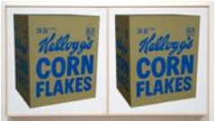
(RP-144) Richard Pettibone Andy Warhol, 'Two Kellogg's Corn Flakes Boxes', 1964 #4, 2007 Oil on canvas 7 7/8 x 14 1/2 inches (30 x 36.9 centimeters)