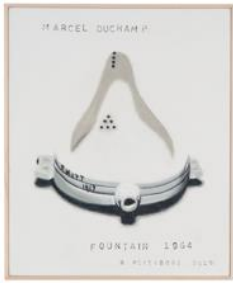
(RP-1003) Richard Pettibone Marcel Duchamp, 'Fountain', 1964, 2014 Oil on canvas 9 1/4 x 7 3/4 inches (23.5 x 19.7 centimeters)