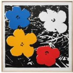
(RP-1117) Richard Pettibone Andy Warhol, 'Flowers', 1965, 2011 Oil and silkscreen on canvas 7 x 7 inches (17.8 x 17.8 centimeters)