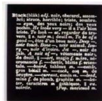
(JK-168) Joseph Kosuth 'Titled (Art as Idea as Idea)' [black] (Eng. – Fr.), 1966 Photostat 48 x 48 inches (121.9 x 121.9 centimeters)