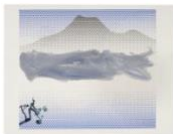
(RL D-765) Roy Lichtenstein Landscape in Fog (Study) , 1996 Cut printed paper, cut painted paper, cut sponge-printed paper, graphite pencil on board 39 7/8 x 44 3/4 inches (101.3 x 113.7 centimeters)