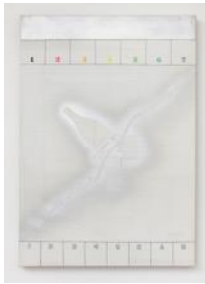
(Ar-0007) Arakawa Untitled , 1965 Acrylic, acrylic spray paint, colored pencil and marker on canvas 40 7/8 x 28 5/8 inches (103.8 x 72.7 centimeters)