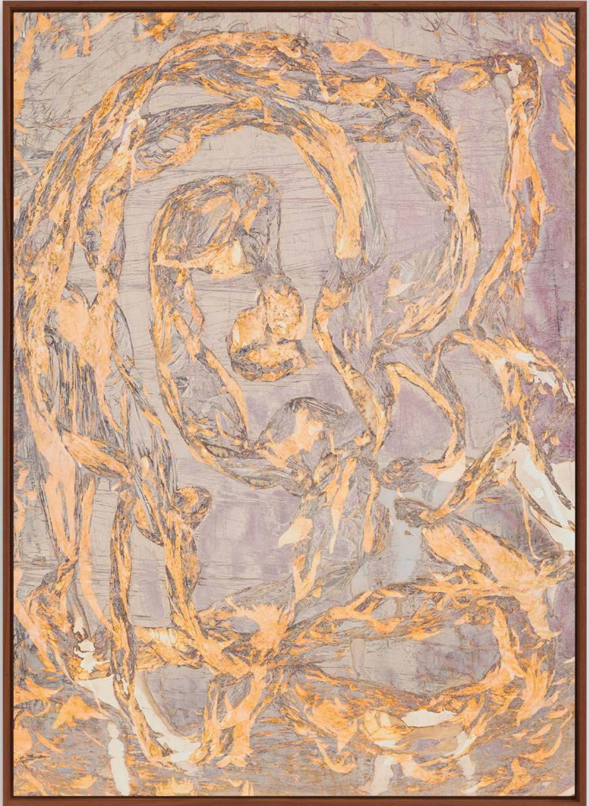
Gold Delta, 2024 acrylic paint, dye and ink on watercolour paper 192 x 135 x 5 cm (framed)