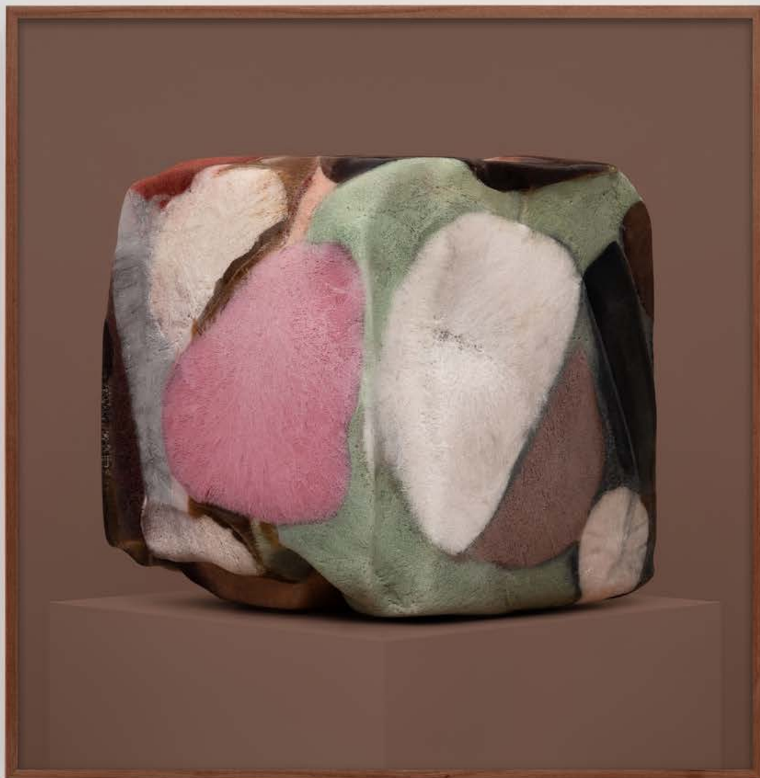
Rhodonite Mountain I , 2024 archival pigment print 127 x 127 x 6 cm (framed) Edition of 1 + 2 AP