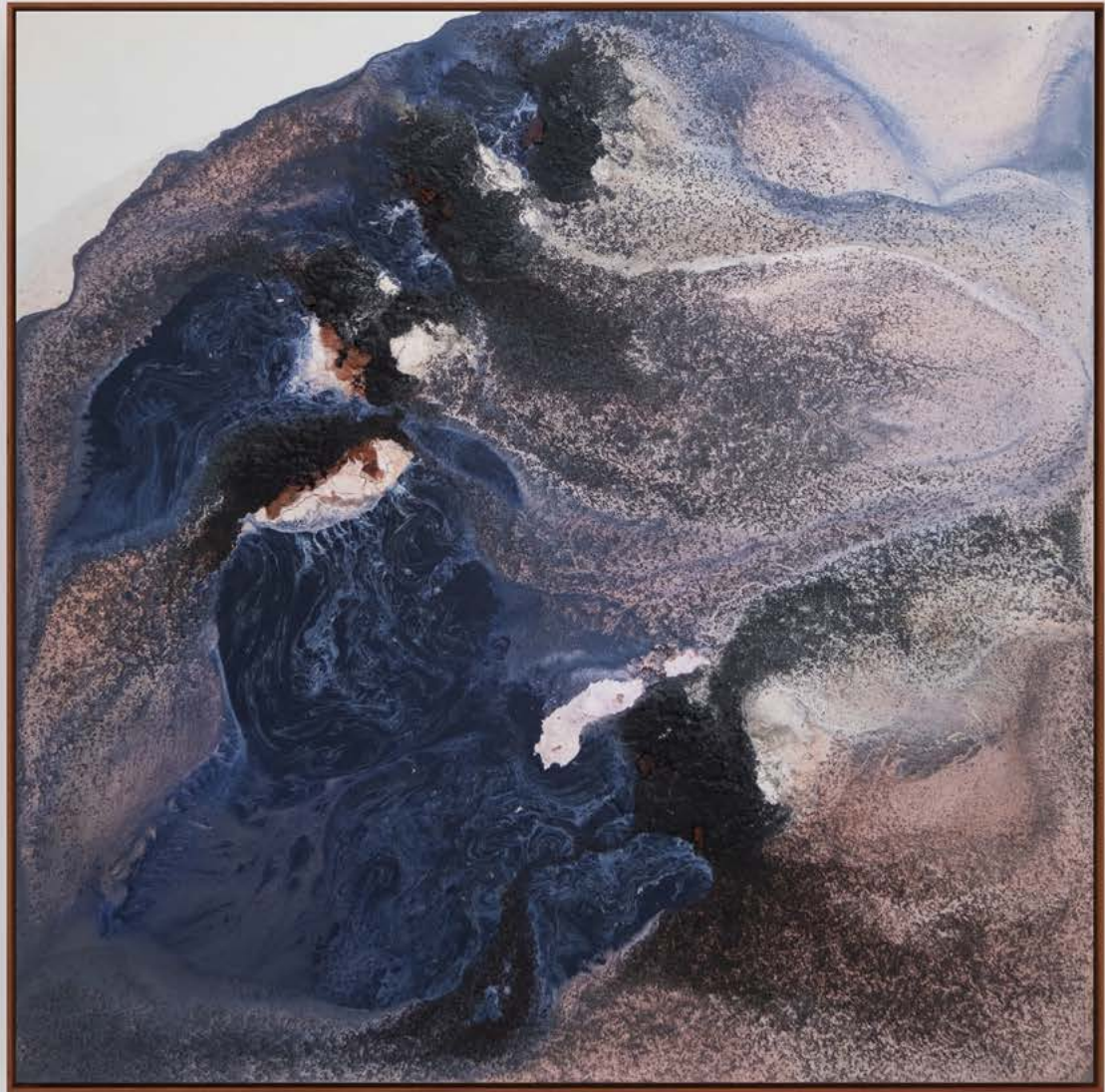
Archipelago in Blue , 2024 acrylic paint, dye, ink and sand on wood 104 x 104 x 5 cm (framed)