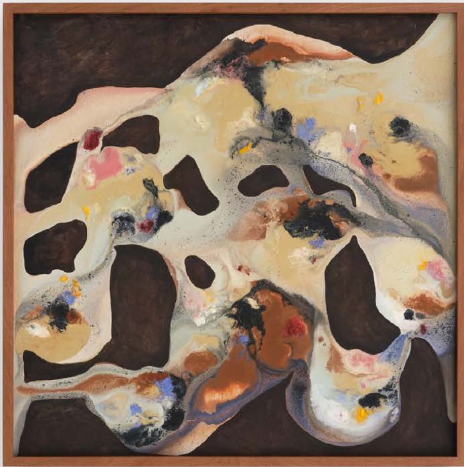
Marapi , 2024 acrylic paint, dye and ink on wood 88 x 88 x 9 cm (framed)