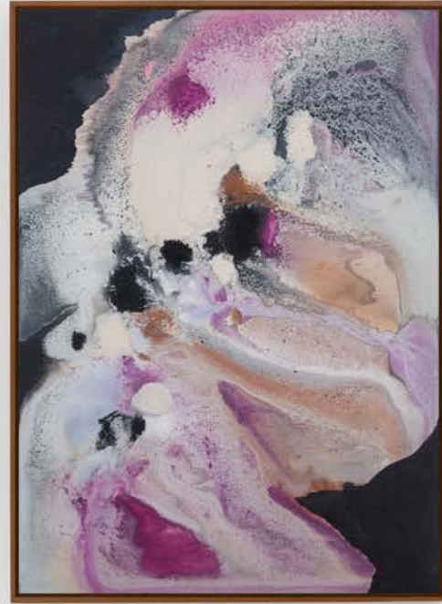
Orchid Islands , 2024 acrylic paint, dye, ink and sand on wood 79 x 59 x 5 cm (each, framed)