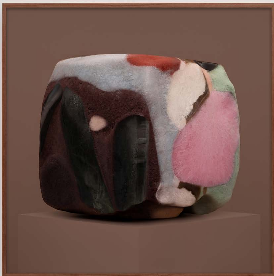
Rhodonite Mountain III , 2024 archival pigment print 127 x 127 x 6 cm (framed) Edition of 1 + 2 AP