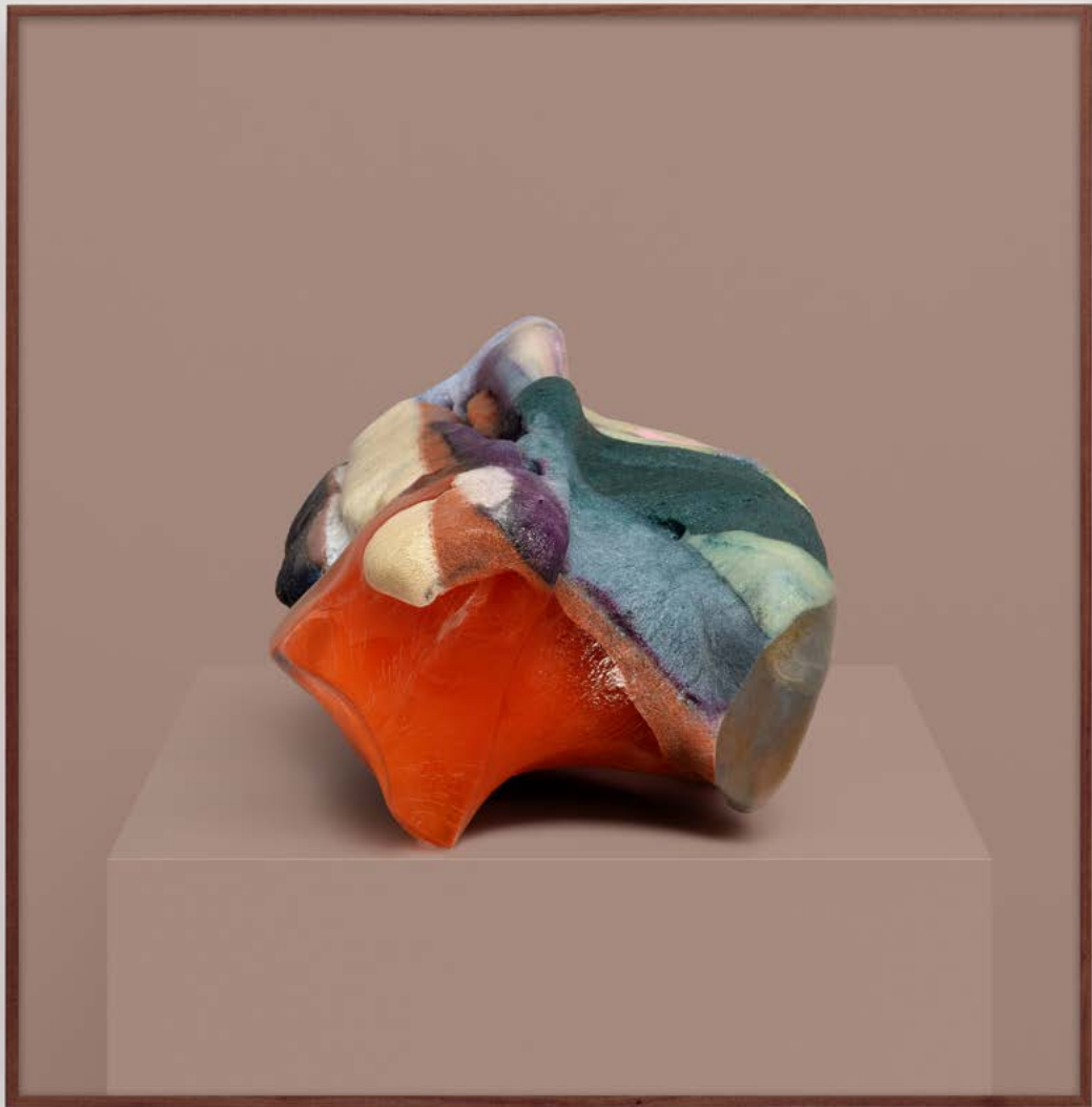
Tectonic Candy IV , 2024 archival pigment print 60.7 x 60.7 x 5 cm (framed) Edition of 1 + 2 AP