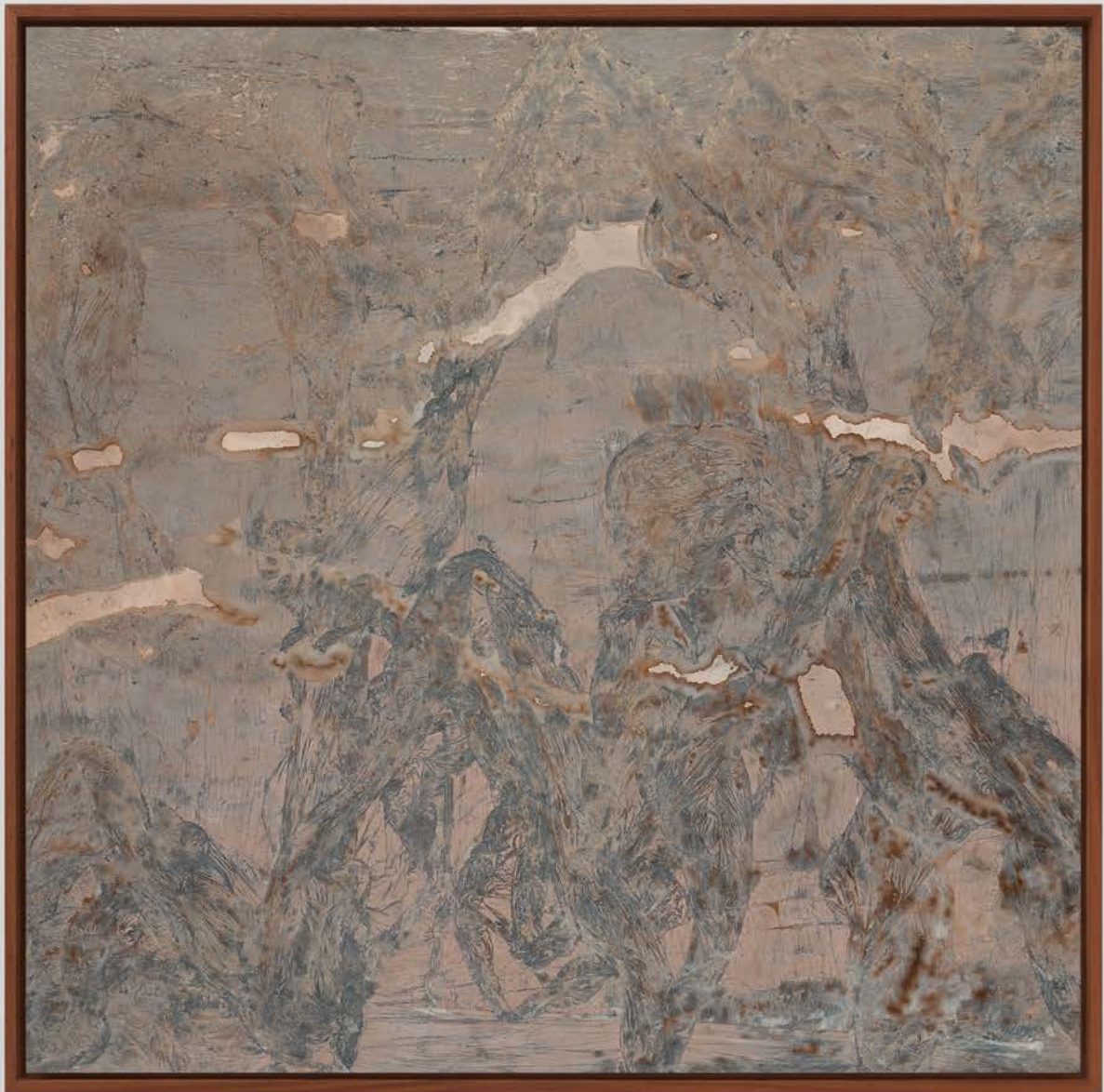
Nocturnal Highlands, 2024 acrylic paint, dye and ink on watercolour paper 147.7 x 146.2 x 5 cm (framed)