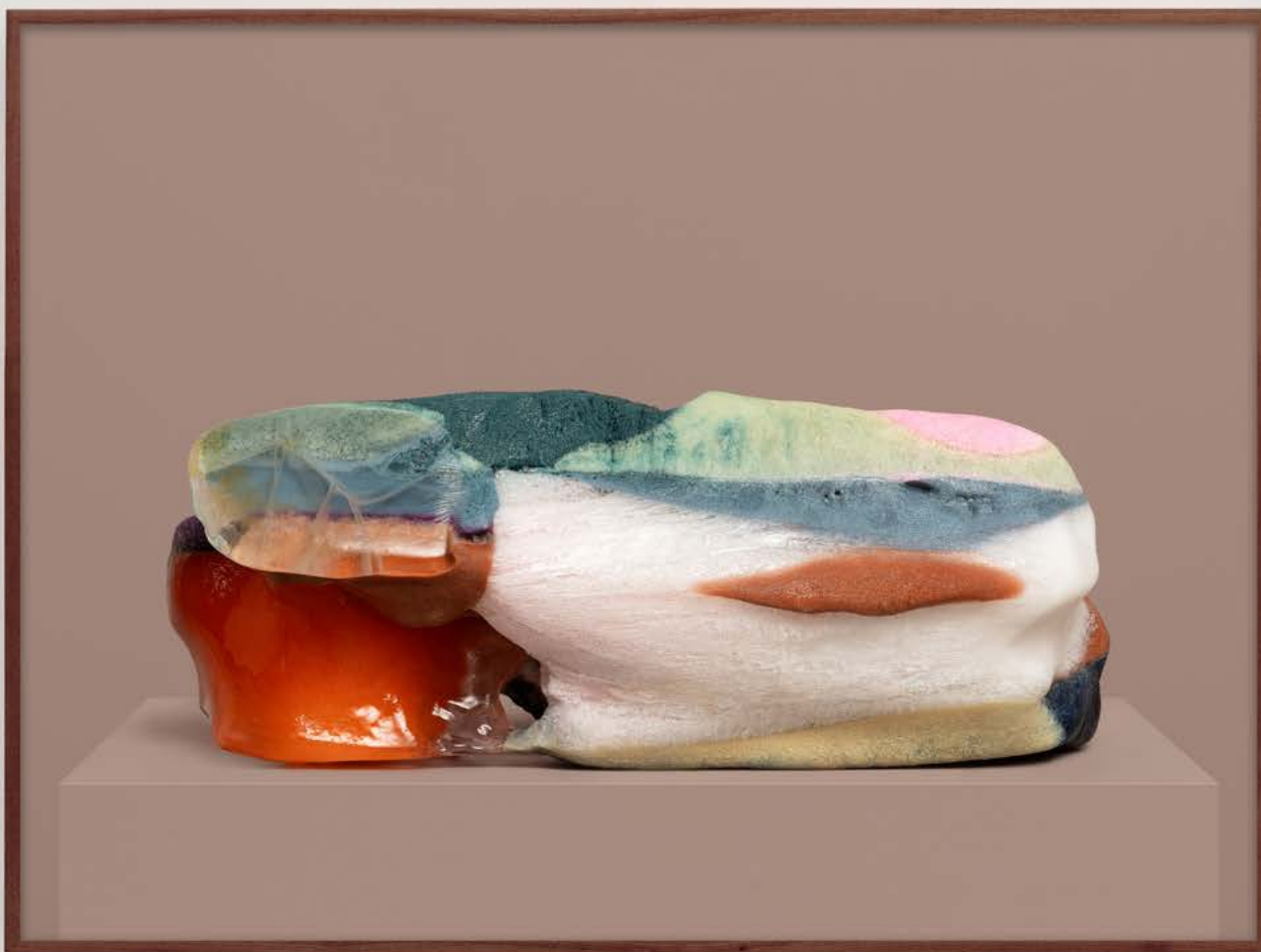
Tectonic Candy II , 2024 archival pigment print 83.6 x 112.2 x 5.5 cm (framed) Edition of 1 + 2 AP