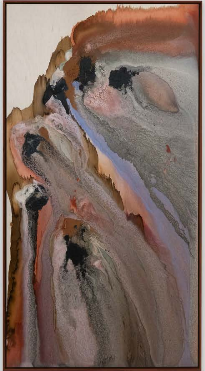
Flashing Streams, 2024 acrylic paint, dye, ink and sand on wood 149 x 89 x 5 cm (each, framed)