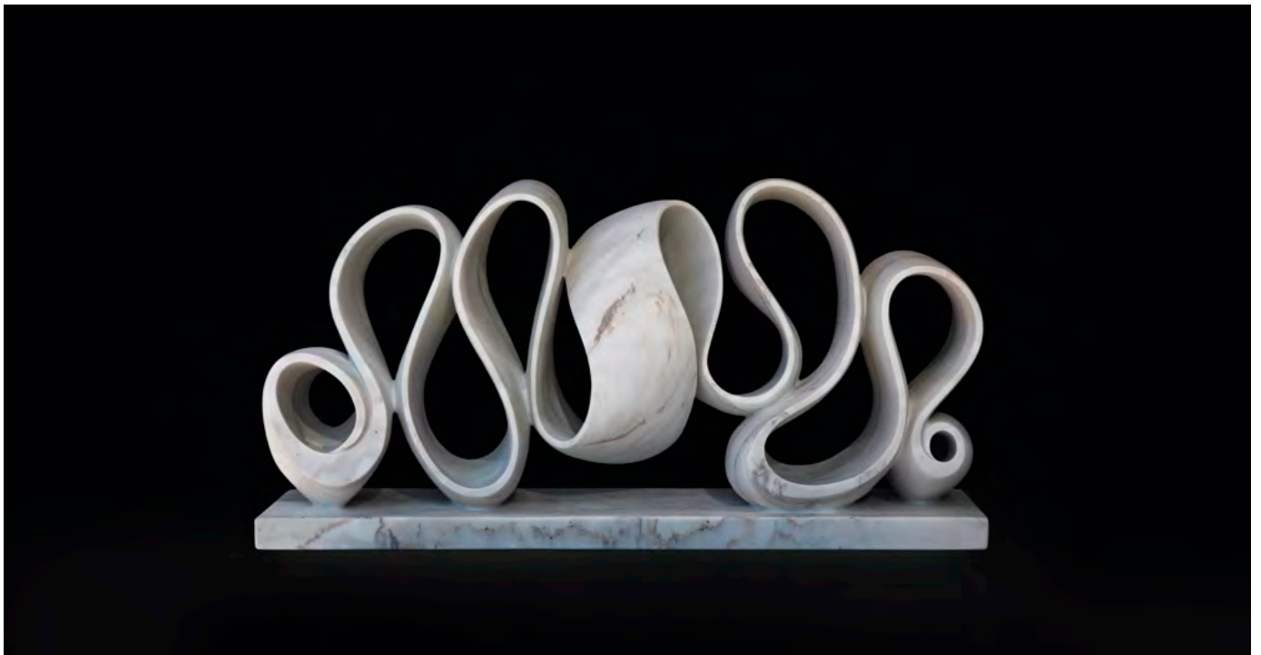
Elizabeth Turk (b.1961) Script: Line 187 , 2013 Marble, 18 x 35 1/2 x 7 3/4 in. $275,000