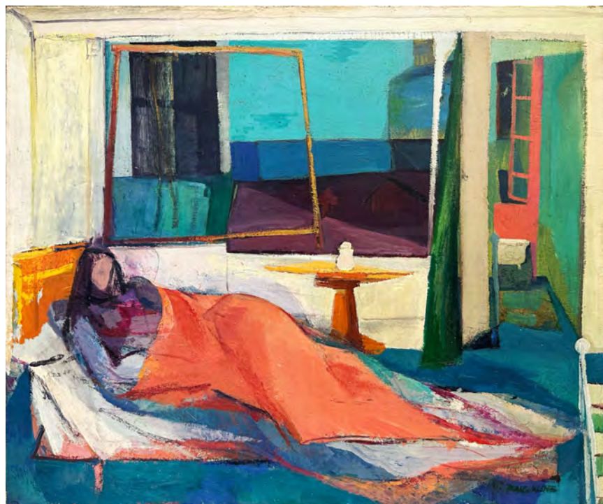
Franz Kline (1910-1962), Elizabeth (Reclining Woman) , 1949, oil on canvas, 24 x 29 in.

Galleries Sector and Kabinett Program ( Prelude: The Early Works of Franz Kline )