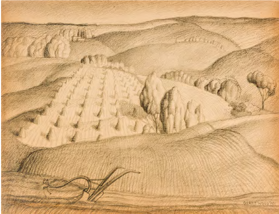
Grant Wood (1891-1942) Study No. 1, Fall Plowing , 1931 Charcoal and pencil on paper, 10 7/8 x 14 in. $245,000