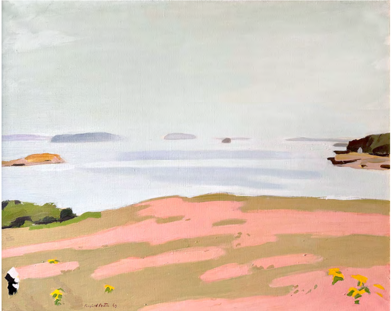
Fairfield Porter (1907-1975) View from the South Meadow, 1969 Oil on canvas, 48 x 60 in. POR