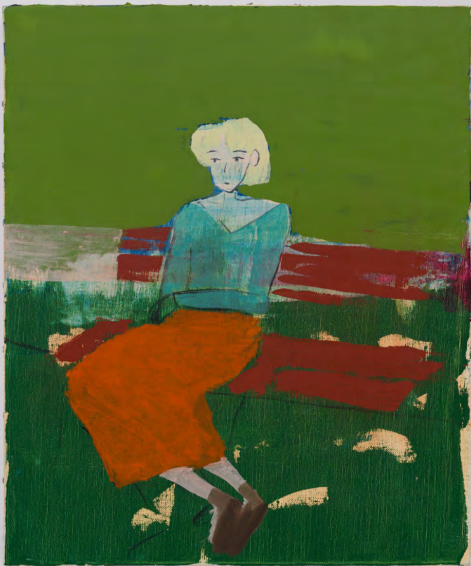
Yu Nishimura waiting in the park , 2024 oil on canvas 45.5 x 38 cm / 17 7/8 x 15 in HQ28-YN21075P