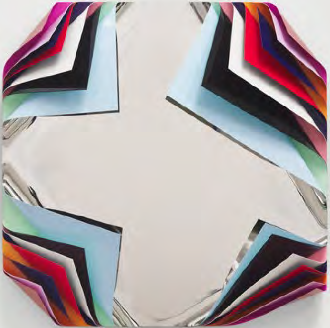
Metal Box (Montevideo), 2024 Polished steel and aluminium sheets, gloss paint 80 x 80 x 21 cm / 31 ½ x 31 ½ x 8 ¼ in HQ28-JL21048S