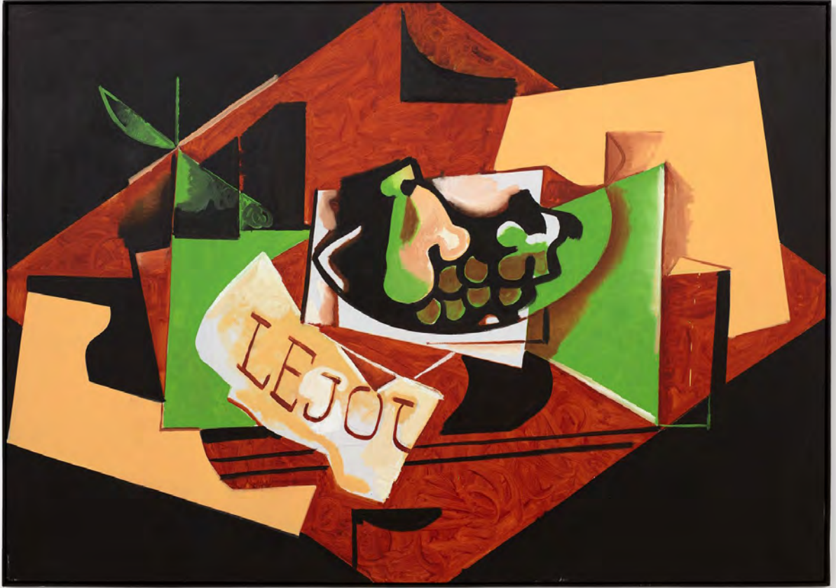
Wilhelm Sasnal Untitled (after "Still Life" by George Braque) , 2023 oil on canvas, wooden frame site size: 140 x 200 cm / 55 \frac{1}{8} x 78 \frac{3}{4} in frame size: 142.5 x 202.5 cm / 56 \frac{1}{8} x 79 \frac{3}{4} in HQ27-WS20454P