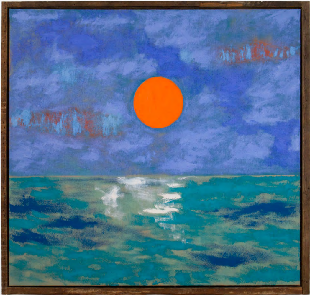
Alvaro Barrington Big Ocean, Caribbean Blues, L, August 2024, 2024 oil and acrylic on burlap 192.5 x 207.5 x 7.5 cm / 75 \frac{3}{4} x 81 \frac{3}{4} x 3 in HQ28-AB21043P