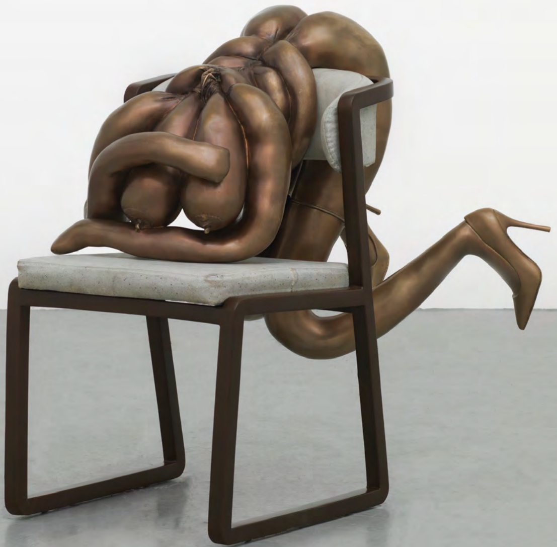
Sarah Lucas SEX BOMB , 2022 bronze, concrete 87.1 x 61.7 x 98.2 cm / 34 1/4 x 24 1/4 x 38 5/8 in edition 2 of 6 + 2 a/ps HQ27-SL20221S