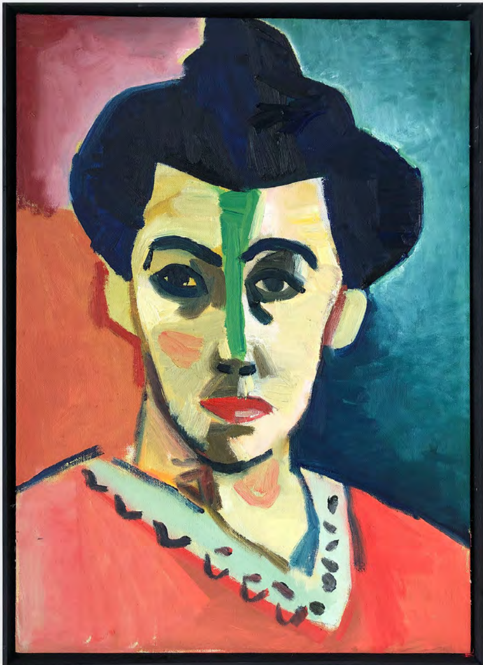
Wilhelm Sasnal Untitled (after "The 2023 Green Stripe" by Henri Matisse), 2023 oil on canvas, wooden frame site size: 70 x 50 cm / 27 1/2 x 19 3/4 in frame size: 72.5 x 52.5 x 5 cm / 28 1/2 x 20 5/8 x 2 in HQ27-WS20451P