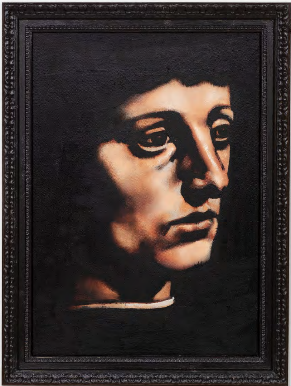
Wilhelm Sasnal Untitled (after "Portrait of a Musician" by Leonardo da Vinci) , 2023 oil on canvas, wooden frame site size: 55 x 40 cm / 21 \frac{5}{8} x 15 \frac{3}{4} in frame size: 58 x 43.5 x 2.5 cm / 22 \frac{7}{8} x 17 \frac{1}{8} x 1 in HQ27-WS20450P