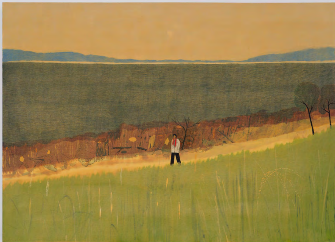
Yu Nishimura lakeside , 2024 oil on linen 130 x 180 cm / 51 \frac{1}{8} x 70 \frac{3}{8} in HQ28-YN21070P