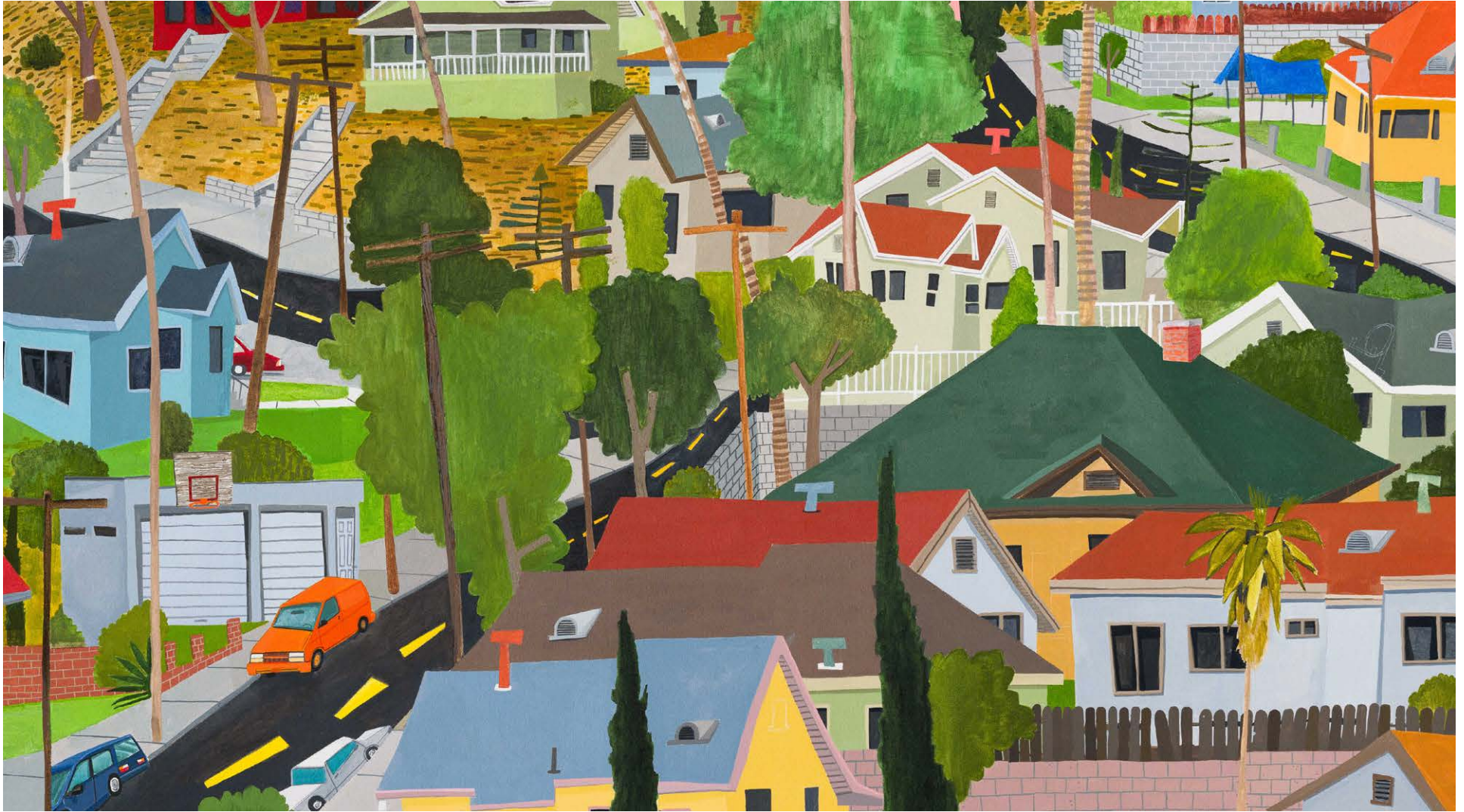
MANUEL LÓPEZ THE ARMORY SHOW 2024