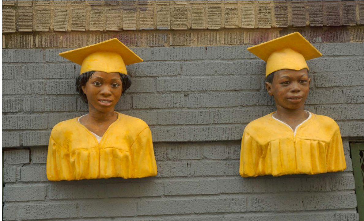
Graduates at 2008 block party.