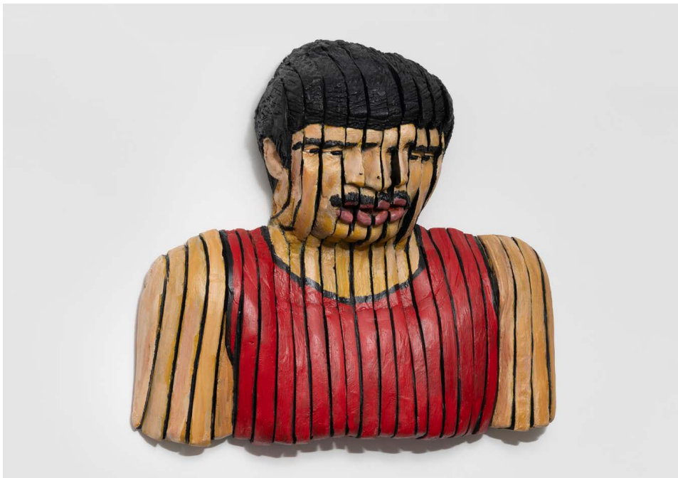
Rigoberto Torres Split Self/Asthma Attack Acrylic on plaster 26.5 x 23 x 9 inches 1994/2023 $25,000