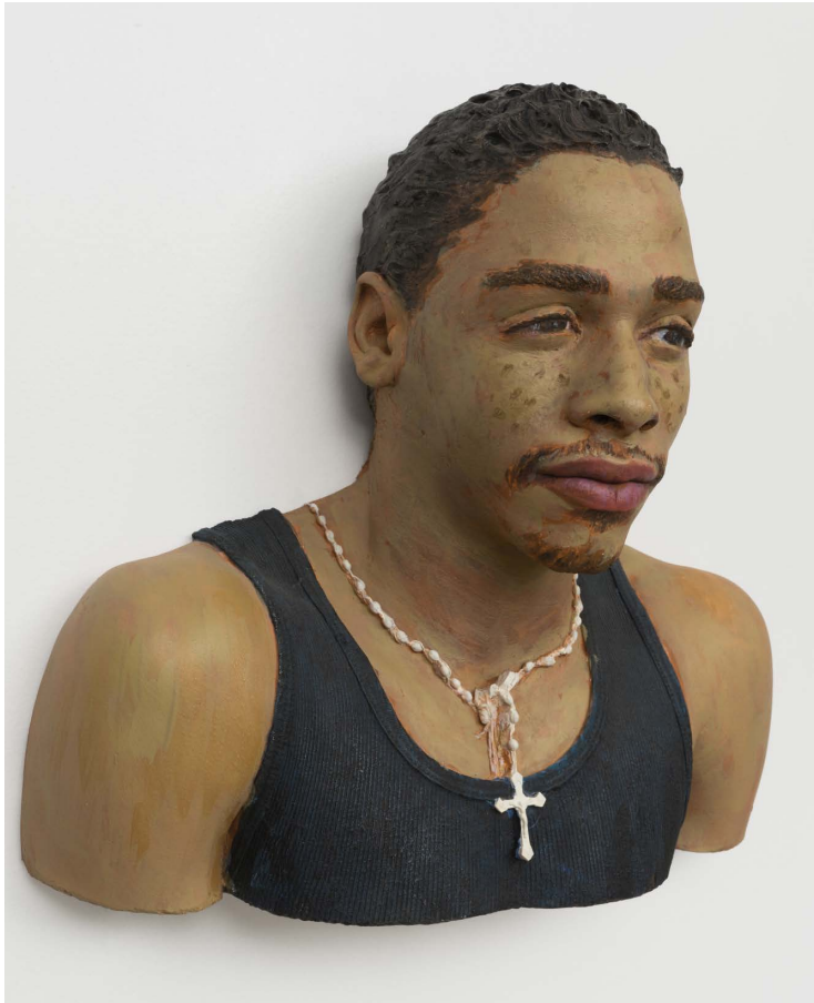
John Ahearn Willy Acrylic on plaster 16 x 17 x 9 inches 1985 $25,000