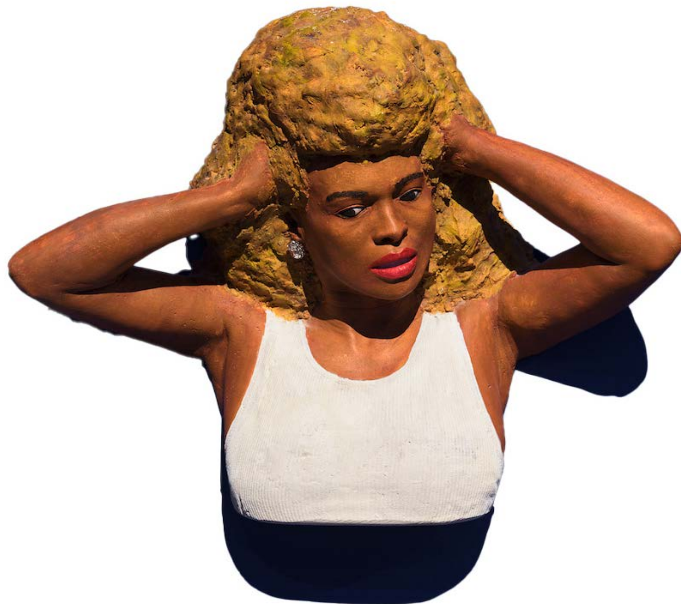
Rigoberto Torres Margie Villa Acrylic on plaster 29 x 24 x 11.5 inches 1993 $25,000