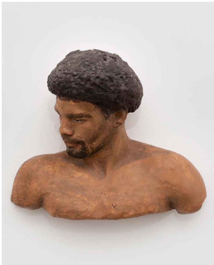
John Ahearn Chico Oil on plaster 15 x 19 x 7 inches 1981 $25,000