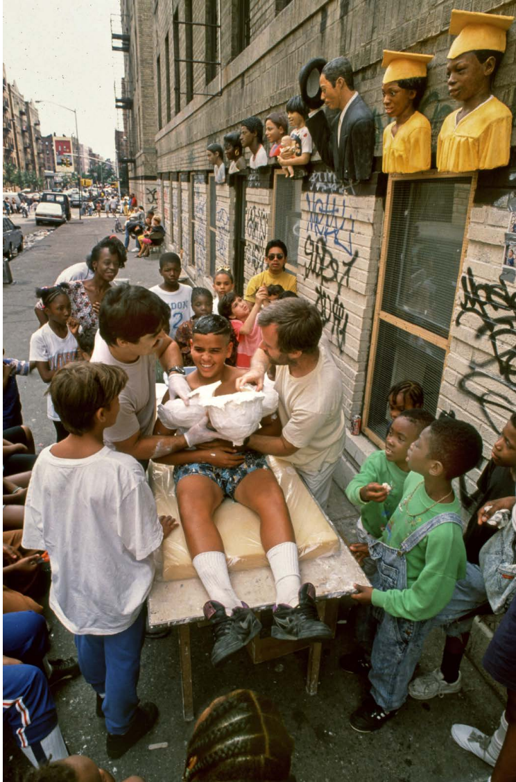
Walton Ave. 1989