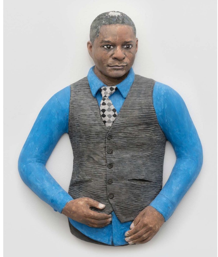
John Ahearn Nikki Acrylic on plaster 22 x 19 x 7.5 inches 1991