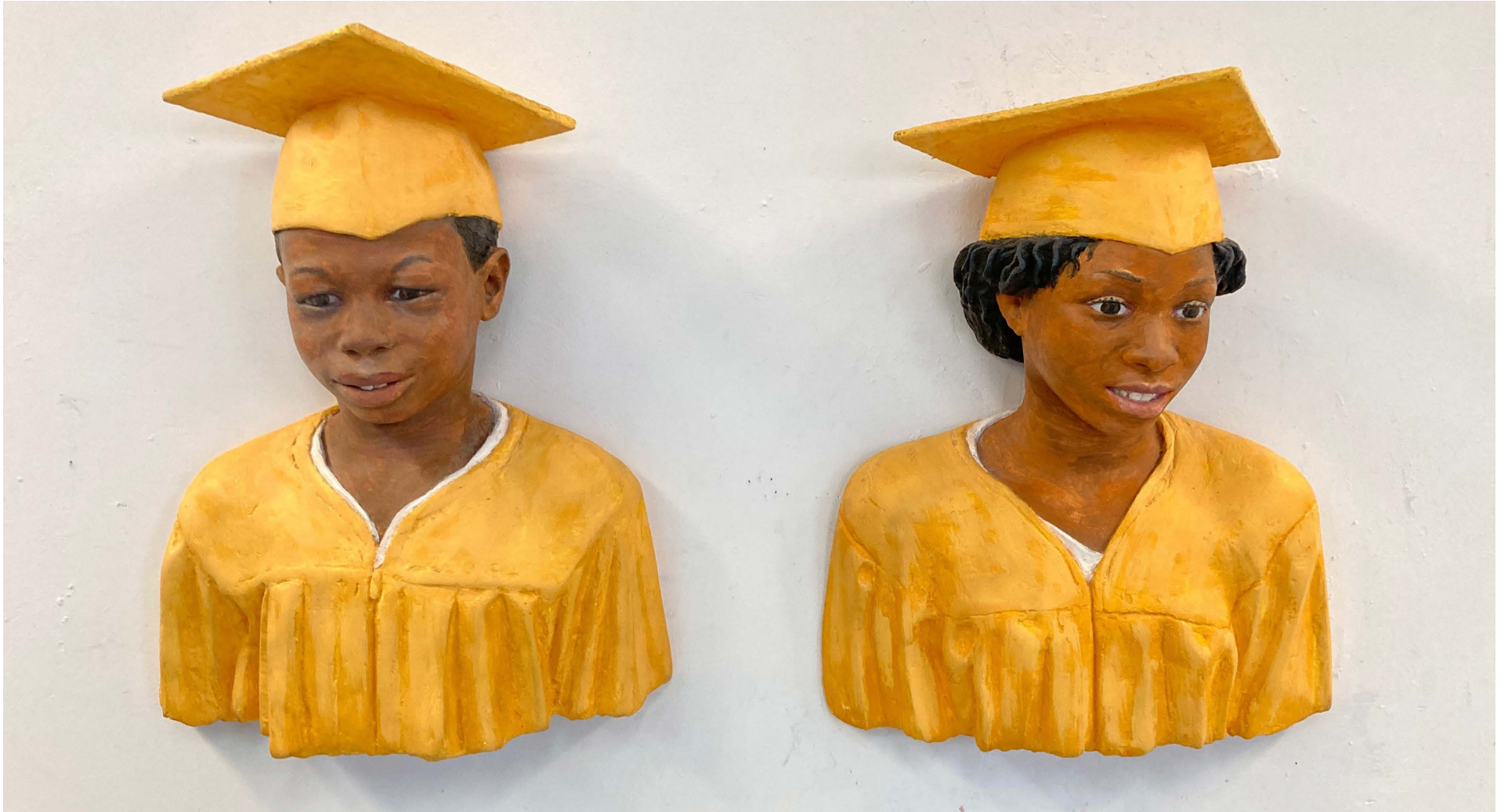
John Ahearn and Rigoberto Torres The Graduates (Princess and Bashira) Acrylic on plaster Diptych | 22 x 17 x 9 inches each 1989 $45,000