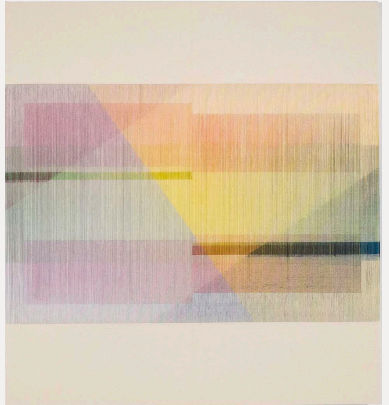
Myles Bennett Tangent Waves #1, 2024 Ink, Acrylic, and Graphite on Canvas 39 x 36 in (99.1 x 91.4 cm) $6,200