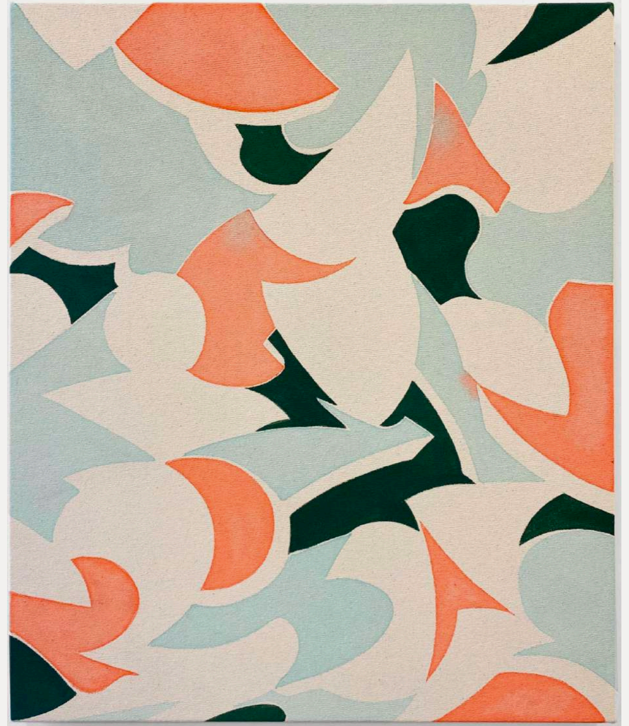
Shawn Kuruneru Sea Fireflies, 2024 Acrylic on raw canvas 24 x 20 in (61 x 50.8 cm) $5,000