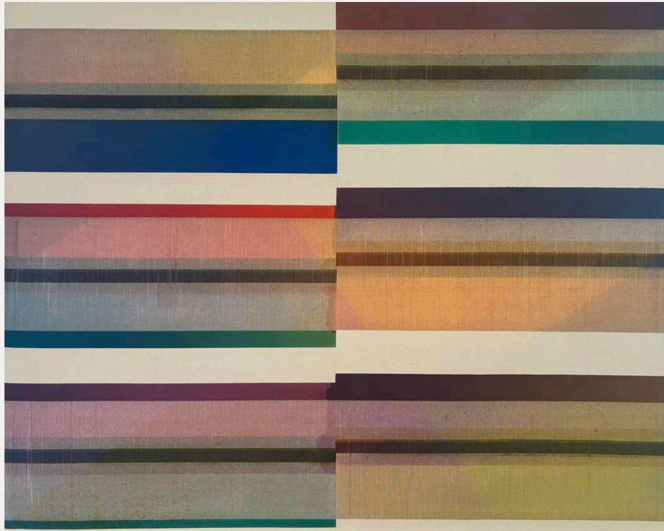
Myles Bennett Prism Shard #4, 2024 Ink, Acrylic, Graphite and Colored Pencil on Canvas 48 x 60 in (121.9 x 152.4 cm) $15,000