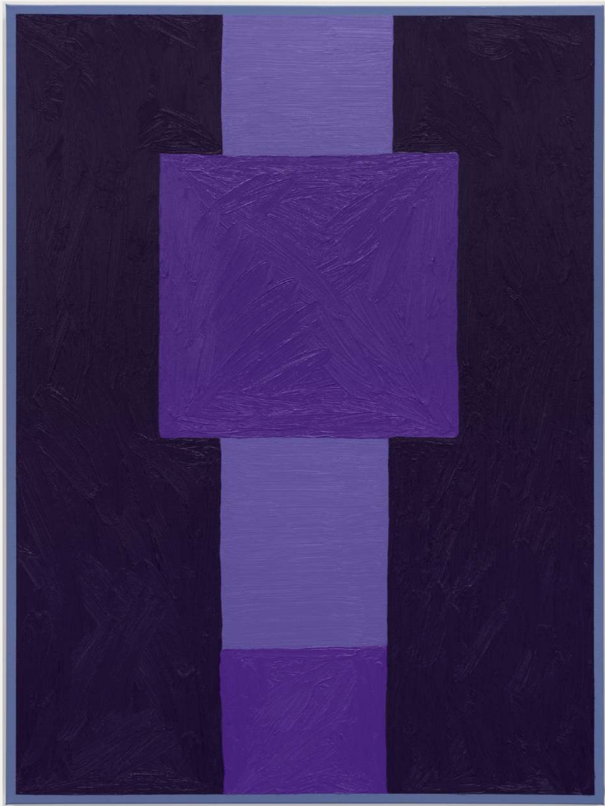
Russell Tyler Dreamcast, 2023 Oil and acrylic on canvas 40 x 30 in (101.6 x 76.2 cm) $8,000