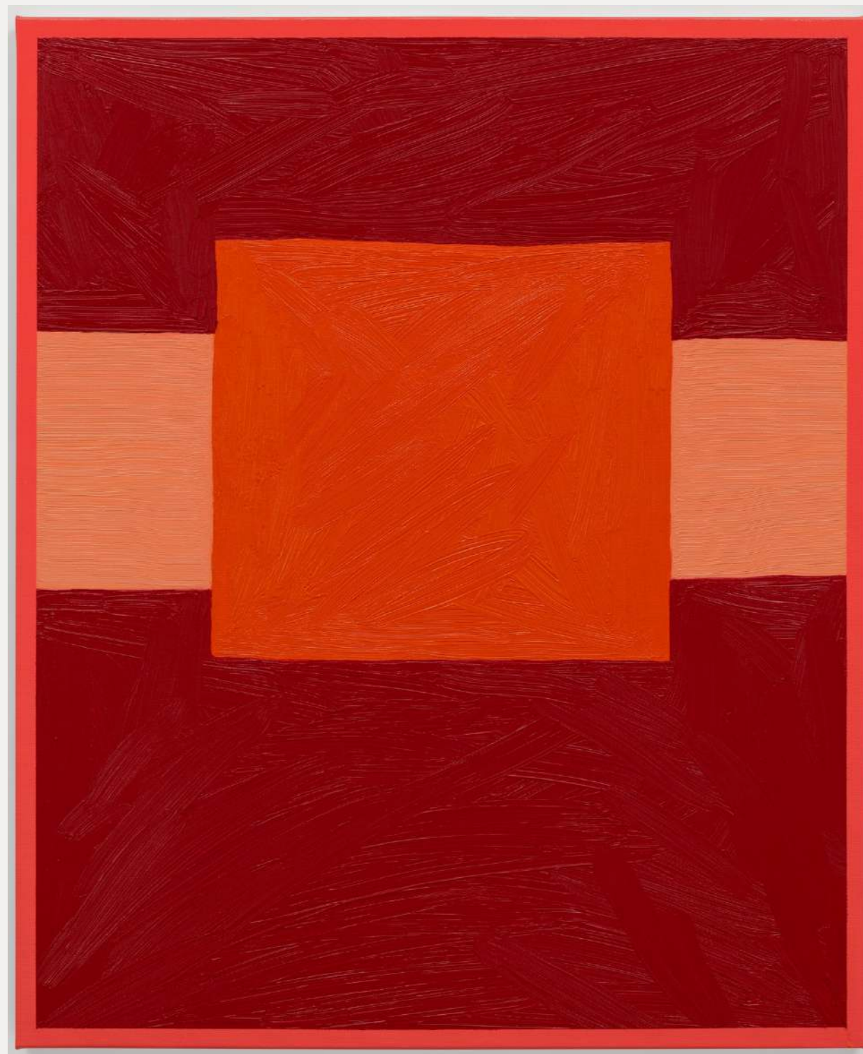
Russell Tyler SHB, 2023 Oil and acrylic on canvas 24 x 20 in (61 x 50.8 cm) $5,000