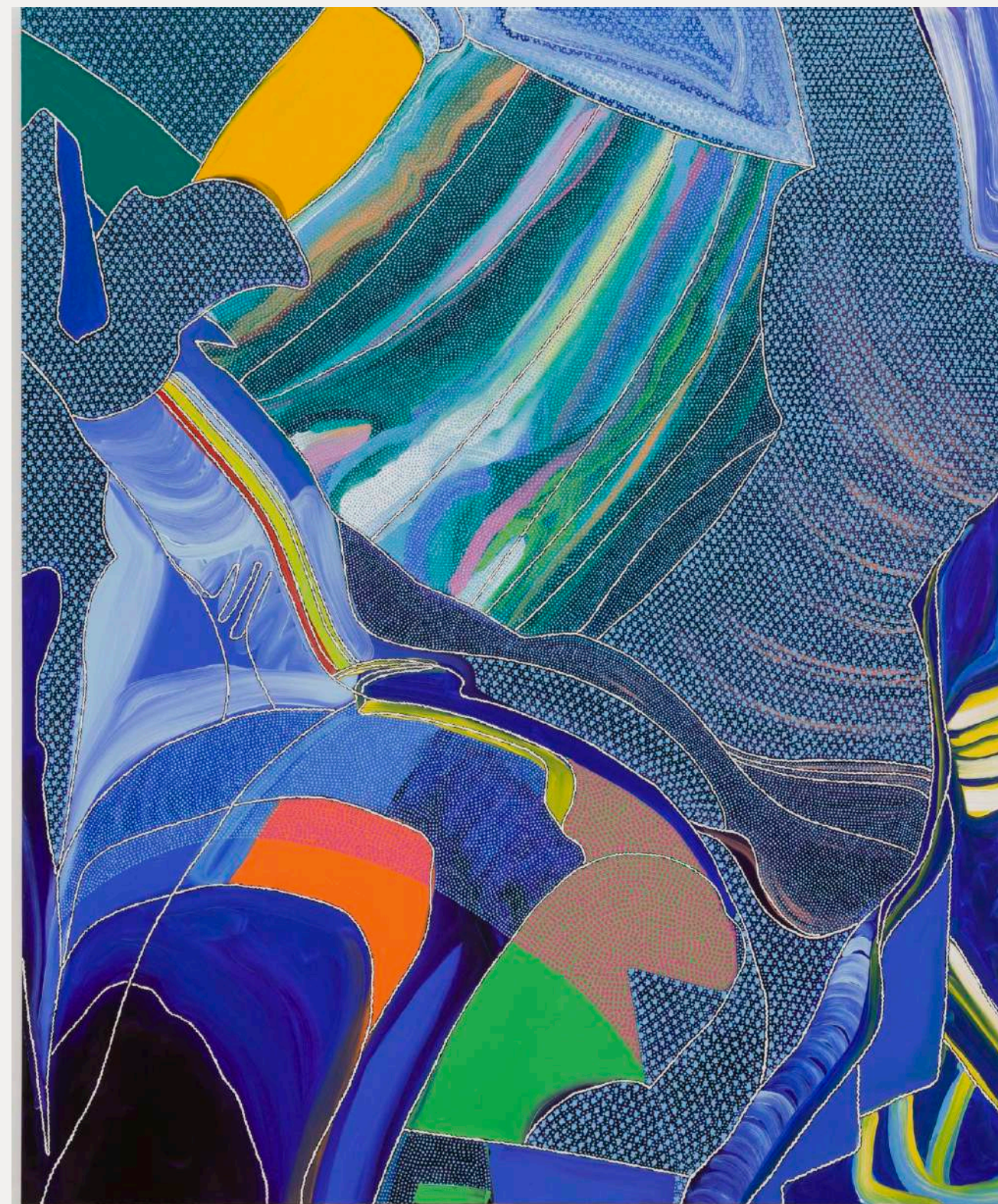
Heather Guertin Chrome, 2024 Oil on canvas 66 x 54 in (167.6 x 137.2 cm) $27,000