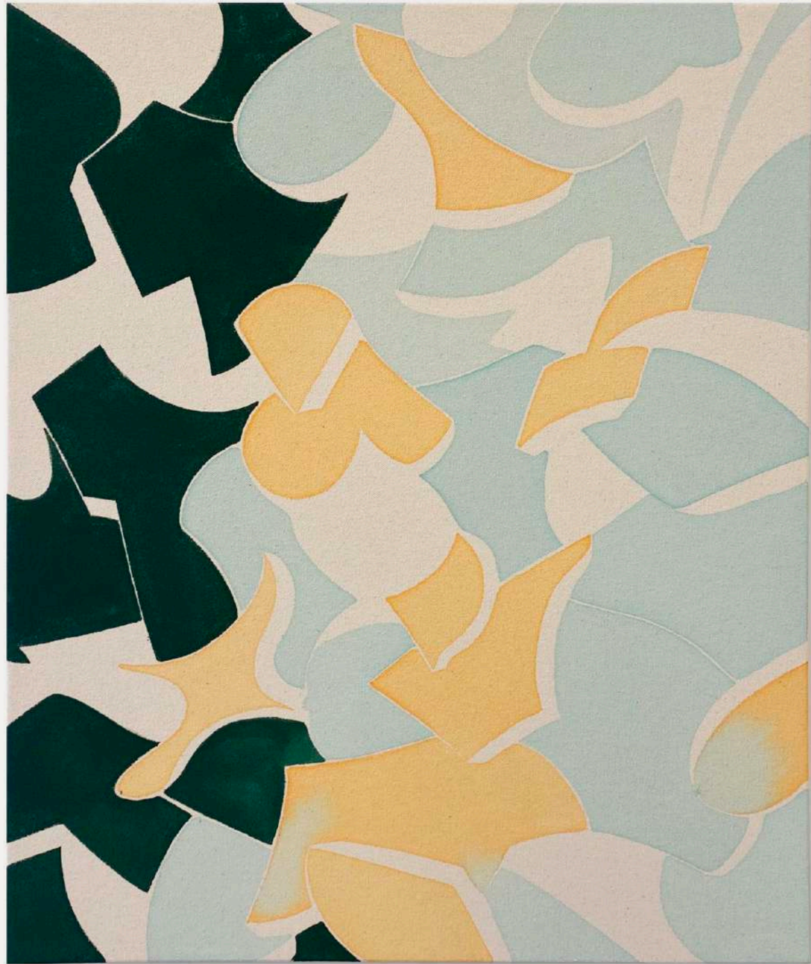
Shawn Kuruneru Little Wing, 2024 Acrylic on raw canvas 24 x 20 in (61 x 50.8 cm) $5,000