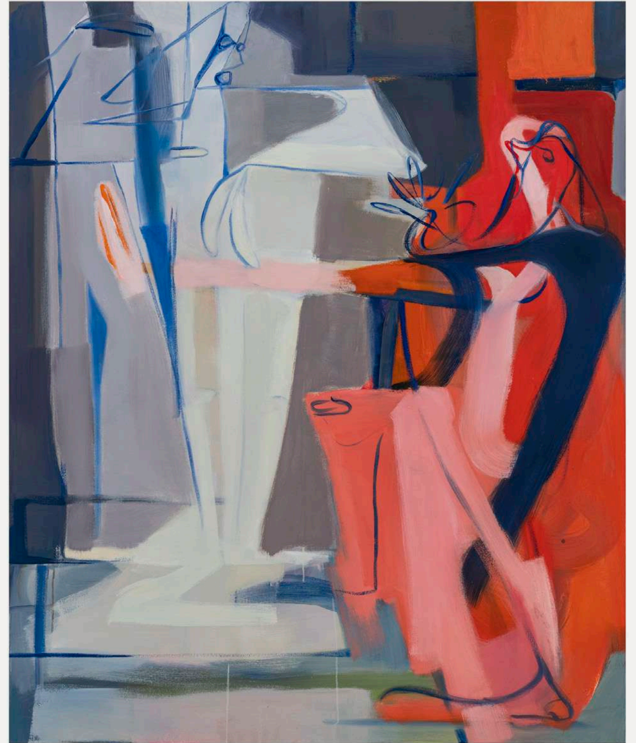
Jamie Gray Williams The Hand Refrains (Pygmalion), 2024 Acrylic and oil on canvas 60 x 50 in (152.4 x 127 cm) $8,000