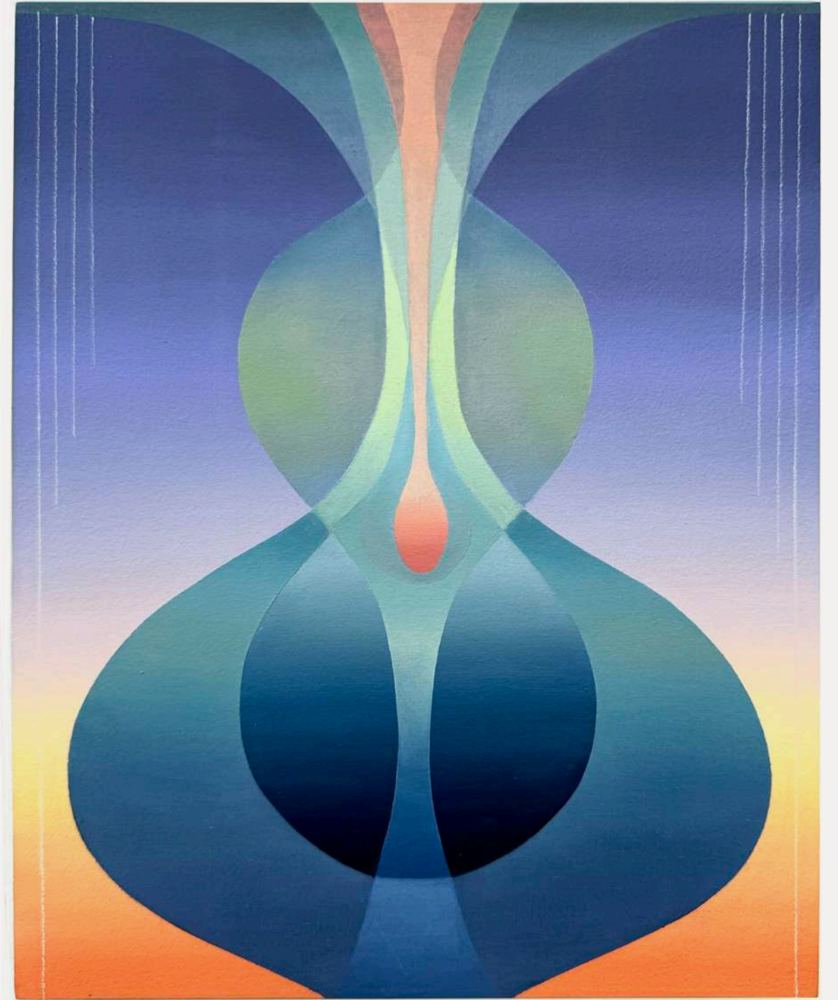
Minako Iwamura Sixty Seven, 2024 Oil and white charcoal on cradled wood panel 10 x 8 in (25.4 x 20.3 cm) $2,200