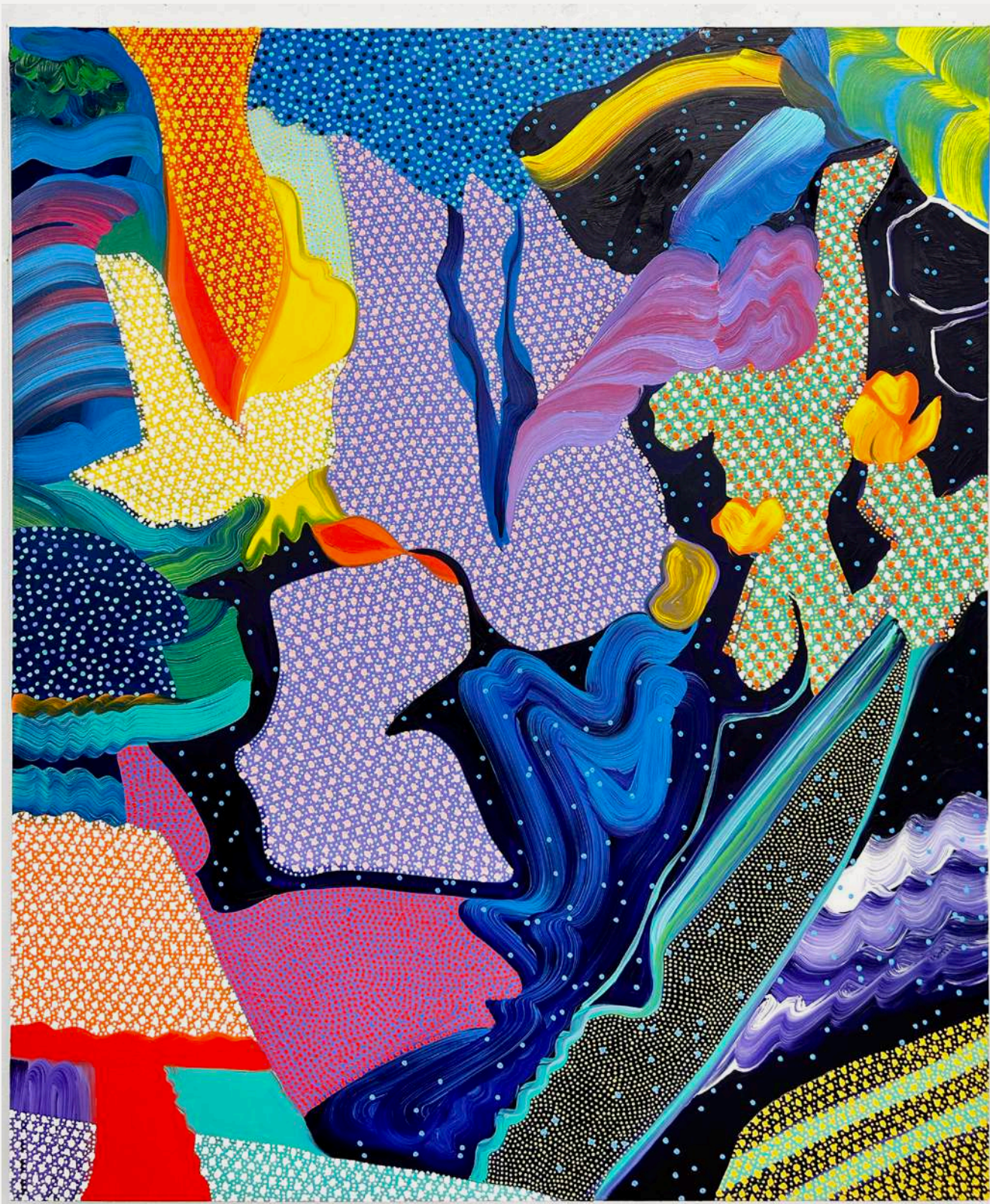
Heather Guertin Stonecrop, 2024 Oil on canvas 48 x 40 in (121.9 x 101.6 cm) $19,000