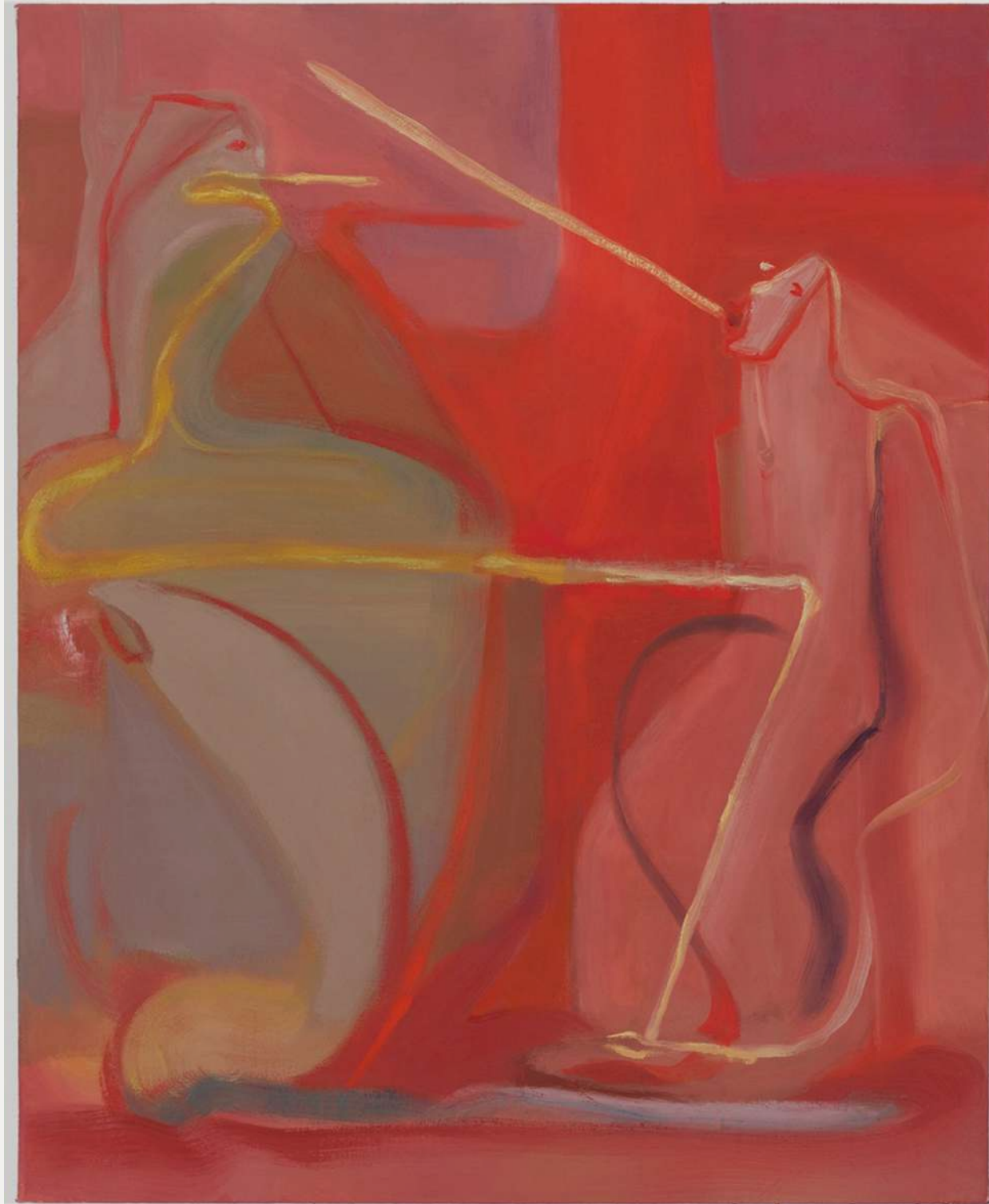
Jamie Gray Williams Light Passing Through Both Ends, 2023 Acrylic and oil on canvas 32 x 26 in (81.3 x 66 cm) $4,500