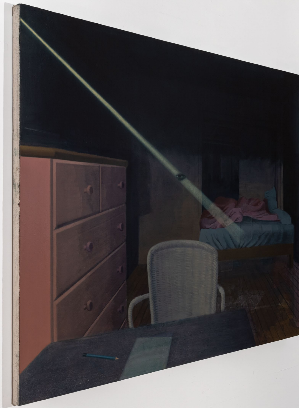
Phyllis Yao Lonely , 2024 Oil and acrylic on canvas 42 x 54 inches PY0019 $ 10,000.00 USD