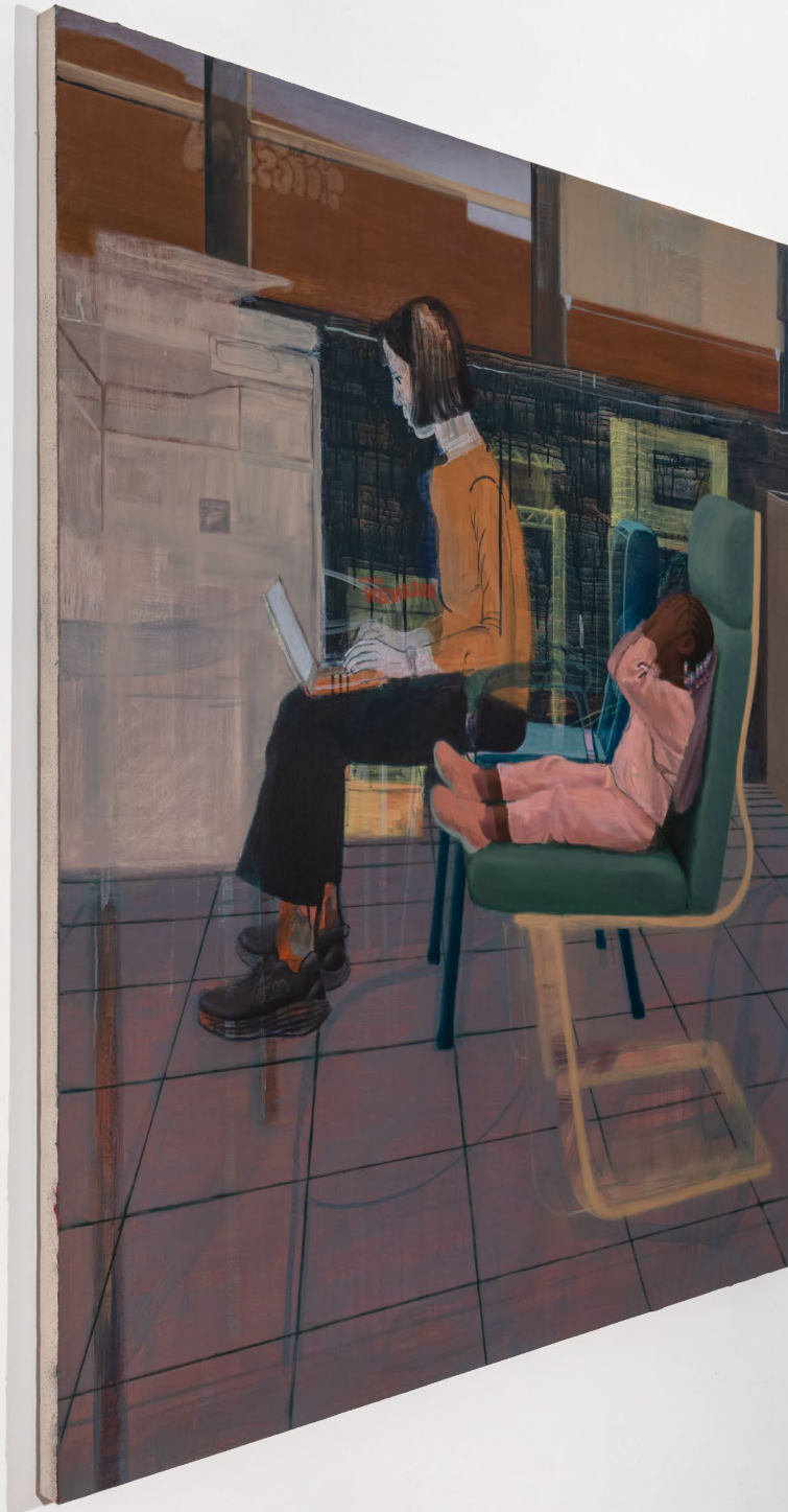
Phyllis Yao Crying with My Student , 2024 Oil and acrylic on canvas 56 x 48 inches PY0018 $ 11,500.00 USD