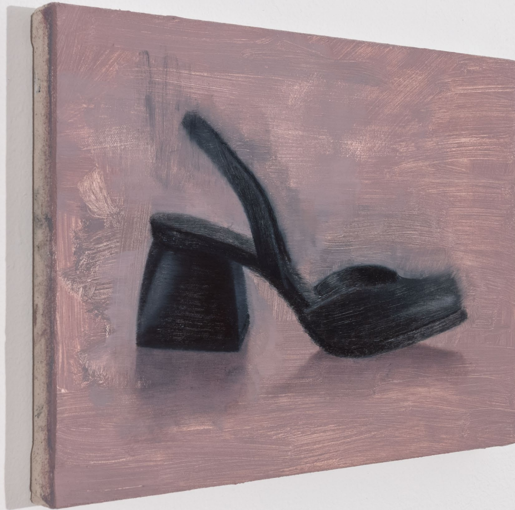
Phyllis Yao Can Someone Please Buy Me These Shoes? , 2024 Oil on canvas 10 x 14 inches PY0016 $ 4,000.00 USD