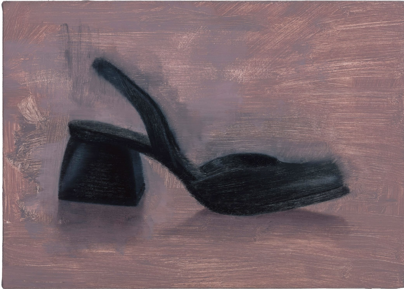
Phyllis Yao Can Someone Please Buy Me These Shoes? , 2024 Oil on canvas 10 x 14 inches PY0016 $ 4,000.00 USD