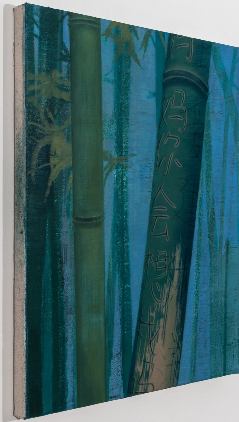
Phyllis Yao Mama will you miss me? , 2024 Oil on canvas 26 x 22 inches PY0017 $ 6,000.00 USD