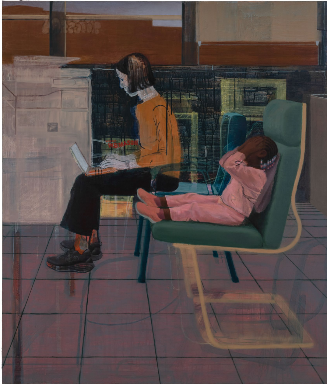
Phyllis Yao Crying with My Student , 2024 Oil and acrylic on canvas 56 x 48 inches PY0018 $ 11,500.00 USD