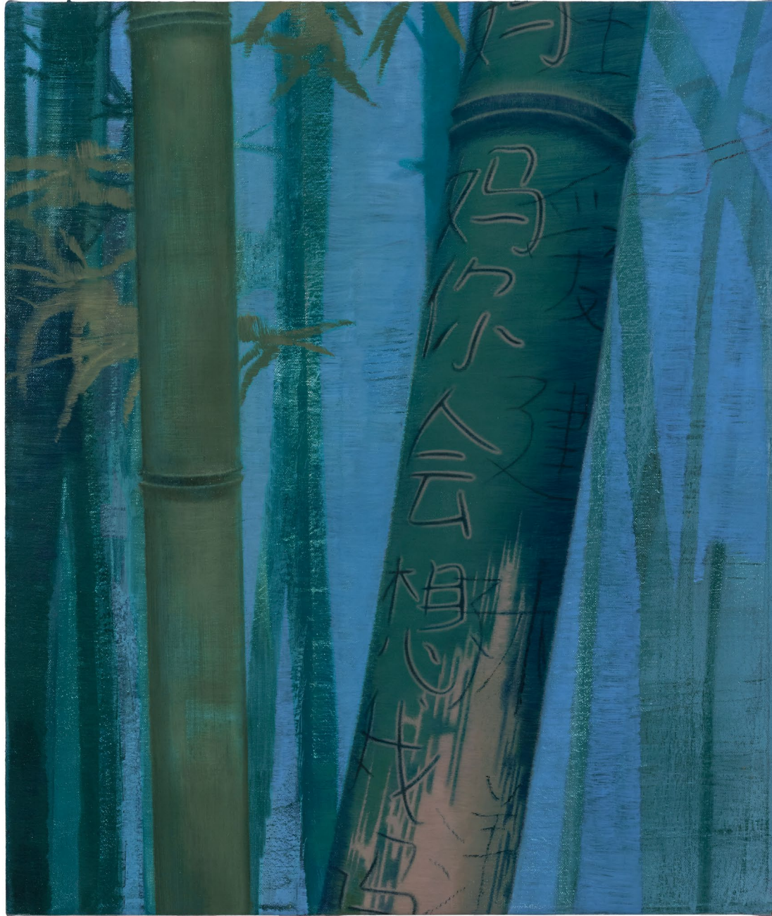
Phyllis Yao Mama will you miss me? , 2024 Oil on canvas 26 x 22 inches PY0017 $ 6,000.00 USD