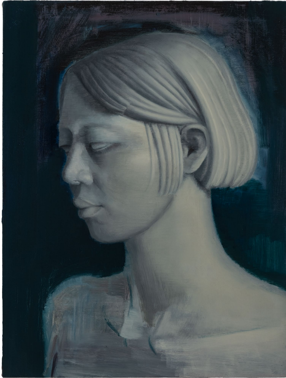
Phyllis Yao Self-Portrait as a Greek Statue , 2024 Oil on canvas 21 x 16 inches PY0015 $ 5,000.00 USD