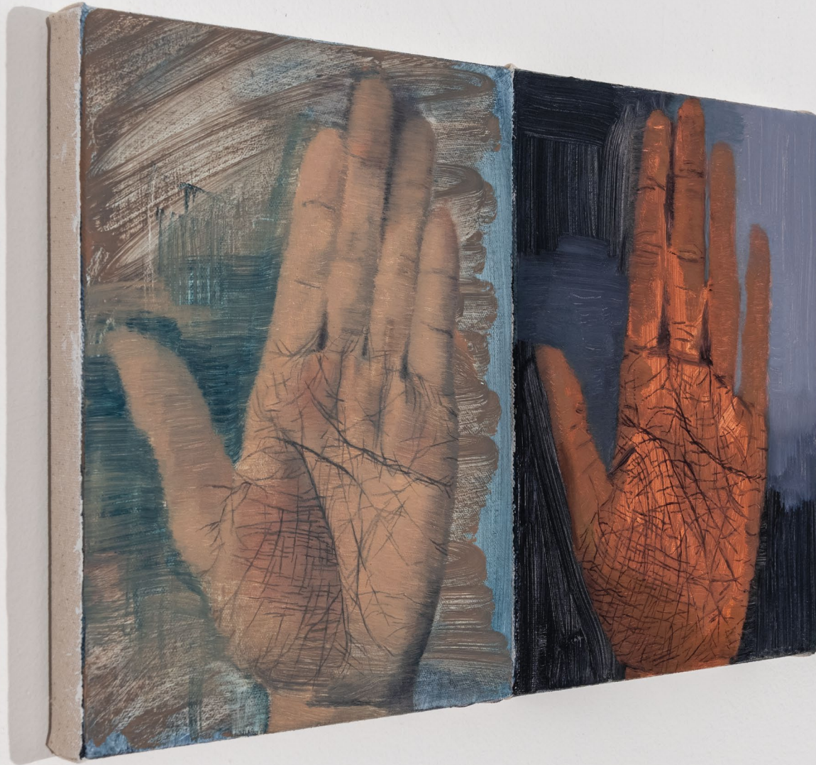
Phyllis Yao Our Fortune , 2024 Oil on canvas 10 x 16 inches PY0020 $ 4,500.00 USD