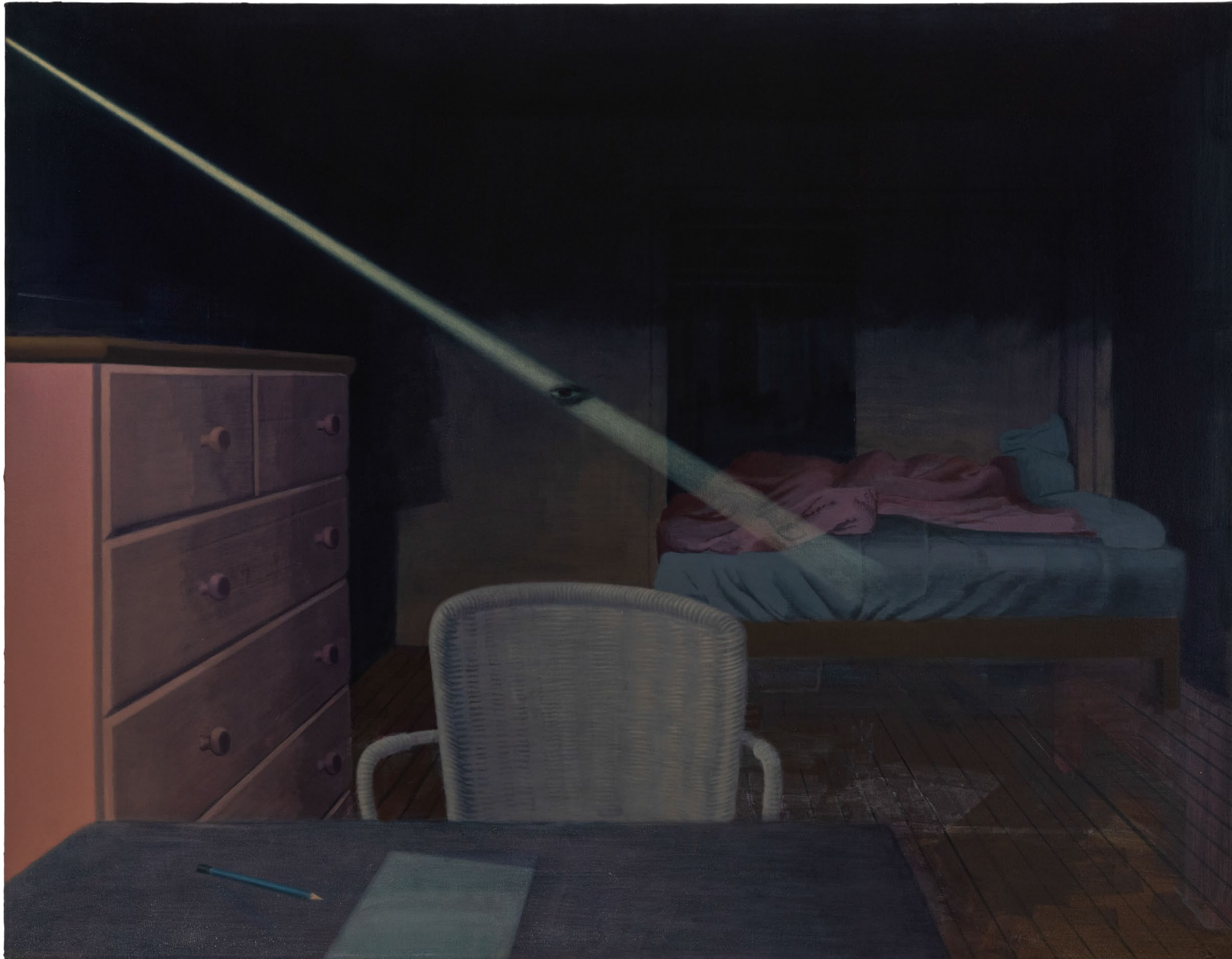
Phyllis Yao Lonely , 2024 Oil and acrylic on canvas 42 x 54 inches PY0019 $ 10,000.00 USD