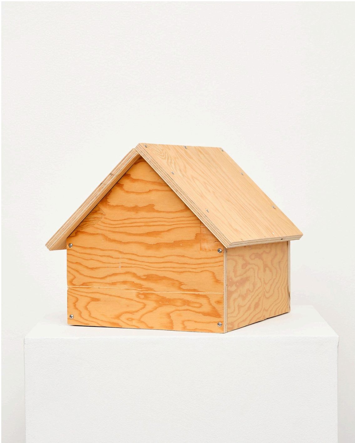
Reverse view, Wood house 2