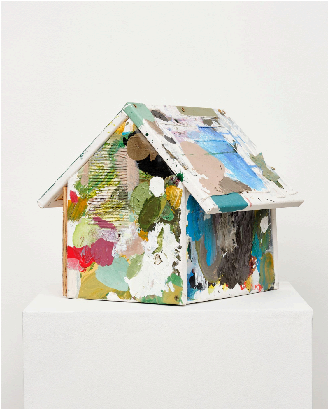
Reverse view, Painting House