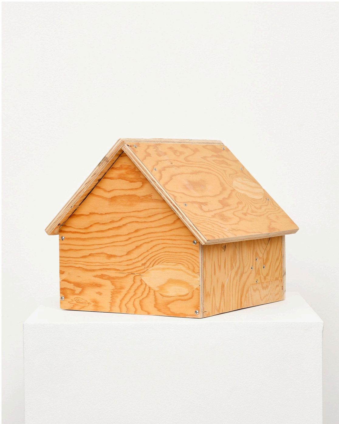
Reverse view, Wood House 1