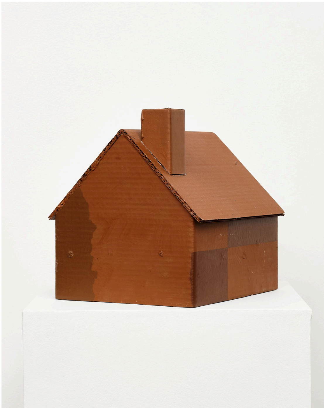
Reverse view, Cardboard House