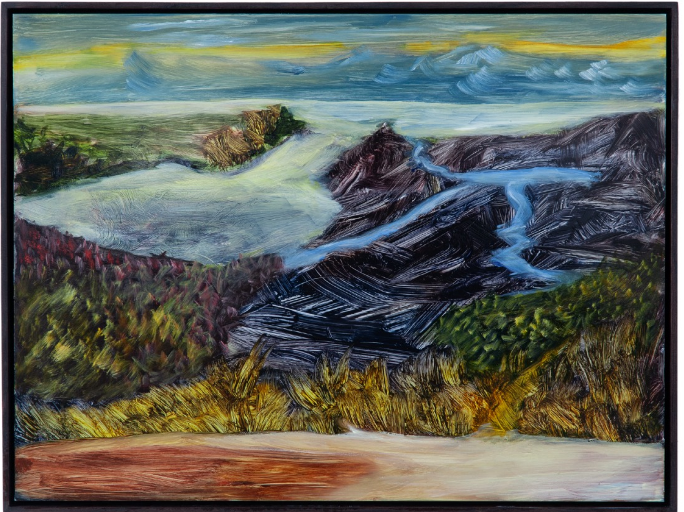
Jamiu Agboke Where there used to be rain, 2024 Oil on aluminium in walnut frame 16 x 12 1/4 in (41 x 31 cm) $ 10,500 USD