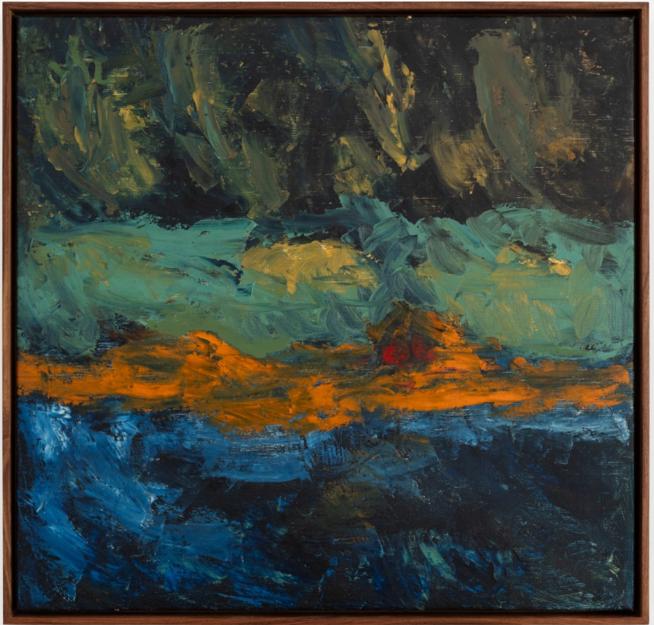
Yu Kobayashi YK-094, 2024 Oil on canvas 17 x 17 in (43.2 x 43.2 cm) $ 5,000 USD