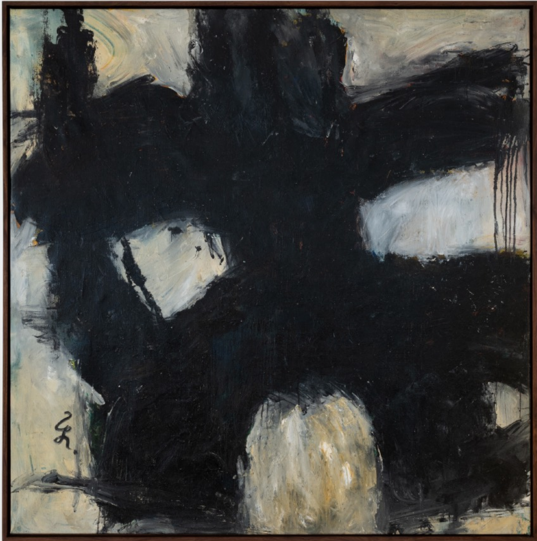
Yu Kobayashi YK-153, 2024 Oil on canvas 56 1/2 x 55 3/4 in (144 x 142 cm) $ 10,000 USD