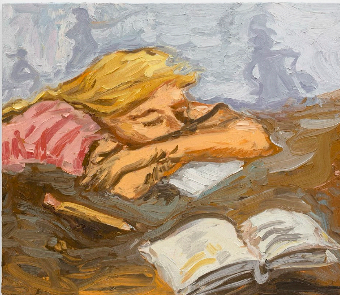
Jane Corrigan Classroom , 2024 Oil on linen 24 x 28 in (61 x 71 cm) $ 8,500 USD