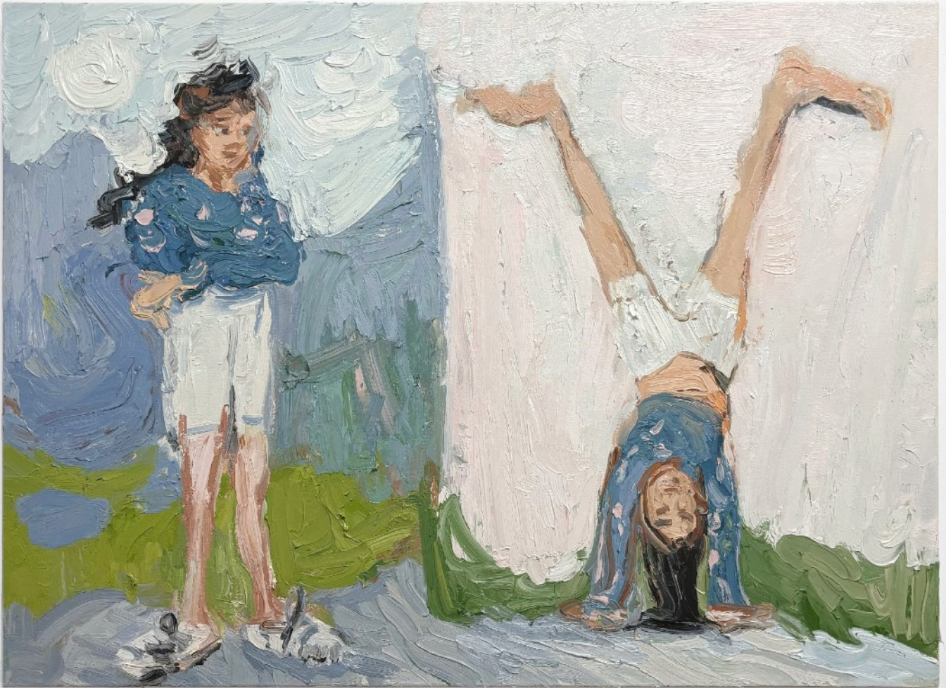
Jane Corrigan Handstand (Double Self) , 2024 Oil on canvas 28 ½ x 39 in (72 x 99 cm) $ 10,000 USD