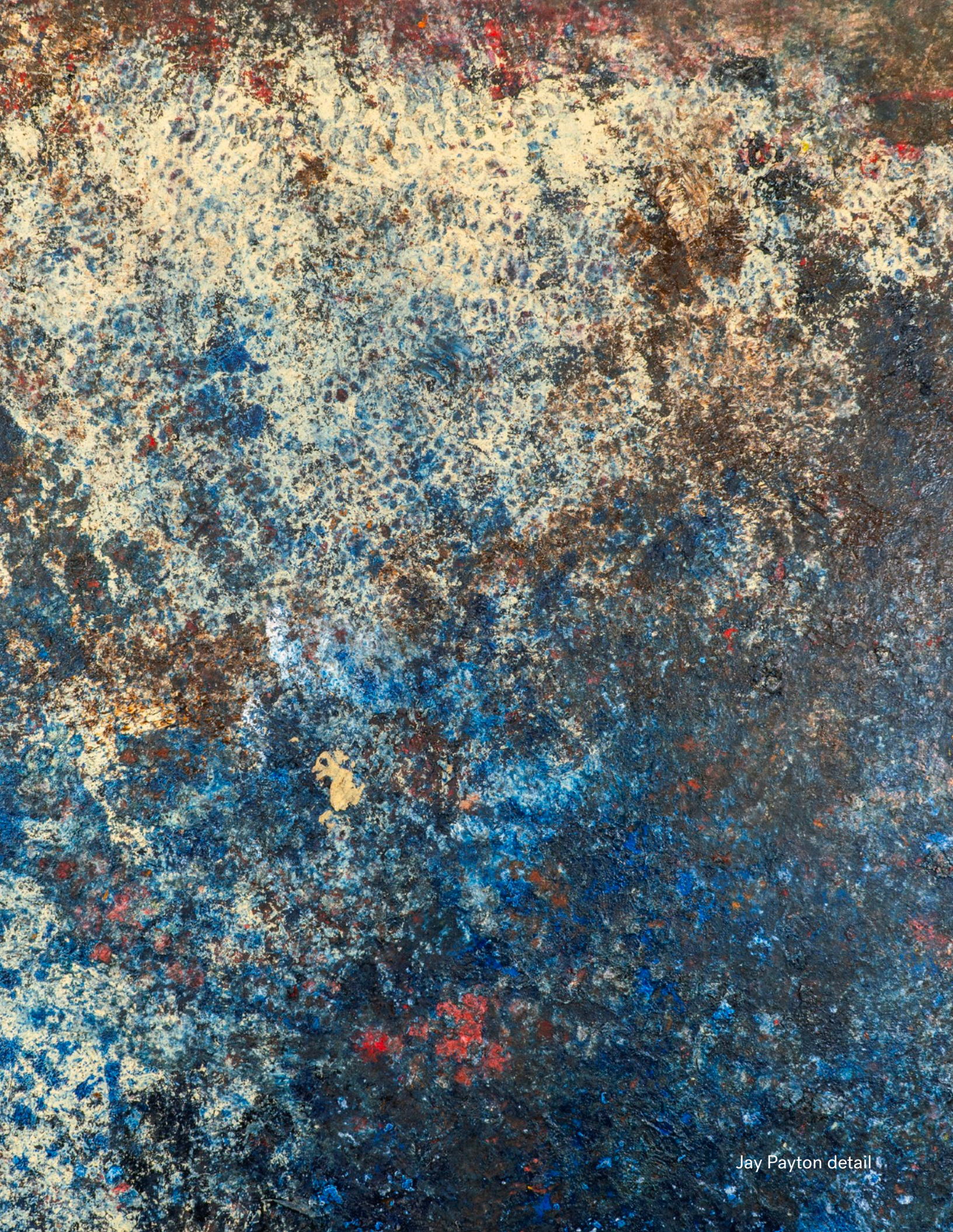
Jay Payton detail