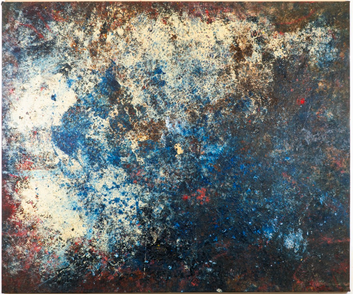
Jay Payton Thalassophobia , 2024 Oil on canvas 70 x 56 in (177.8 x 142.24 cm) $ 12,000 USD