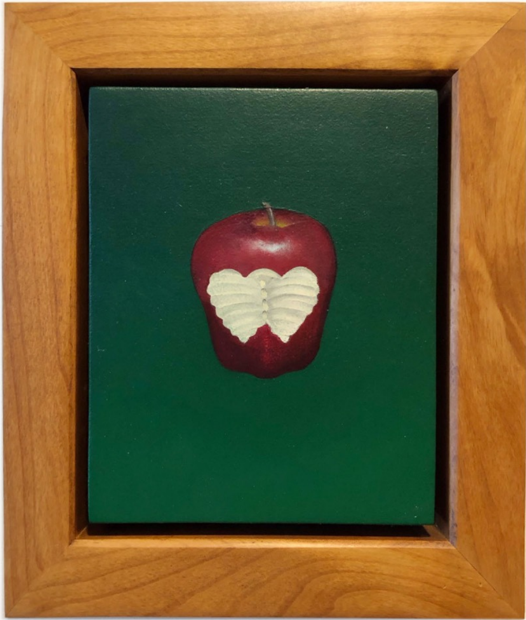
Bruce Richards Adam's Ribs II , 1990 Oil on linen over panel 11 1/4 x 9 3/4 in $ 7,500 USD