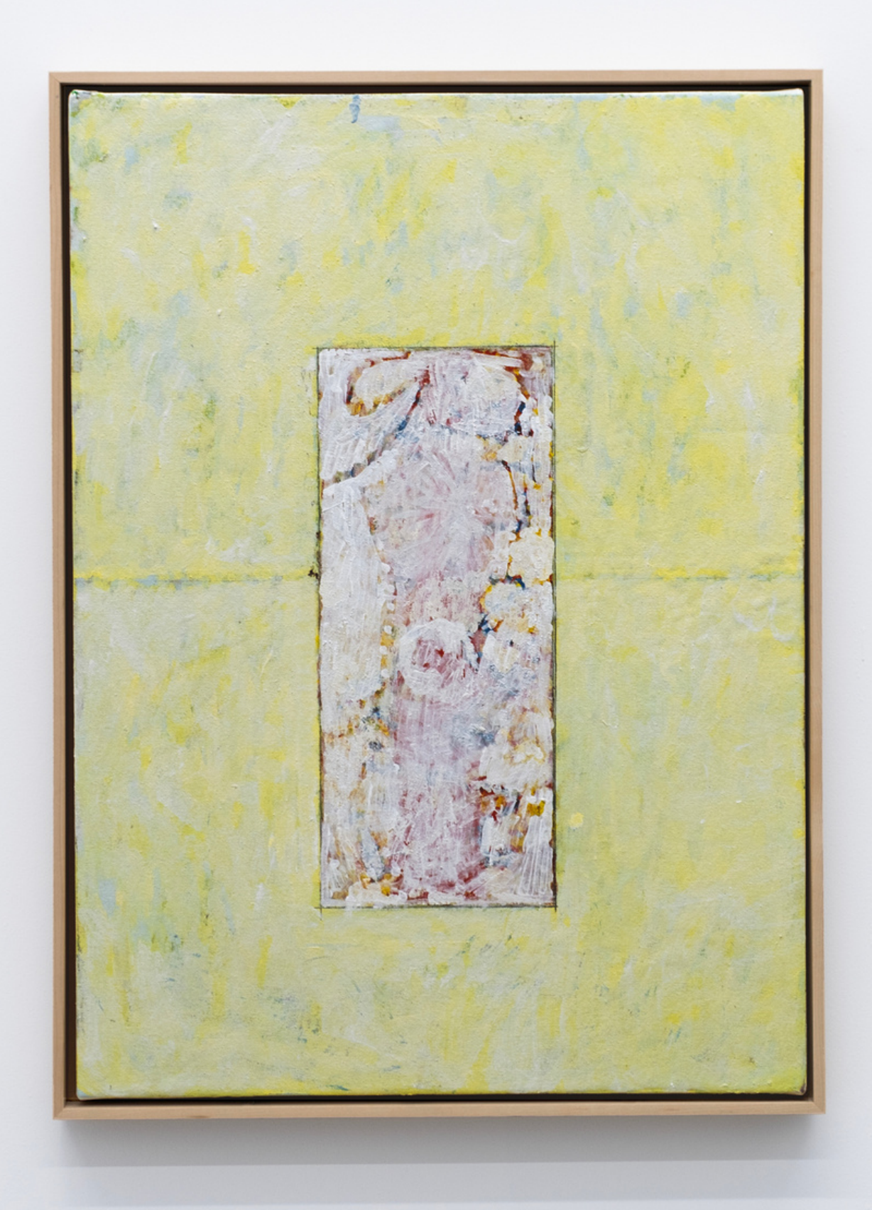
Untitled, 2024 Acrylic on canvas 26 x 19 in. / 66 x 48.3 cm 8,000