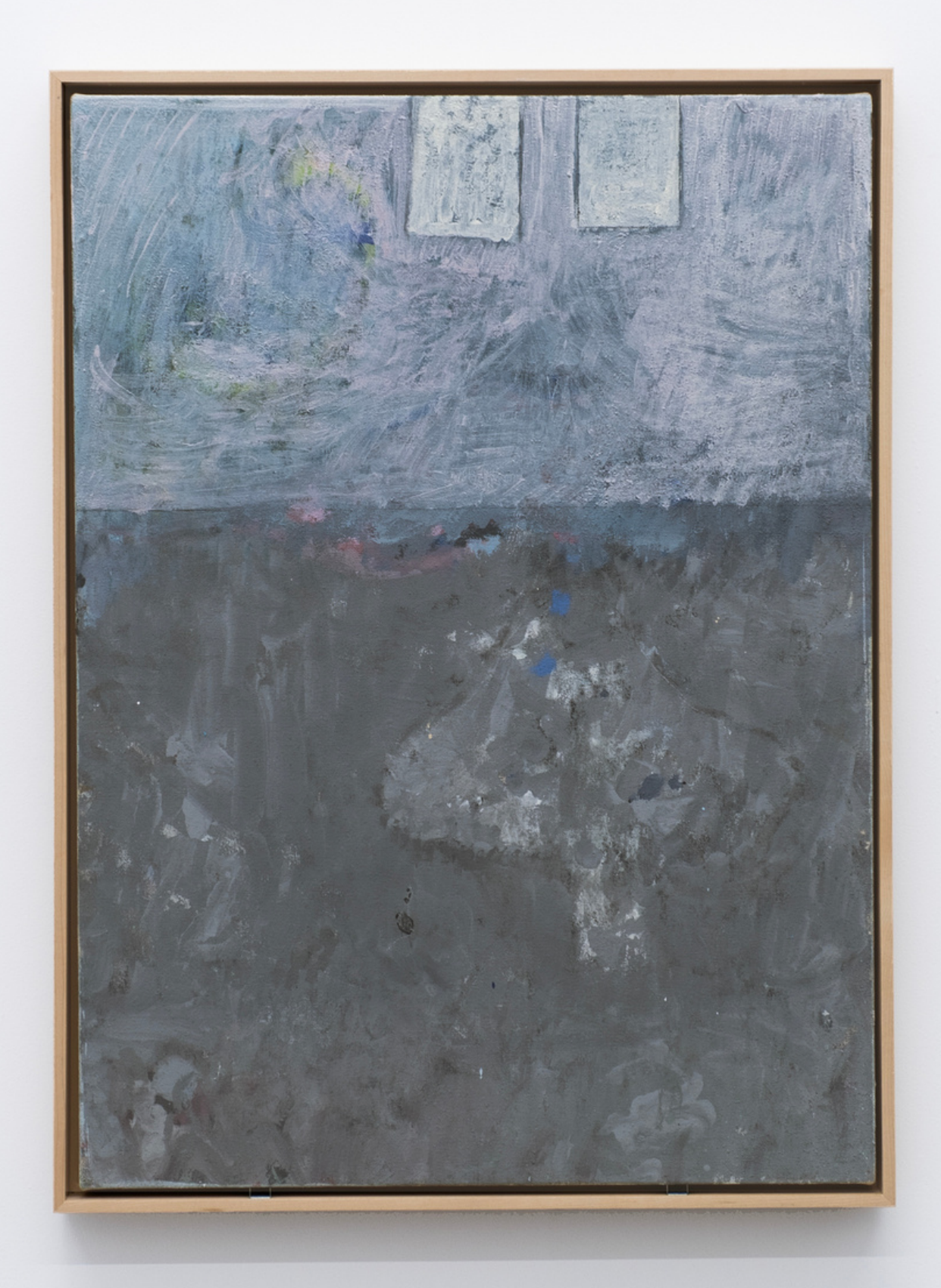
Untitled, 2024 Acrylic on canvas 26 x 19 in. / 66 x 48.3 cm 8,000