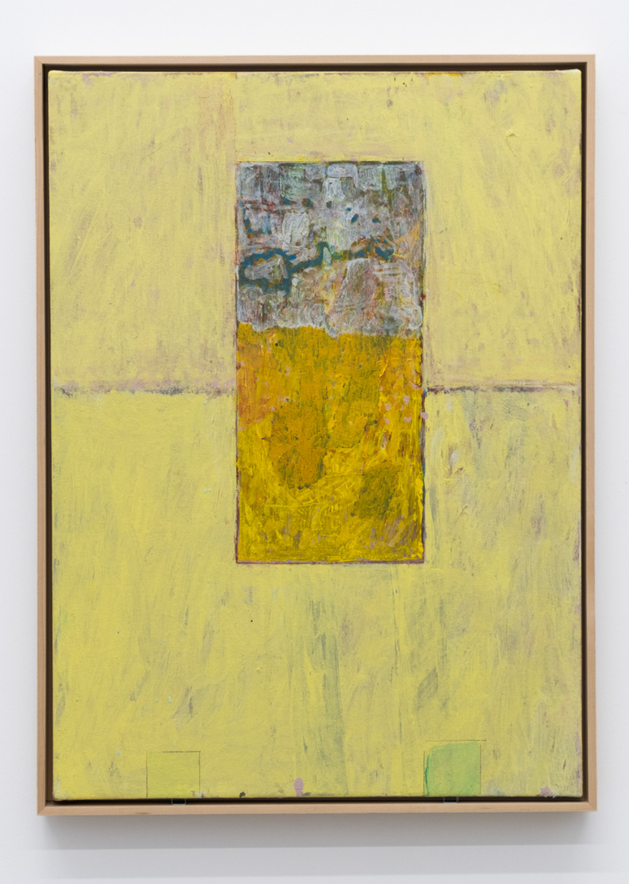
Untitled, 2024 Acrylic on canvas 26 x 19 in. / 66 x 48.3 cm 8,000