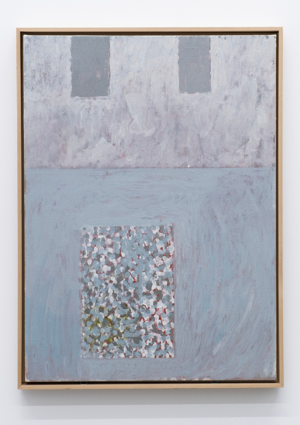
Untitled, 2024 Acrylic on canvas 26 x 19 in. / 66 x 48.3 cm 8,000