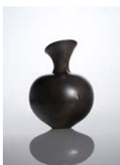
Magdalene Odundo b. 1950 Untitled , 1984 height: 33 cm / 13in; diameter: 24 cm / 9 1/2in signed 'ODUNDO' and dated '1984' to the underside burnished and carbonised terracotta

Please do not hesitate to email the gallery for our asking prices and essays on each work.