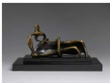
Henry Moore 1898-1986 Reclining Figure , 1939 bronze length 9 7/8 in / length 25 cm numbered 7/8 on the underside, from an edition of 8 plus 1AC, cast by Susse Fondeur