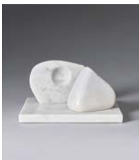
Barbara Hepworth 1903-1975 Two Forms from Delos , 1970 white marble height 5 1/4 in / height 13.3 cm BH 509