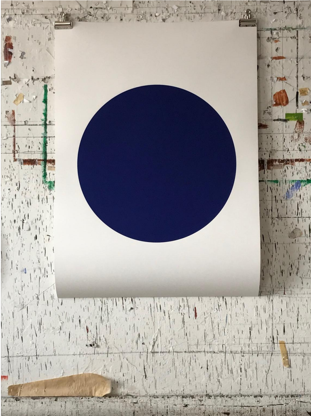
Fergus Martin Transfer 2021 Digital archival Print on 300g, Canson Etching Edition Paper 120x85x4 cm Edition 3 of 3 120 x 85 x 4cms € 7,500+vat