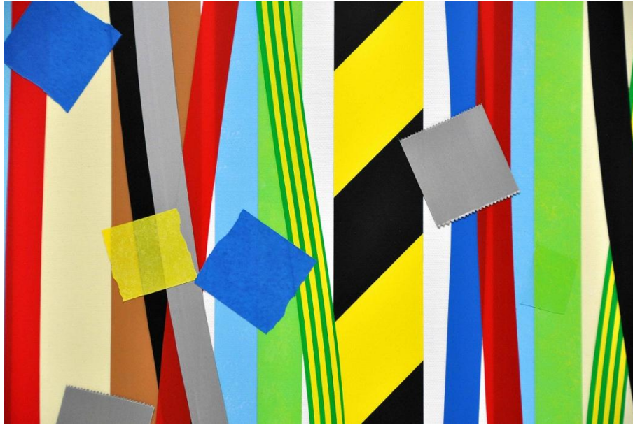
Caroline McCarthy Groovy Julia 2016 Acrylic on canvas 60 x 45 cm € 7,500+vat ( detail )