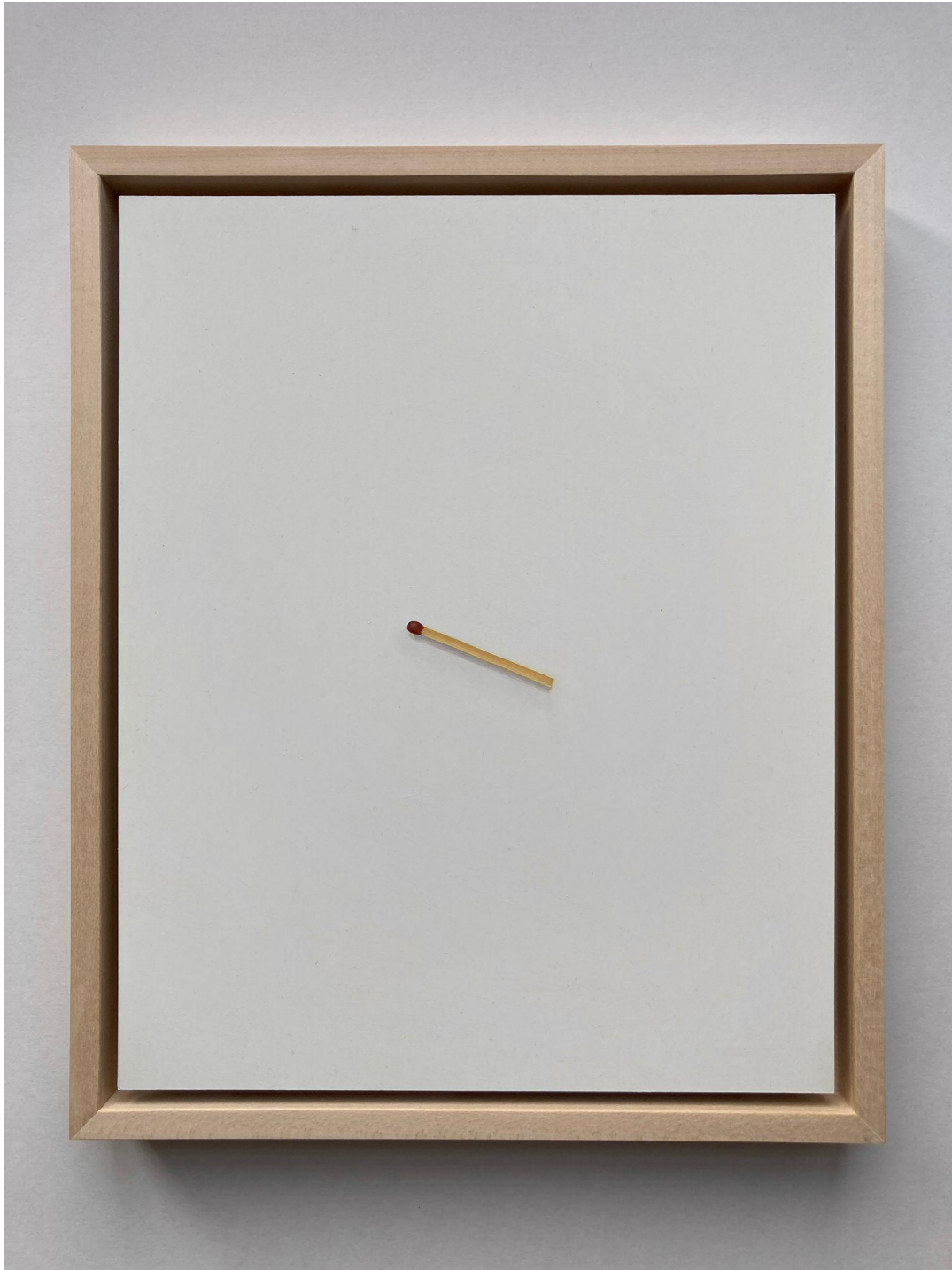
Caroline McCarthy The Perfect Match Oil on board 25 x 20cms € 5,500+vat