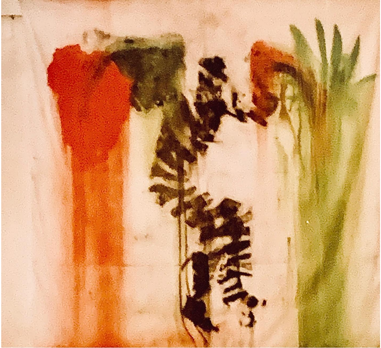
Nigel Rolfe Zebra man 1983 Raw pigment on cotton 222 x 224 cm € 16,000+vat