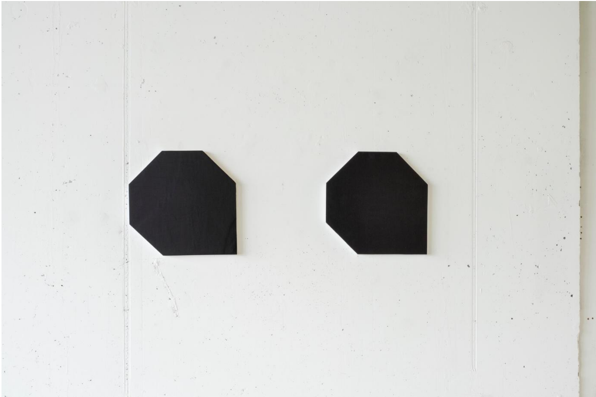
Fergus Martin Bird 2024 Acrylic on plywood 40x40x4 cm each € 8,000+vat