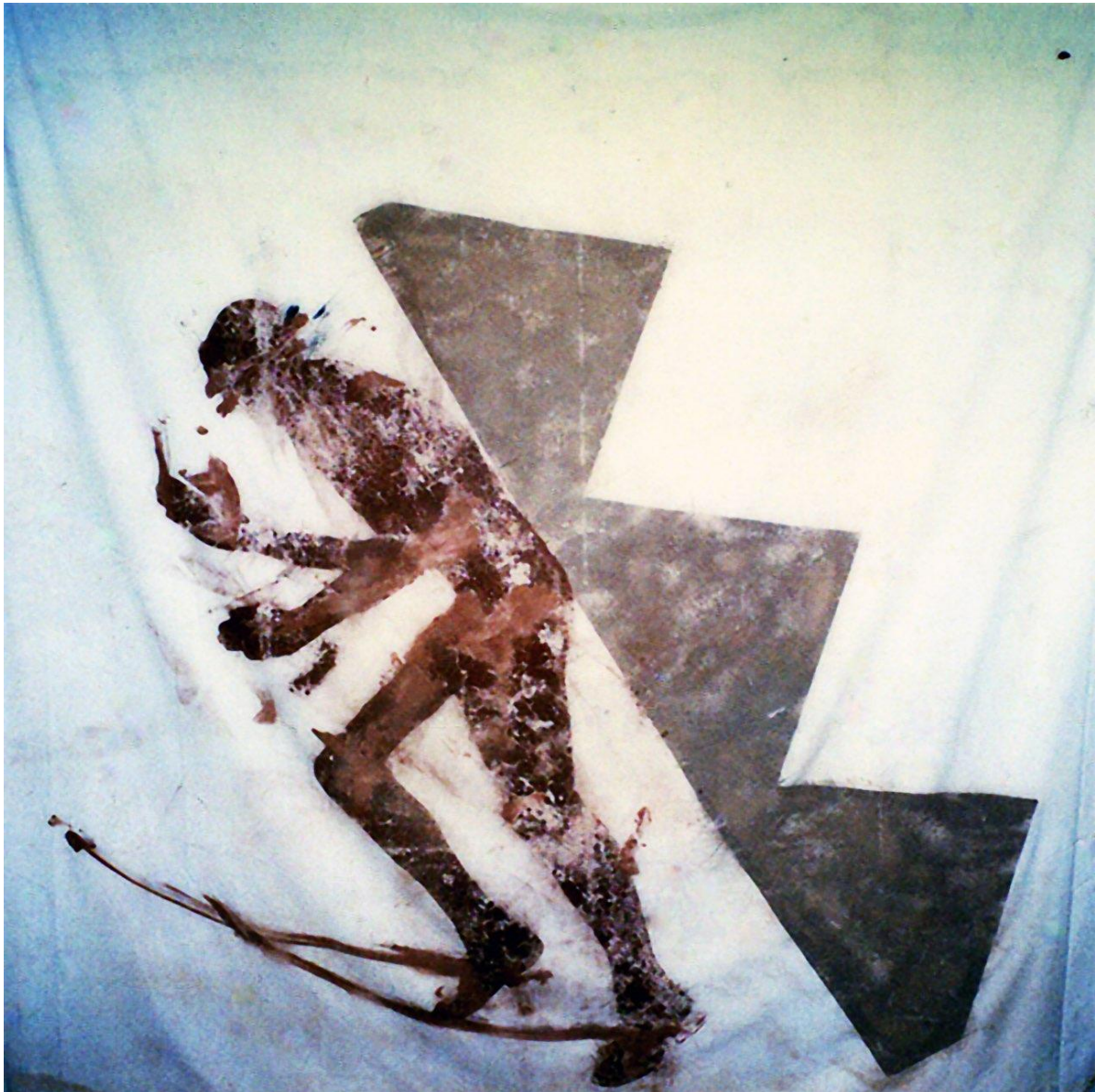
Nigel Rolfe Wings of fear