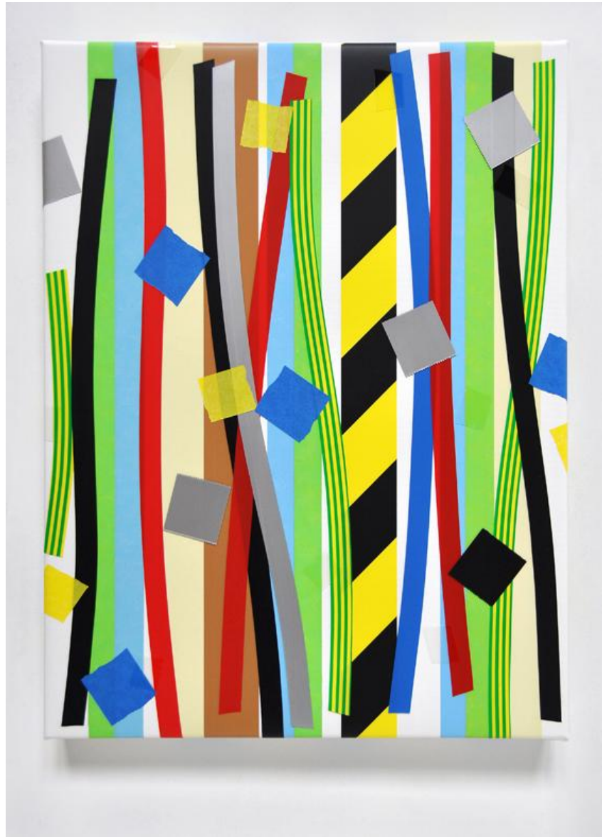
Caroline McCarthy Groovy Julia 2016 Acrylic on canvas ( no tape ! ) 60 x 45 cm € 7,500+vat