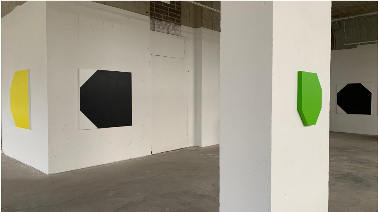
Fergus Martin Installation view of Smoke , recent solo exhibition at Green On Red Gallery, Dublin L. to r. : Lemon ( 2024 ), There it is ( 2024 ), Lime ( 2024 ) and War ( 2024 ) ( four panels )