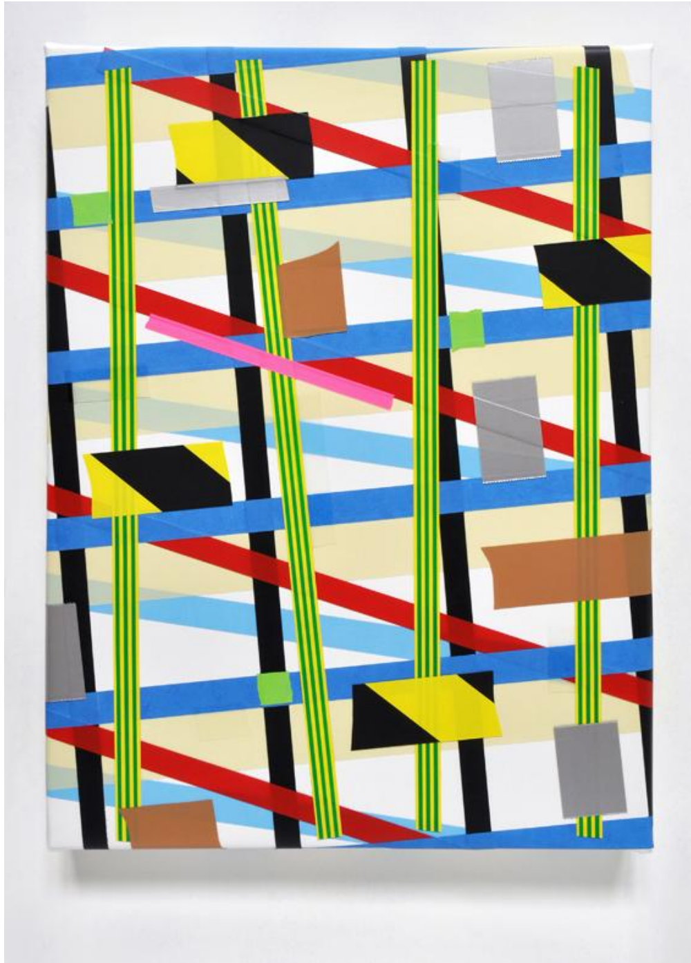
Caroline McCarthy Escalator 2016 Acrylic on canvas ( no tape ! ) 60 x 45 cm € 7,500+vat