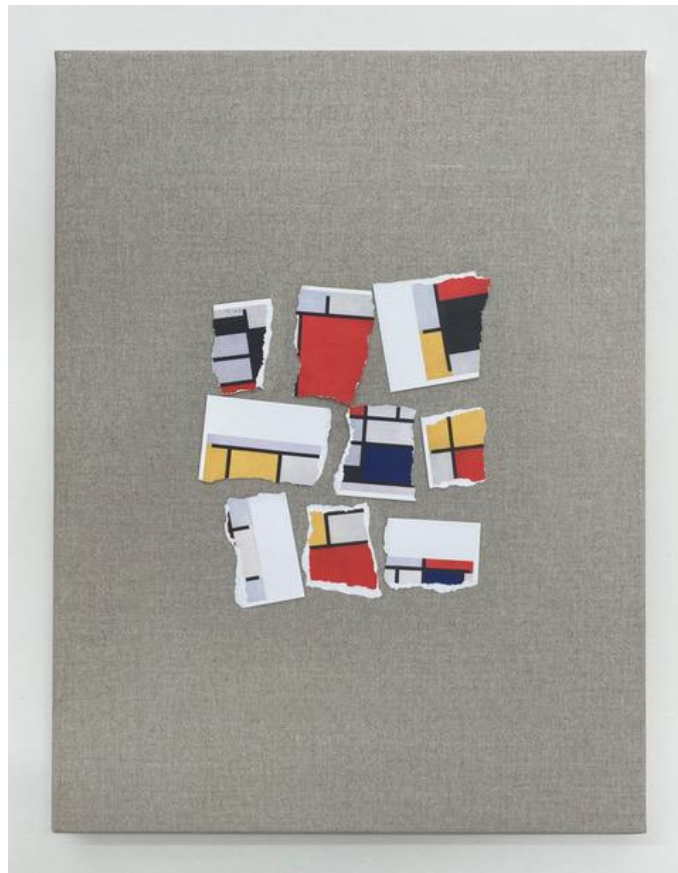
Caroline McCarthy Composition with Large Red Plane, Yellow, Black, Grey and Blue I - VI Acrylic on linen 43 x 33 cm € 6,000+vat