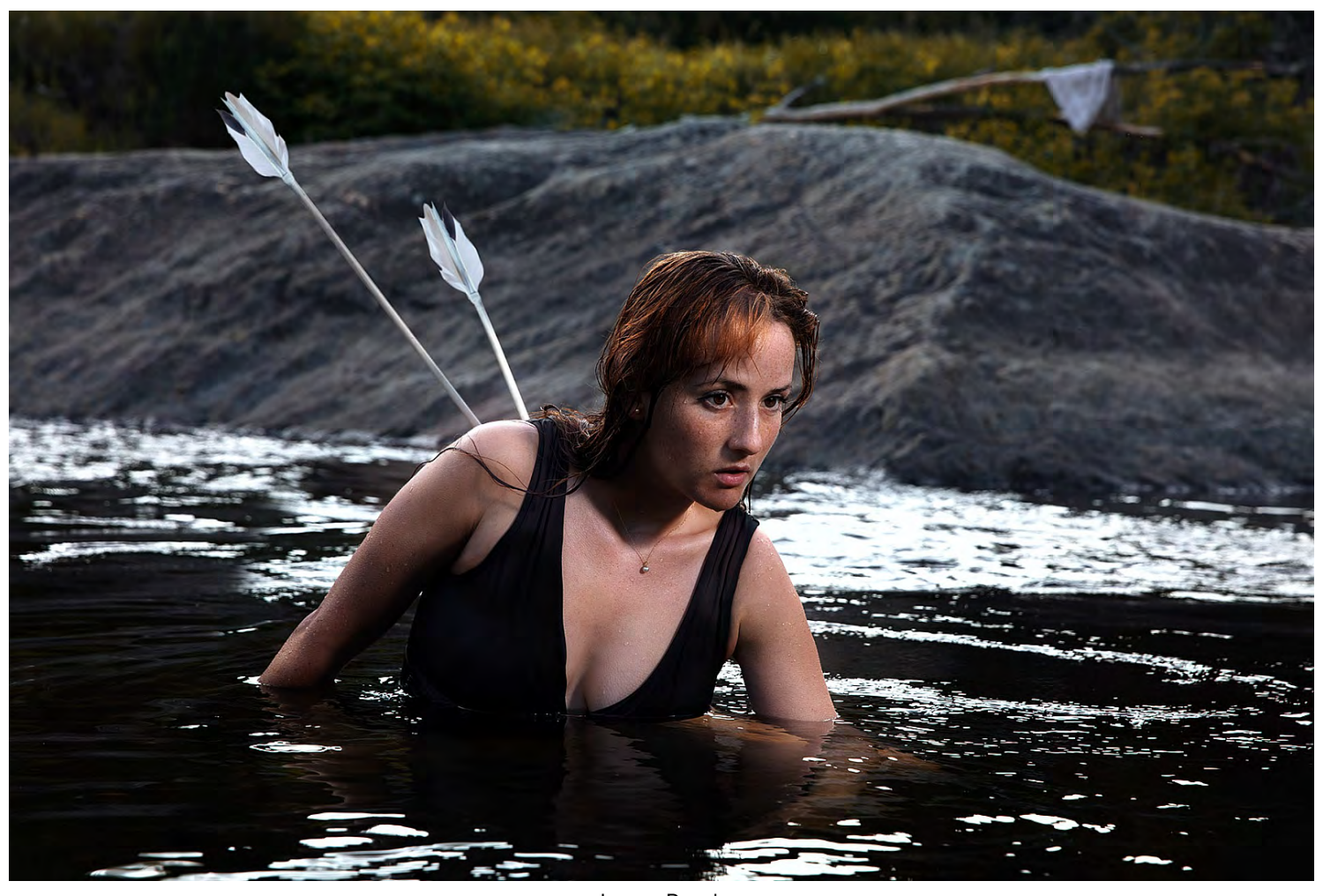
Jeremy Dennis Nothing Happened Here #7, 2017 Metal Print 8 x 12 in 3/10