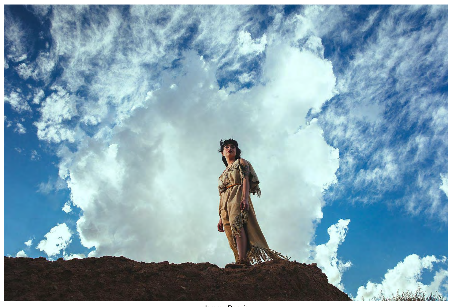
Jeremy Dennis Hill Top (from the "Sacredness of Hills" series), 2019 Metal Print 31h x 41w in 78.74h x 104.14w cm