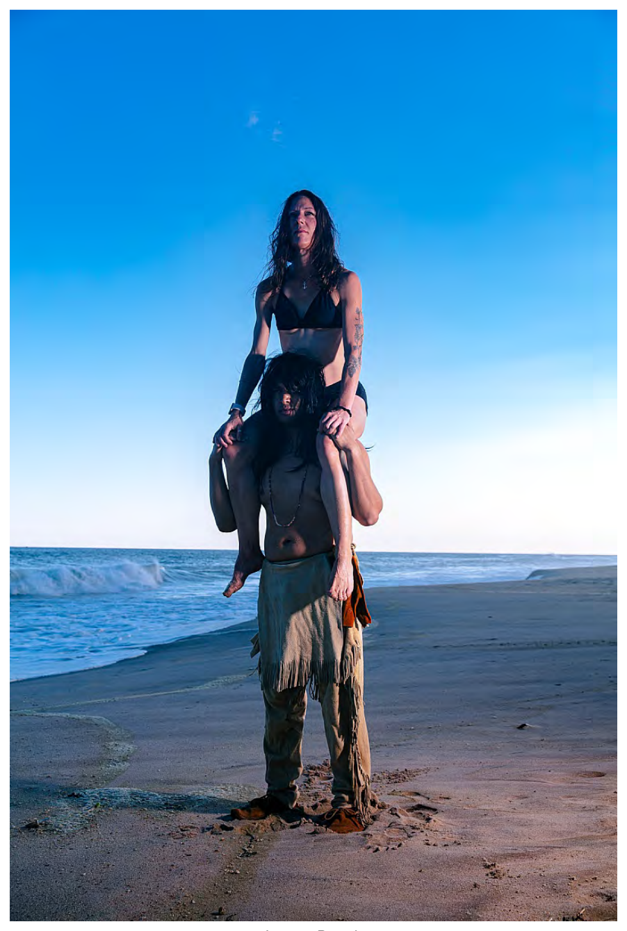
Jeremy Dennis Native Guide, 2021 Metal Print 20h x 40w in 50.80h x 101.60w cm 1/10