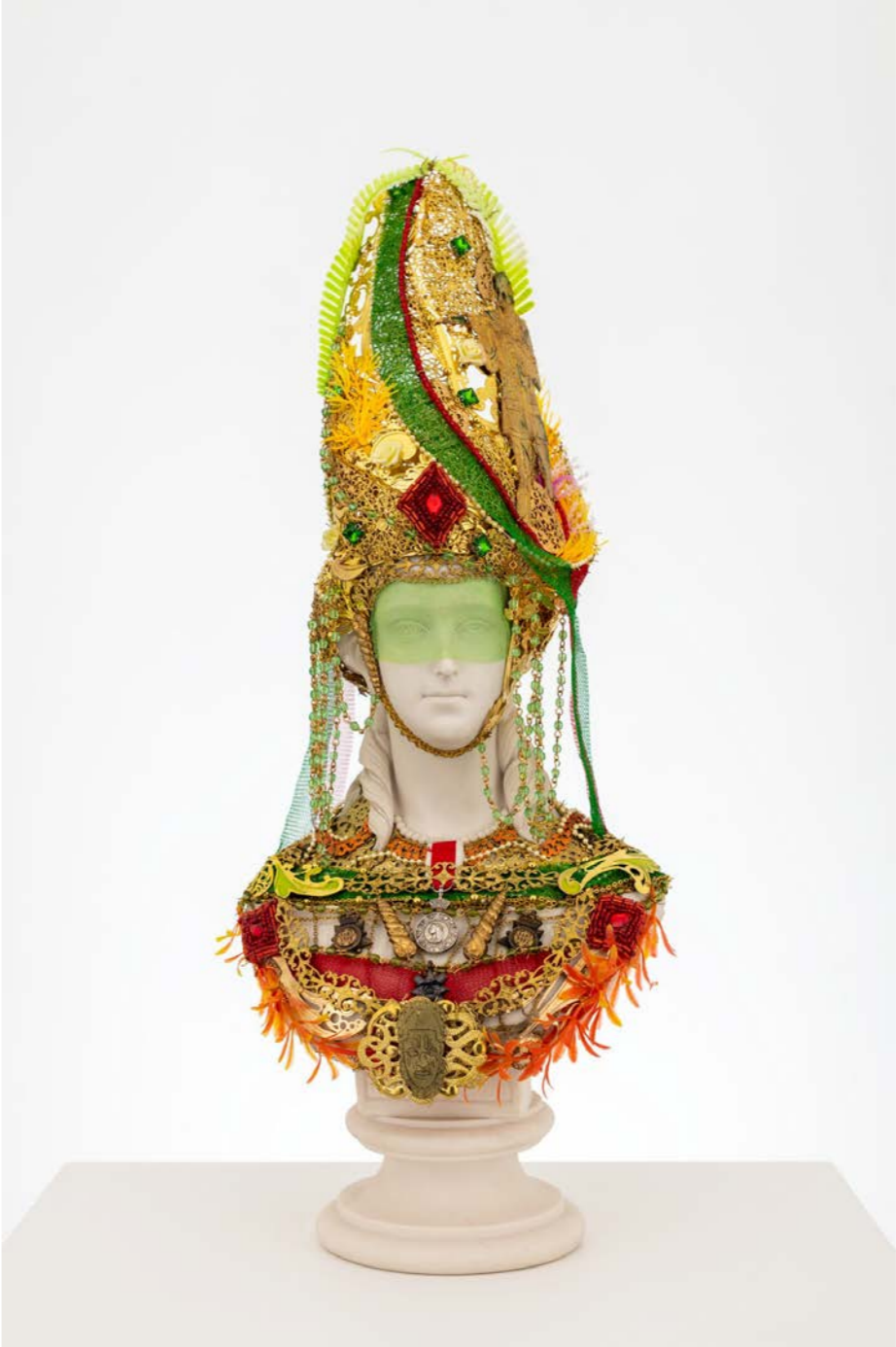
Hew Locke Souvenir 12 (Princess Alexandra) , 2023 Mixed media on antique Parian Ware, copper wire, acrylic paint, synthetic fabric, brass, iron, plastic, metal alloys, enamel, glass, stone 51 x 21 x 16 cm 20 x 8 1/2 x 6 1/2 in