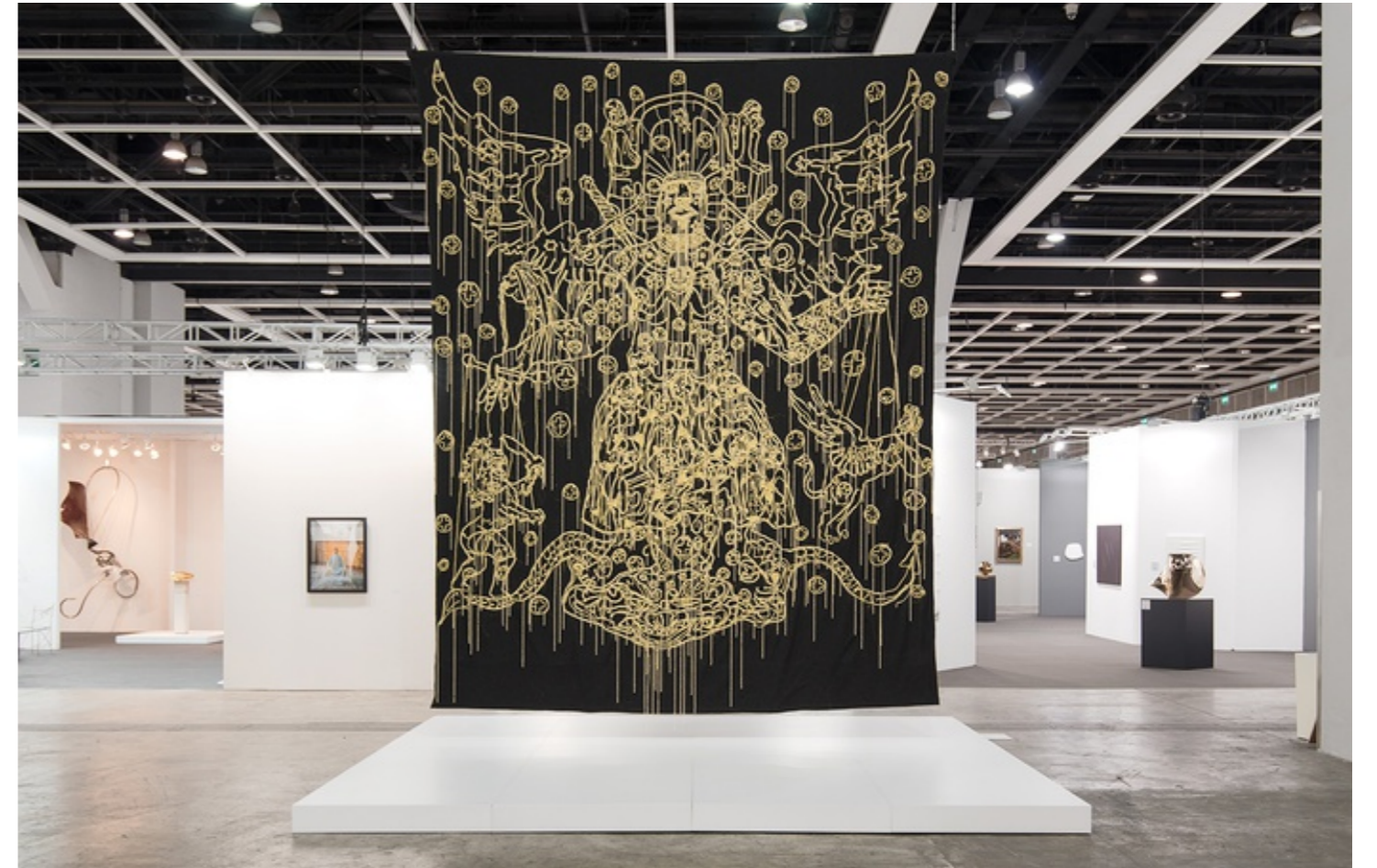
Hew Locke Chariots of the Gods , 2009 Wool hanging, appliquéd cord & plastic beads 520 x 385 cm 204 1/2 x 151 1/2 in