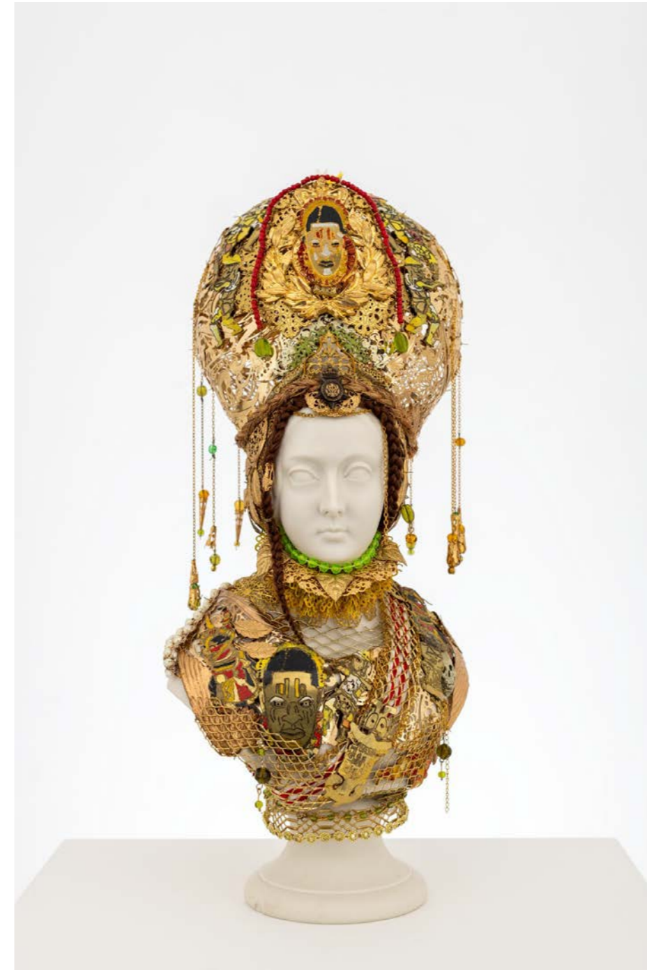
Hew Locke Souvenir 11 (Queen Victoria) , 2023 Mixed media on antique Parian Ware bust, manilla rope, tin, brass, iron, glass, jesmonite, plastic, polyester hair, acrylic paint, enamel paint 46 x 23 x 22 cm 18 x 9 x 8 1/2 in

Hew Locke's work is included in numerous collections among which Tate; The Metropolitan Museum of Art, New York; Brooklyn Museum, New York; Victoria and Albert Museum, London; and The British Museum, London.