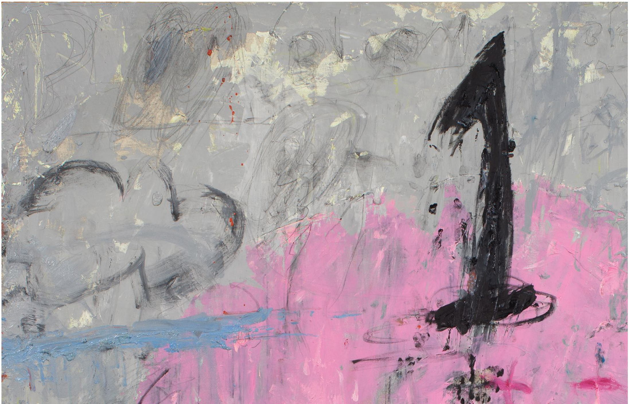
Detail: BLOOM TOGETHER, 2024