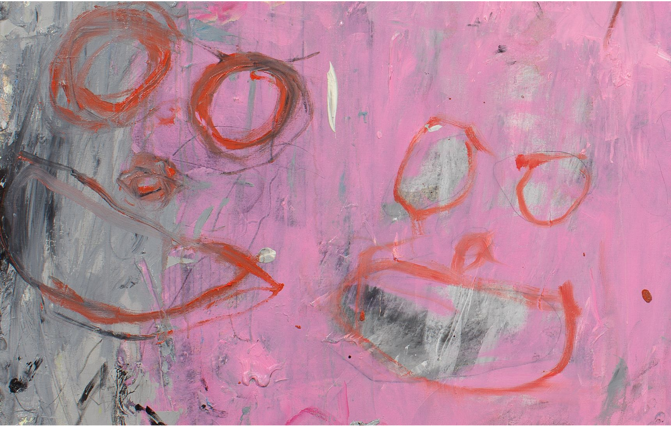
Detail: BLOOM TOGETHER, 2024