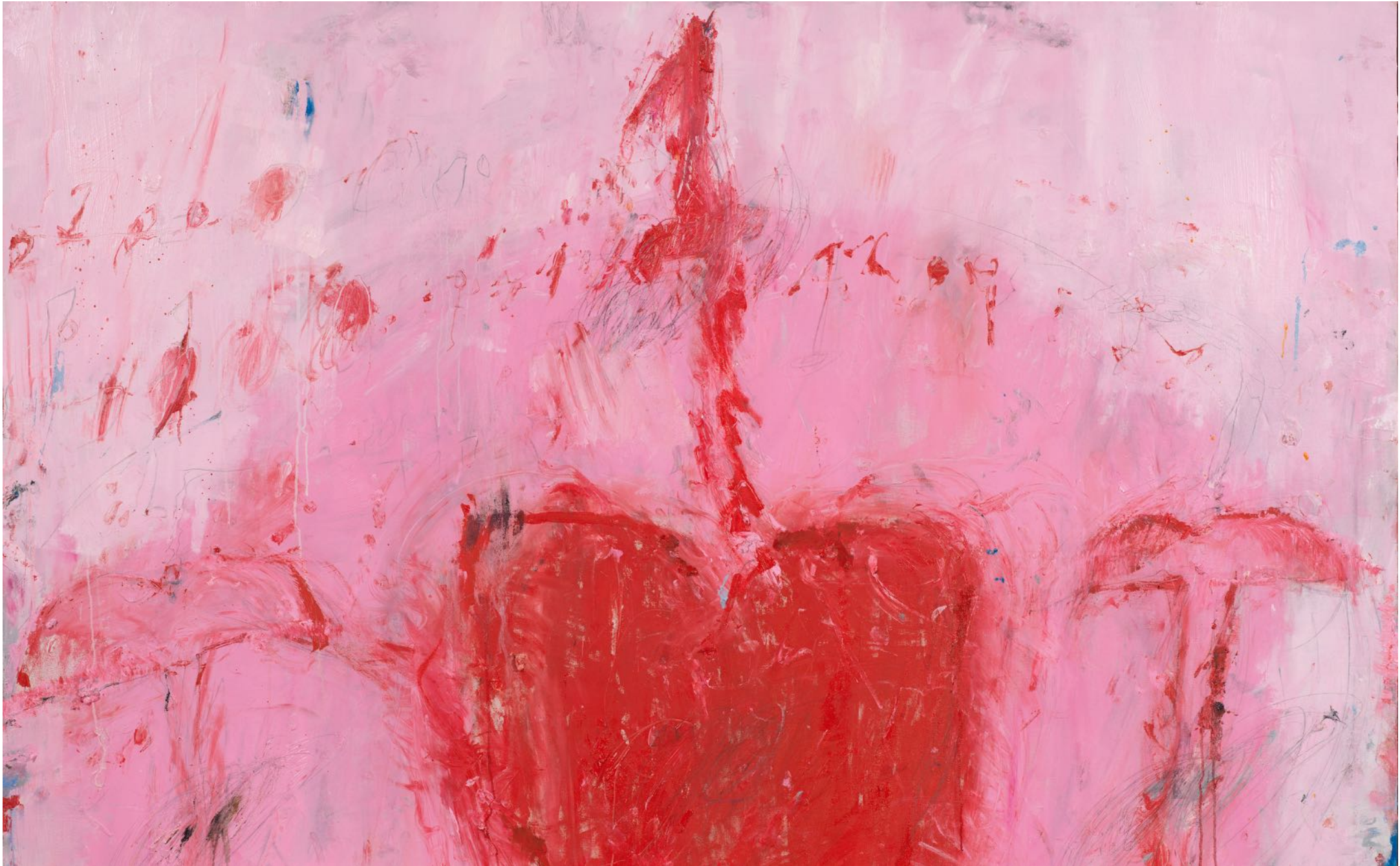
Detail: APPLE – CLOCK – BIRTH, 2024