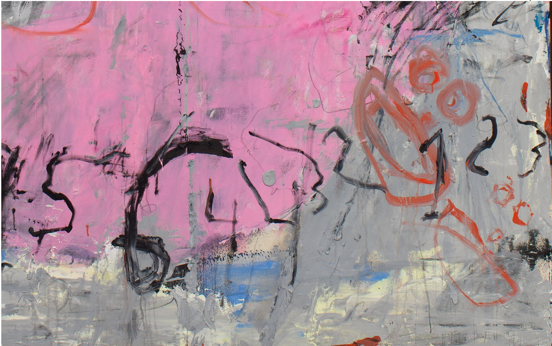
Detail: BLOOM TOGETHER, 2024