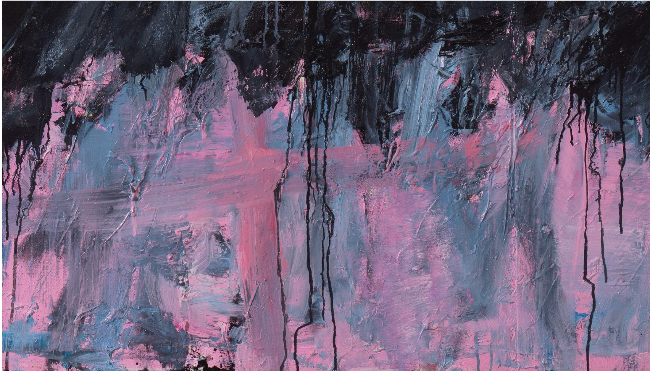
Detail: 1FAMILY, 2024