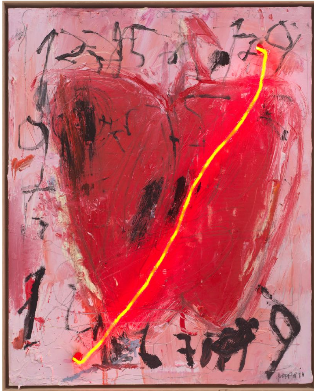
MARRIA PRATTS, APPLE VS CLOCK OUT OF JOINT, 2024 oil and pencil with red neon on canvas; 39.37h x 31.50w in (100h x 80w cm)