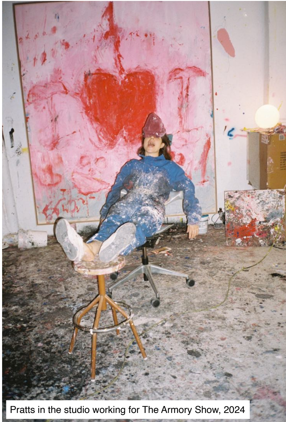
Pratts in the studio working for The Armory Show, 2024