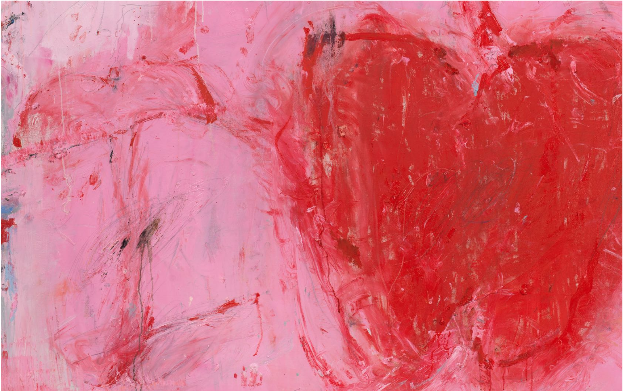
Detail: APPLE – CLOCK – BIRTH, 2024