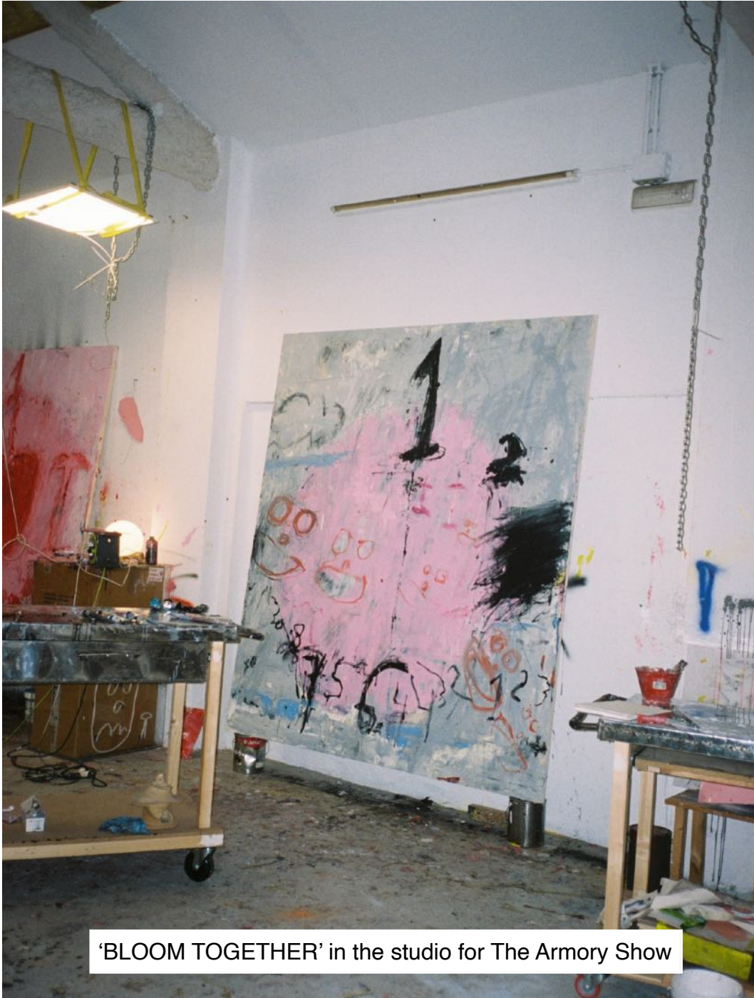
'BLOOM TOGETHER' in the studio for The Armory Show