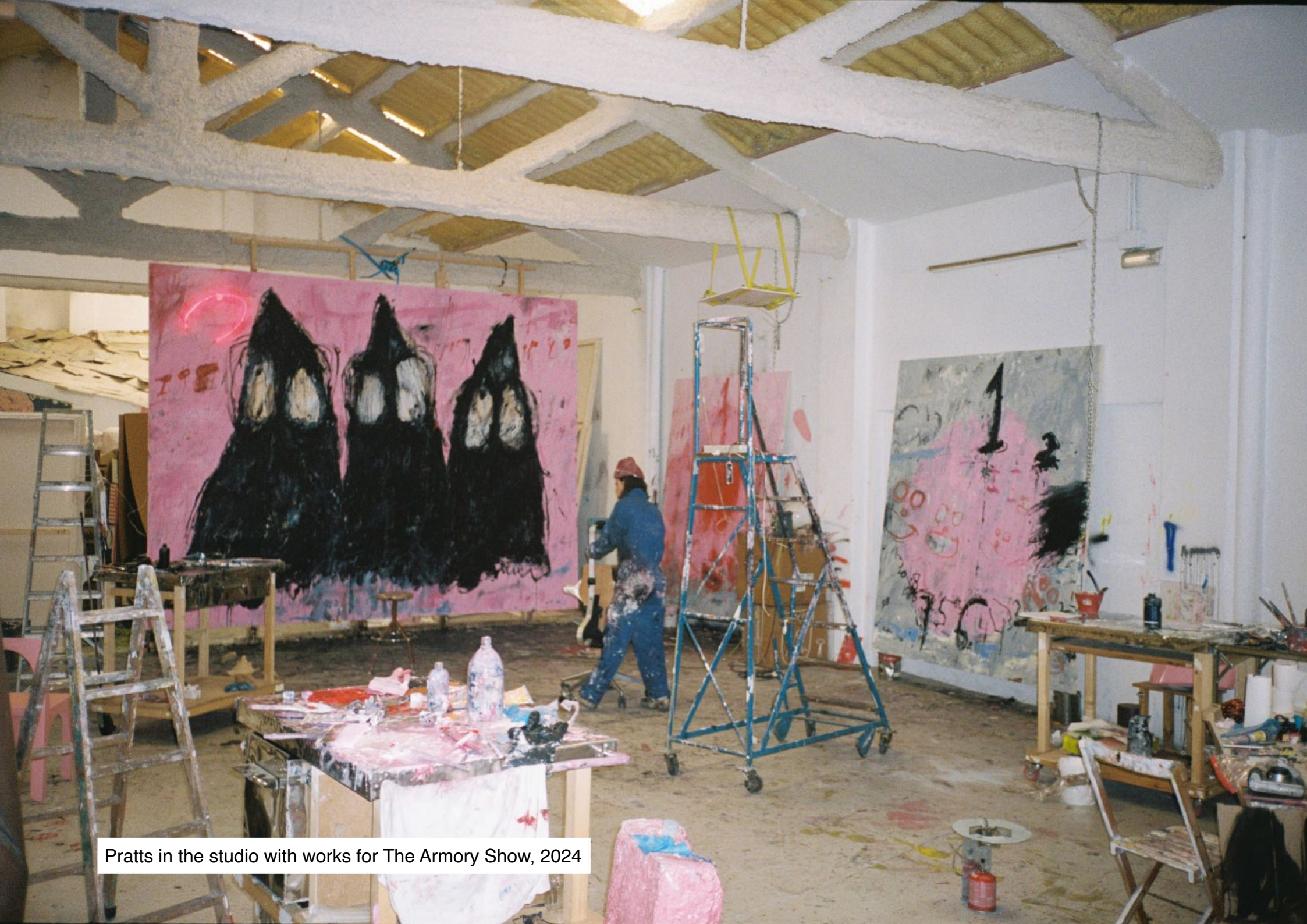
Pratts in the studio with works for The Armory Show, 2024