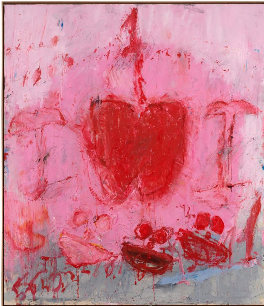
MARRIA PRATTS, APPLE – CLOCK – BIRTH, 2024, oil and pencil on canvas; 90.5h x 78.7w in (230h x 200w cm)