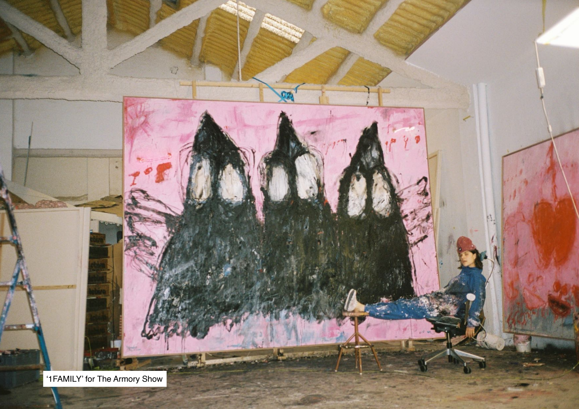
'1FAMILY' for The Armory Show