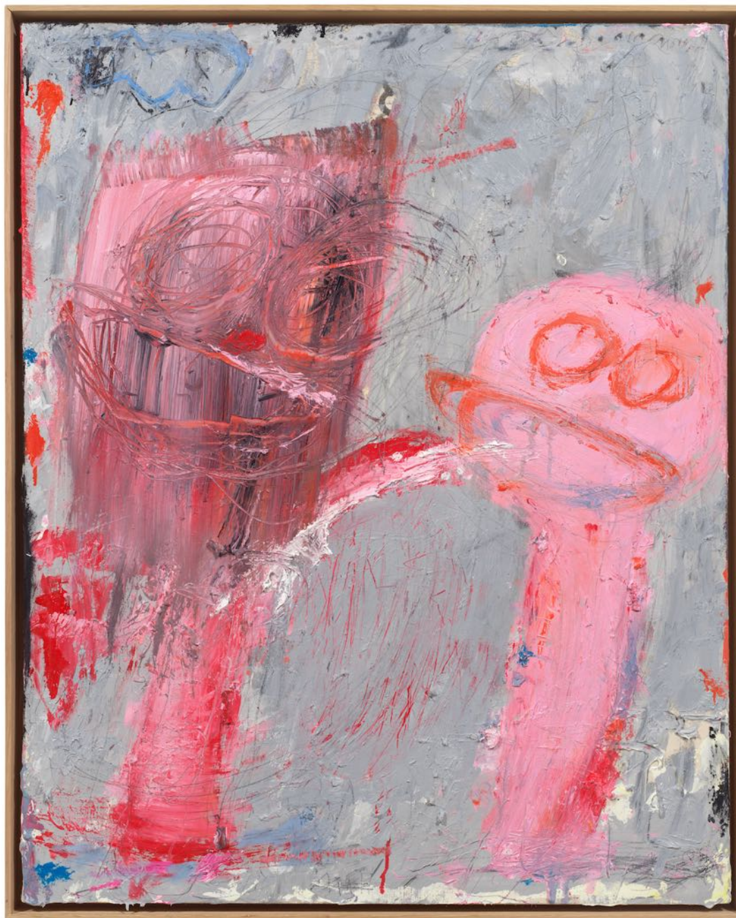
MARRIA PRATTS, MMAC, MAGIK MILK ALBA CLAUS, 2024 oil and pencil on canvas; 39.37h x 31.50w in (100h x 80w cm)