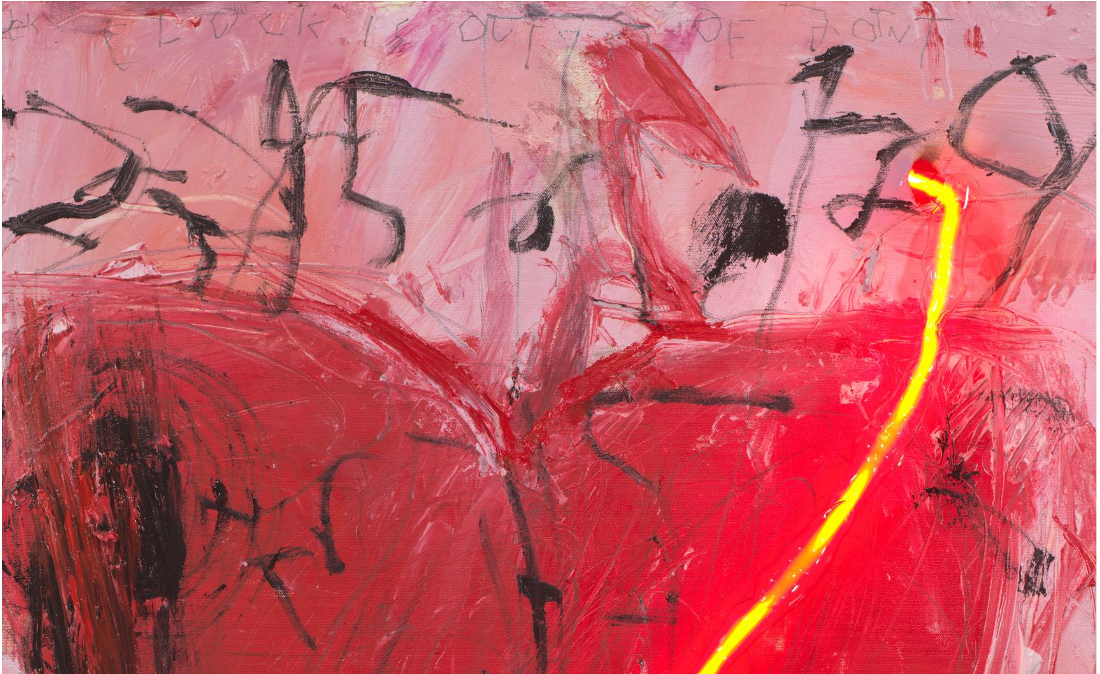
Detail: APPLE VS CLOCK OUT OF JOINT, 2024