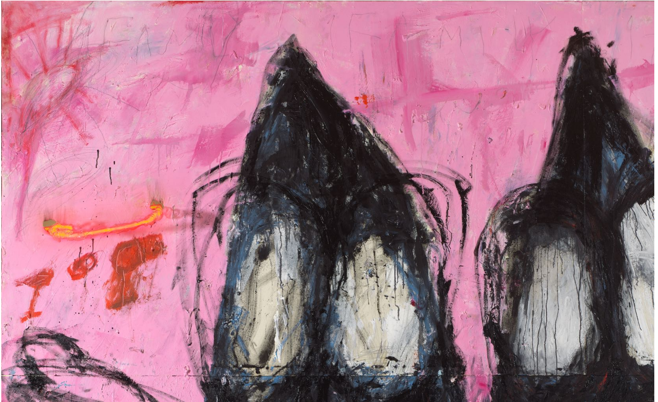
Detail: 1FAMILY, 2024