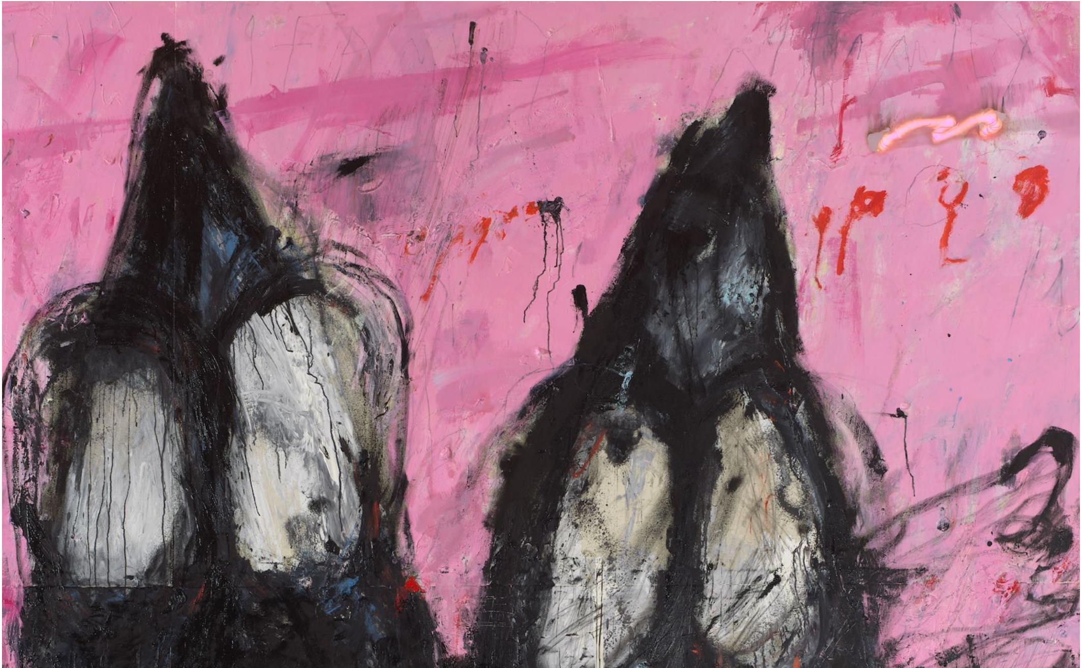
Detail: 1FAMILY, 2024