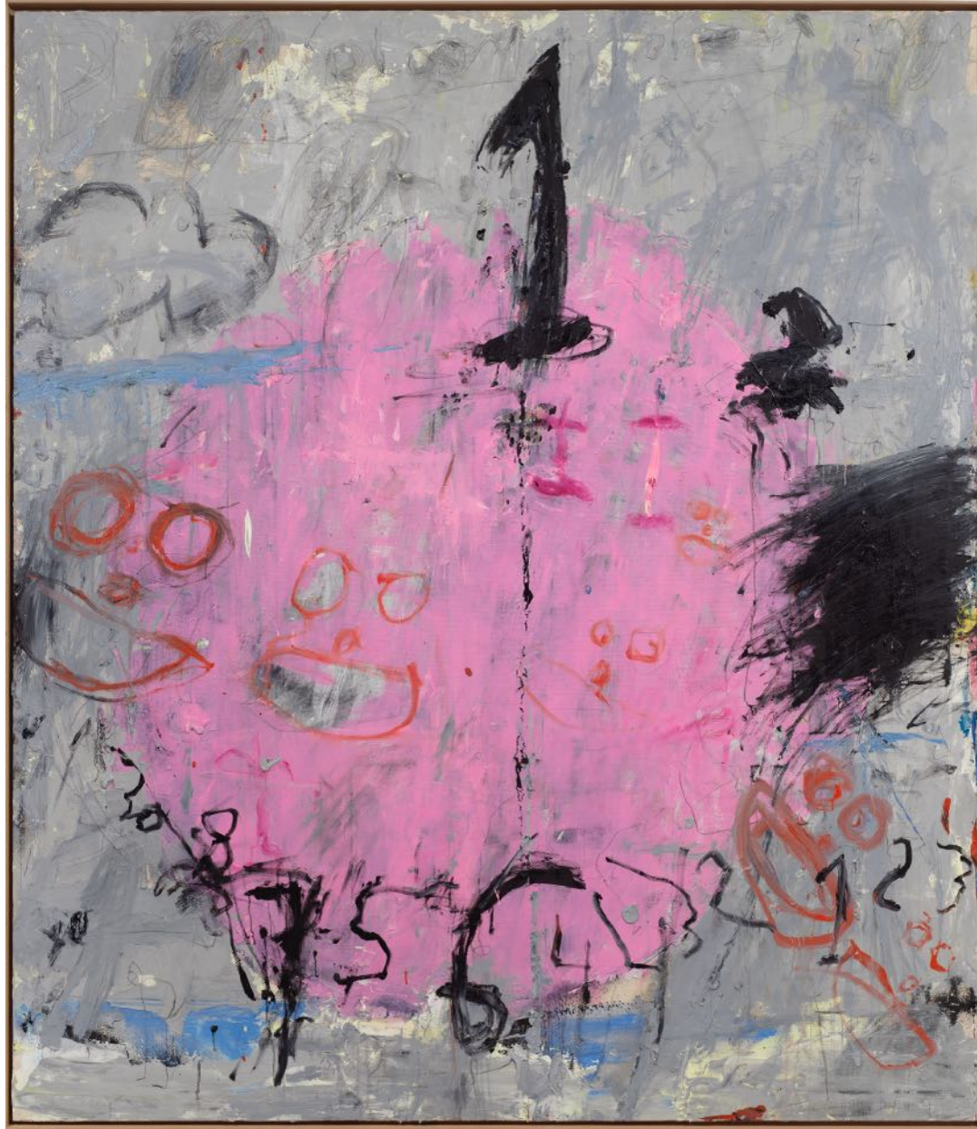
MARRIA PRATTS, BLOOM TOGETHER, 2024 oil, pencil on canvas; 90.5h x 78.7w in (230h x 200w cm)