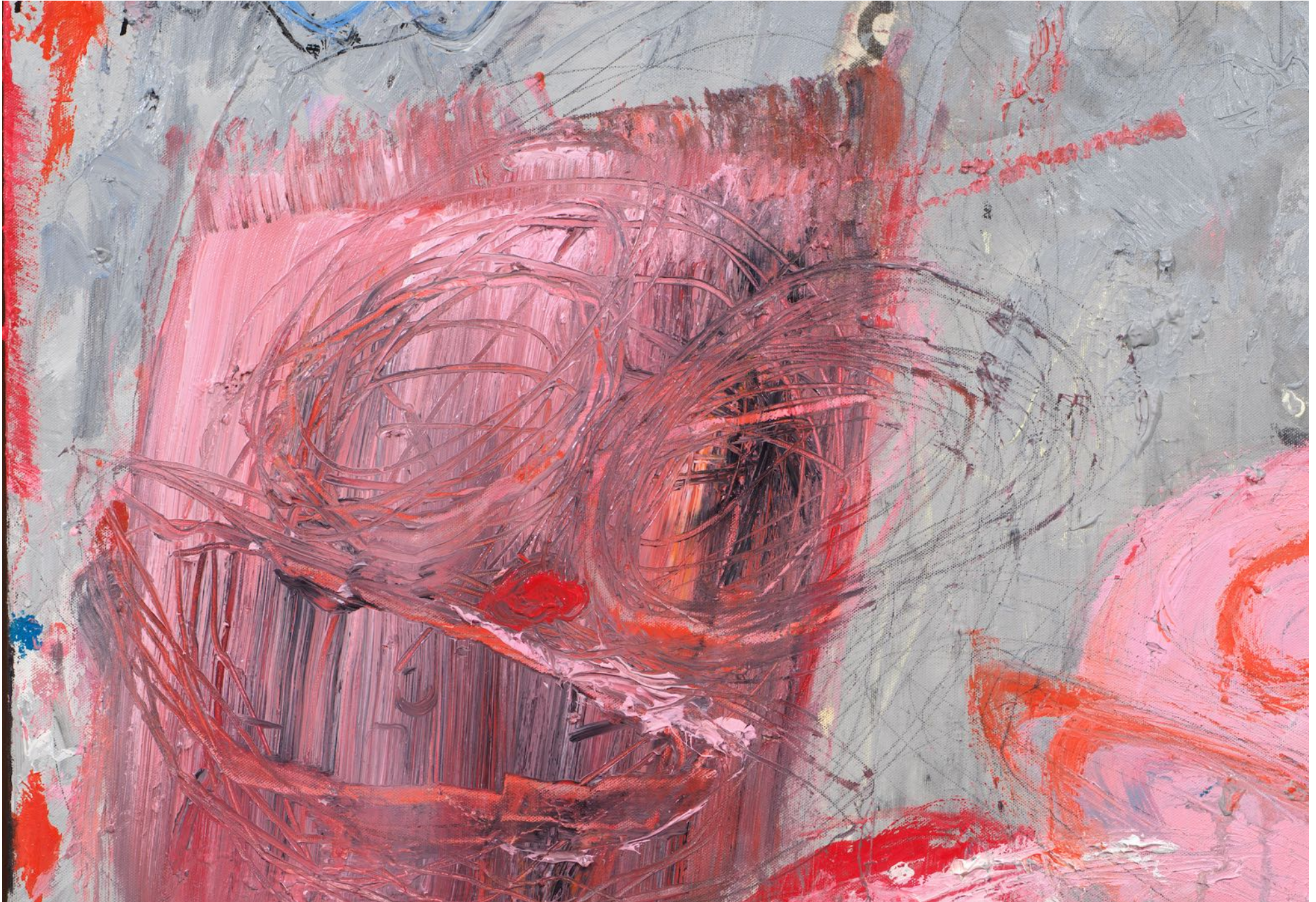
Detail: MMAC, MAGIK MILK ALBA CLAUS, 2024