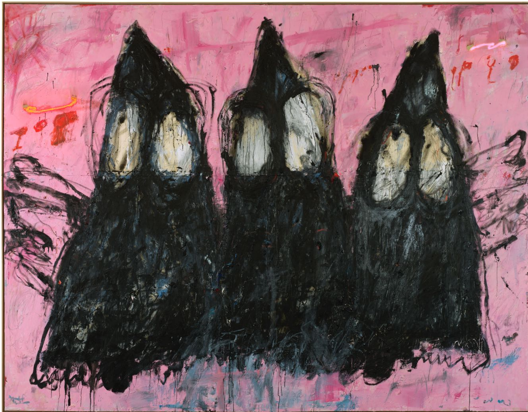
MARRIA PRATTS, 1FAMILY, 2024 oil, pencil and neon light on canvas; 310h x 400w cm