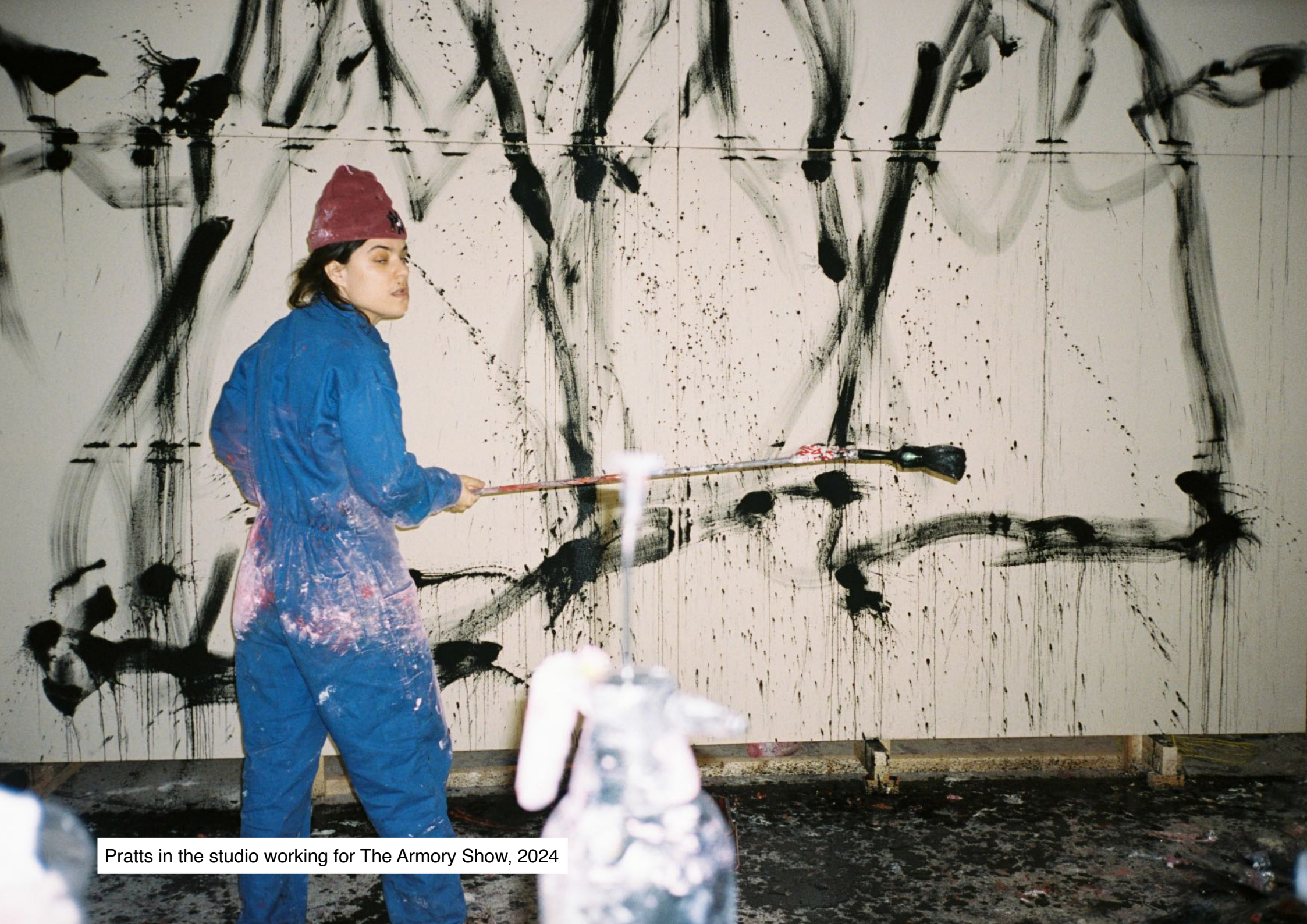
Pratts in the studio working for The Armory Show, 2024