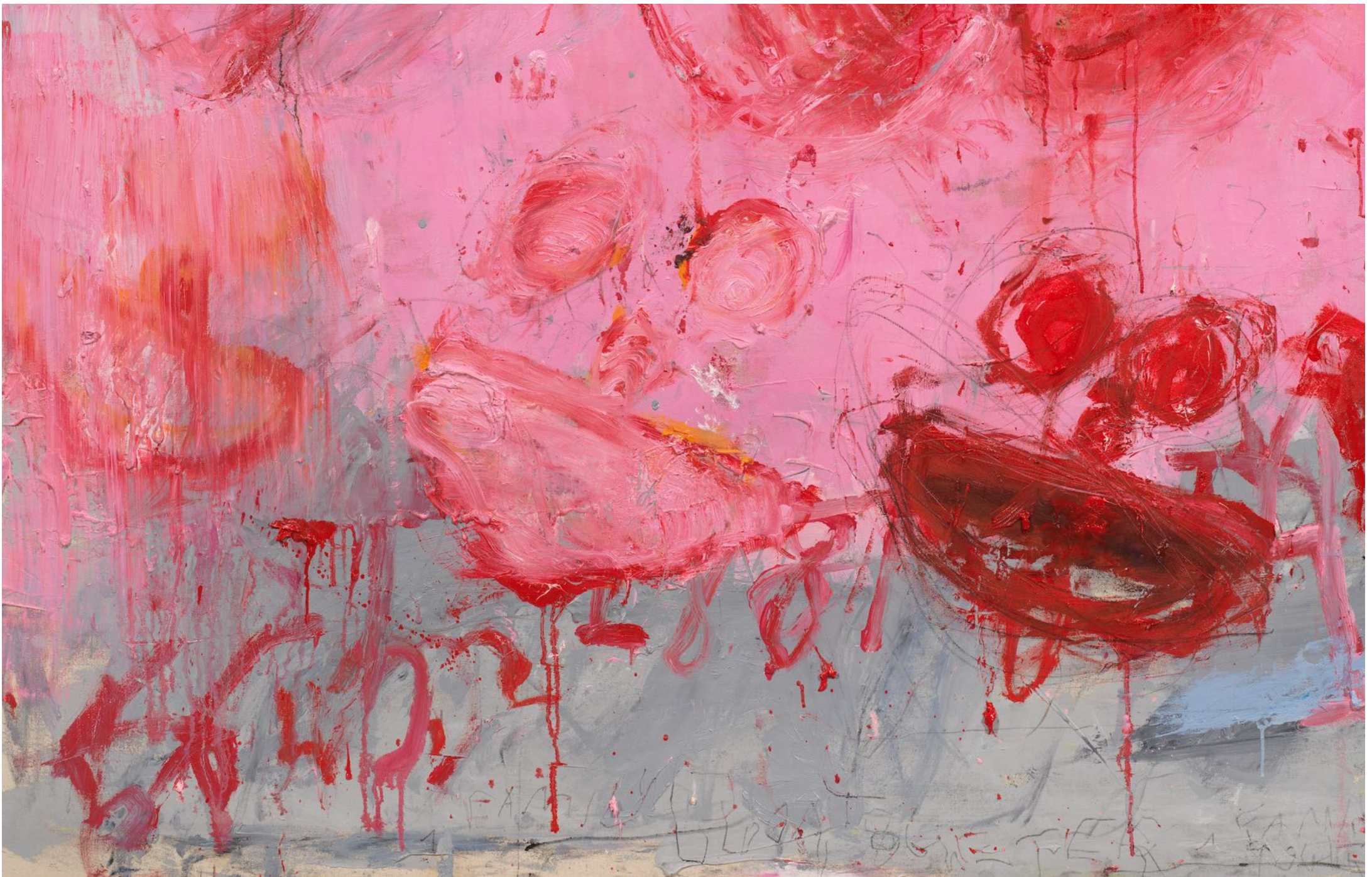
Detail: APPLE – CLOCK – BIRTH, 2024