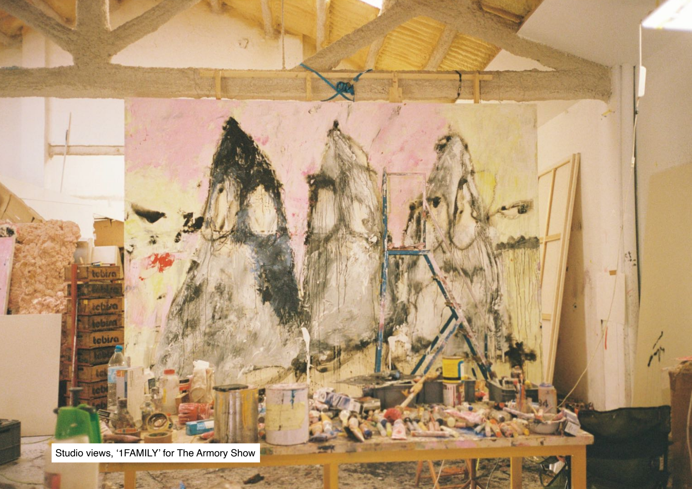
Studio views, '1FAMILY' for The Armory Show