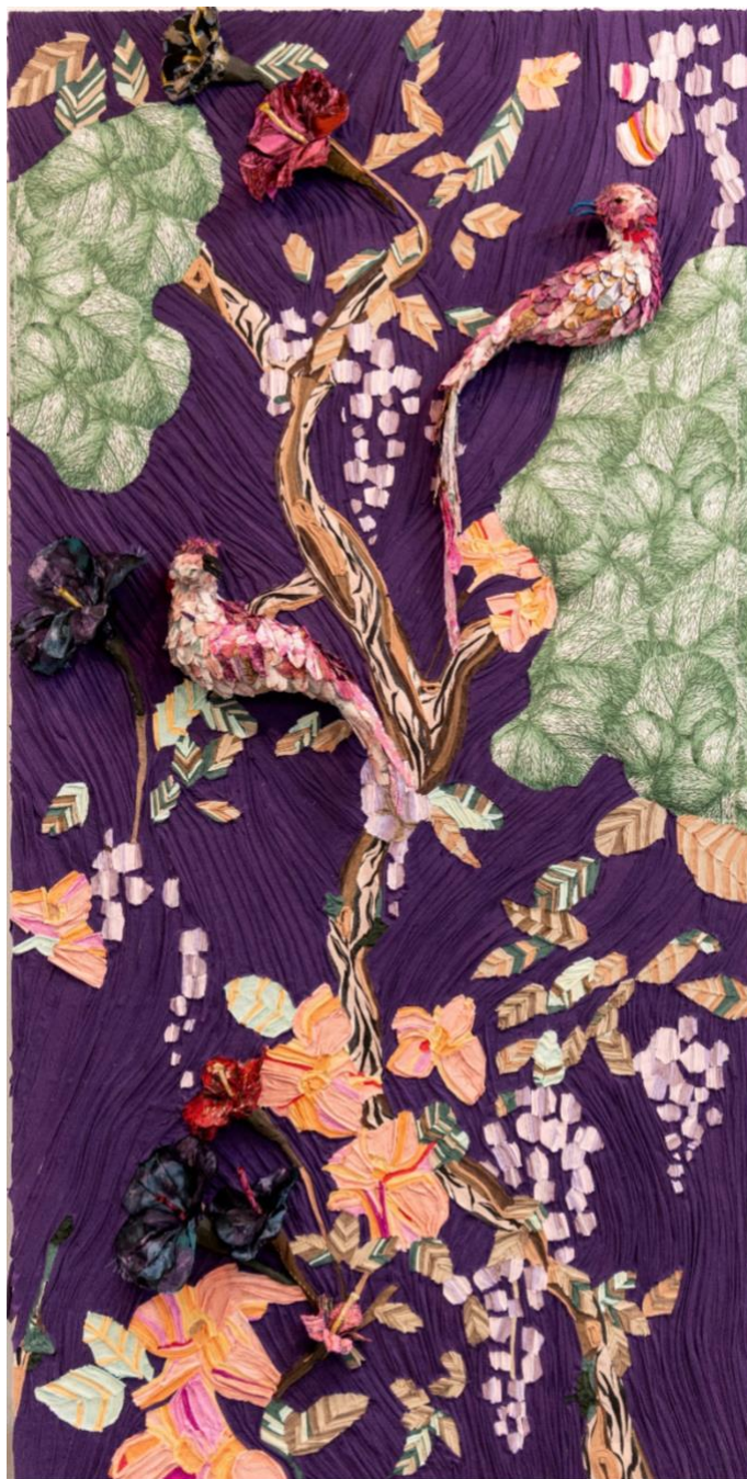
No Shadows in the Sky, Twilight, 2024