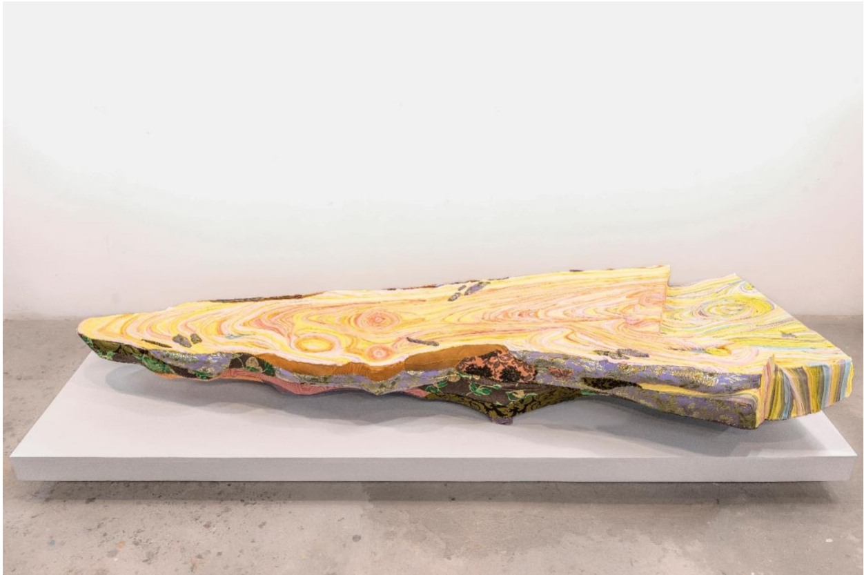
Sunrise, 2024 Recycled textiles on wood 105 x 30 x 15 in. $ 28,000

SLAG&RX – New York – Paris 522 West 19th St. NY, NY 10011 SLAGR.com