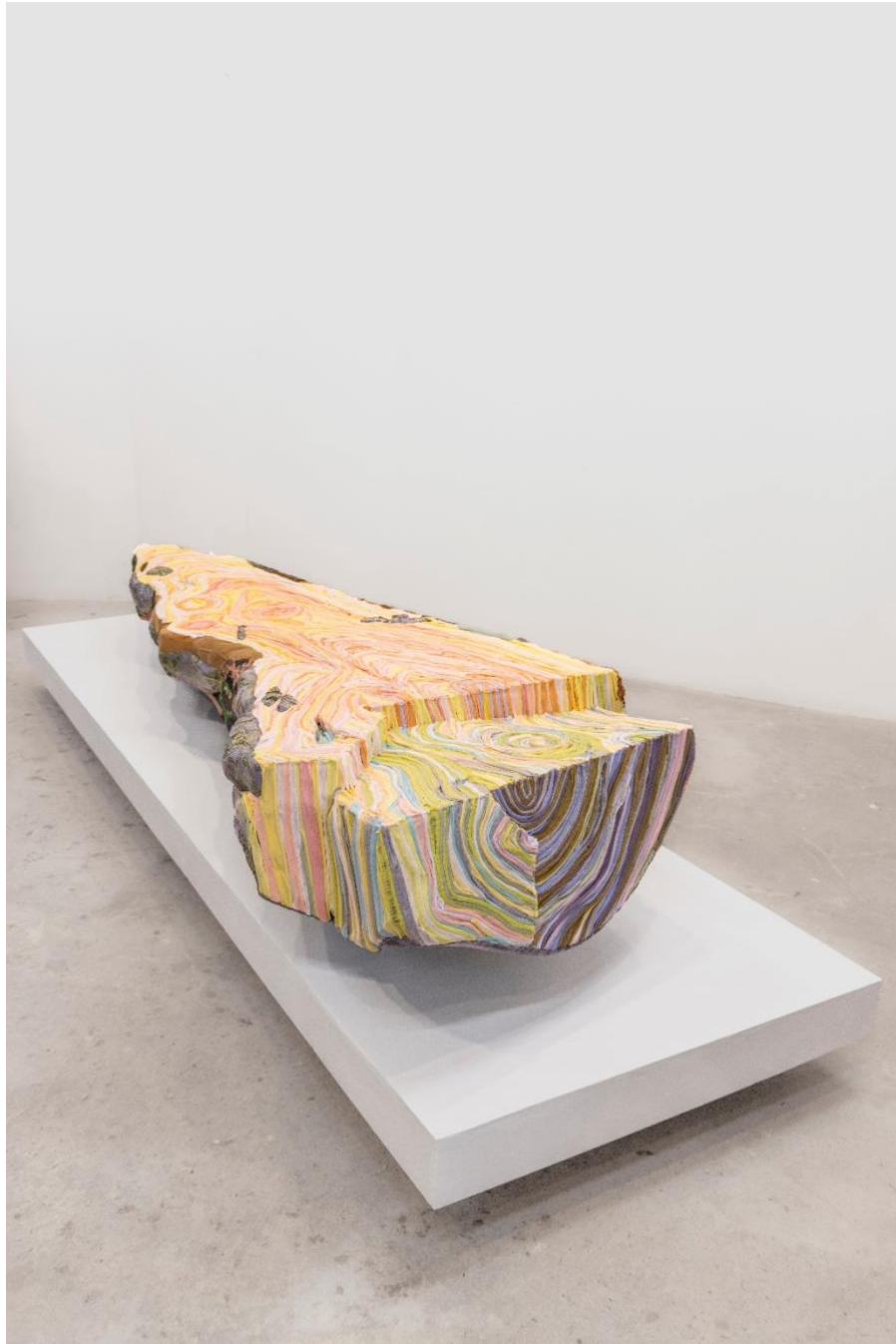
Sunrise, 2024 (View from side)

SLAG&RX – New York – Paris 522 West 19th St. NY, NY 10011 SLAGR.com