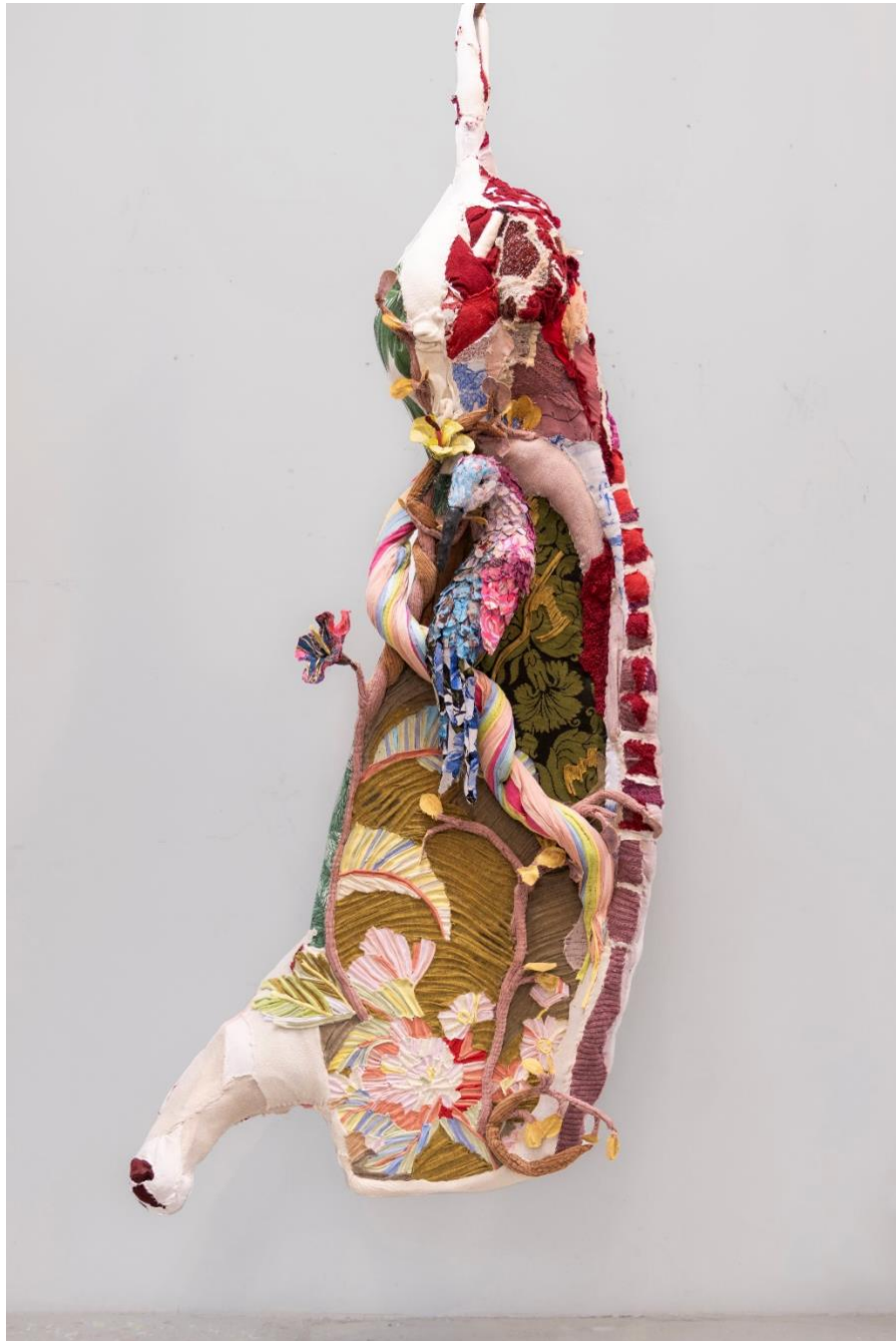
Summers to Come, 2024 Discarded textiles and other fabrics 81 x 31 x 12 in. $ 24,000

SLAG&RX – New York – Paris 522 West 19th St. NY, NY 10011 SLAGR.com