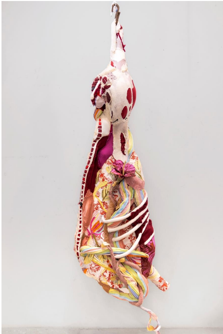
Growth, 2024 Discarded textiles and other fabrics 93 x 29 x 19 in. $ 24,000

SLAG&RX – New York – Paris 522 West 19th St. NY, NY 10011 SLAGR.com