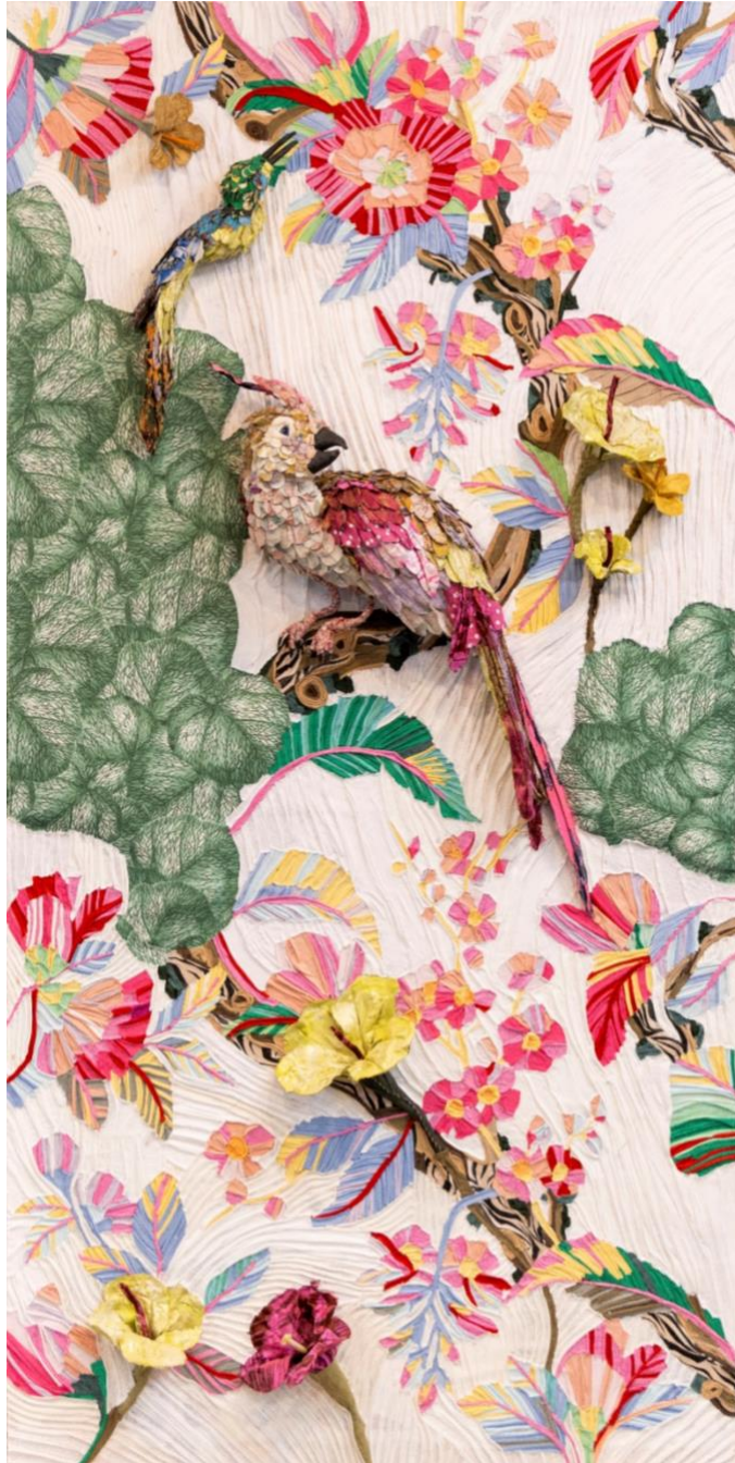
No Shadows in the Sky, Midday, 2024 Recycled textiles on wood 48 x 96 x 8.5 in. $ 28,000

SLAG&RX – New York – Paris 522 West 19th St. NY, NY 10011 SLAGR.com