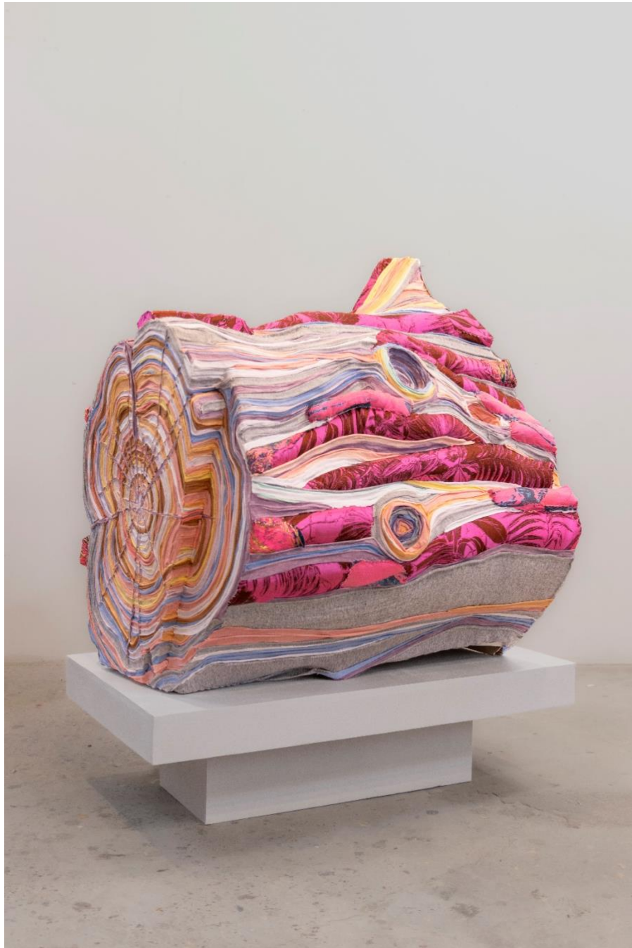
Sunset, 2024 (View from side)

SLAG&RX – New York – Paris 522 West 19th St. NY, NY 10011 SLAGR.com