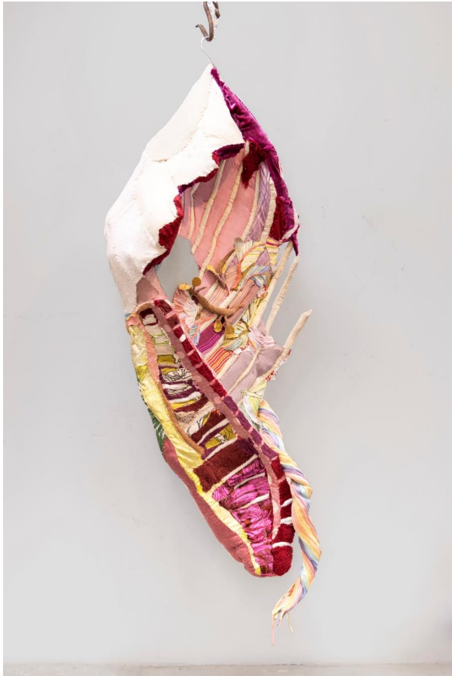
In the Shape of Home, 2024 Discarded textiles and other fabrics 74 x 29 x 12 in $ 21,000

SLAG&RX – New York – Paris 522 West 19th St. NY, NY 10011 SLAGR.com