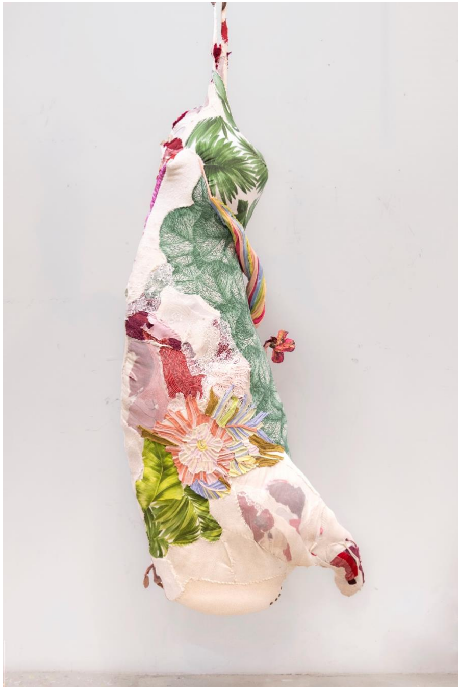
Summers to Come, 2024 (View from back)

SLAG&RX – New York – Paris 522 West 19th St. NY, NY 10011 SLAGR X .com