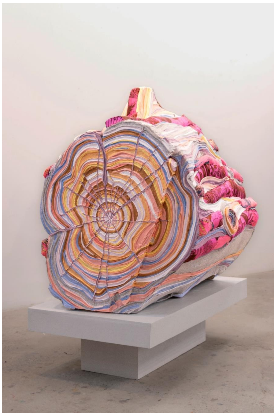
Sunset, 2024 Discarded textiles on wood 37 x 36 x 39 in. $ 22,000

SLAG&RX – New York – Paris 522 West 19th St. NY, NY 10011 SLAGR.com