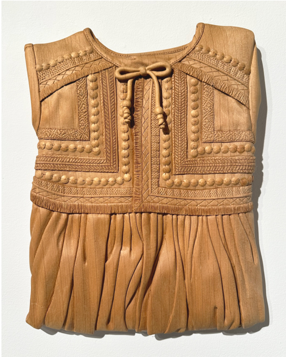
HUMAIRA ABID FOLDED STORIES: SECOND SERIES - VIII, 2024 Carved pine wood 15 x 11.5 x 2 inches $9,500