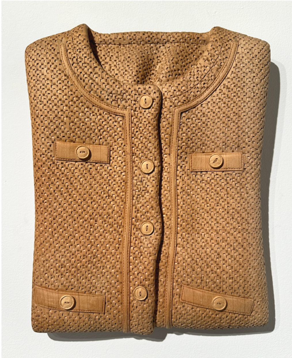
HUMAIRA ABID FOLDED STORIES: SECOND SERIES - VII, 2024 Carved pine wood 14 x 11 x 1.5 inches $9,500