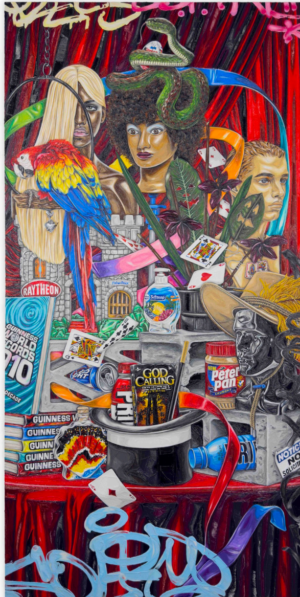
ANTHONY WHITE HAT TRICK , 2024 PLA on panel 76 x 38 inches $17,800