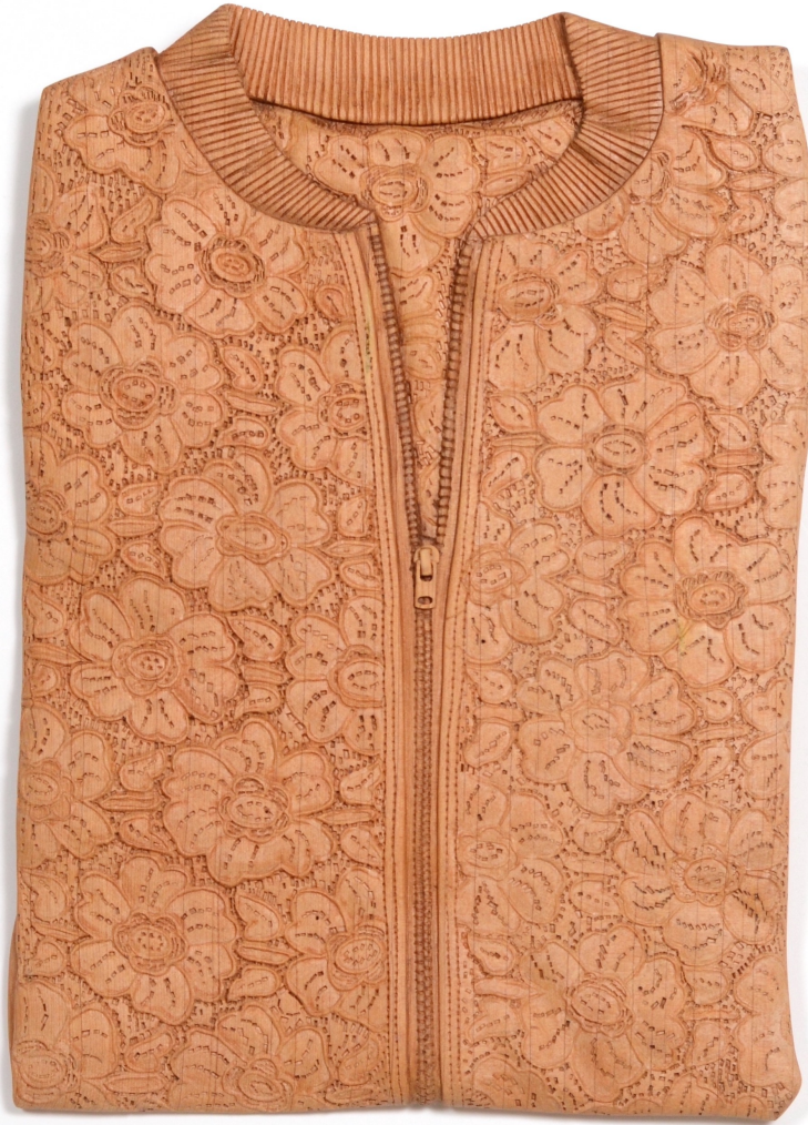
HUMAIRA ABID FOLDED STORIES: SECOND SERIES - VI, 2023 Carved pine wood 15.5 x 11.5 x .5 inches $9,500