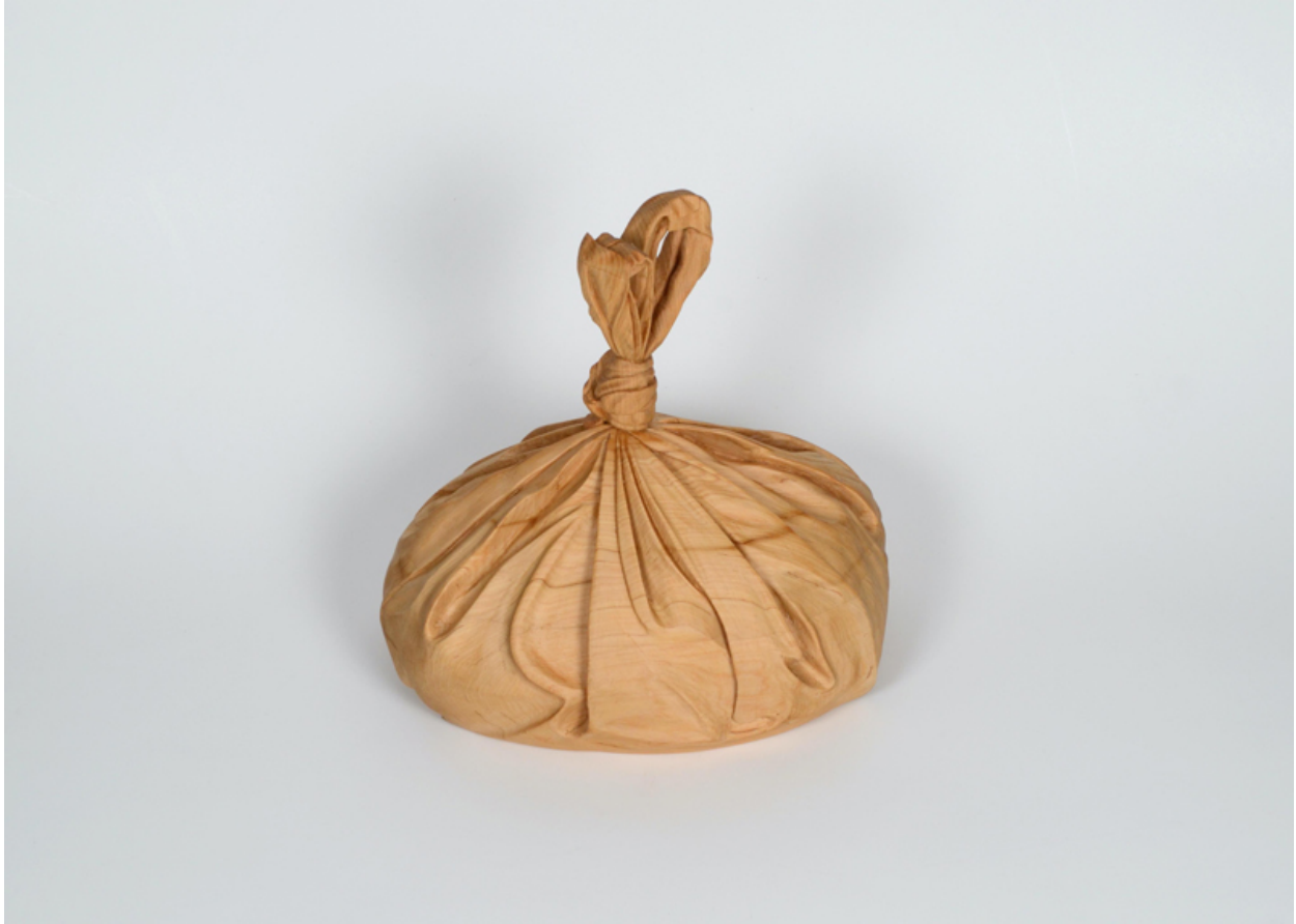
HUMAIRA ABID ZAAD-E-RAAH (PROVISIONS FOR A JOURNEY) , 2020 Carved pine 13 x 12 x 9 inches $8,500