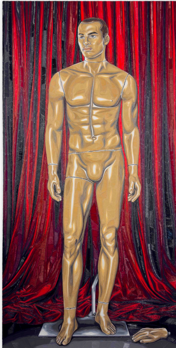
ANTHONY WHITE ALWAYS-ON DISPLAY , 2024 PLA on panel 76 x 38 inches $17,800