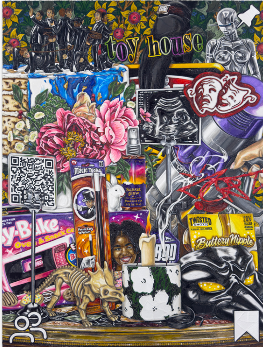
ANTHONY WHITE LIFE IS A TOY CHEST , 2024 PLA on panel 48 x 36 inches $12,000