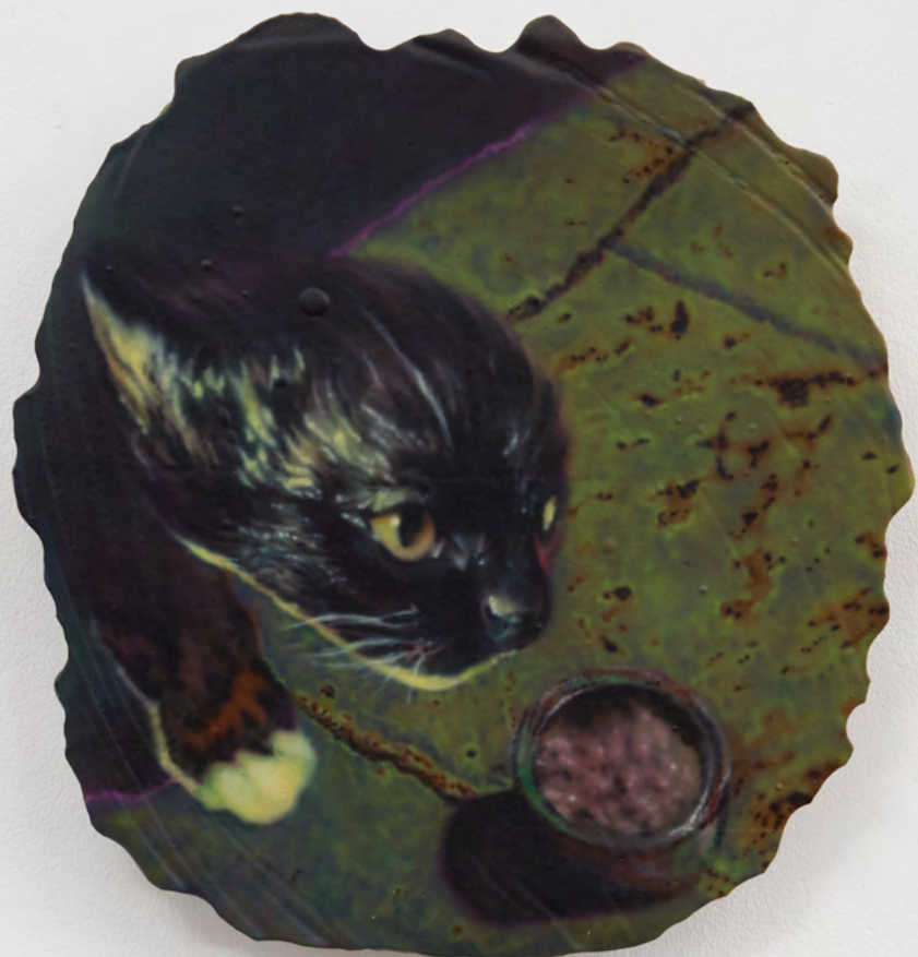
Taewon Ahn Mako is out of control, 2024 Acrylic on urethane 30 x 29 x 3.5 cm (11 3/4 x 11 3/8 x 1 3/8 in) (ATA011)