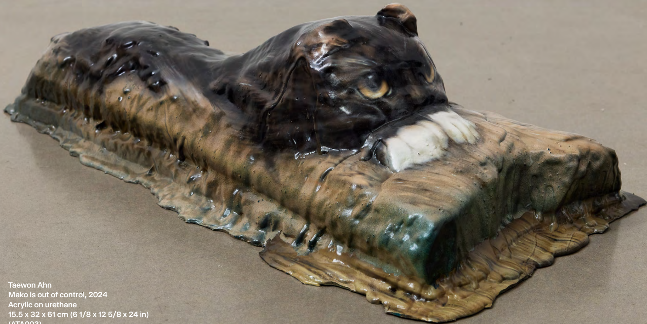
Taewon Ahn Mako is out of control, 2024 Acrylic on urethane 15.5 x 32 x 61 cm (6 1/8 x 12 5/8 x 24 in) (ATA003)