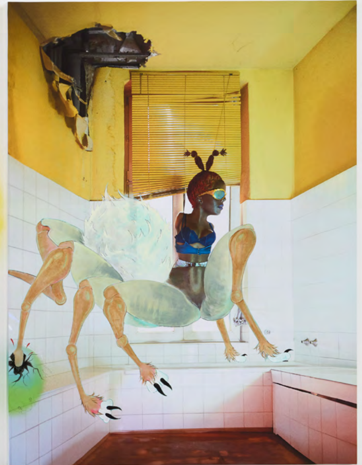
Juliana Huxtable ARTHRO ANARCHY, 2024 Acrylic and vinyl stickers on printed canvas 152 x 349.5 x 4 cm (59 7/8 x 137 5/8 x 1 5/8 in) (JHU045)