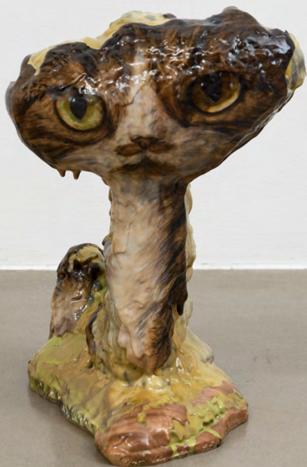
Taewon Ahn Hiro is everywhere, 2024 Acrylic on urethane 40 x 31 x 19 cm (15 3/4 x 12 1/4 x 7 1/2 in) (ATA004)