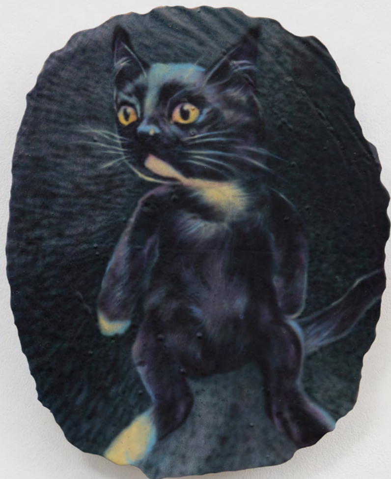
Taewon Ahn Mako is out of control, 2024 Acrylic on urethane 33 x 27 x 3.5 cm (13 x 10 5/8 x 1 3/8 in) (ATA007)