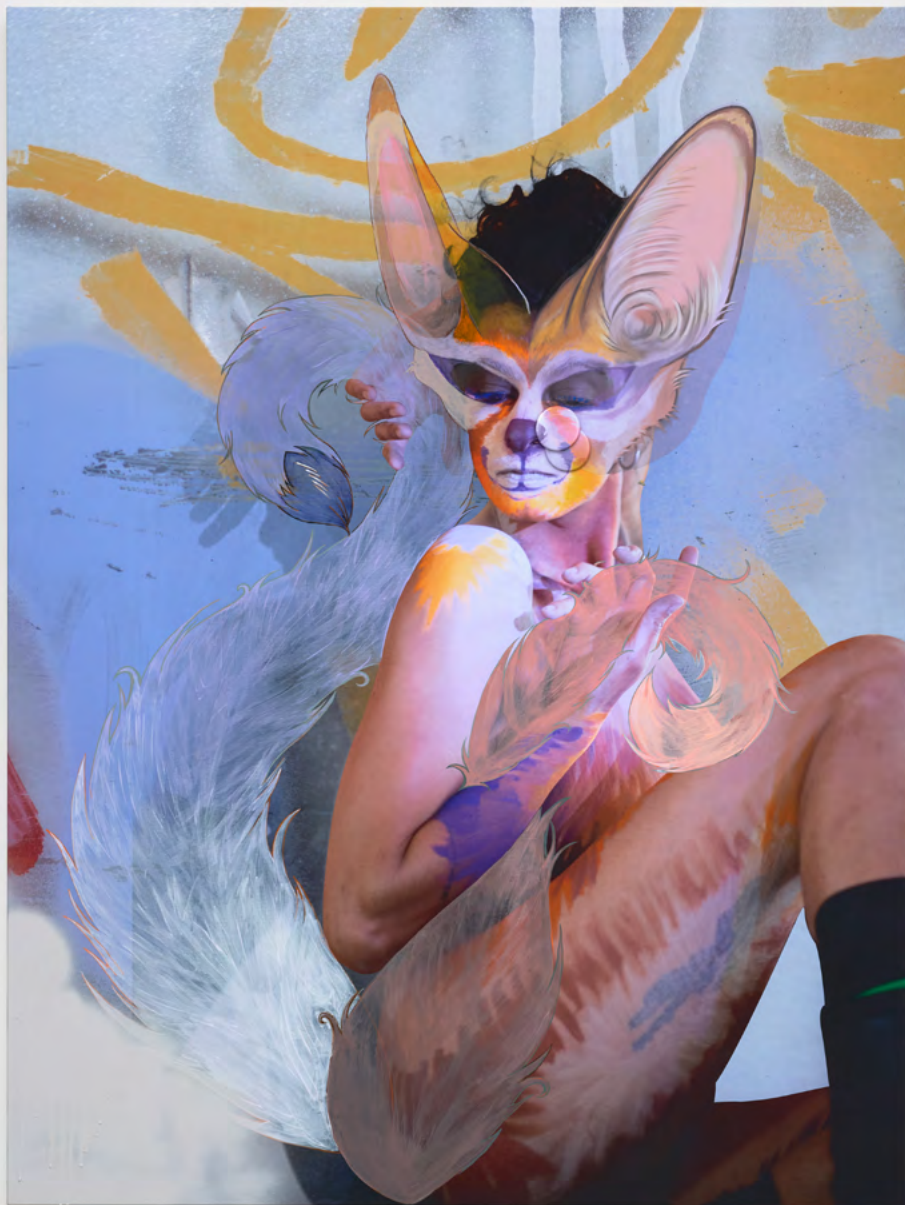
Juliana Huxtable DANCING TAILS IN FOXXY DESERT TALES, 2024 Acrylic, button and vinyl stickers on printed canvas 152 x 114.6 x 4 cm (59 7/8 x 45 1/8 x 1 5/8 in) (JHU047)