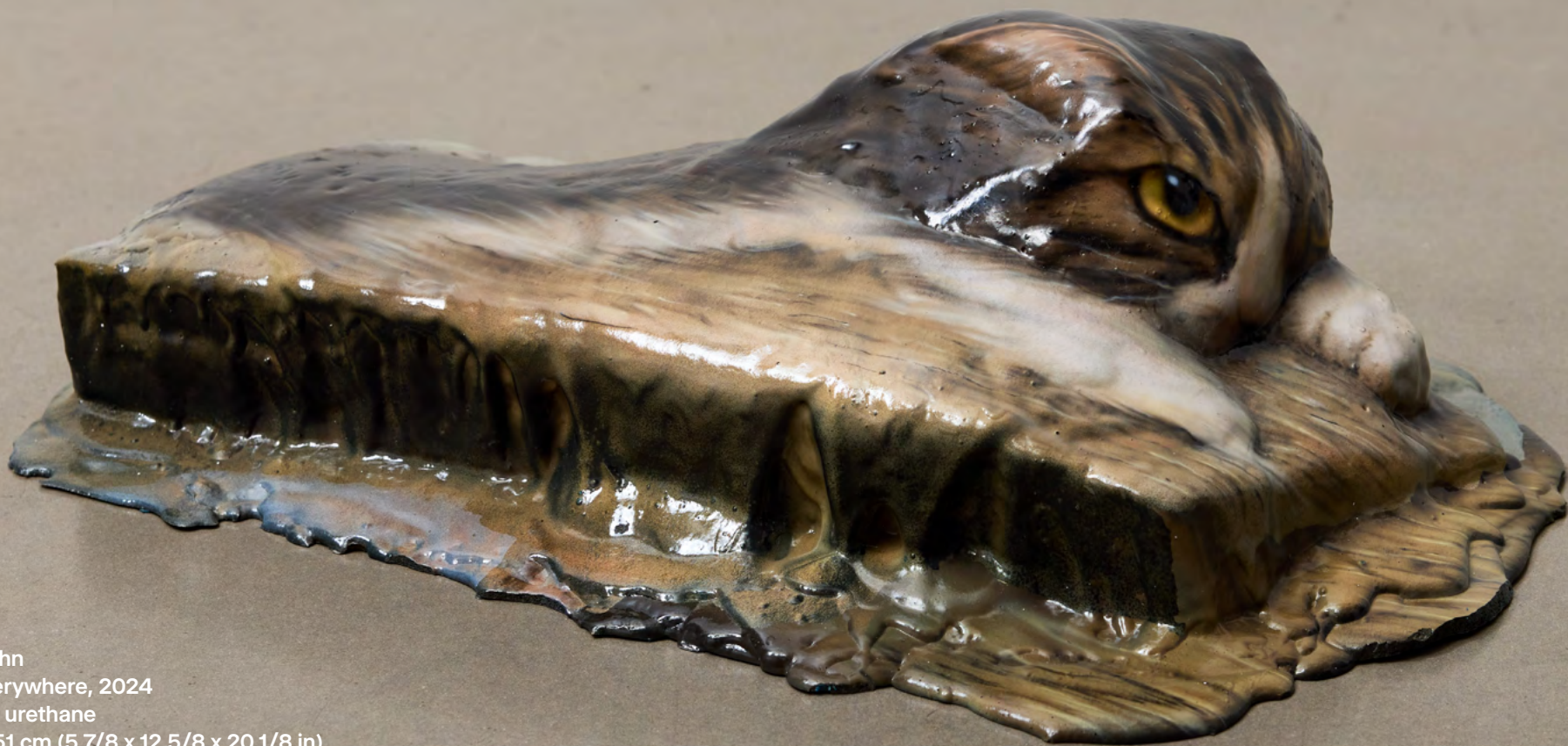
Taewon Ahn Hiro is everywhere, 2024 Acrylic on urethane 15 x 32 x 51 cm (5 7/8 x 12 5/8 x 20 1/8 in) (ATA002)