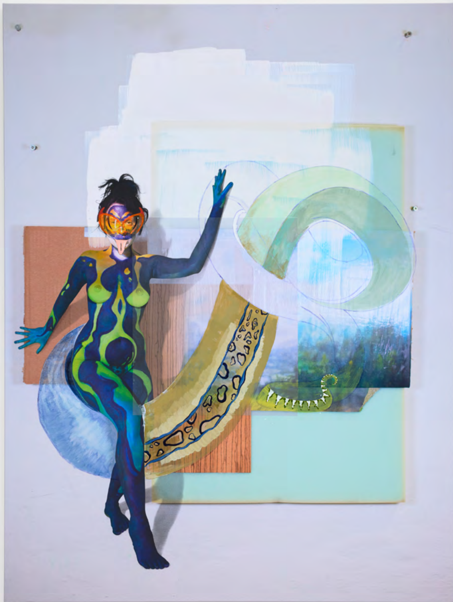
Juliana Huxtable I KNOW YOUR LITTLE FAST TAIL AINT OUTSIDE AGAIN, 2024 Acrylic, button and vinyl stickers on printed canvas 152 x 114.6 x 4 cm (59 7/8 x 45 1/8 x 1 5/8 in) (JHU049)