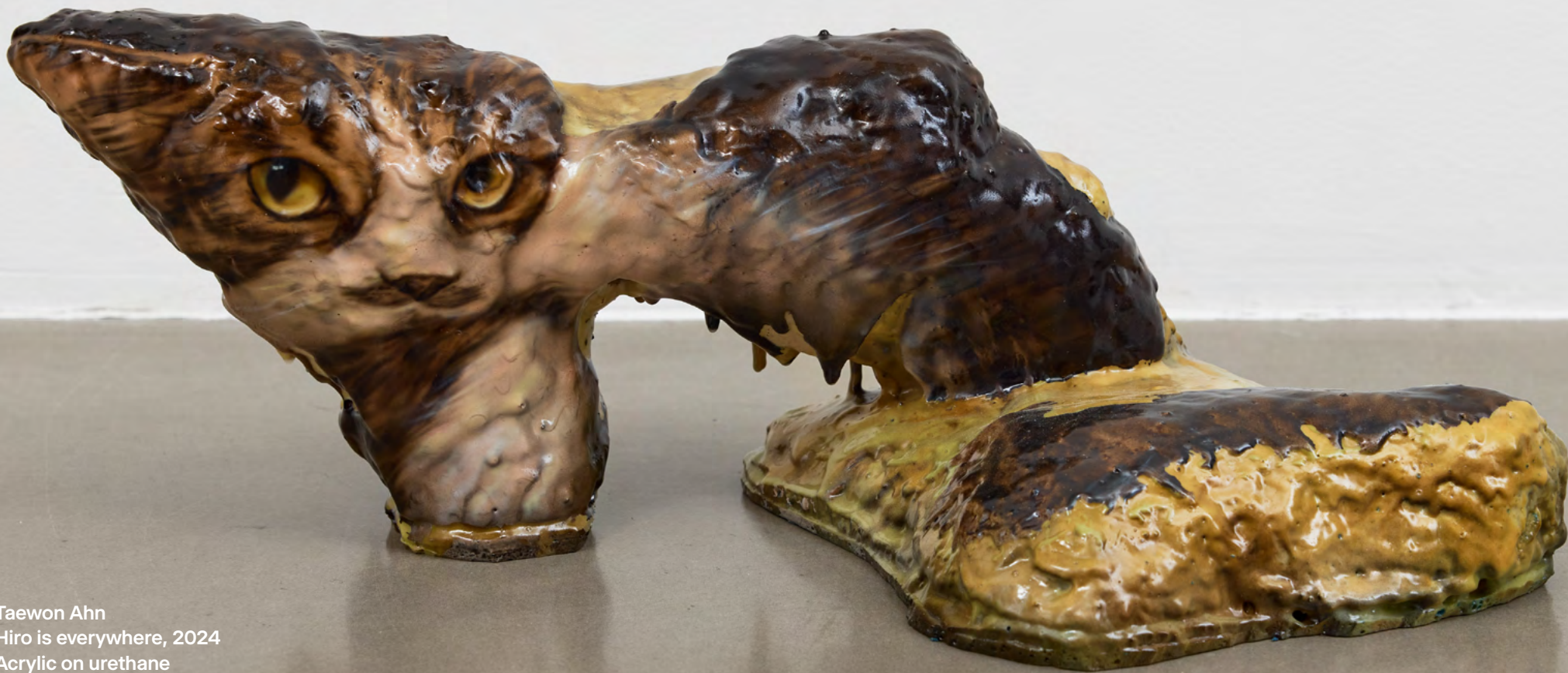
Taewon Ahn Hiro is everywhere, 2024 Acrylic on urethane 18 x 54 x 25 cm (7 1/8 x 21 1/4 x 9 7/8 in) (ATA005)