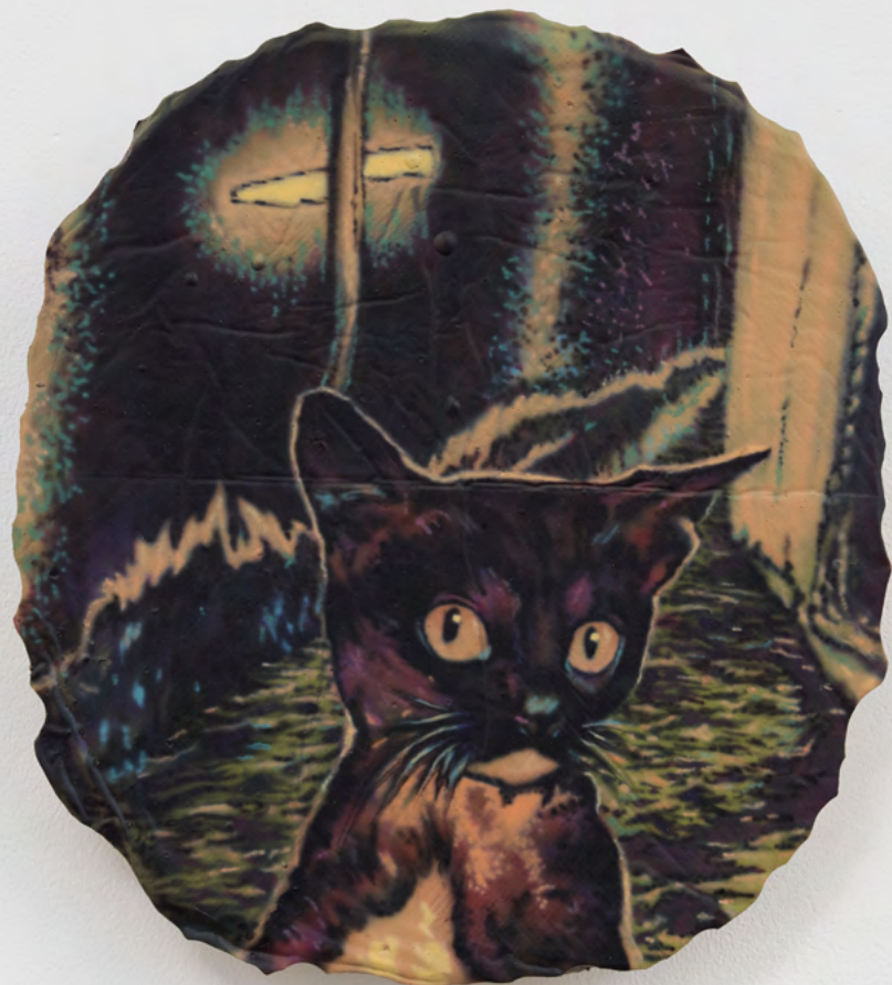
Taewon Ahn Mako is out of control, 2024 Acrylic on urethane 31.5 x 27.5 x 3.5 cm (12 3/8 x 10 7/8 x 1 3/8 in) (ATA008)